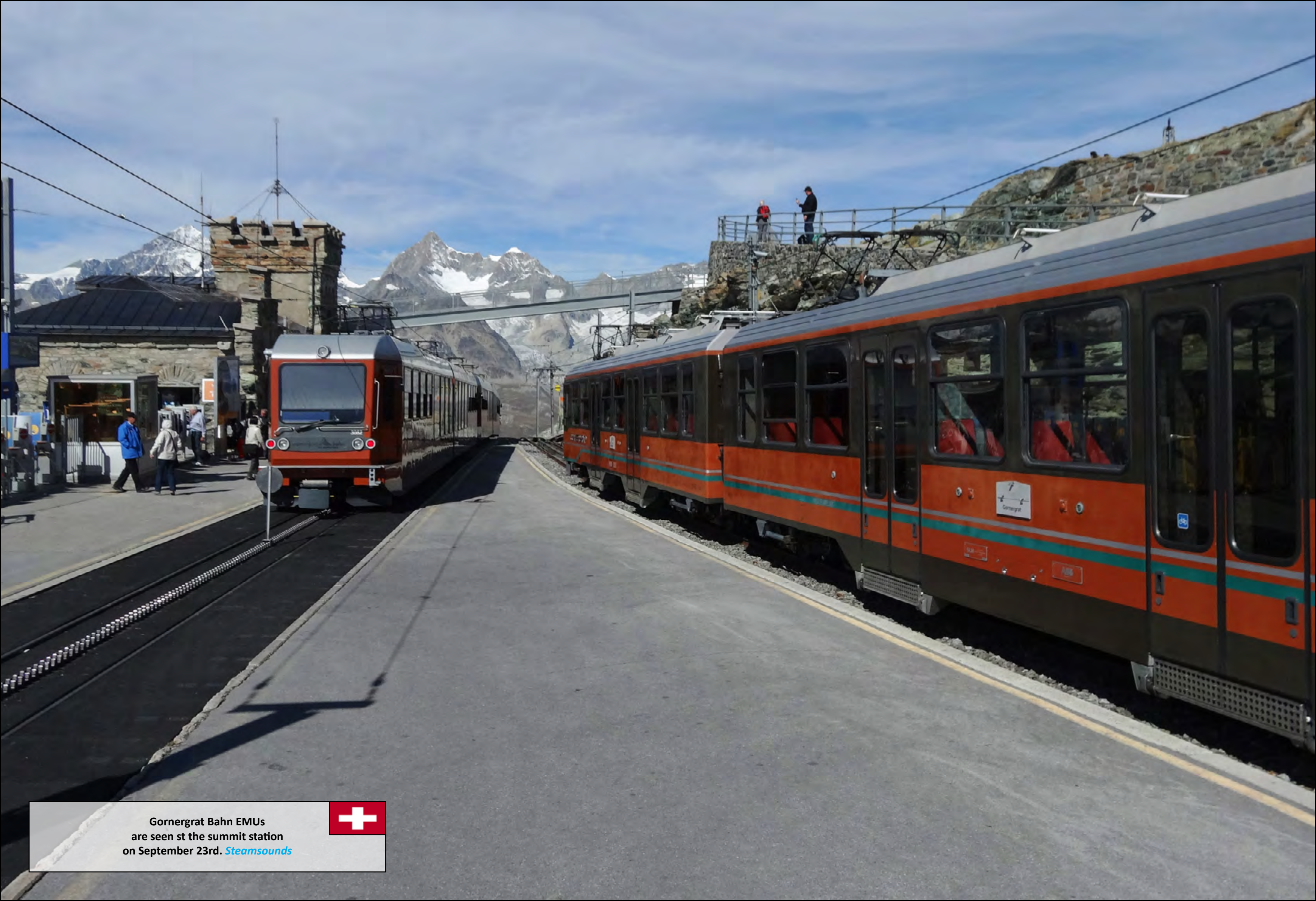
Gornergrat Bahn EMUs are seen at the summit station on September 23rd.