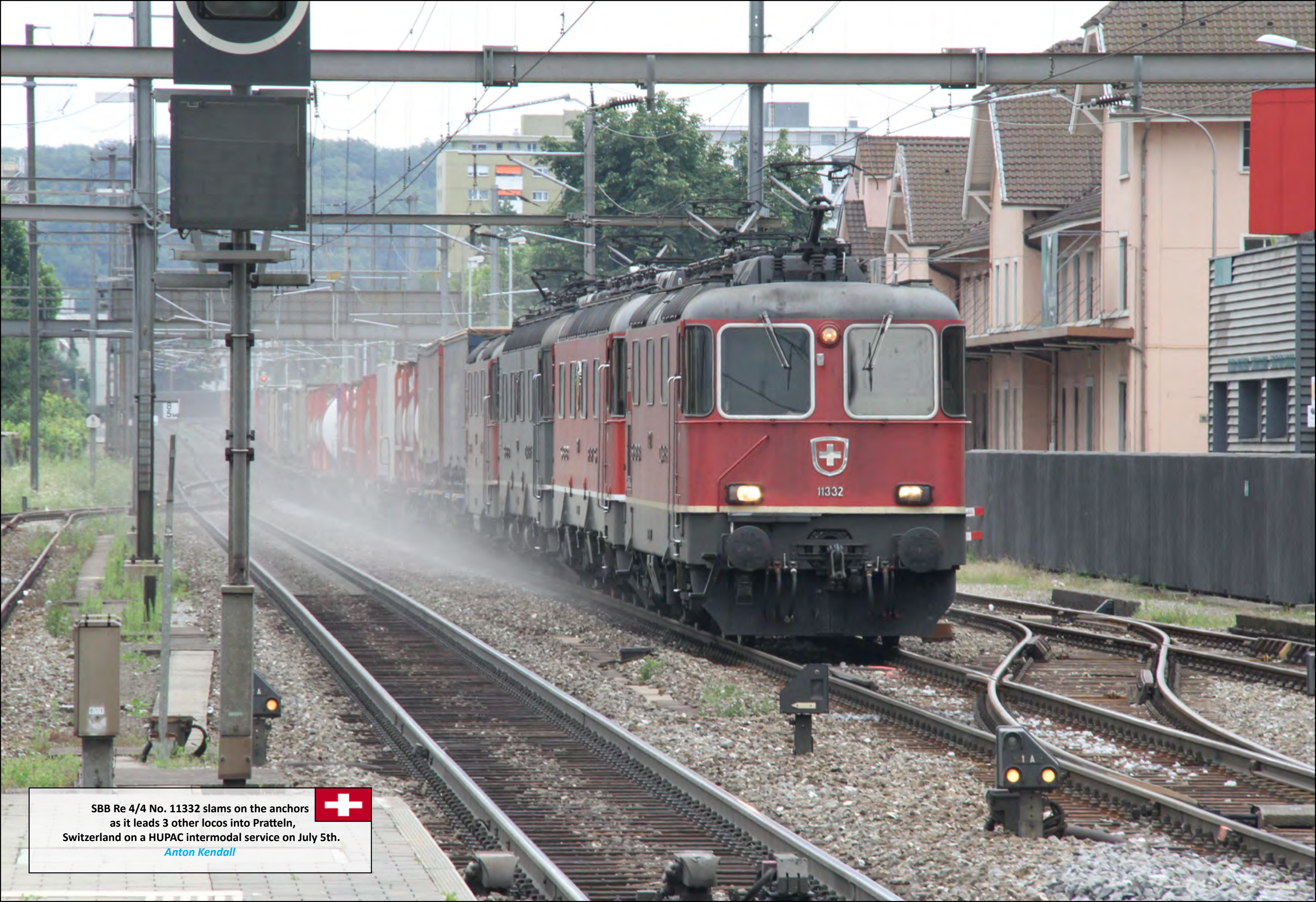
SBB Re 4/4 No. 11332 slams on the anchors as it leads 3 other locos into Pratteln, Switzerland on a HUPAC intermodal service on July 5th.