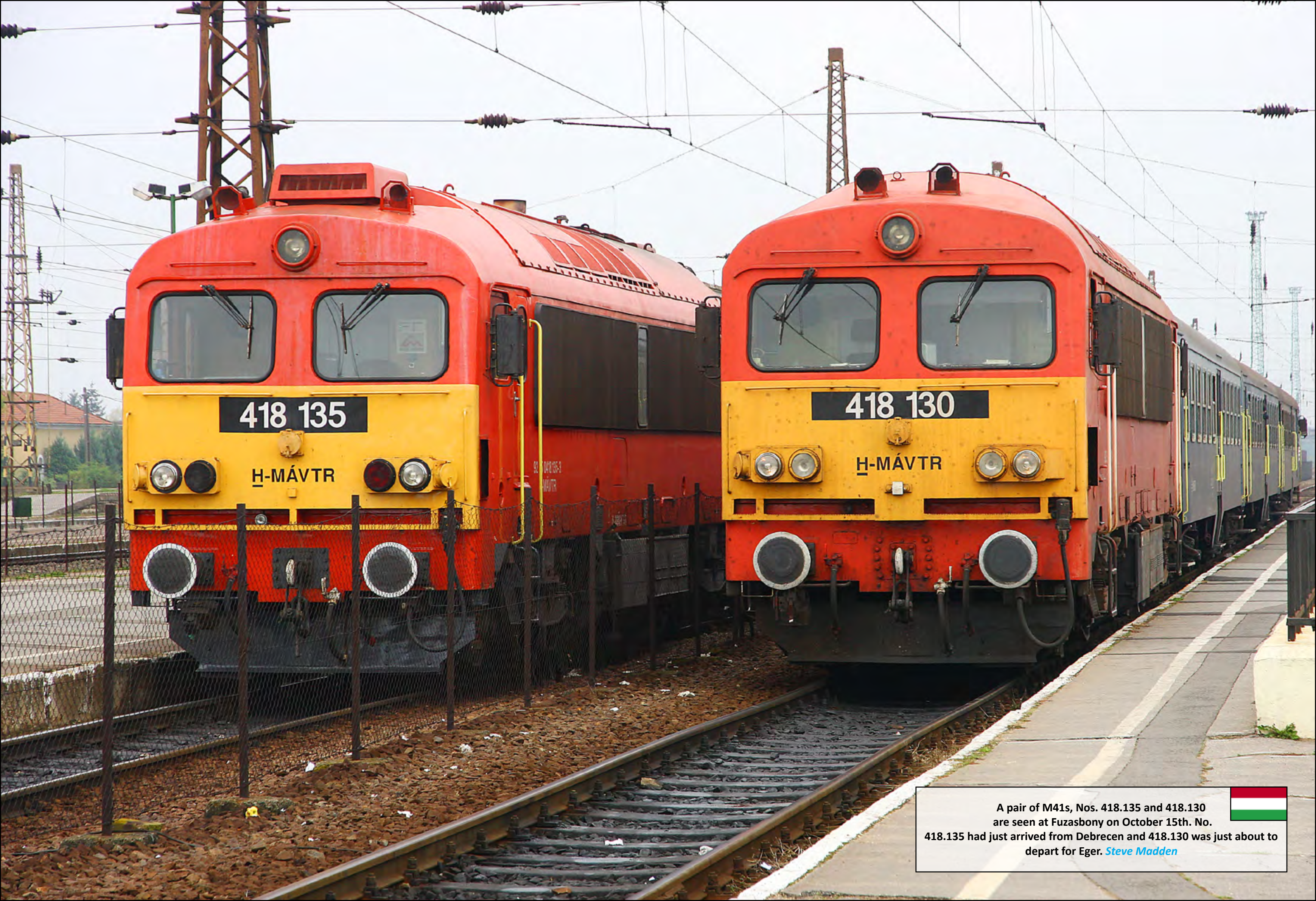
A pair of M41s, Nos. 418.135 and 418.130 are seen at Fuzasbony on October 15th. No. 418.135 had just arrived from Debrecen and 418.130 was just about to depart for Eger.