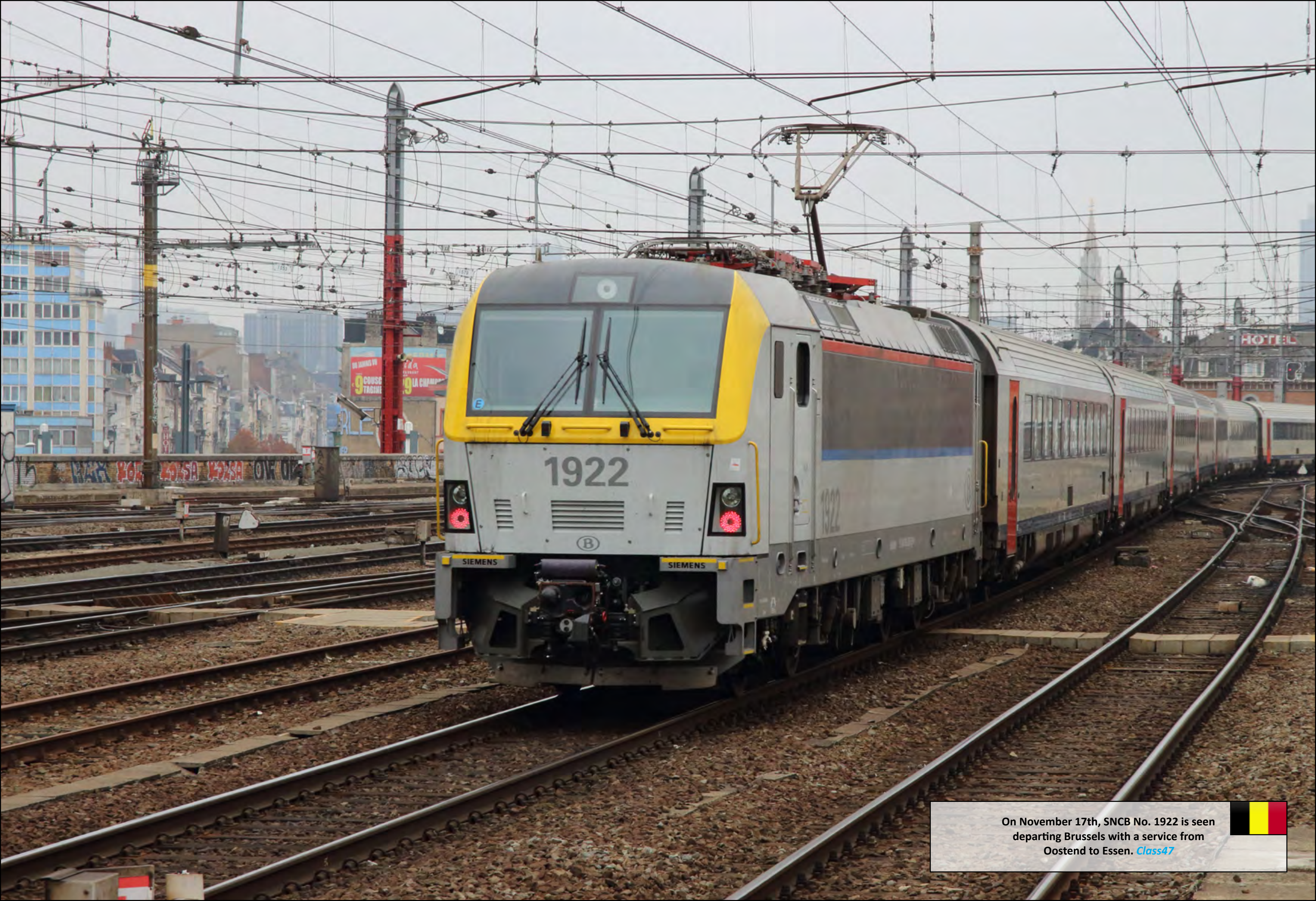
On November 17th, SNCB No. 1922 is seen departing Brussels with a service from Oostend to Essen. Class47