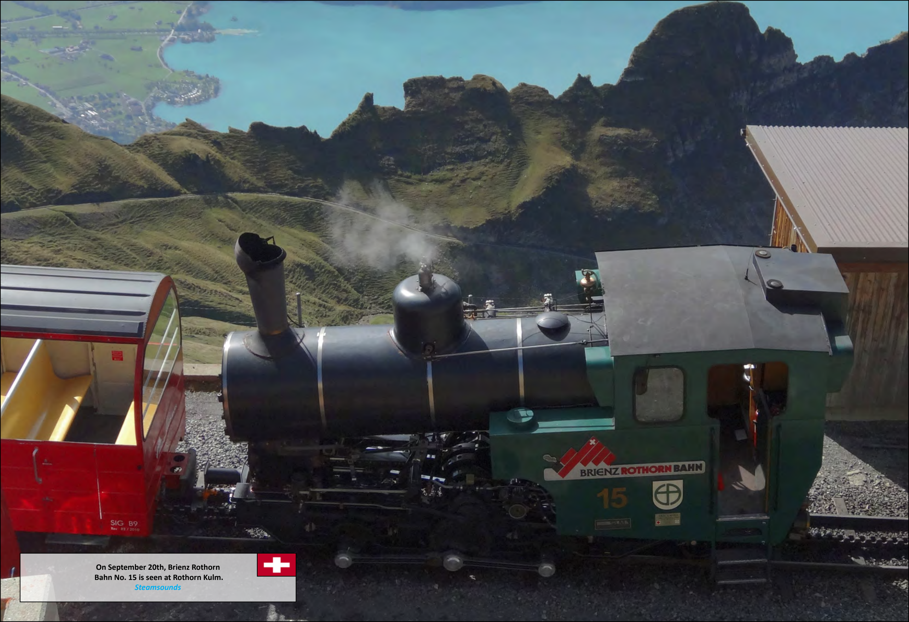
On September 20th, Brienz Rothorn Bahn No. 15 is seen at Rothorn Kulm.