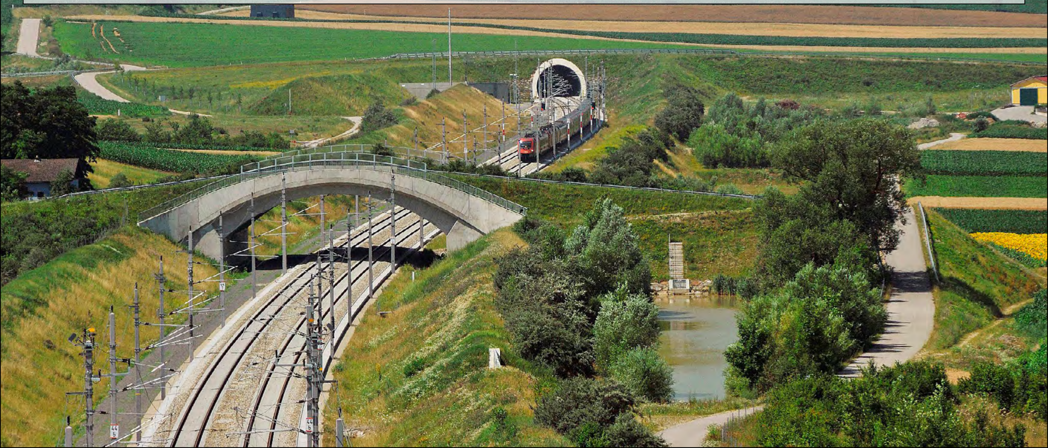
The New high-speed route between Wien and St. Polten.

The high-speed routes are navigable only by vehicles with ETCS Level 2 equipment. Currently, some ICEs are missing the appropriate equipment, they will therefore continue to be run on the existing route, and therefore can not yet fully integrate new timetable until all ICEs are equipped with the necessary facilities.