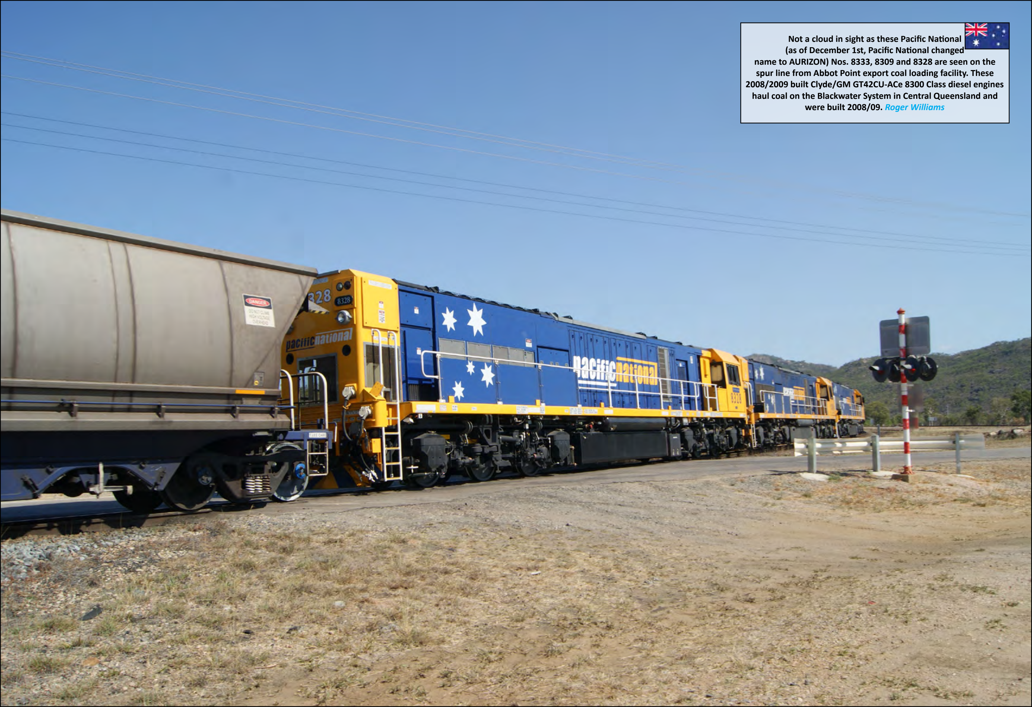
Not a cloud in sight as these Pacific National (as of December 1st, Pacific National changed name to AURIZON) Nos. 8333, 8309 and 8328 are seen on the spur line from Abbot Point export coal loading facility. These 2008/2009 built Clyde/GM GT42CU-ACe 8300 Class diesel engines haul coal on the Blackwater System in Central Queensland and were built 2008/09. Roger Williams