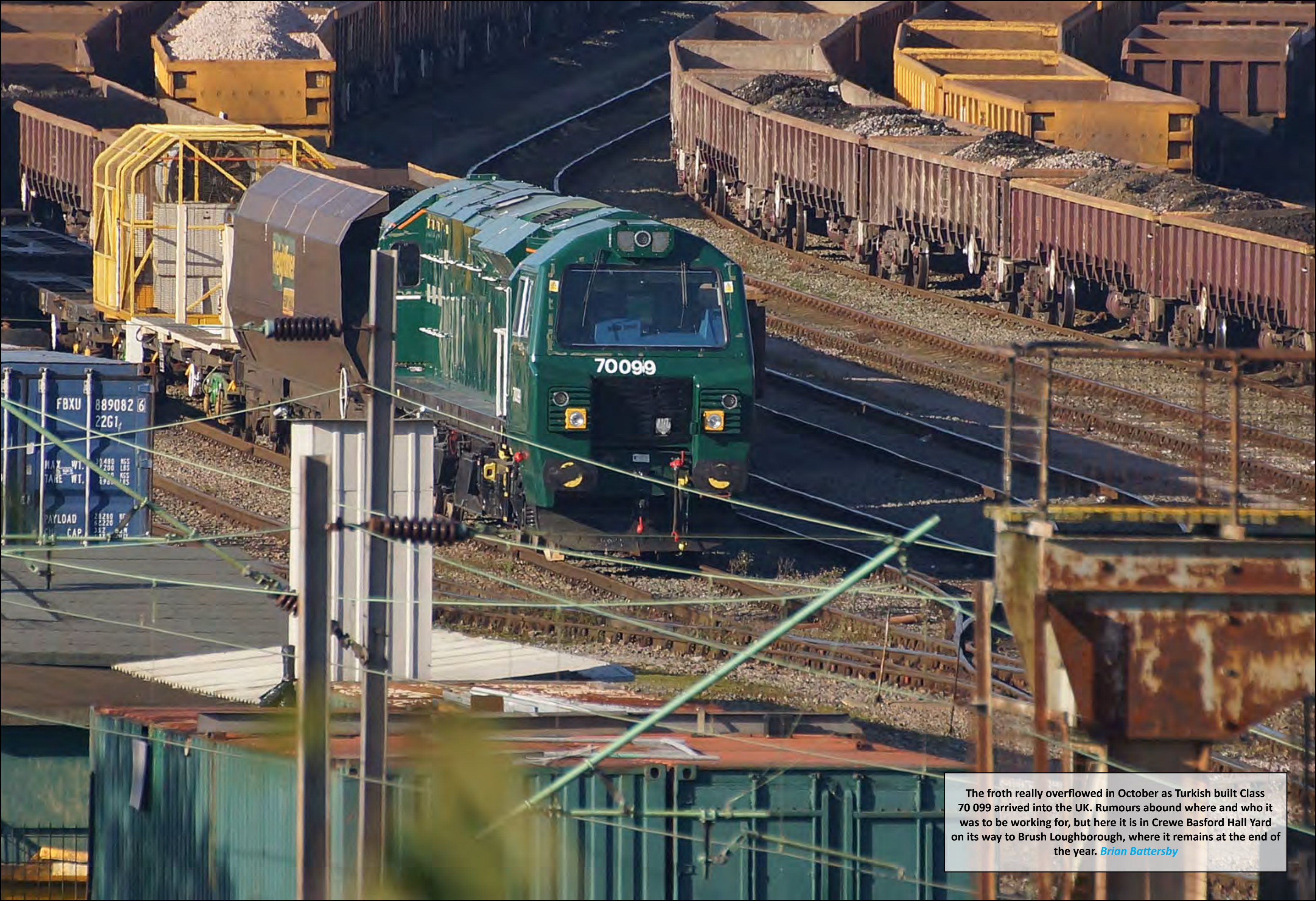
The froth really overflowed in October as Turkish built Class 70 099 arrived into the UK. Rumours abound where and who it was to be working for, but here it is in Crewe Basford Hall Yard on its way to Brush Loughborough, where it remains at the end of the year.