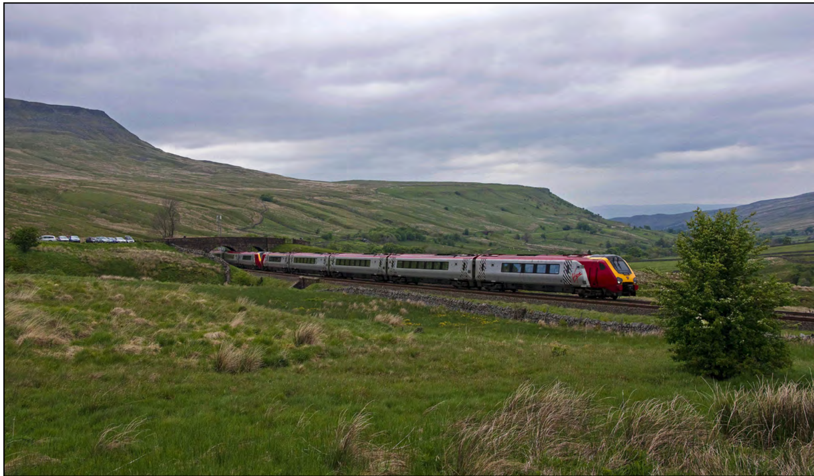
Above: Owing to engineering work on the West Coast main line, some Virgin Voyagers were sent via the Settle and Carlisle route between Crewe and Carlisle, this is the one such working on May 21st. Below: Class 60 071 "Ribblehead Viaduct" rumbles passed Castle Bridge Road, Nottingham whilst working 6E54 Kingsbury - Humber empty Blue TEA tanks on May 11th.