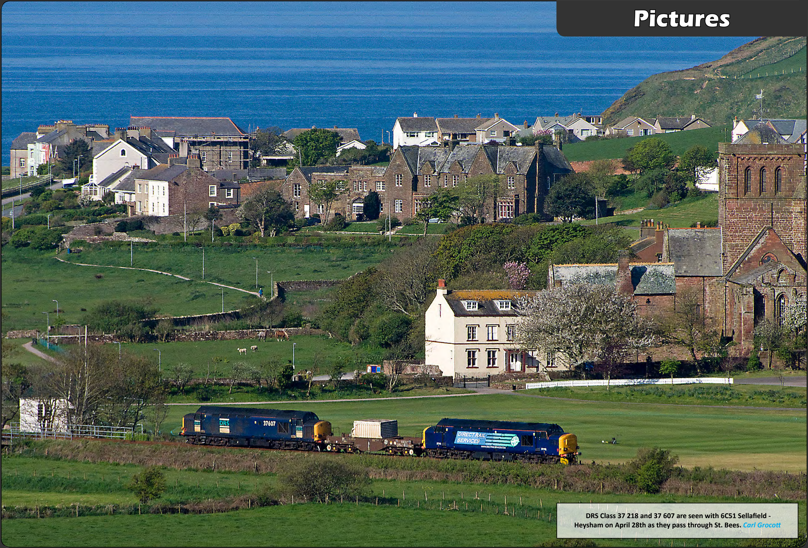
DRS Class 37 218 and 37 607 are seen with 6C51 Sellafield - Heysham on April 28th as they pass through St. Bees. Carl Grocott