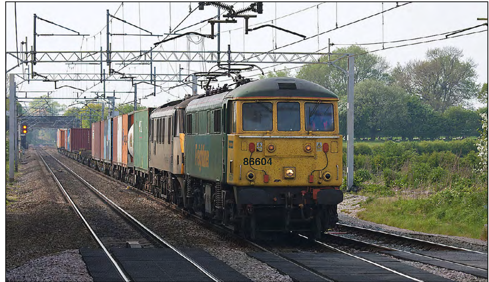
Above: Freightliner Class 86 604 leads 90 043 south through Acton Bridge heading for Crewe on April 29th. Below: Class 73 206 leads 66 701, ex Freightliner now GBRf 66 579, 73 141 and 73 207 into Hastings working 0Y22 Hoo Junction - St. Leonards RE loco convoy on May 2nd.