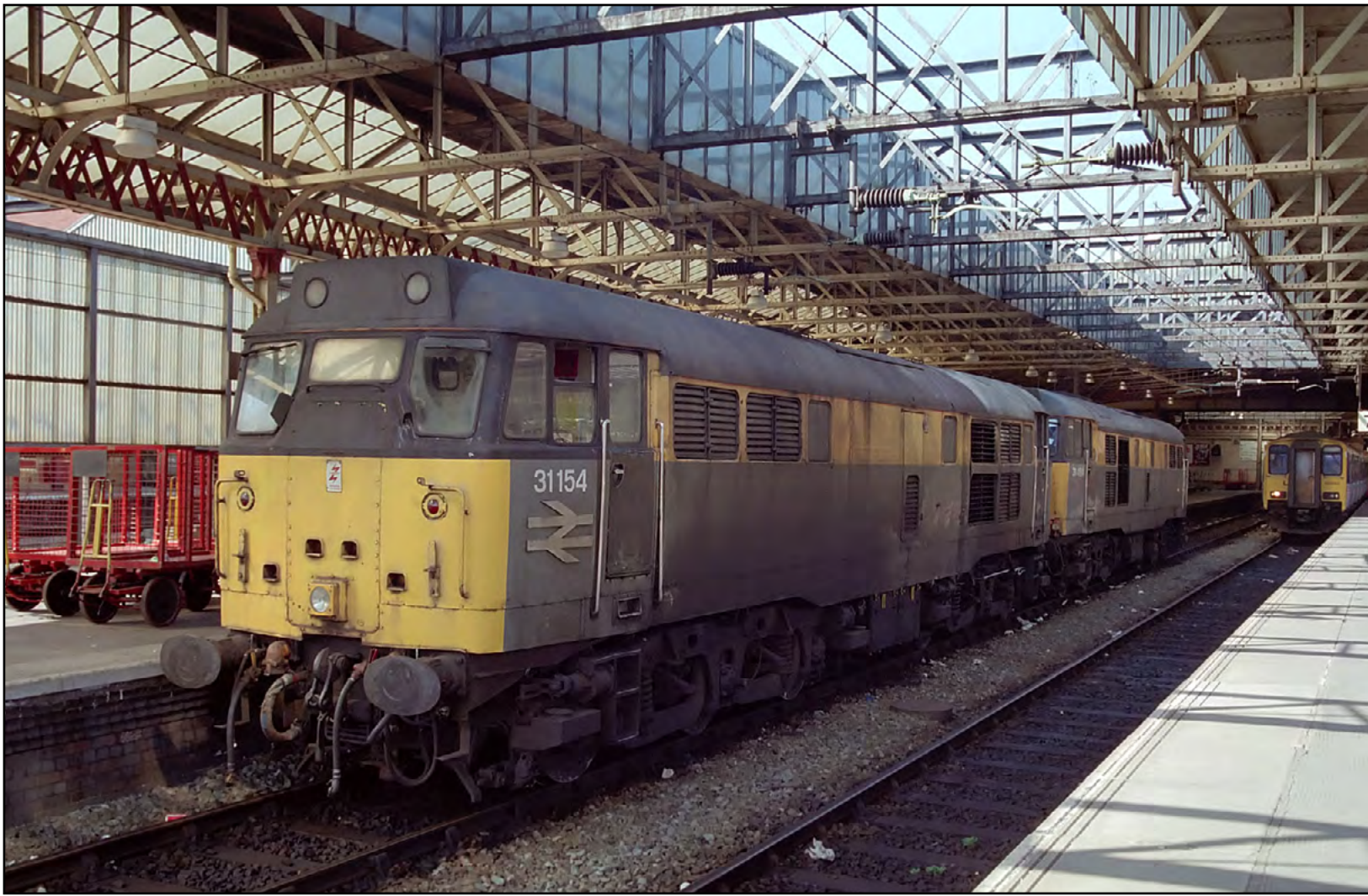
Above: Class 31 154 and 31 466 arrive into Crewe from Derby, June 1997. Below: In faded large logo livery, Class 73 133 stands at Victoria on Gatwick Express duty 6.