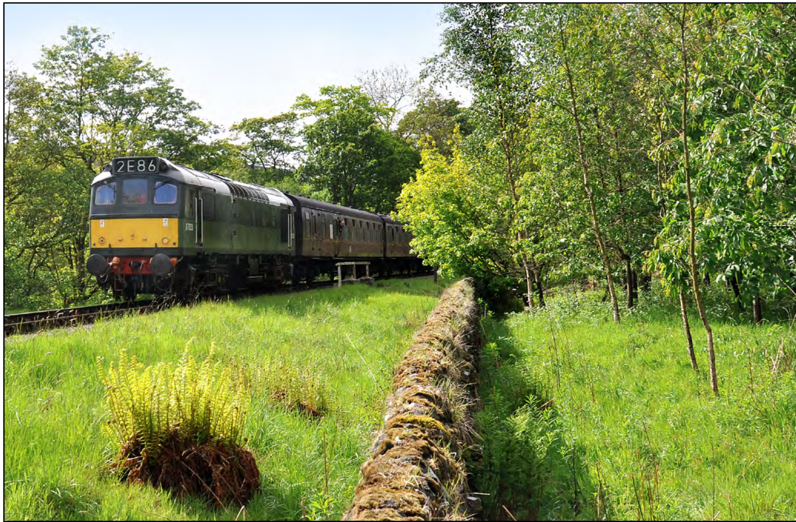
Above: Class 25 No. D7629 passes just outside Haworth station, May 22nd. Below: Visiting Class 47s "County of Essex" and "Posiedon" double head a Keighley bound train, seen just outside Haworth station on May 20th.