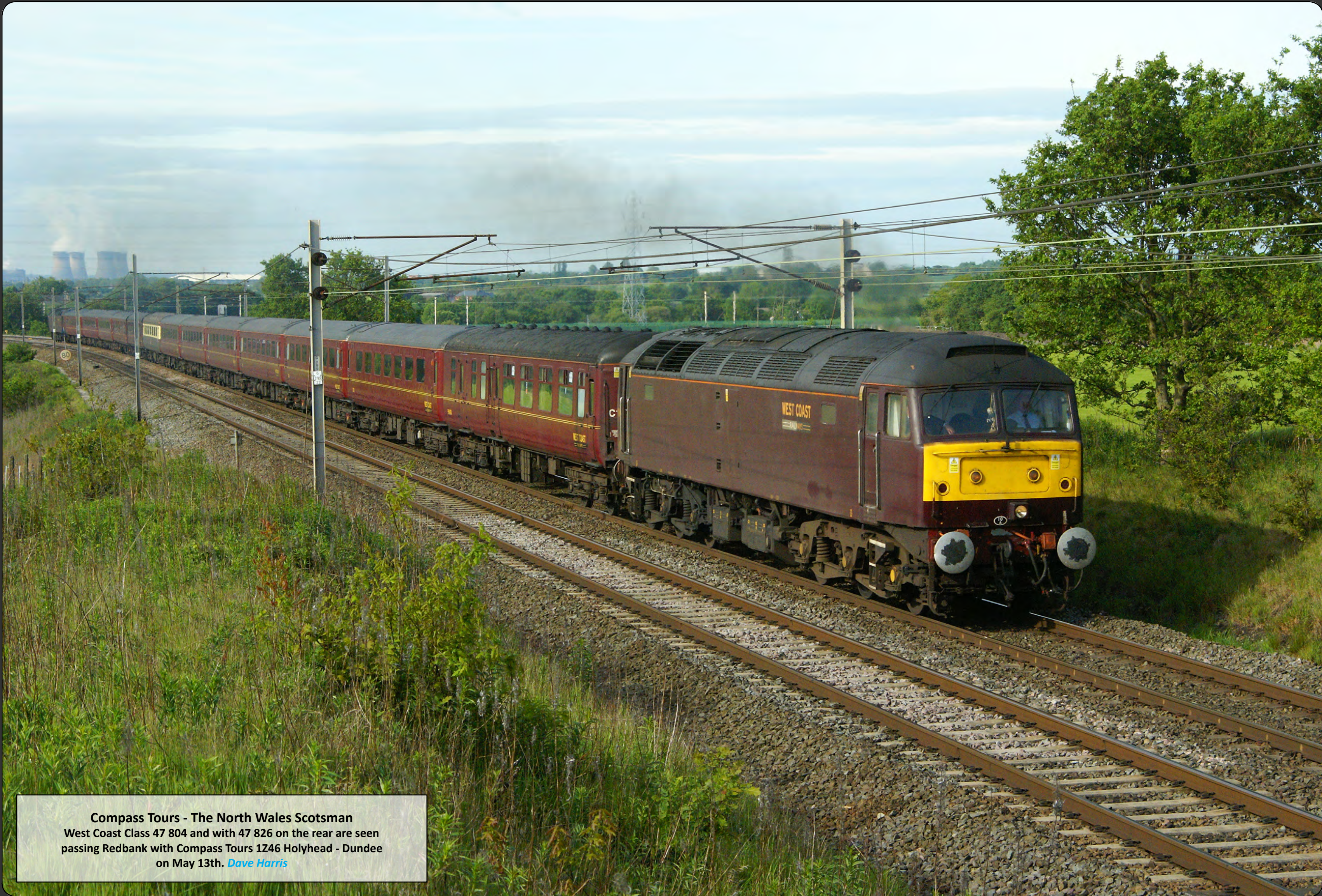
Compass Tours - The North Wales Scotsman West Coast Class 47 804 and with 47 826 on the rear are seen passing Redbank with Compass Tours 1246 Holyhead - Dundee on May 13th.