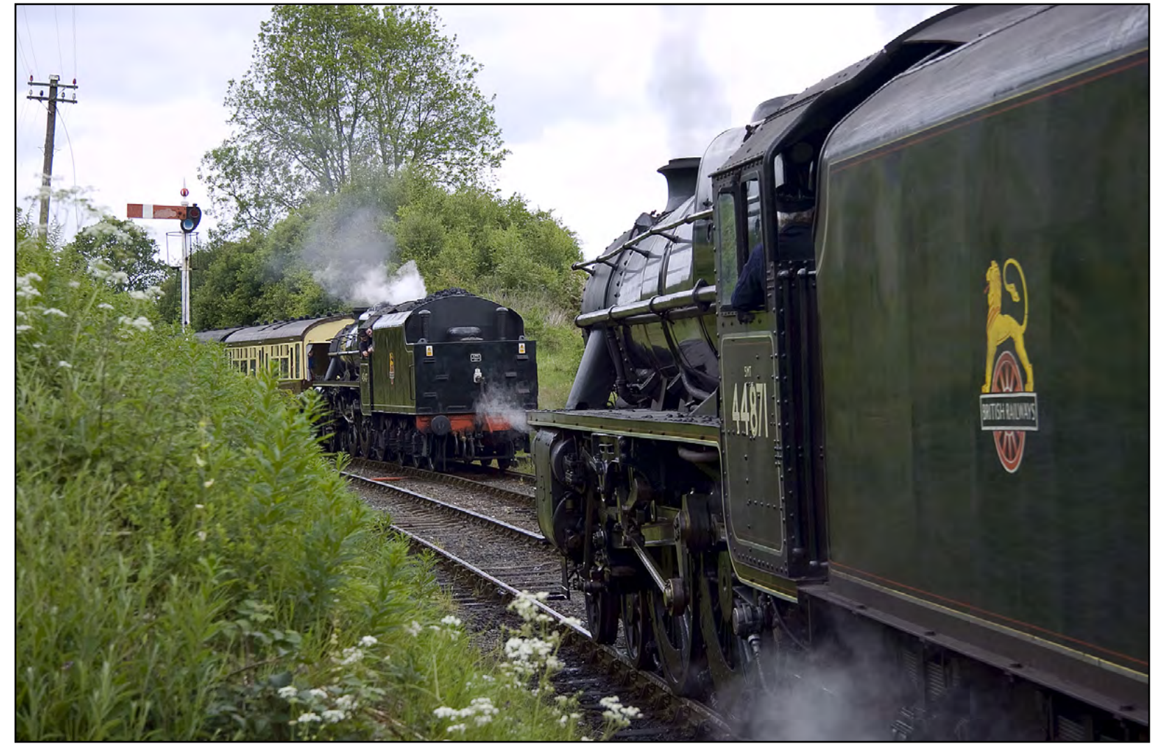
Above: BR 8F No. 44871 waits at Arley for fellow 8F No. 45407 to pass on May 20th. Below: Warship Class 42 No. D821 "Greyhound" is seen at Hay Bridge, May 22nd.