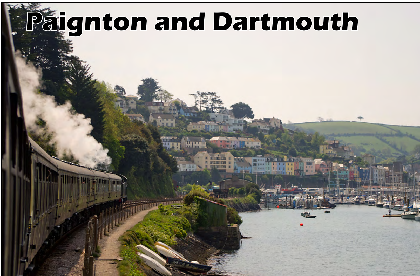
Above: Great Western Railway 42XX Class 2-8-0T No. 4277 rounds the curve in to Kingswear. Kai Pernau Below: Class 03 No. D2192 "Titan" is seen just outside Kingswear with some track equipment. Kai Pernau