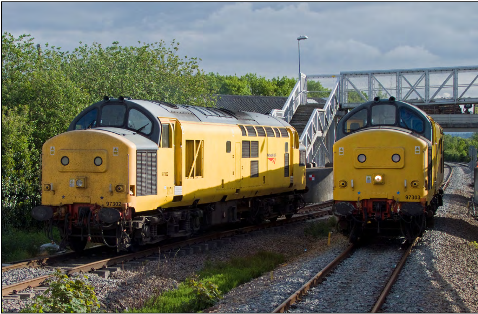
Above: Network Rail Class 97 302 passes fellow classmate 97 303 at Welshpool on May 10th. Carl Grocott Below: On May 6th, EWS/DBS Class 90 028 and 90 036 head south through Stafford. Brian Battersby