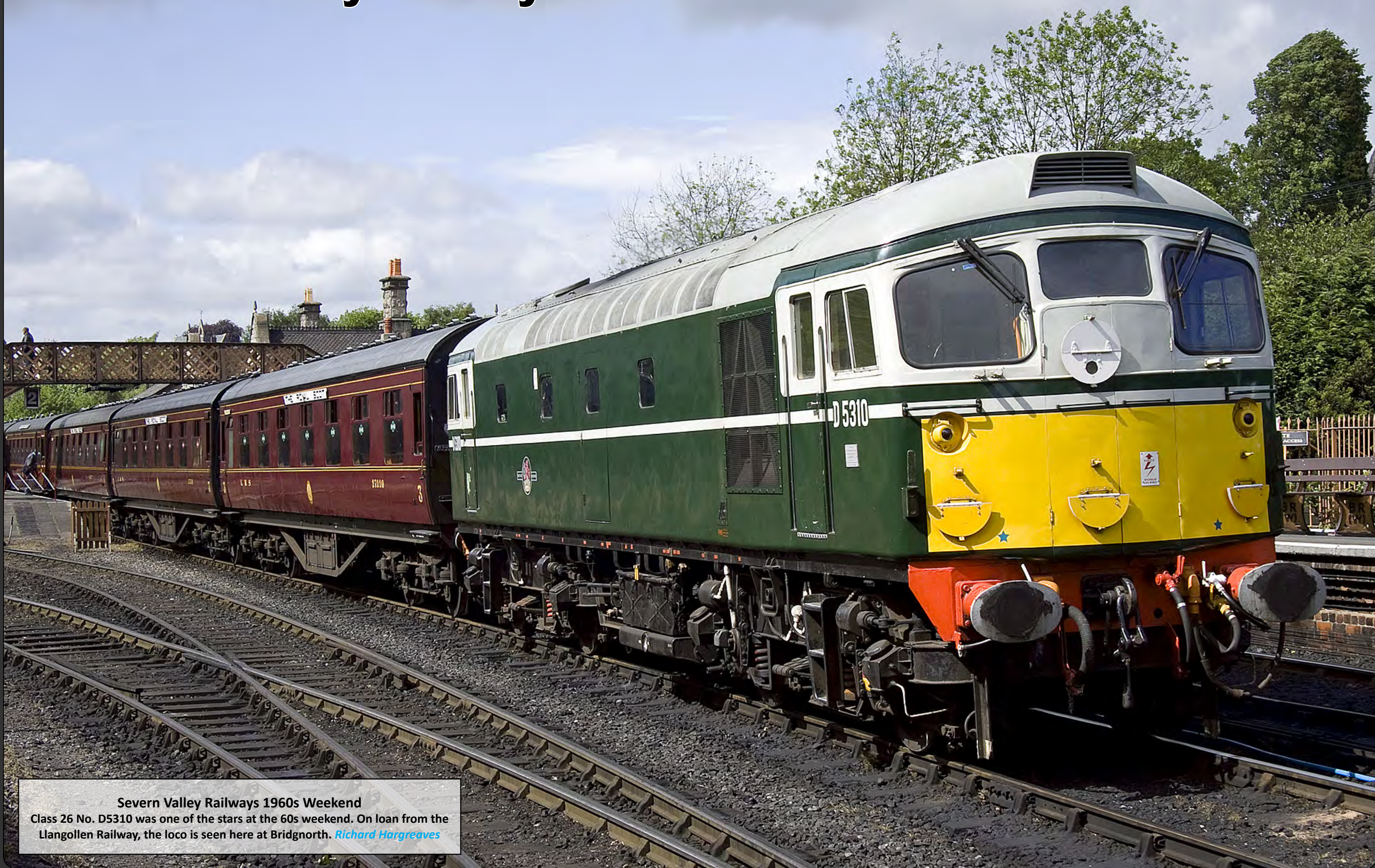
Severn Valley Railways 1960s Weekend Class 26 No. D5310 was one of the stars at the 60s weekend. On loan from the Llangollen Railway, the loco is seen here at Bridgnorth.