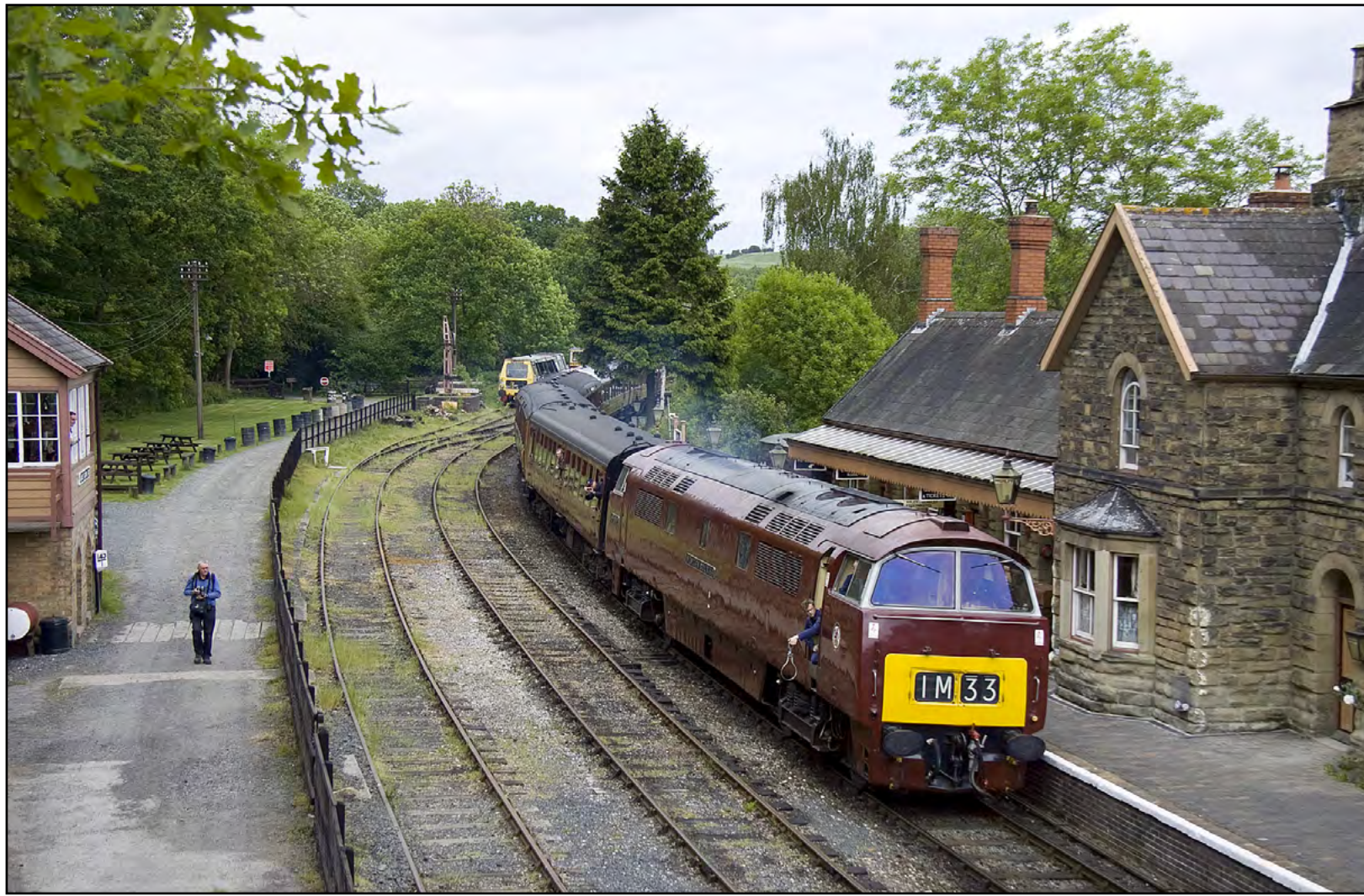
Above: Class 52 No. D1062 "Western Courier" heads through Highley on May 20th. Below: LMS 4-6-0 5MT Black 5 No. 44871 arrives into Bridgnorth with a service from Kidderminster.