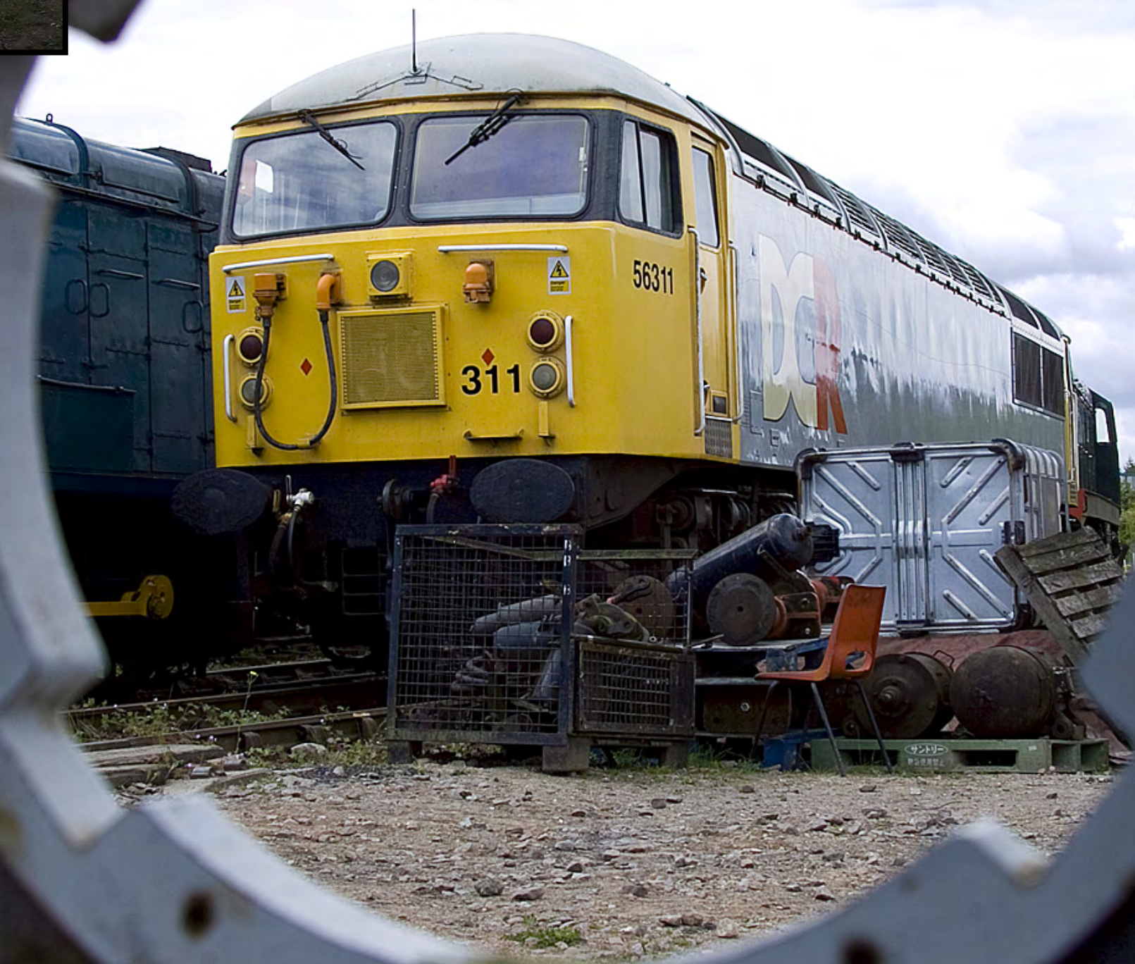
During a visit to the Great Central Railway North at Ruddington, a couple of Class 56 cabs were sighted in the yard. Too good an opportunity to miss, here we see Class 56 311 looking through the centre headlight of the spare cabs. Richard Hargreaves