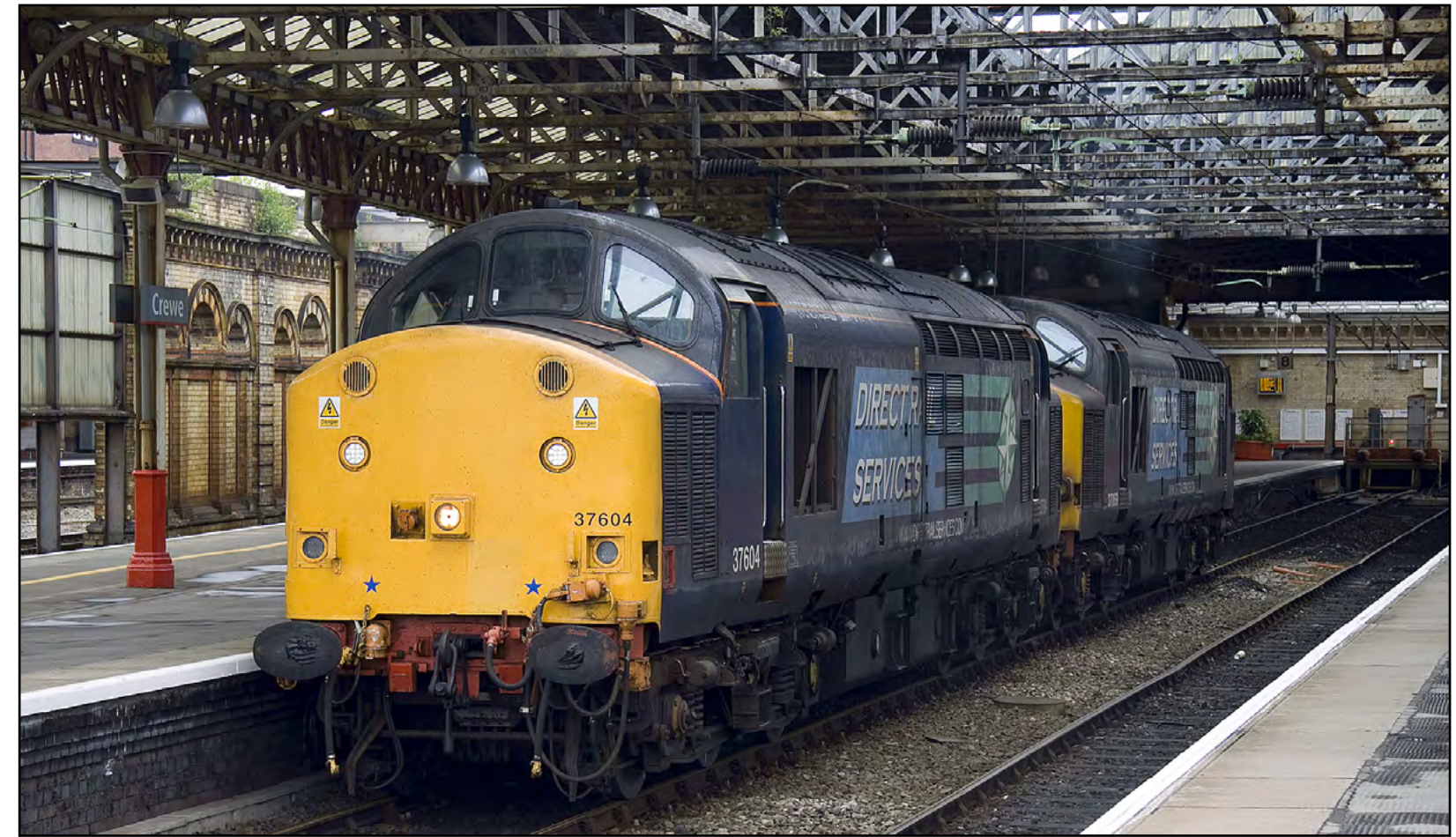
Above: On May 7th DRS Class 37 604 and 37 069 work a Derby to Crewe light engine move. Below: On May 20th DB Schenker liveried Class 60 011 passes Coedkernew with the 6B47 Westerleigh - Robeston tanks.