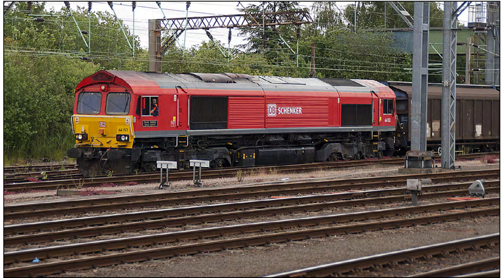
Above: DB Schenker liveried Class 66 152 heads north out of Wembley Yard on May 28th.