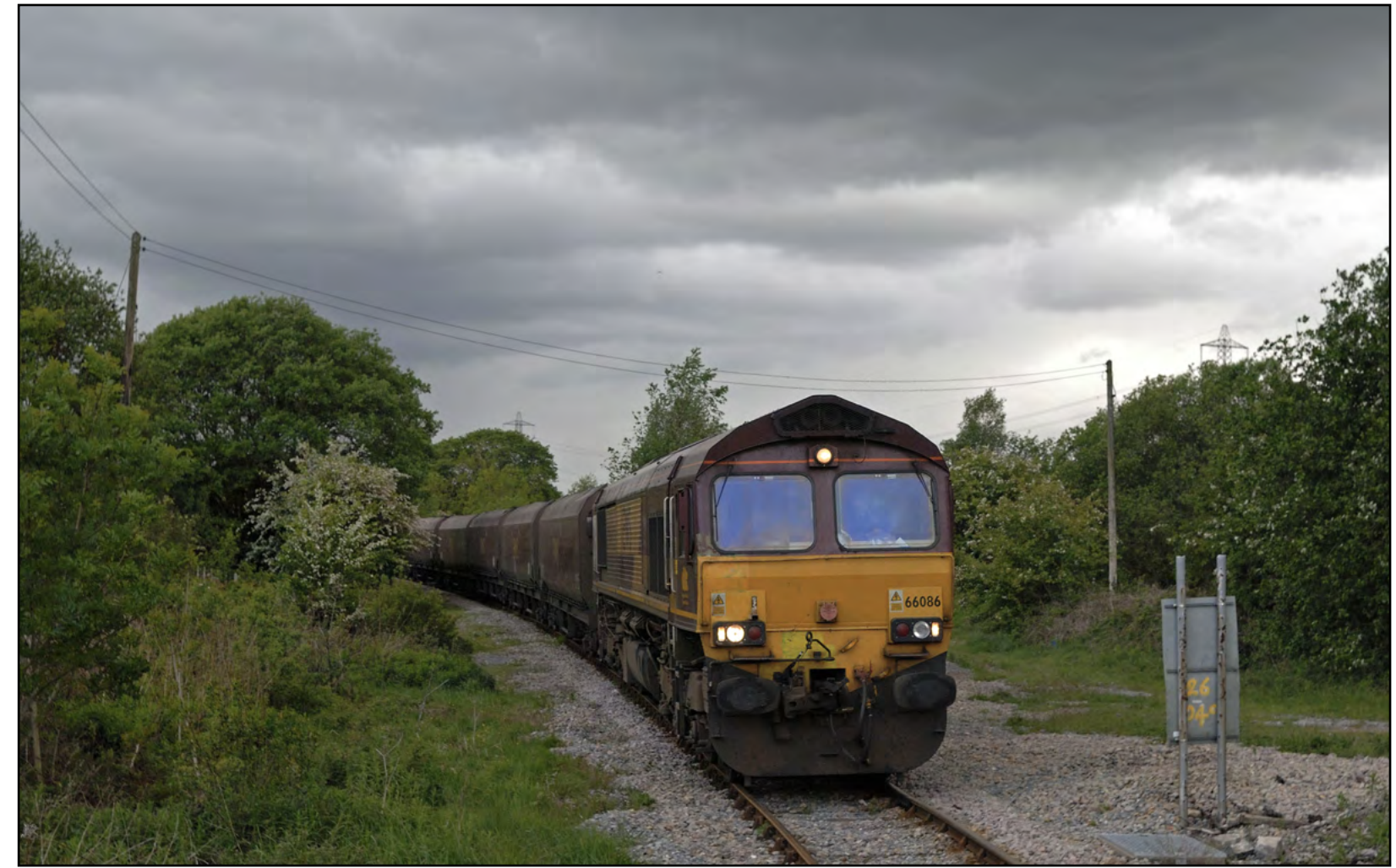
Above: Just before a rain storm, Class 66 086 brings the 6C47 coal train from the Tower Colliery sidings to Aberthaw Power Station to a halt at the level crossing at Hirwaun early in the evening of Saturday May 14th. Class 66 175 had brought in the empty train and was now at the rear of the 6C47. Below: With the Network Rail test train, Class 37 601 leads 37 611 through Filton Abbey Wood, May 17th.