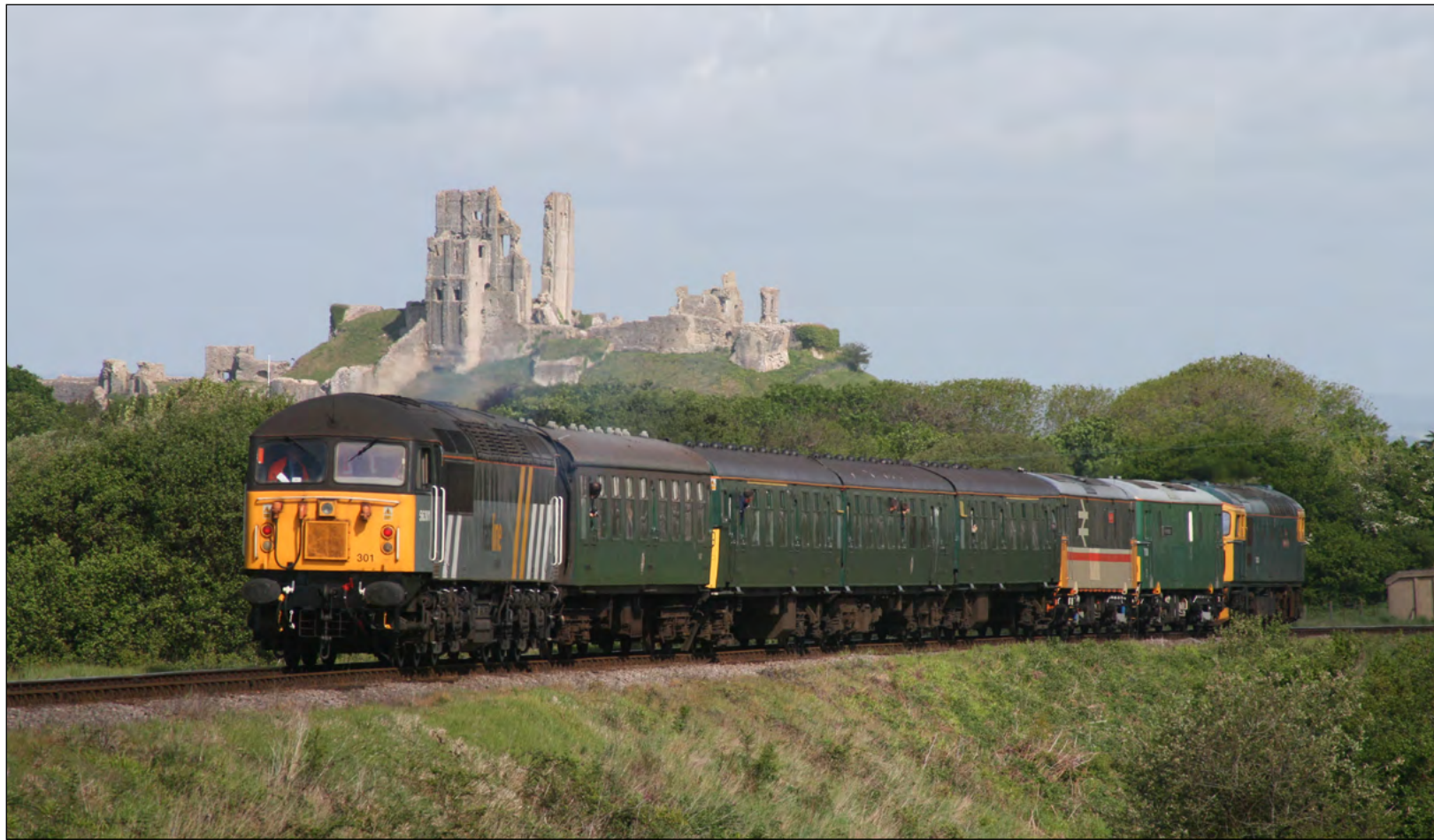
Above: Fastline liveried Class 56 301 is seen on the rear of the Harmans Cross to Norden shuttle between Corfe Castle and Harmans Cross on May 7th. Below: Class 56 301 arrives into Swanage with a train from Norden on May 7th.