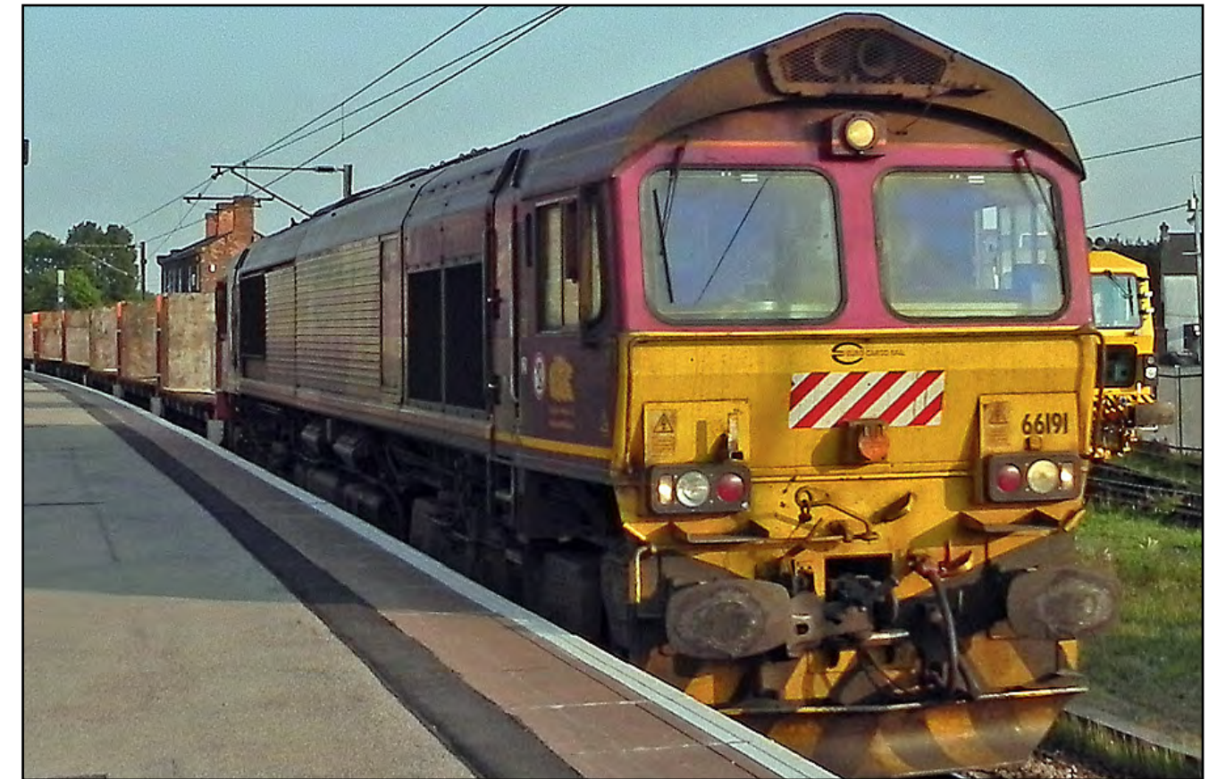
Above: Regular visitor to the East Coast main line, Euro Cargo Rail Class 66 191 heads through Retford on April 28th with 4D56 Biggleswade to Heck empty PNAs. Left: Class 90 008 speeds past Hubberts Hill Countryside on a Norwich to London Liverpool St. working on May 25th. Bottom Left: Colas Rail's Class 66 843 heads the 6278 Margam - Llanwern through Coedkernew on May 25th. Bottom Right: Class 66 737 is seen working GBRF's 4M40 Washwood Heath to Wellingborough Up Sidings past Great Bowden on April 21st.