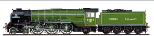
The A1 Steam Locomotive Trust New Steam for the Main Line