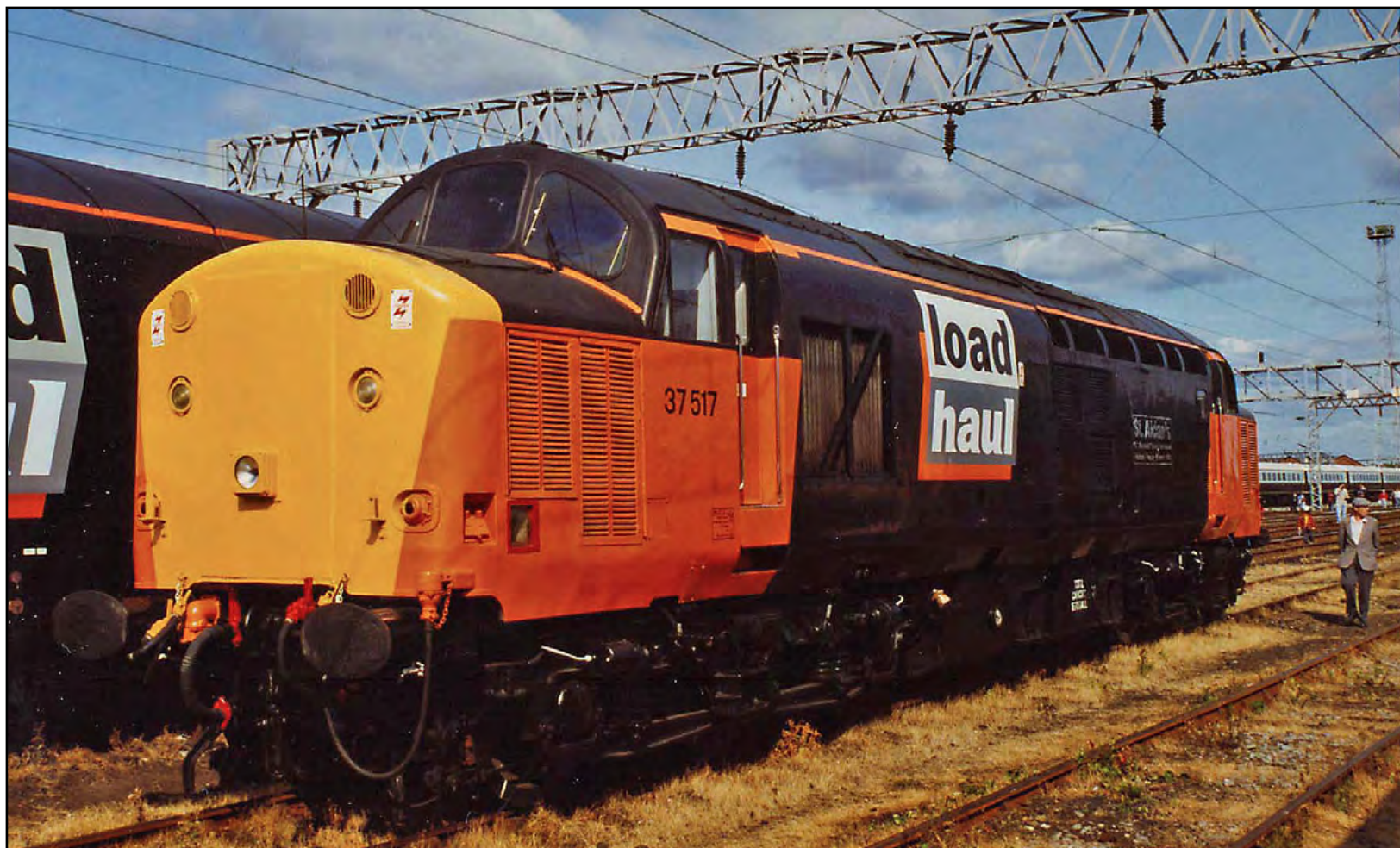
Above: Class 37 517 in Loadhaul livery is seen on display at Crewe Basford Hall on August 28th 1995. Below: Class 56 049 in large logo blue livery is seen stabled at Hither Green, 1985.