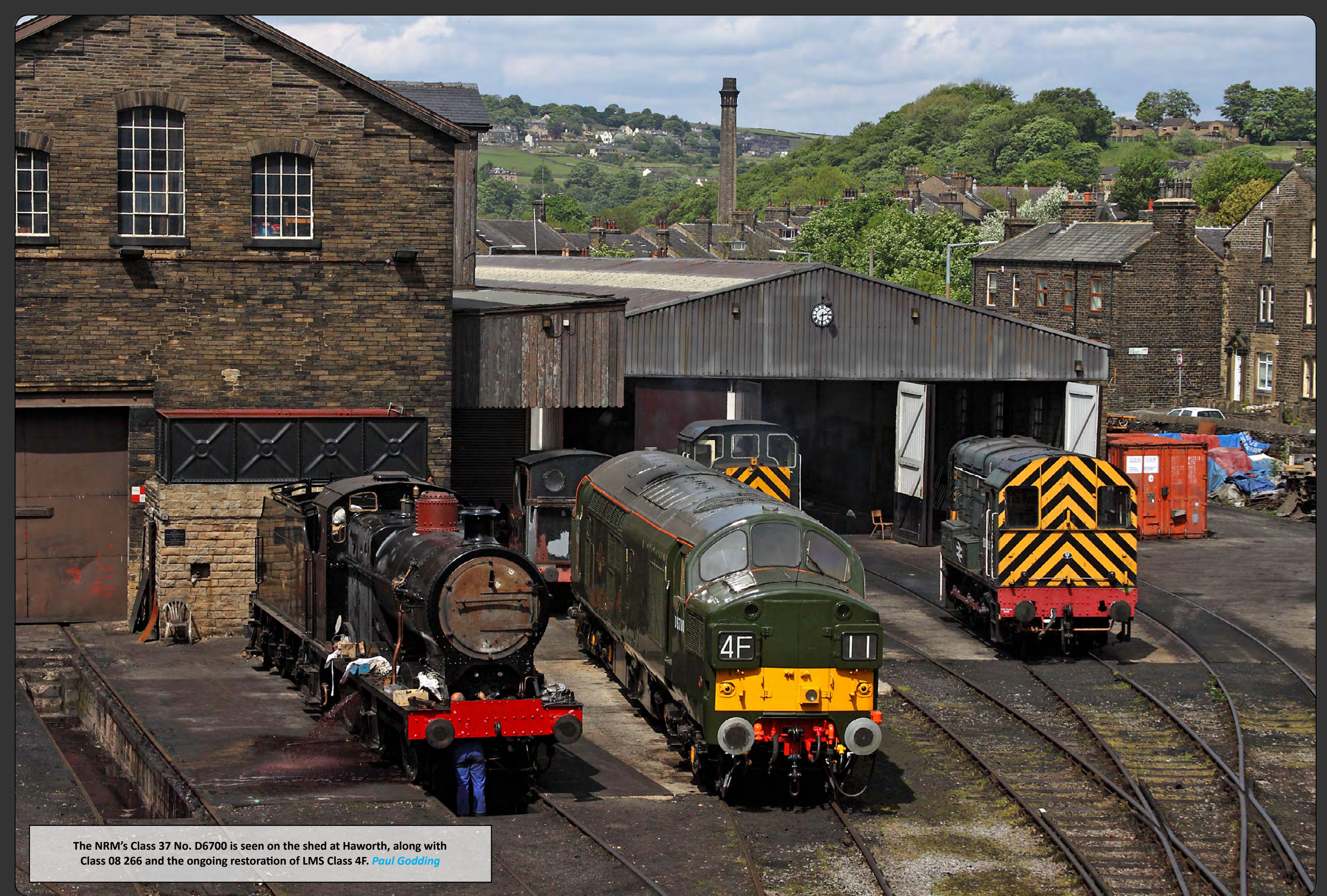
The NRM's Class 37 No. D6700 is seen on the shed at Haworth, along with Class 08 266 and the ongoing restoration of LMS Class 4F. Paul Godding