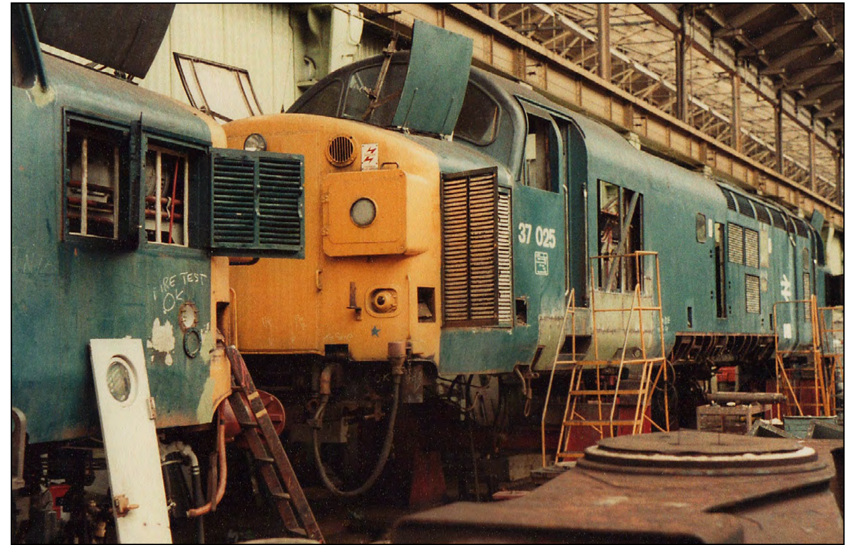
Above: Class 37 025 is seen under repair at Doncaster Works, date unknown. Below: Class 150 216 arrives into Shrewsbury on April 30th 1999.