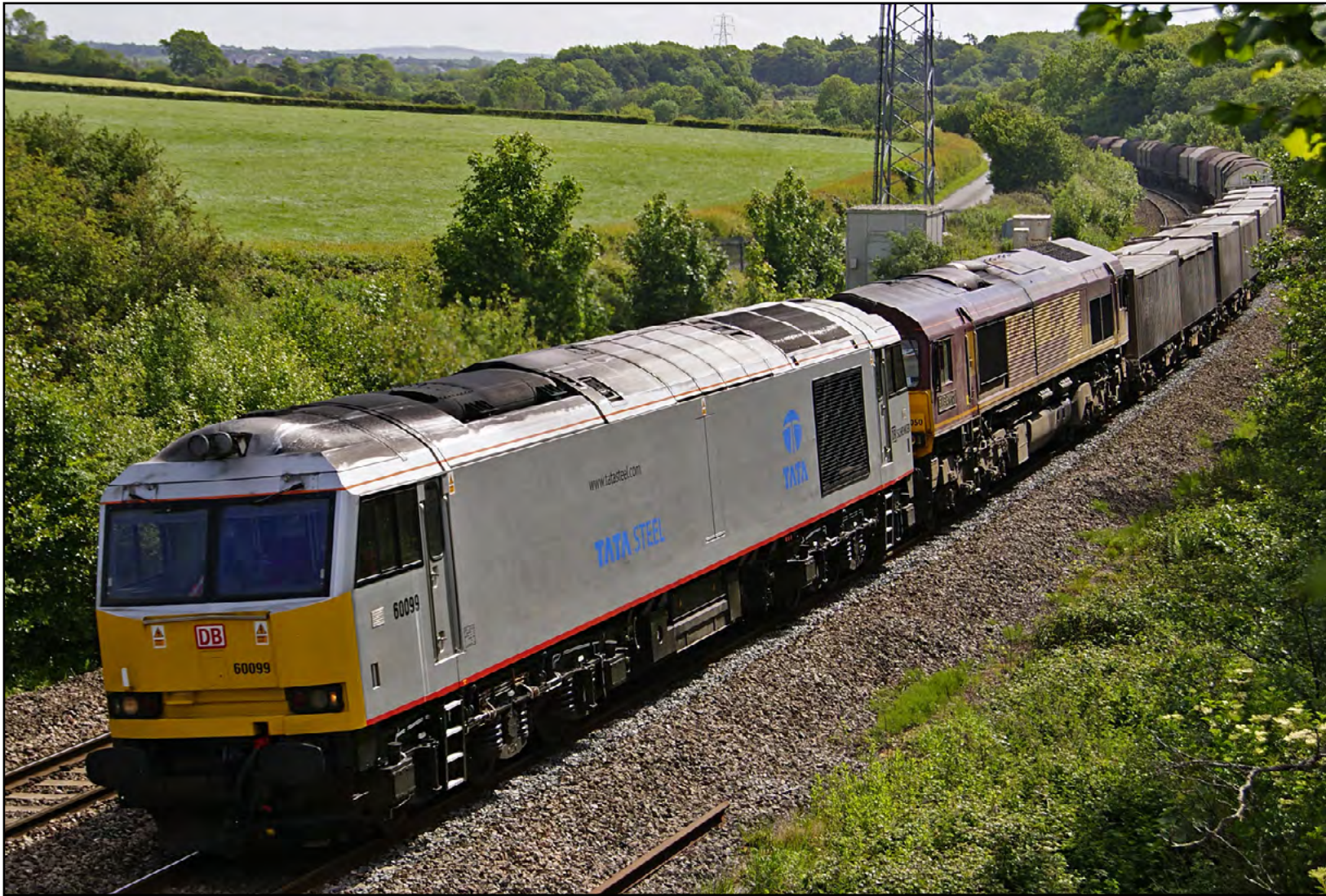
Above: On May 25th, Tata liveried Class 60 099 leads 66 050 at Llangewydd working 6V19 Immingham - Margam.