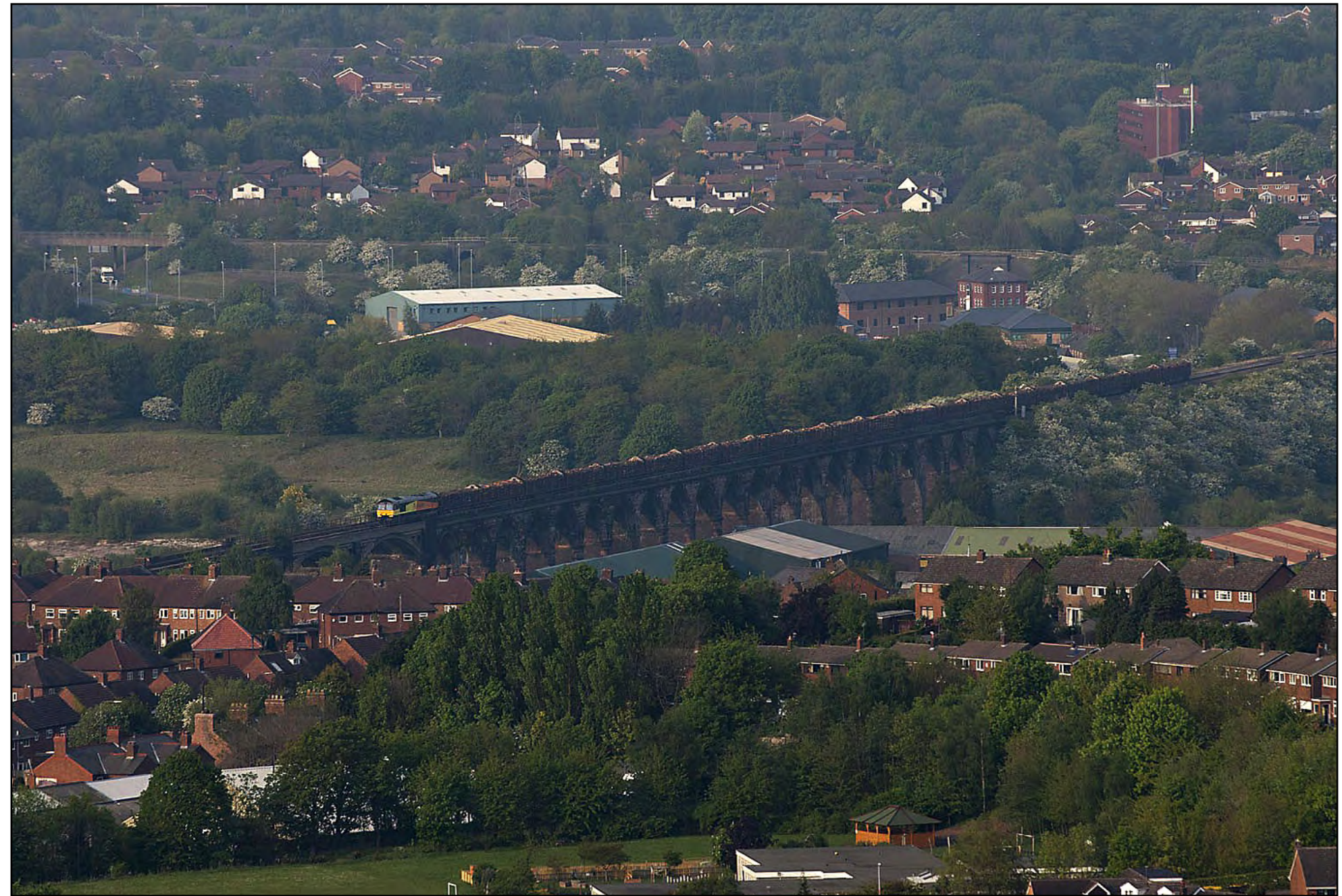
Above: Class 66 103 leads 66 047 working light engine to Toton through Chesterfield on May 7th. Right: With the wagons blending in with the viaduct brickwork, Colas Class 66 845 crosses the Frodsham Viaduct on April 29th heading for Chirk. Bottom Left: A busy scene at Nottingham as Colas Rail's Class 47 727 burbles past Eastcroft, working 6Z57 Boston Docks - Washwood Heath with loaded steel IHA's on May 11th. Bottom Right: On May 21st at 04:56 and barely daylight the 0X04 Immingham - Doncaster passes Appleby comprising ten locos, Class 66 109, 66 024, 66 015, 66 105, 66 008, 66 075, 66 103, 60 084, 60 071 and 60 074.