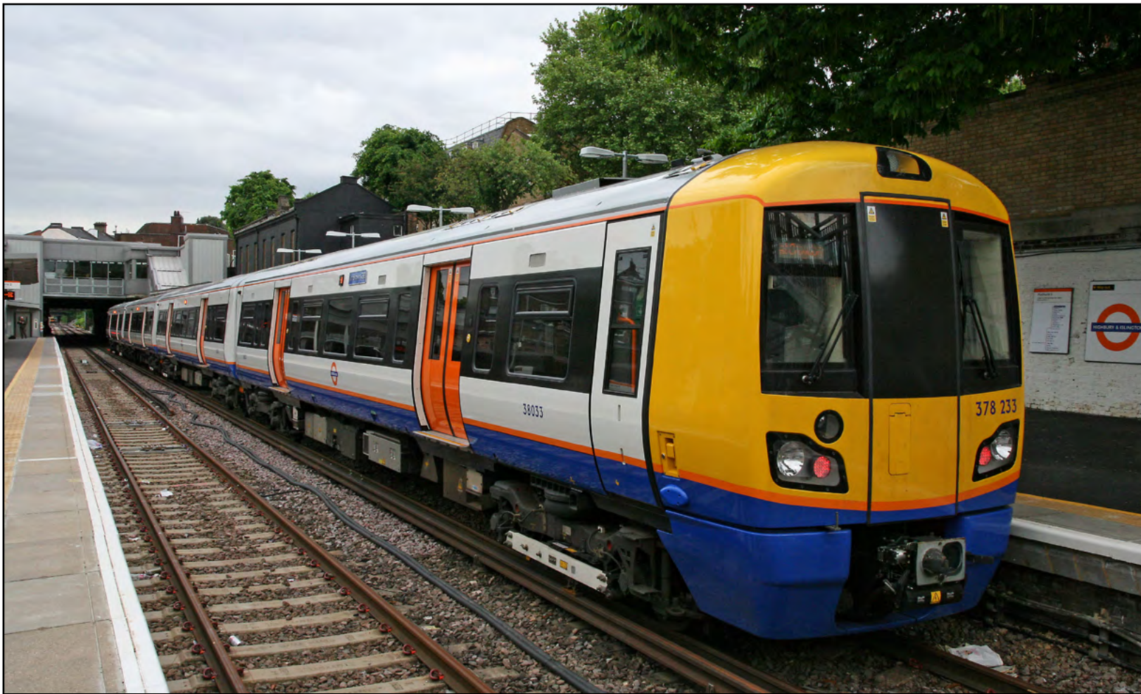
Above: On May 11th London Overground Class 378 233 stands alongside the new platform at Highbury and Islington station after its recent naming, "Ian Brown OBE". Below: Freightliner Class 70 002 slogs past Beckhouses on May 4th with 6C16, a very heavy engineer's train for Carlisle.