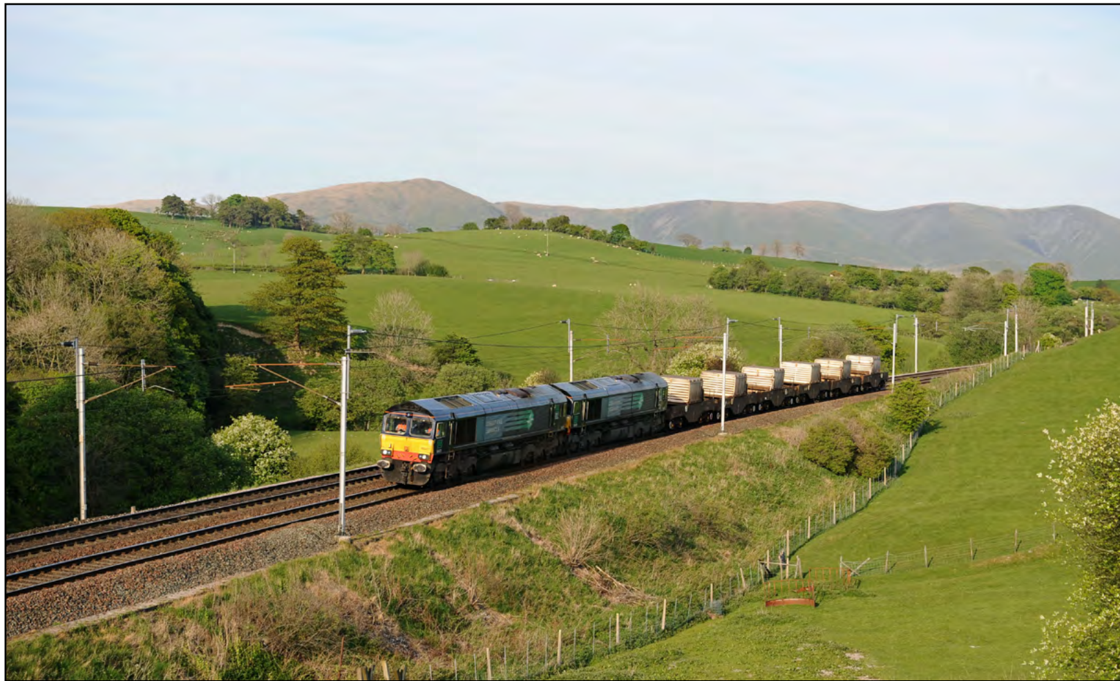
Above: Class 66 431 and 66 428 power the 6K73 flask train through Beckhouses after a stand in the loop at Tebay on May 4th. Below: In heavy rain, Class 60 074 passes Appleby with 6K25 Santon Foreign Ore Terminal to Immingham Bulk Terminal empties on May 23rd. The irrigation equipment was not needed today!