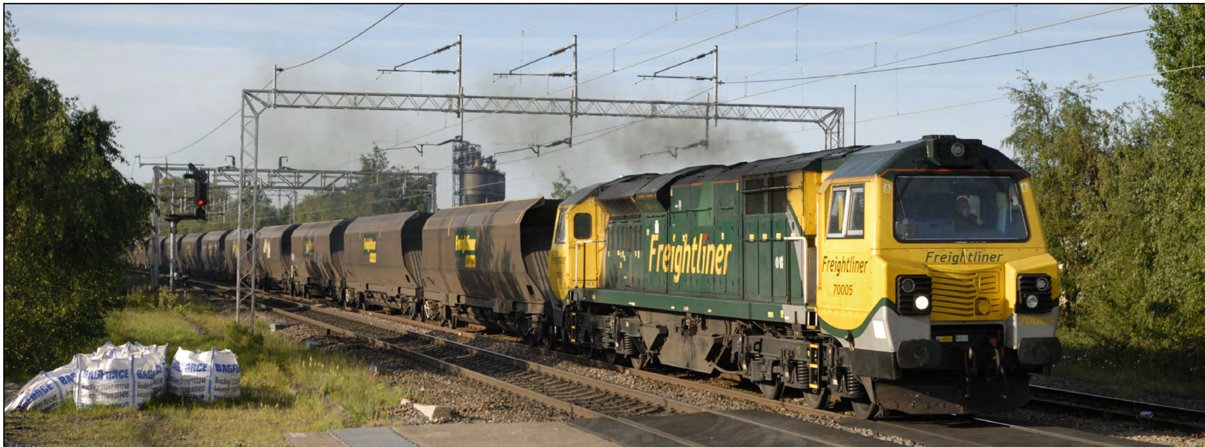
Top Left: Colas Rail Class 66 845 runs round its train of empty log carriers at Shrewsbury on May 10th before heading north to Carlisle. Top Right: Class 37 409 and 975025 "Caroline" are off on their jollies again, seen here departing Nottingham working 2230 St Pancras - Derby RTC after a quick turn around, May 11th. Left: Freightliner's Portbury - Rugeley and Portbury - Fiddlers Ferry coal trains are normally routed via Hereford but on Thursday 12th and Friday 13th May the 6M07 laden train to the Fiddlers Ferry power station on the Mersey was sent by way of the Lickey Incline in Worcestershire because of night time signalling work in the Newport area. On the Friday, Class 70 005 heads north away from Bushbury Junction, Wolverhampton with the 6M07 Portbury - Fiddlers Ferry. With the introduction of the class 70 locomotives in December 2009, the freight operating company carried-out tests with the locomotives hauling heavy coal trains up the Lickey incline. With the GE-built locomotives now 'settled-in', these diverted trains ran on time.