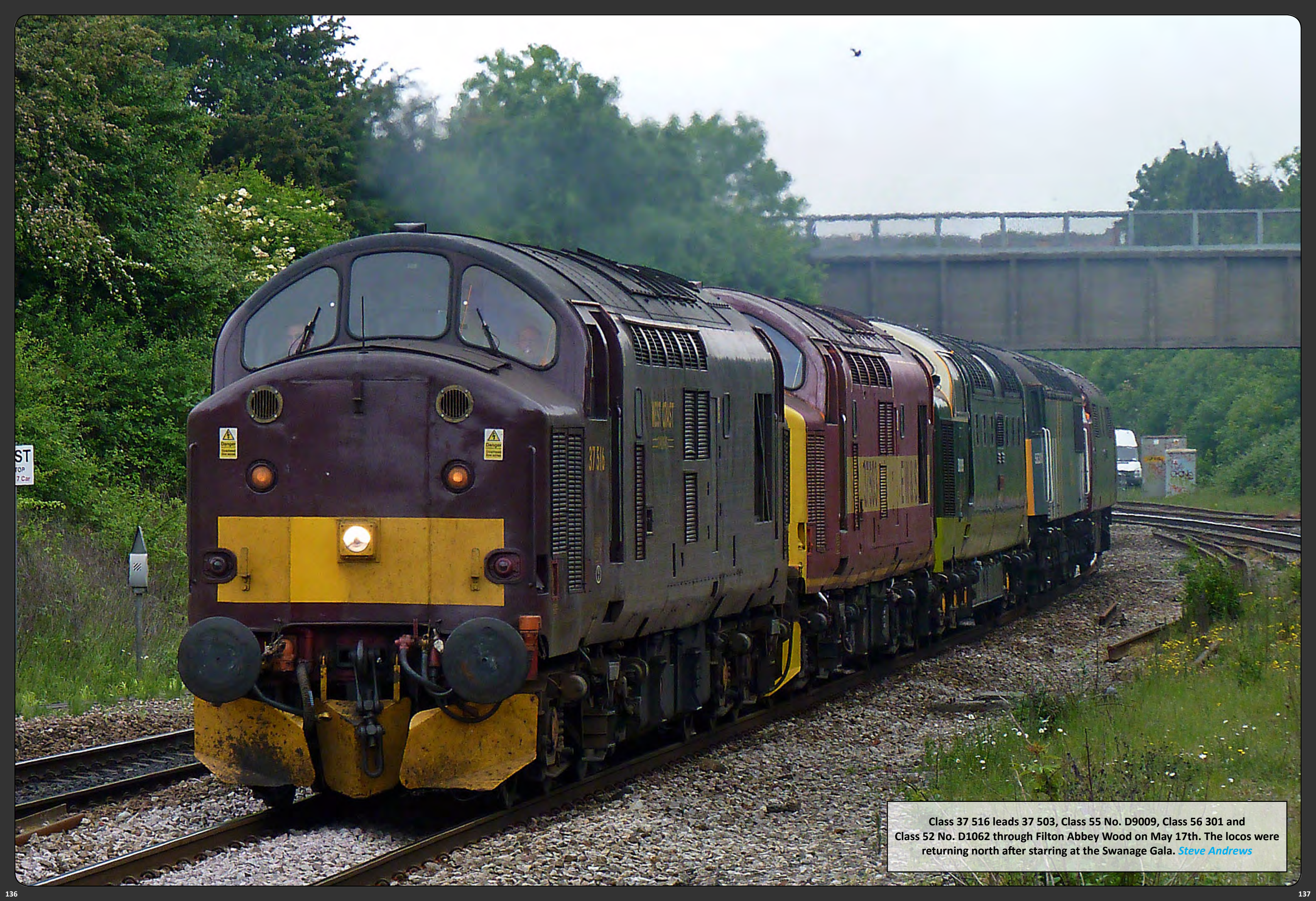
Class 37 516 leads 37 503, Class 55 No. D9009, Class 56 301 and Class 52 No. D1062 through Filton Abbey Wood on May 17th. The locos were returning north after starring at the Swanage Gala.