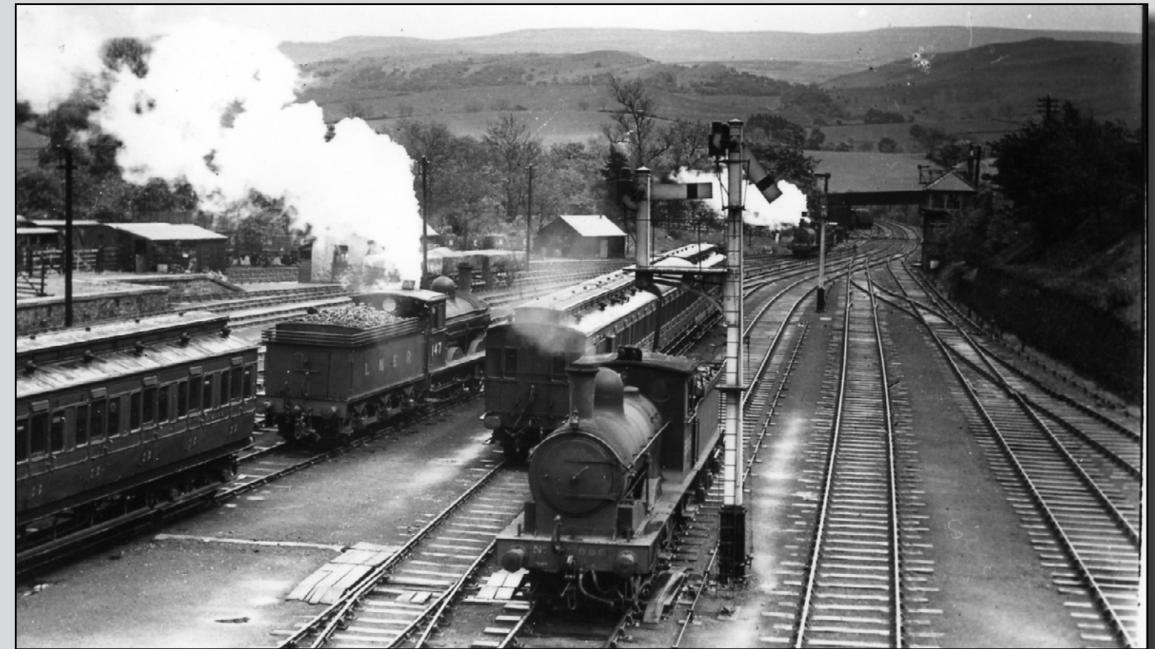
Above and Below: Two views of Kirkby Stephen East as it used to be.

http://www.stainmore150.co.uk/ or http://www.kirkbystepheneast.co.uk/