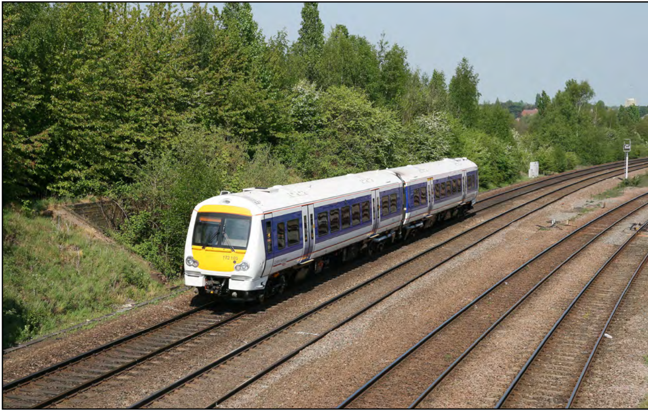
Above: On test for Chiltern, brand new Class 172 103 passes Headlands Bridge, Kettering on April 24th with a test run to Derby.