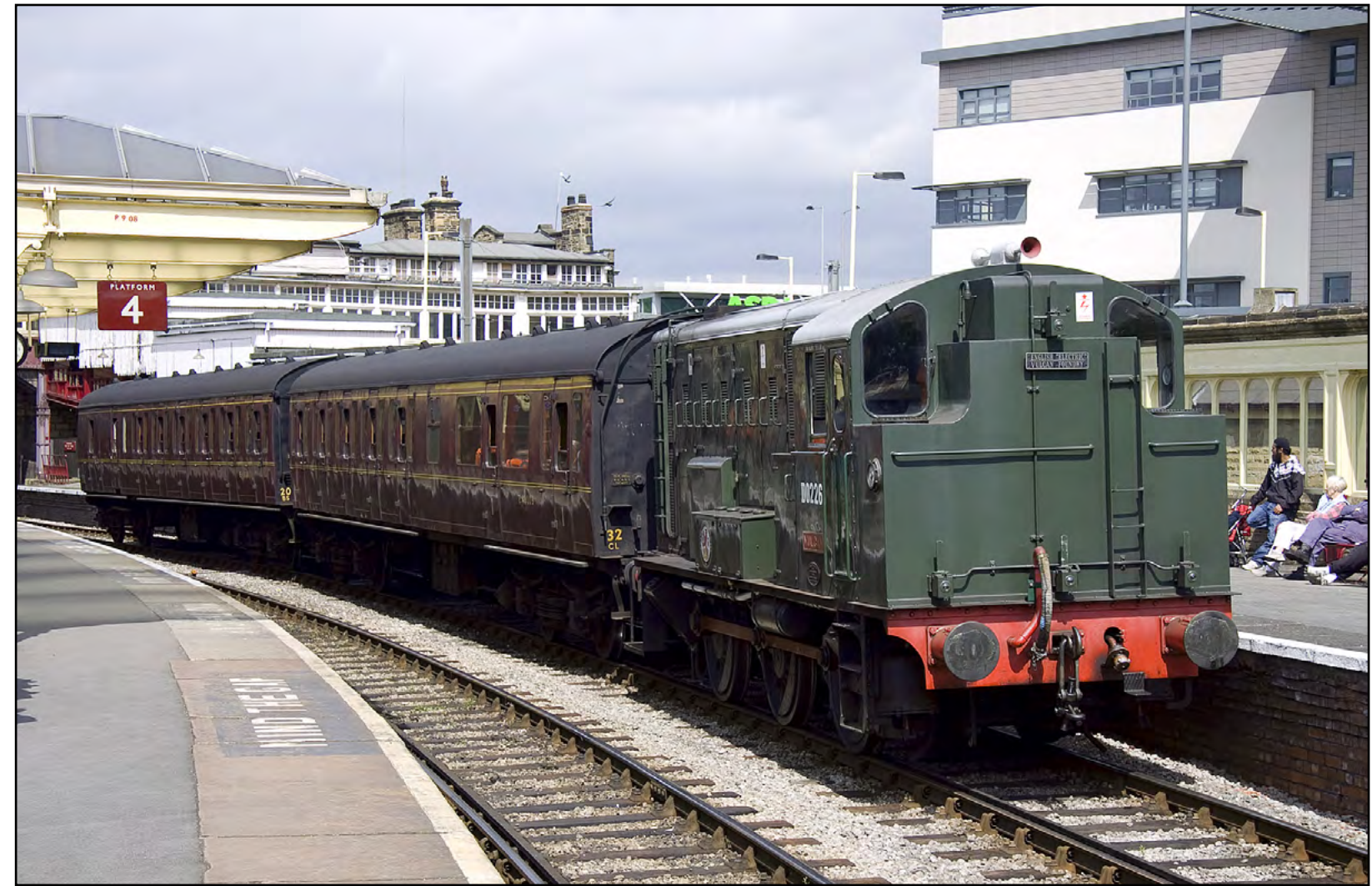
Above: Vulcan Foundry-built 0-6-0 No. D0226 "Vulcan" waits to depart Keighley with the local train to Ingrow West on May 21st. Below: Class 55 019 "Royal Highland Fusilier" arrived into Keighley on May 21st.