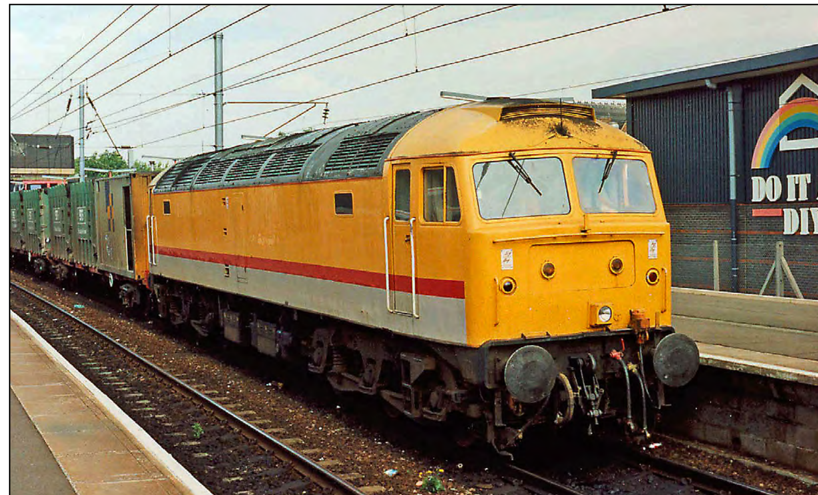
Above: Yellow Peril Class 47 803 heads through Bedford on September 3rd 1994. Below: Having already had its bogies removed, Class 47 555 is seen on a flat wagon at Wigan Springs Branch during a visit on August 29th 1999.