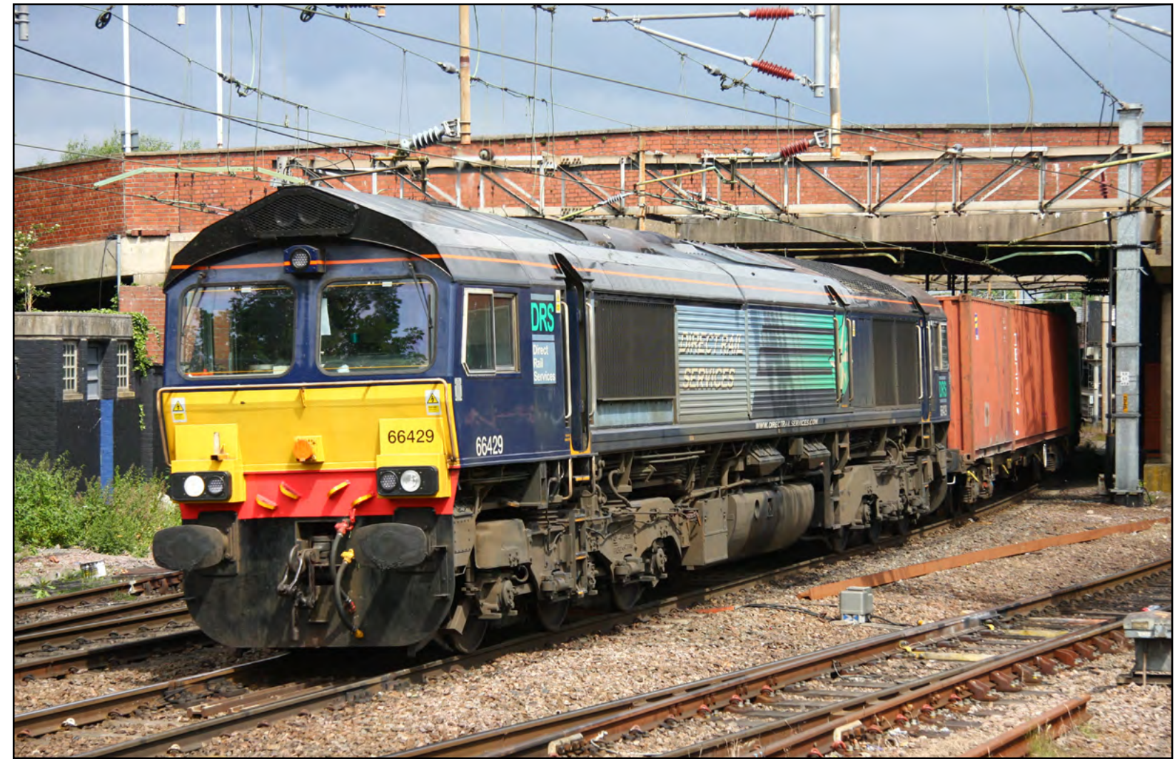
Above: Class 66 429 heads south through Northampton with an Intermodal service on May 27th. Below: Class 66 086 backs onto its next working at Wembley Yard on May 28th.