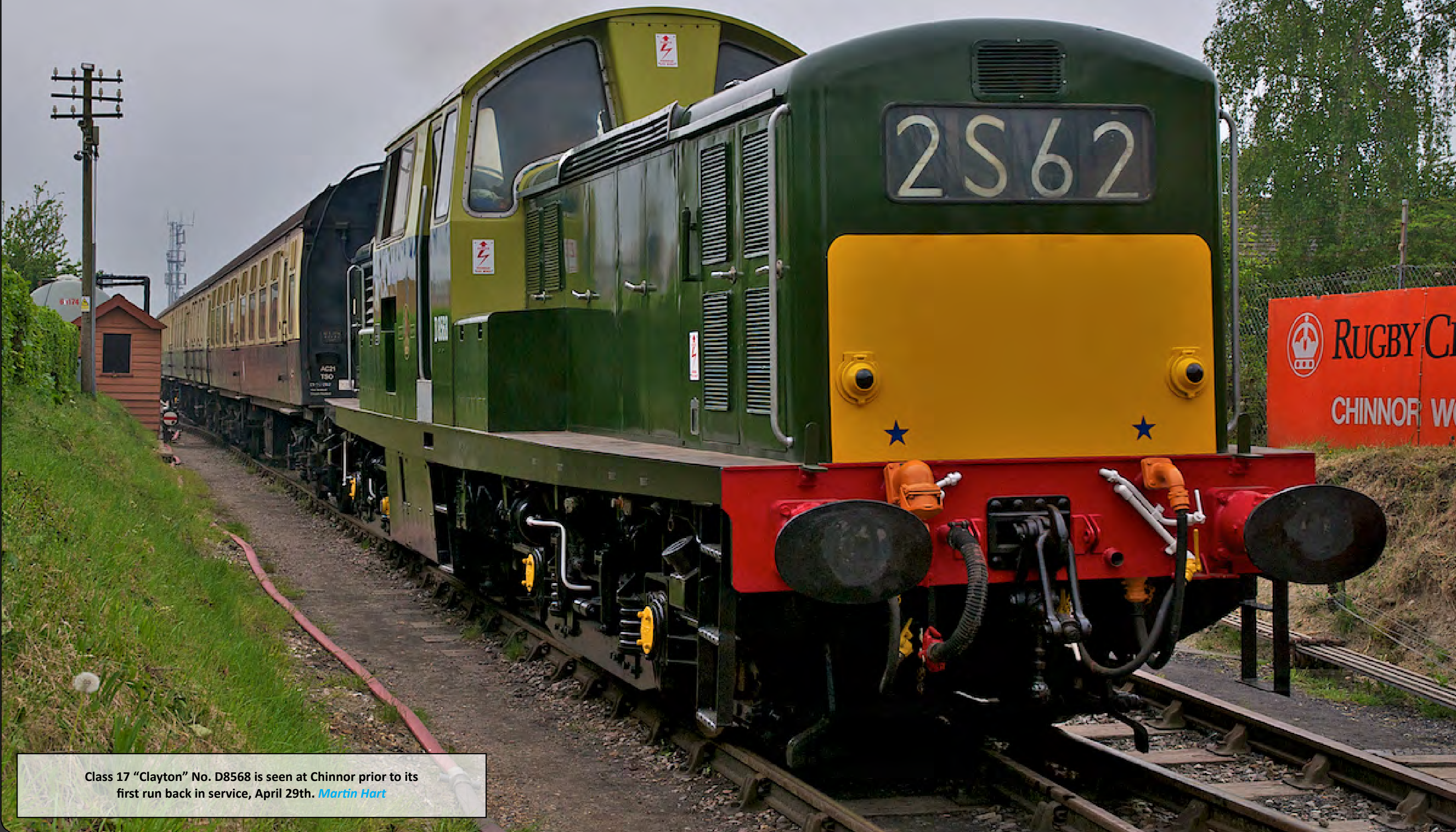
Class 17 "Clayton" No. D8568 is seen at Chinnor prior to its first run back in service, April 29th.