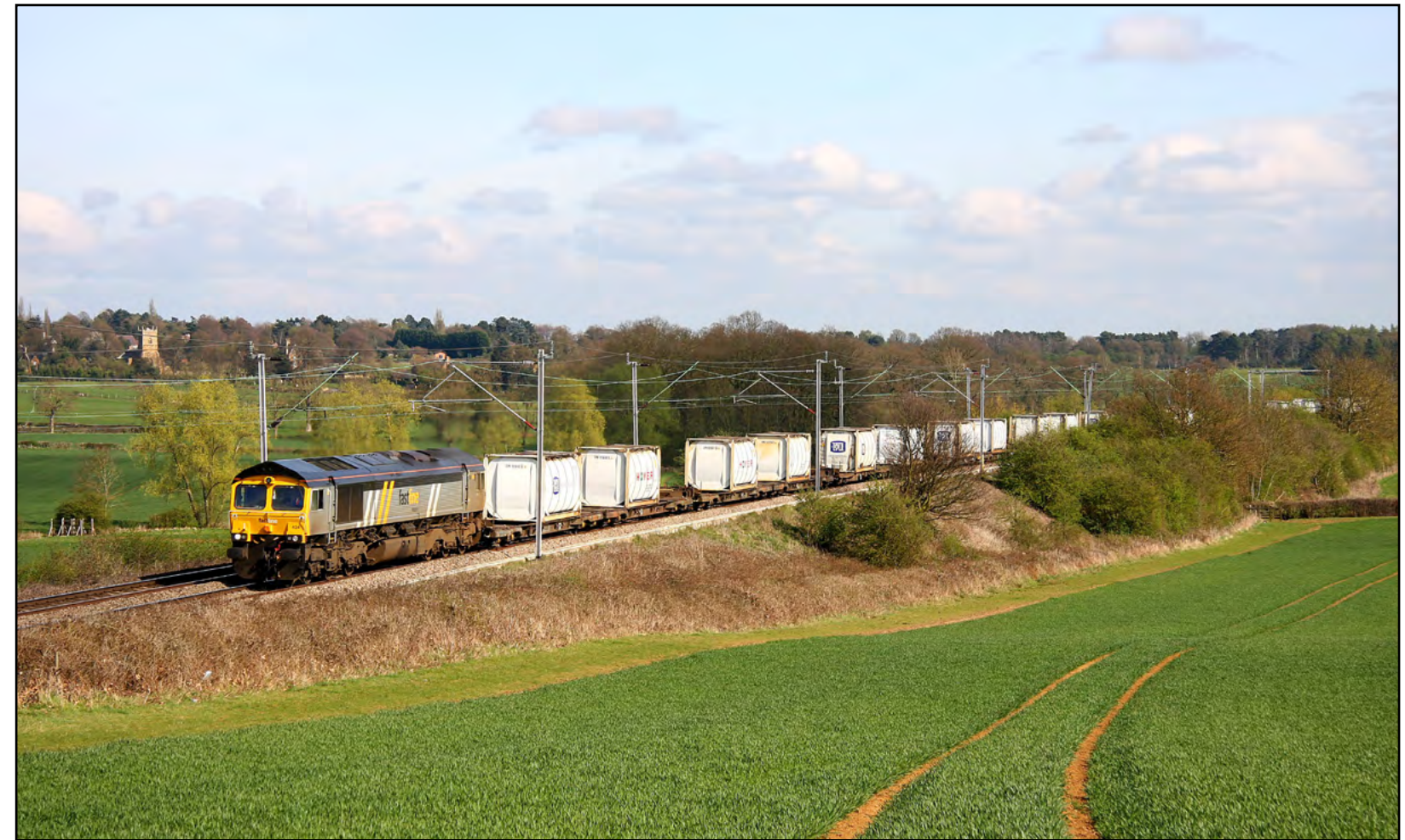
Above: Class 66 434 still in Fastline Freight livery works the DRS 4M71 Tilbury to Daventry "Sugarliner" through Church Brampton on April 7th. Below: On hire to First Great Western for the summer are Class 153 325 and 153 333, seen here arriving into Saltash on May 24th.