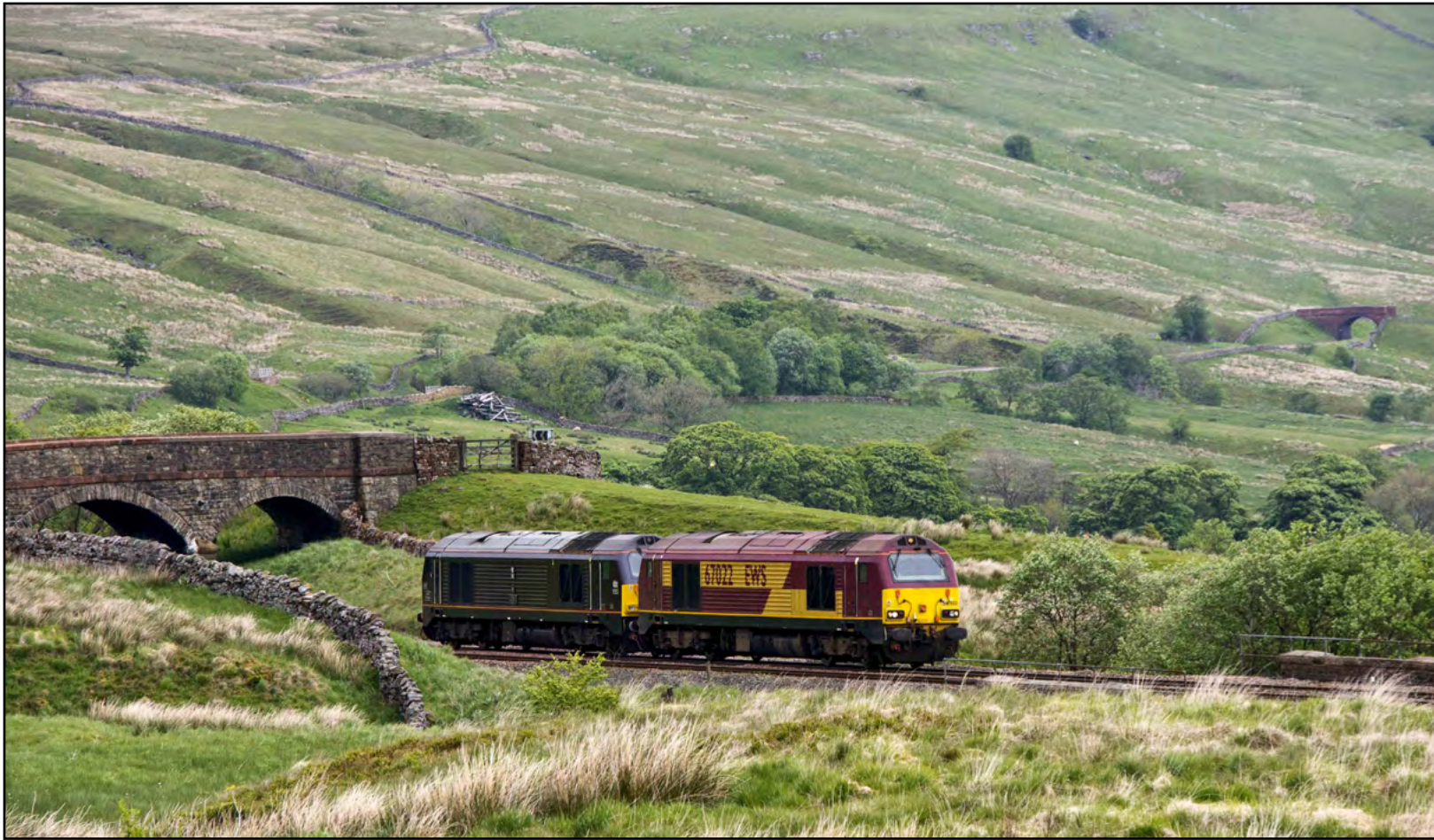
Above: With the WCML closed for engineering work, Class 67 022 and 67 005 were sent down via the S&C from Carlisle to Crewe, seen here at Ais Gill summit on May 21st. Below: Still carrying traces of its Railfreight Distribution livery, Class 90 036 heads through Acton Bridge on May 5th with the 6L48 Garston to Dagenham.