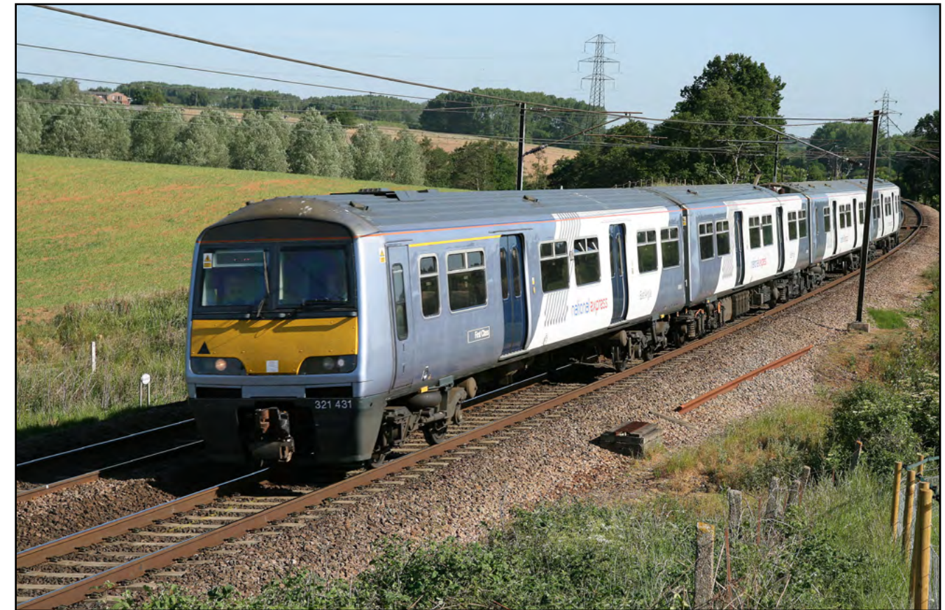
Above: Class 321 431 passes Brantham on a local service to London Liverpool St. from Manningtree on May 25th. Left: DBS Class 67 008 gets under way from a signal check at Acton Bridge with the Dowlow - Arpley working on May 10th. Bottom Left: A rare outing for Class 40 No. D306 on May 11th as Class 31 190 (D5613) hauls it passed BRUSH, Loughborough working 0240 Fletton - Washwood Heath. Bottom Right: Colas Rail Class 47 739 hauls track machine No. 73909, running as 6272 Penrith CE - Rugby OLE seen here through Warrington on May 31st.