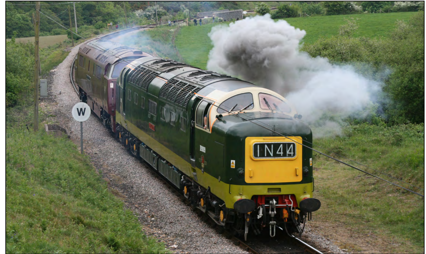
Above: On May 6th, Class 55 No. D9009 "Alycidon" starts up during a run round at Norden. Derek Hopkins Below: Class 52 No. D1062 pulls away hard from Harmans Cross heading for Swanage. Derek Hopkins