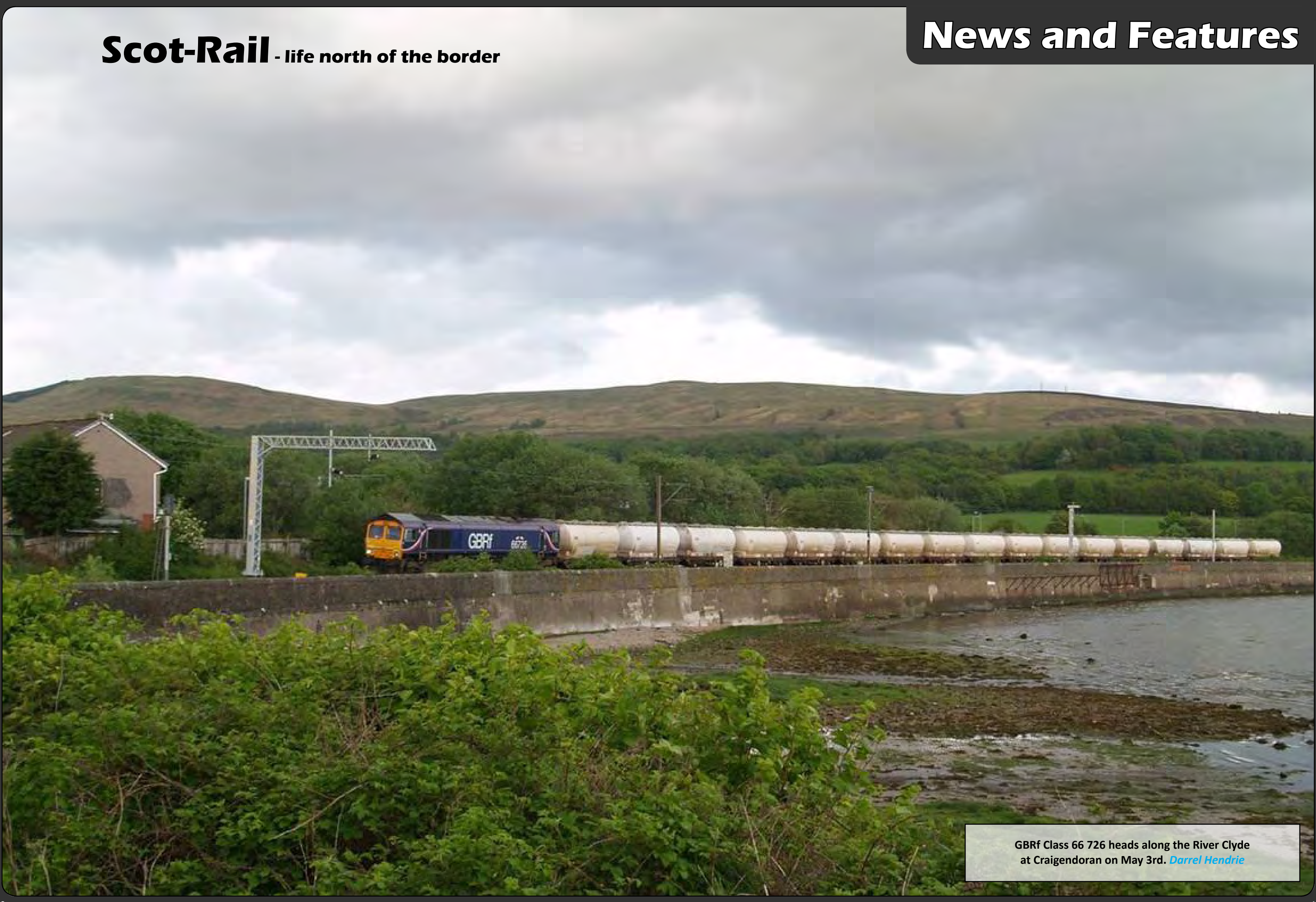
GBRf Class 66 726 heads along the River Clyde at Craigmendoch on May 3rd.