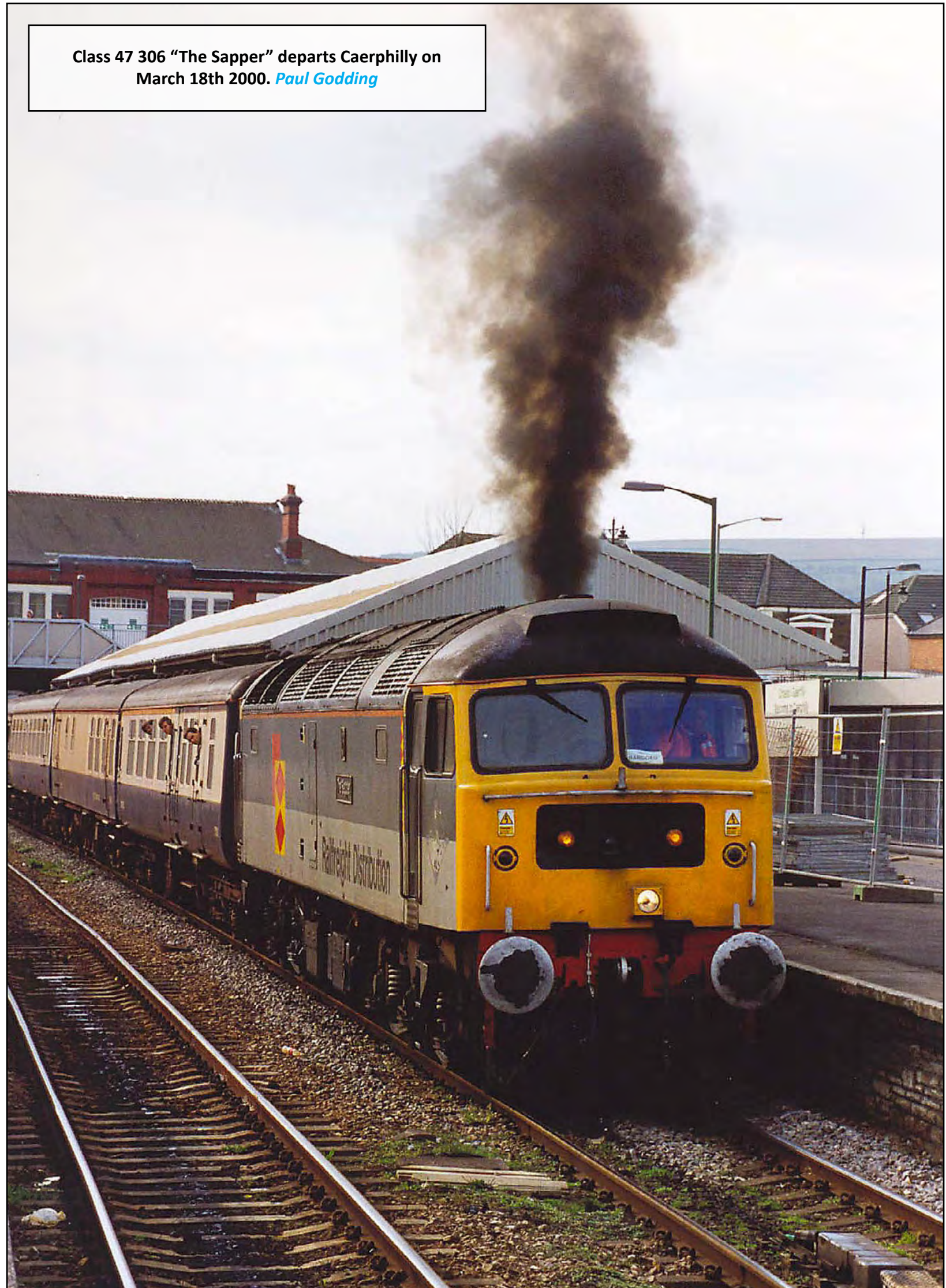
Class 47 306 "The Sapper" departs Caerphilly on March 18th 2000.