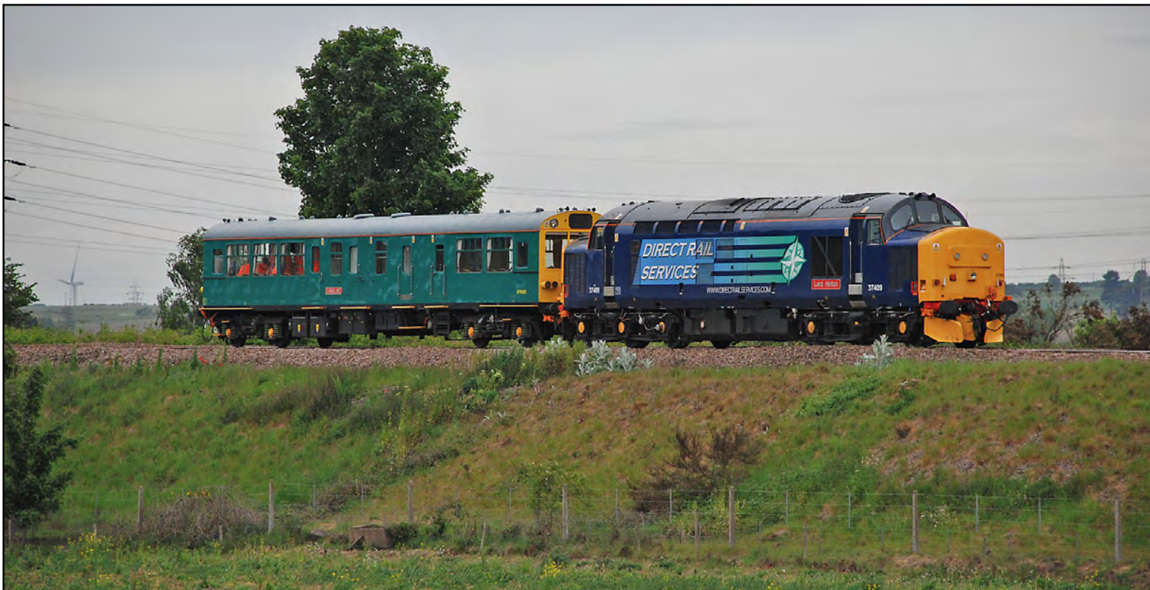
Below: On May 25th Class 37 409 and "Caroline" were out in the North Lincs working 2Z01 Skegness - Wakefield Westgate, seen here ascending Appleby Bank in full dull weather.