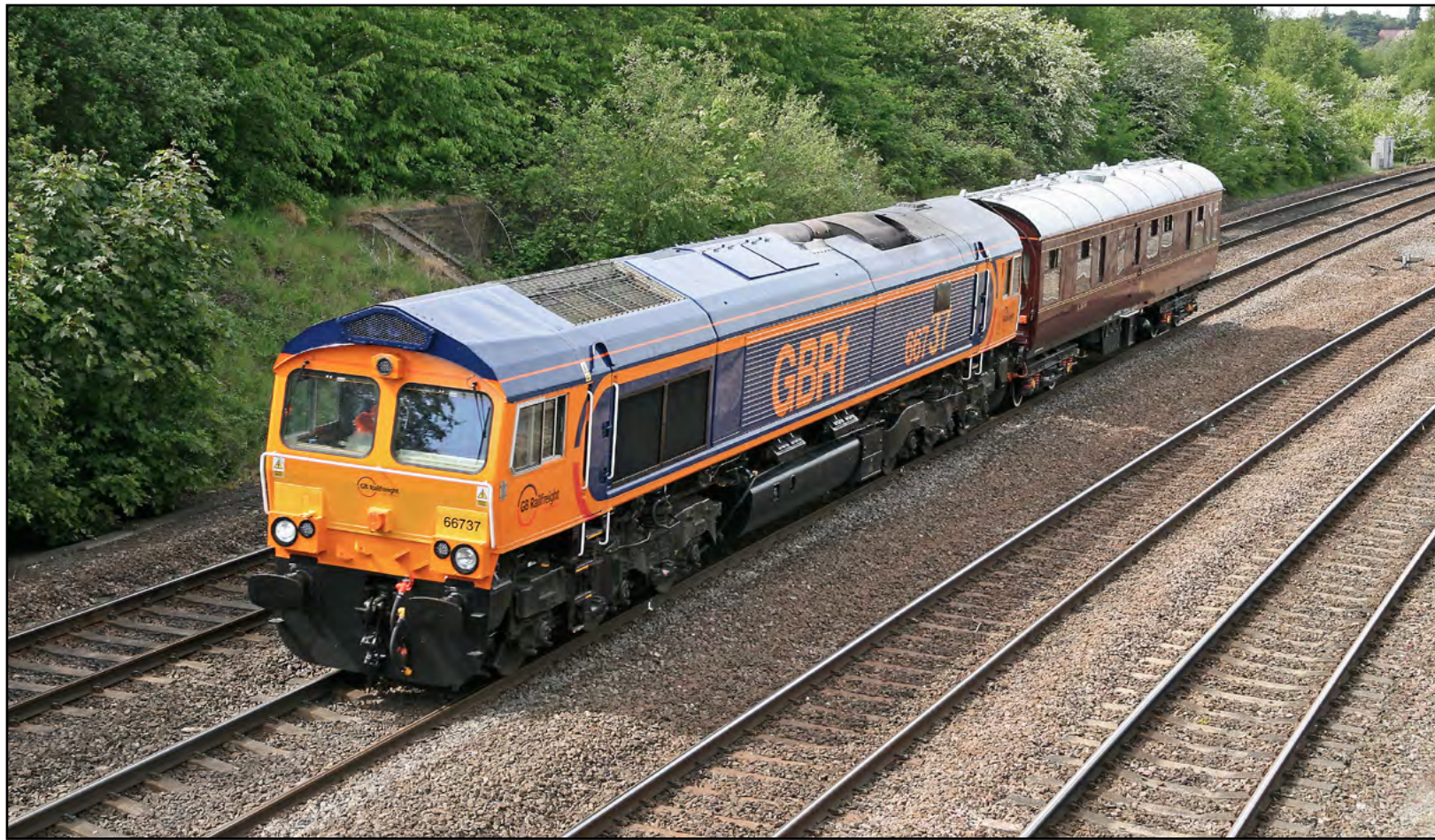
Above: Ahead of its naming ceremony, GBRf Class 66 737 passes Headlands Bridge, Kettering heading for Peterborough on May 6th carrying the new GBRf/Europorte livery. Below: On May 26th, Tata Steel Class 60 099 is seen at Cholsey working the 6B33 Theale - Robeston empty bogie tanks.