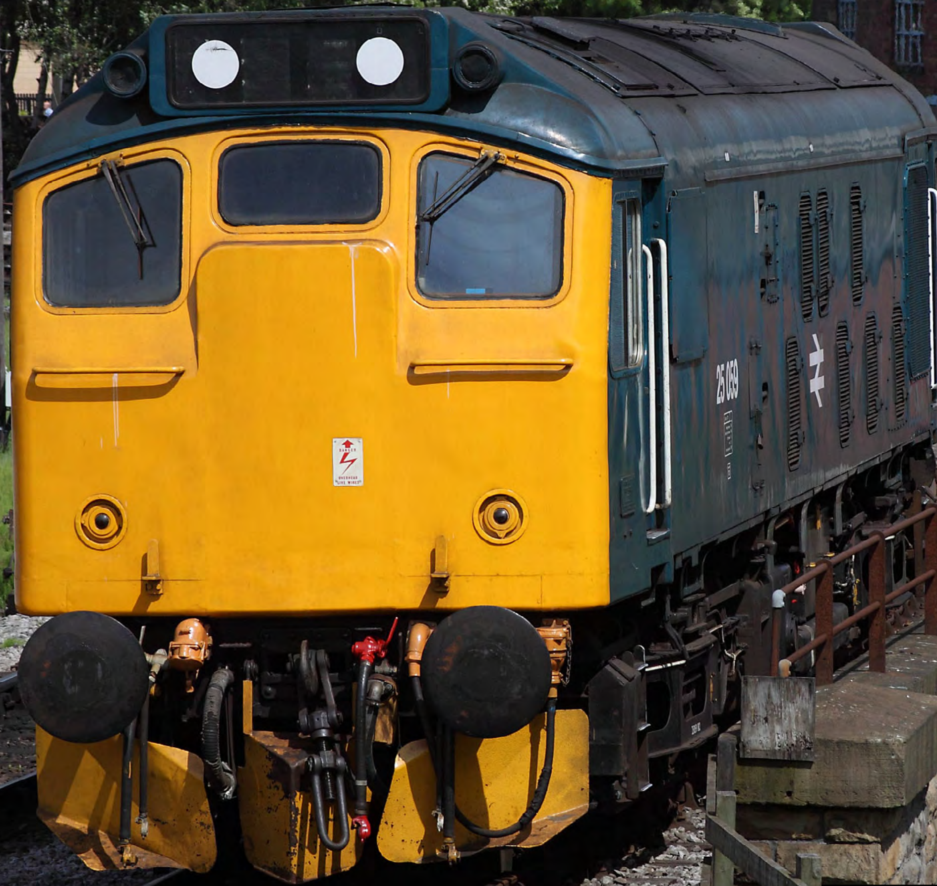
2011 Diesel Gala Class 25 059 waits to back onto its next working at Keighley on May 21st.