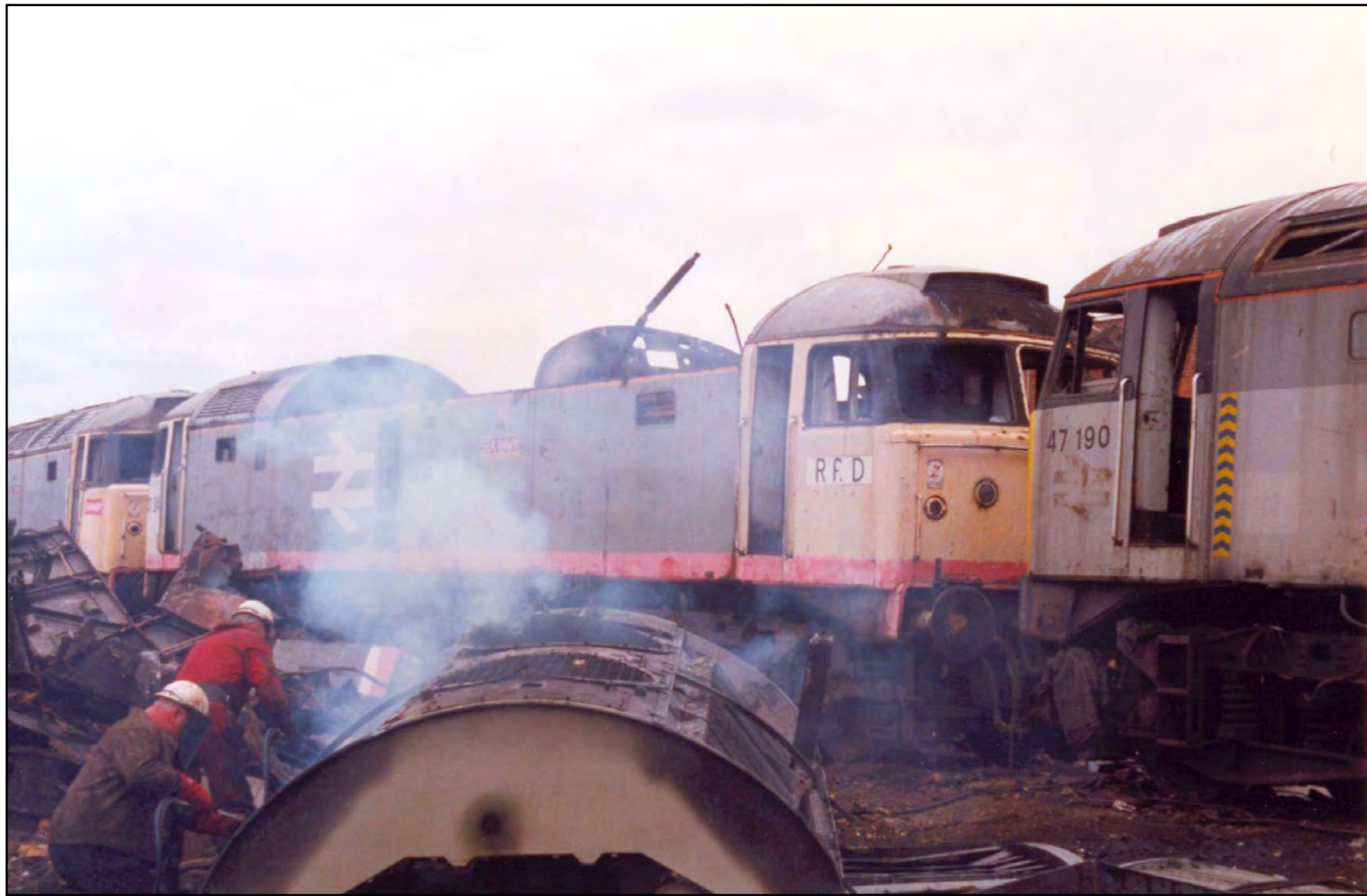
Above: Class 47 249 is seen getting torched at CF Booths on March 20th 2003. Below: Class 37 029 is seen hauling a failed Metro Cammell unit at Gloucester.