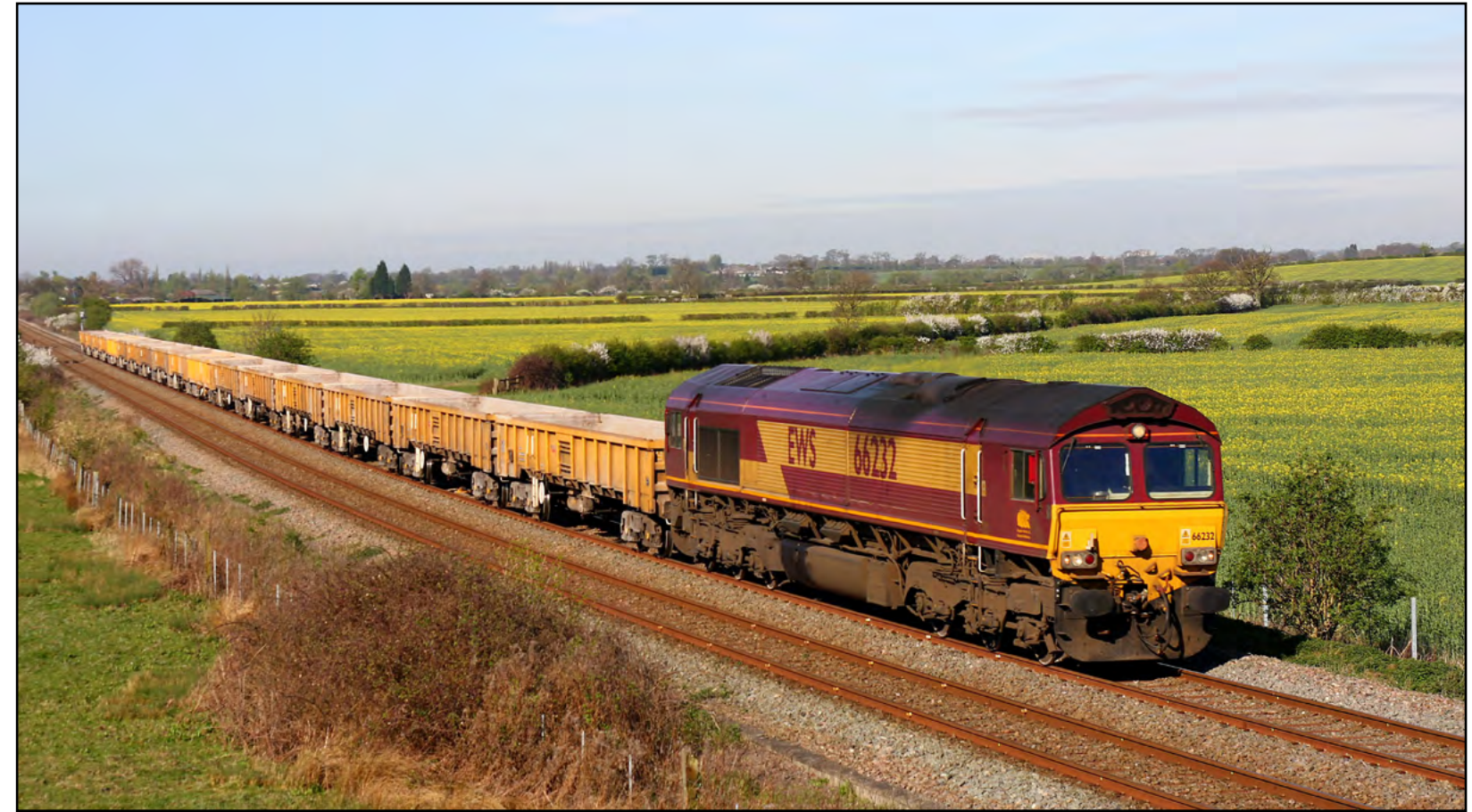
Above: Class 66 232 is seen working 6D65 Willesden to Stud Farm through Ridgemont on the Bletchley to Bedford line, April 7th. Below: Can this be beaten for working of the year? Class 55 022 was hired from GBRf to work the "Alcans" from North Blyth to Lynemouth during May, making several newspapers and even BBC Breakfast. Seen here on May 10th at North Blyth.