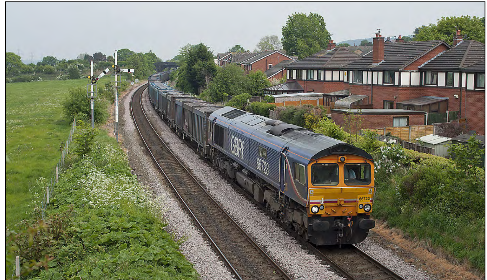
Above: GBRf Class 66 723 heads for Ellesmere Port on May 5th, seen here passing through Helsby. Below: GBRf Class 66 728 works the 4N50 Tyne Dock - North Blyth approaching Freemans Level Crossing, Cambois on May 4th.