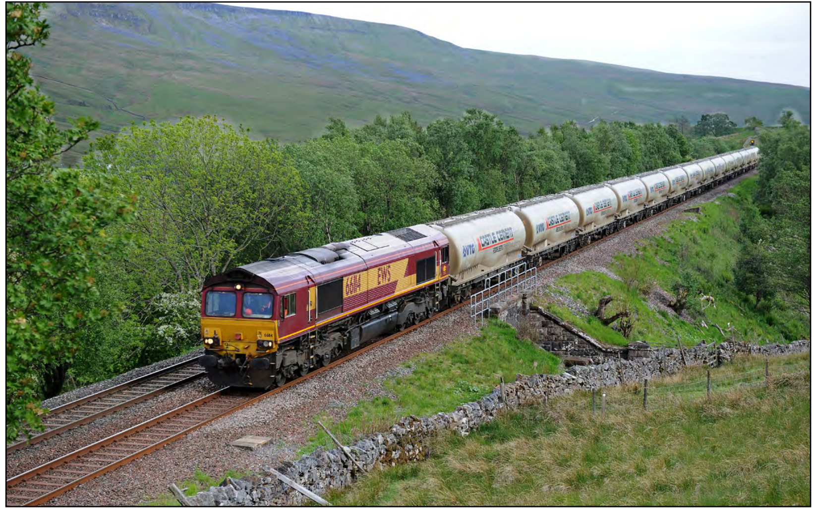
Above: Class 66 114 approaches Birkett tunnel with the returning 6500 Clitheroe to Mossend cement train on May 25th. Below: Track Recording Unit Class 950 001 speeds north through Acton Bridge on April 29th.