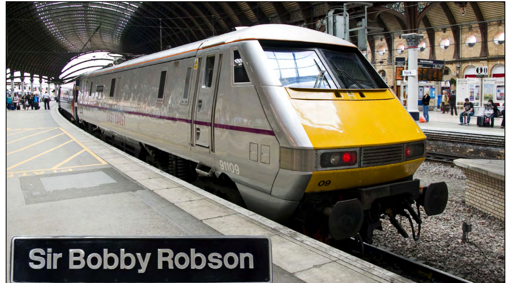
Sir Bobby Robson