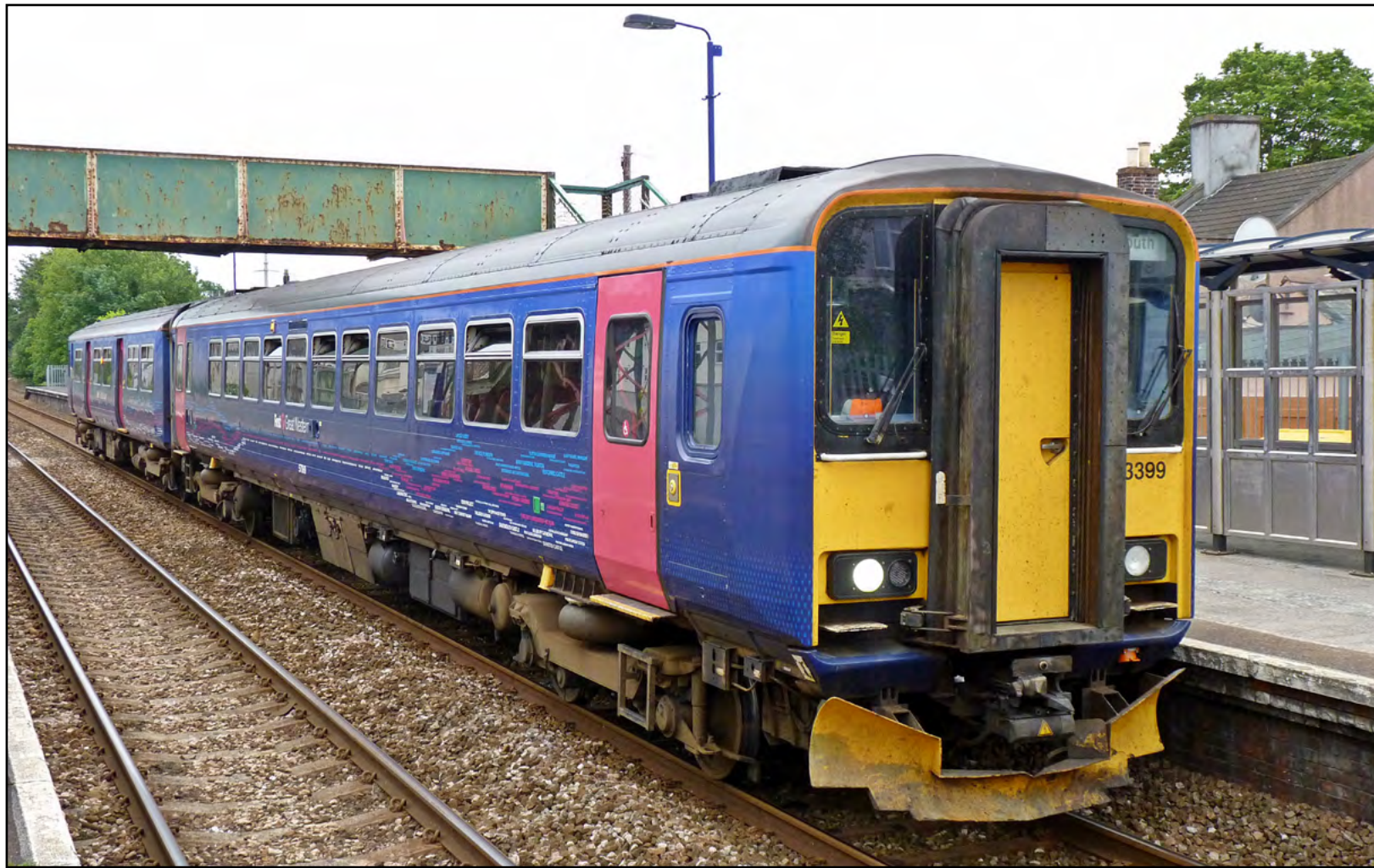
Above: Unique FGW Class 150/153 unit No. 153 399 (Which is 153 369 and half of 150221 (57221)) is seen at Keyham on May 23rd. This pairing is as a result of 52221 sustaining fire damage. Below: East Midlands Trains Class 153 321 and a Class 158 stand at Stoke on Trent on May 28th with a Derby to Crewe working.