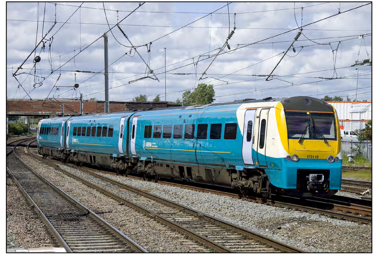
Above: On May 31st, Arriva Trains Wales Class 175 115 arrives into Warrington Bank Quay station with a service from Manchester to Llandudno. Left: Class 60 015 speeds along the East Coast Main line with the Jarrow - Lindsay oil tanks on May 8th. Bottom Left: Now in regular service, National Express Class 379 016 pauses at Tottenham Hale station on May 11th. Bottom Right: The two car Virgin Voyager Class 221 144 has escaped the confines of Central Rivers depot and was seen at Crewe on May 31st.