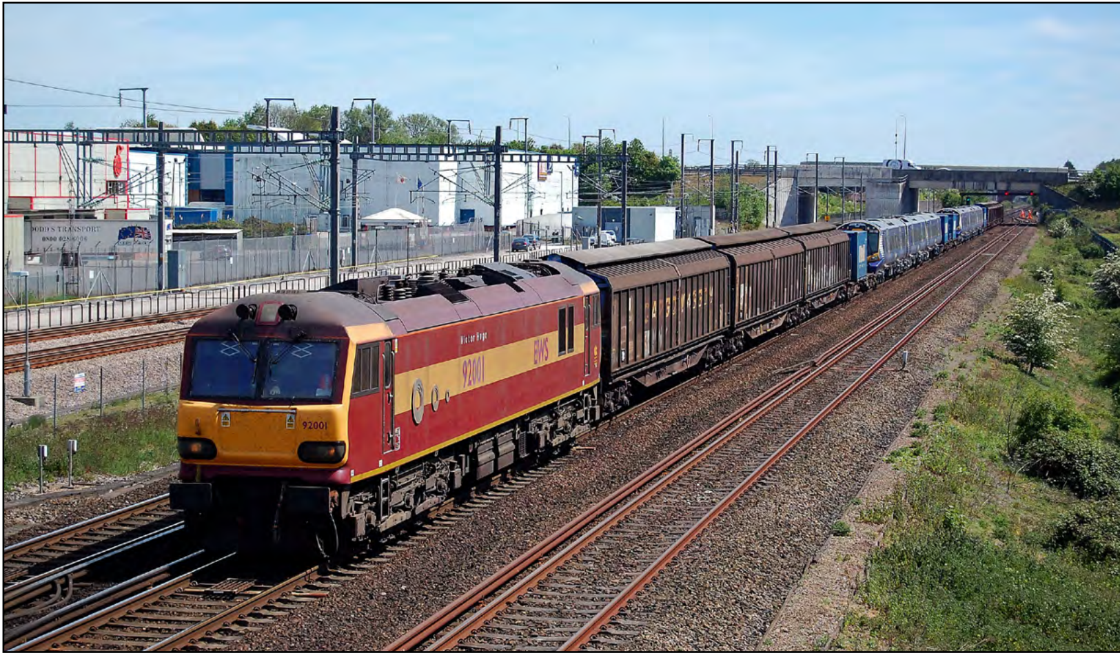
Above: EWS liveried Class 92 001 "Victor Hugo" powers up at Sevington, Ashford [Kent] working 7X80 13:16 Dollands Moor - Polmadie, Scotrail Class 380 move on May 3rd. Below: Class 70 010 heads off the Ellesmere Port branch at Helsby on May 5th with a loaded coal train heading for Warrington.