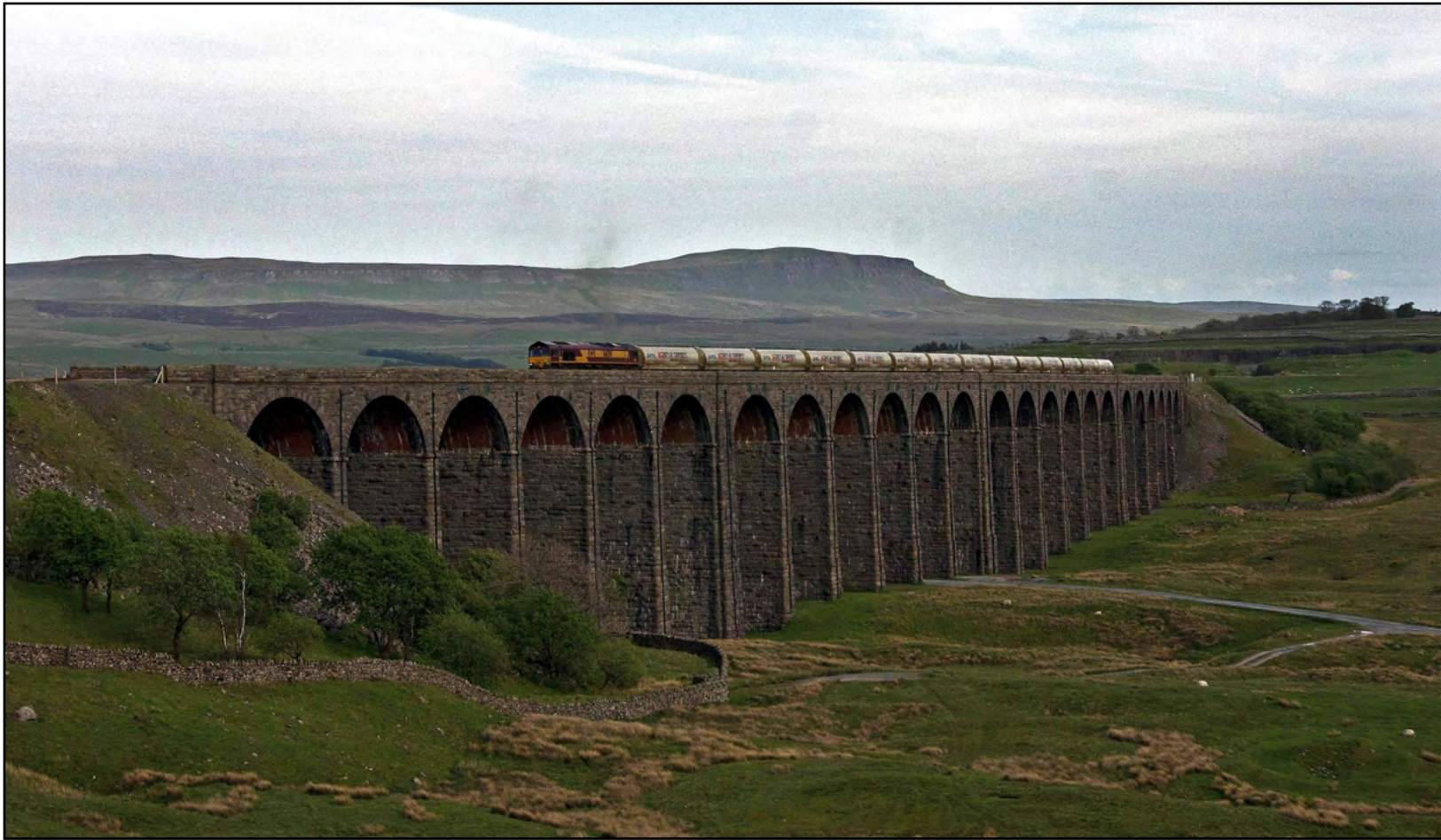
Above: Class 66 201 heads north across Ribbleshead Viaduct with a cement train on May 19th. Below: Class 92 022 "Charles Dickens" roars up Sandling on May 13th working 7X80 Dollands Moor - Polmadie Scotrail Class 380 drag. Only two more drags were left after this working, with just four units to arrive in the UK.