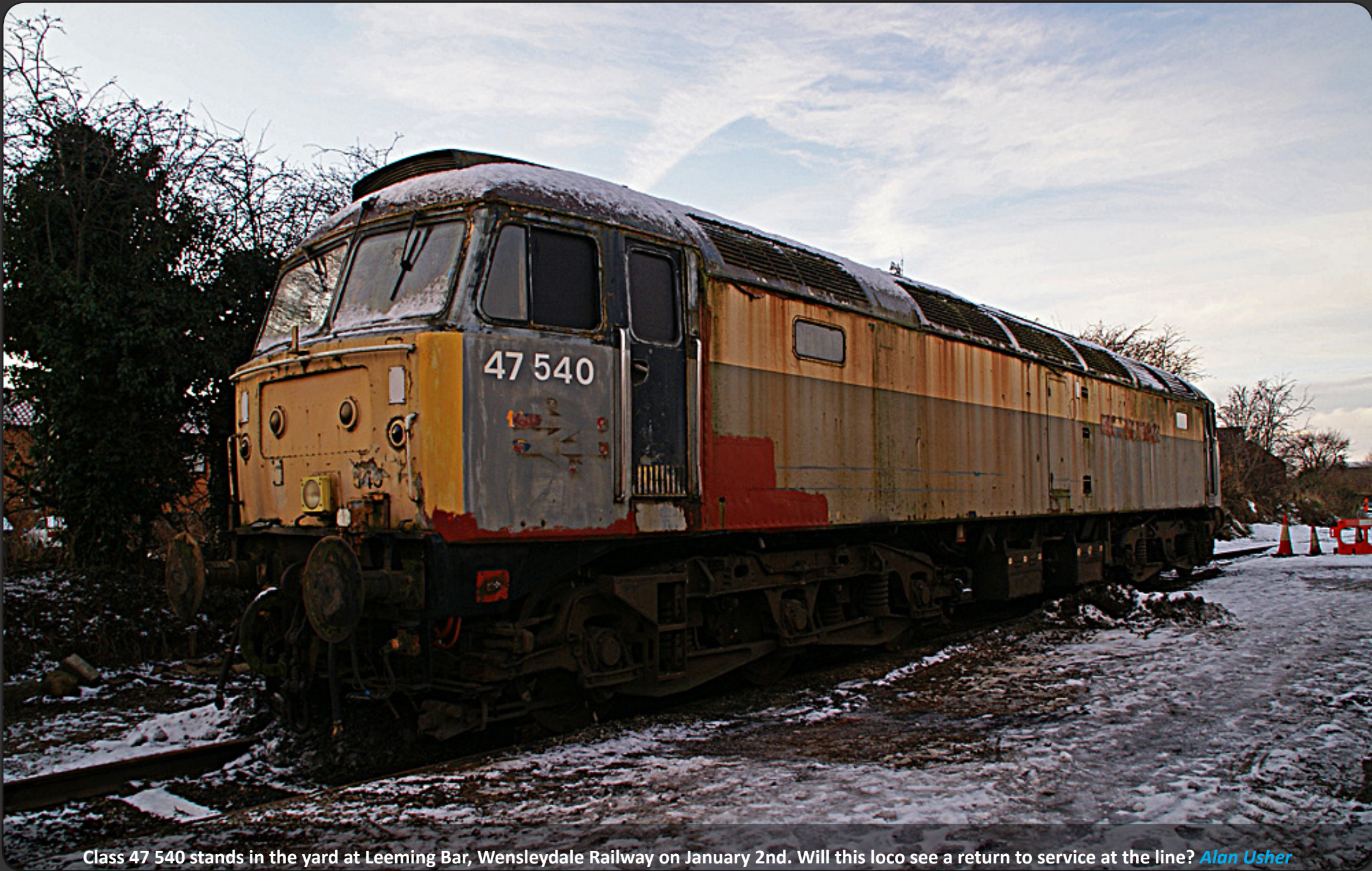
Class 47 540 stands in the yard at Leeming Bar, Wensleydale Railway on January 2nd. Will this loco see a return to service at the line?