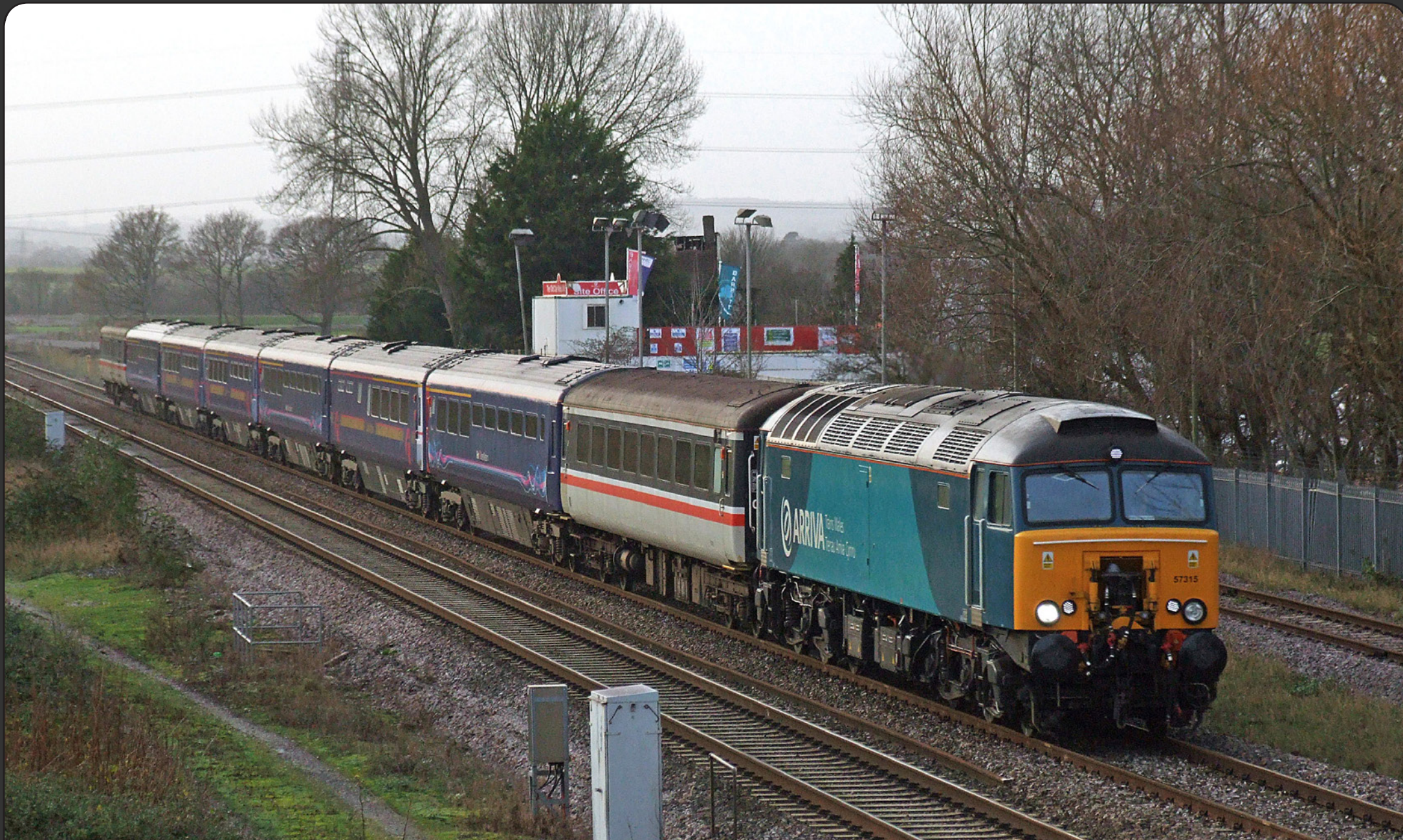
On December 9th, on hire to GBRf, ATW liveried Class 57 315 passes Norton Fitzwarren whilst working from Laira to Eastleigh with 6 off-lease FGW HST buffet cars 40717, 40228, 40731, 40209, 40208, and 40747 for storage. Jonathan Gill