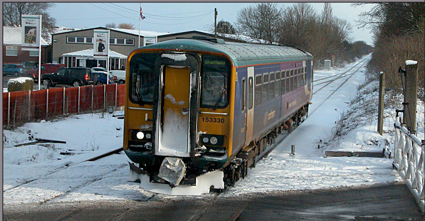
Bottom Right: Class 153 330 is seen working 2R00 Cleethorpes - Sheffield, through Brigg on January 9th.