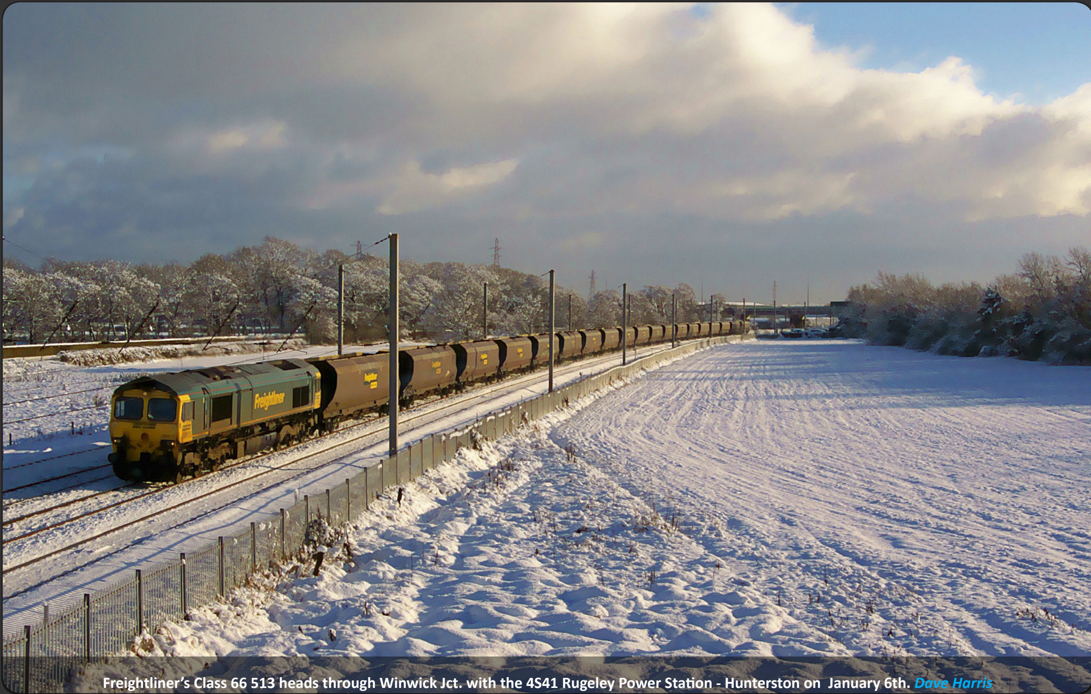
Freightliner's Class 66 513 heads through Winwick Jct. with the 4S41 Rugeley Power Station - Hunterston on January 6th.