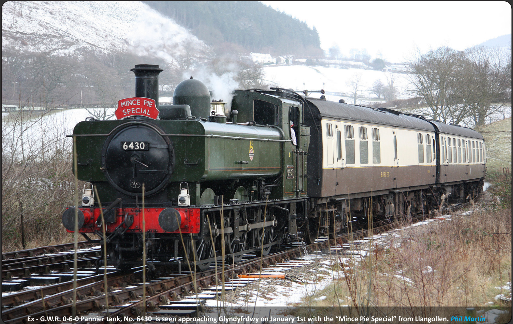
Ex - G.W.R. 0-6-0 Pannier tank, No. 6430 is seen approaching Glyndyfrdwy on January 1st with the "Mince Pie Special" from Llangollen.