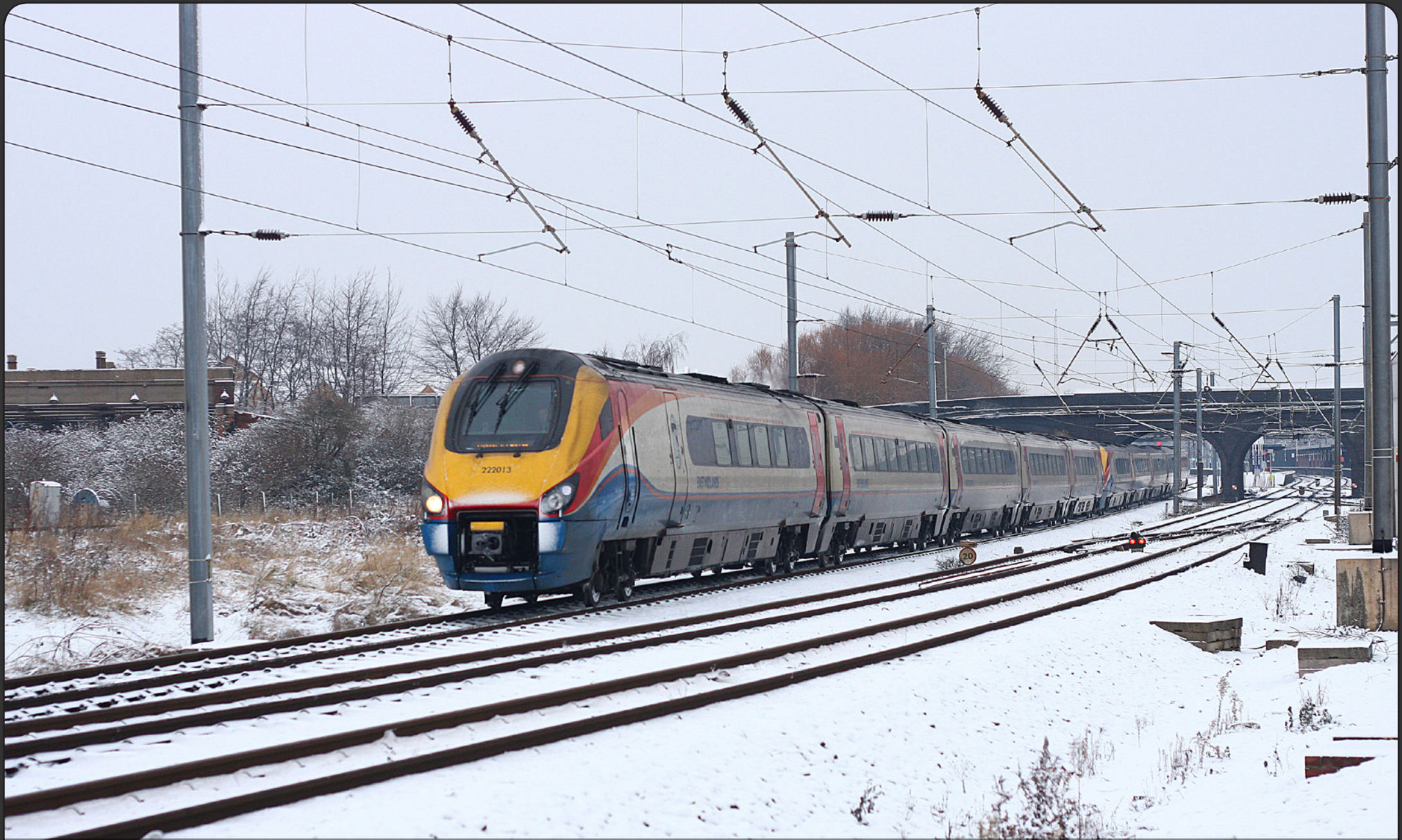
East Midlands Trains Class 222 013 is seen departing a snowy Bedford with the 10:19 to St Pancras on January 6th. Class25