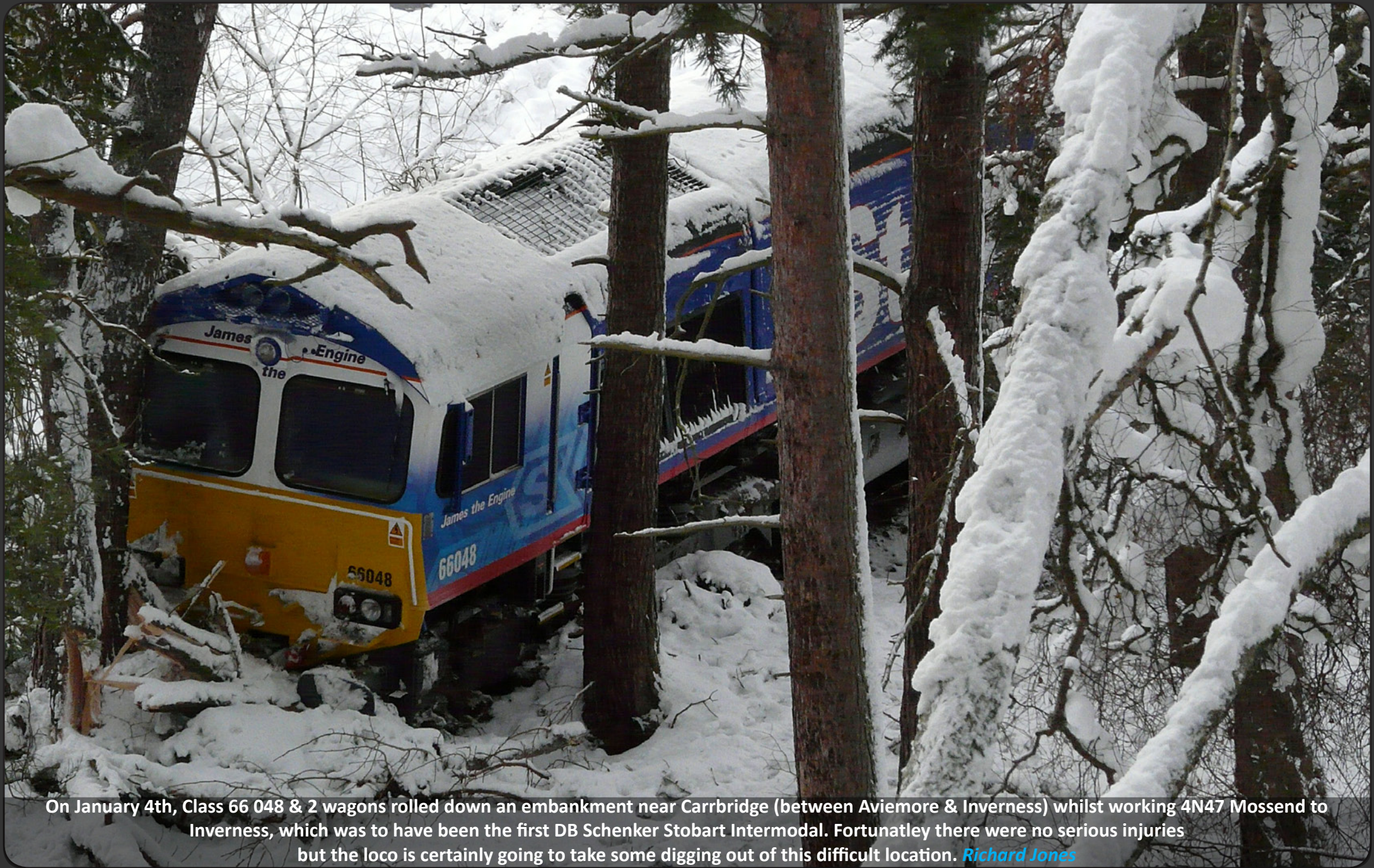
On January 4th, Class 66 048 & 2 wagons rolled down an embankment near Carrbridge (between Aviemore & Inverness) whilst working 4N47 Mossend to Inverness, which was to have been the first DB Schenker Stobart Intermodal. Fortunatley there were no serious injuries but the loco is certainly going to take some digging out of this difficult location.