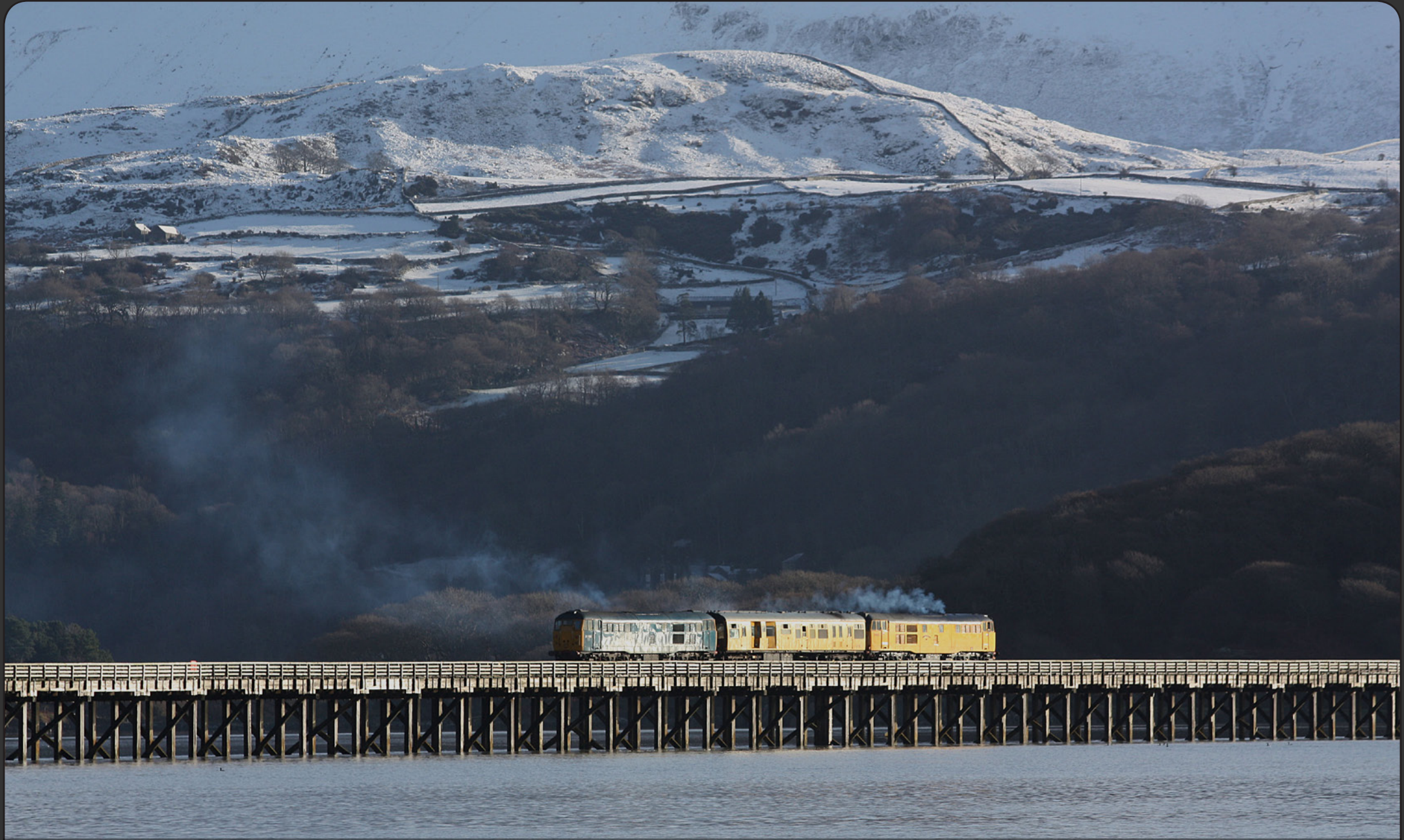
Class 31 106 and 31 602 cross the famous Barmouth Bridge, heading for Shrewsbury on January 5th with a Serco test train. Phil Martin