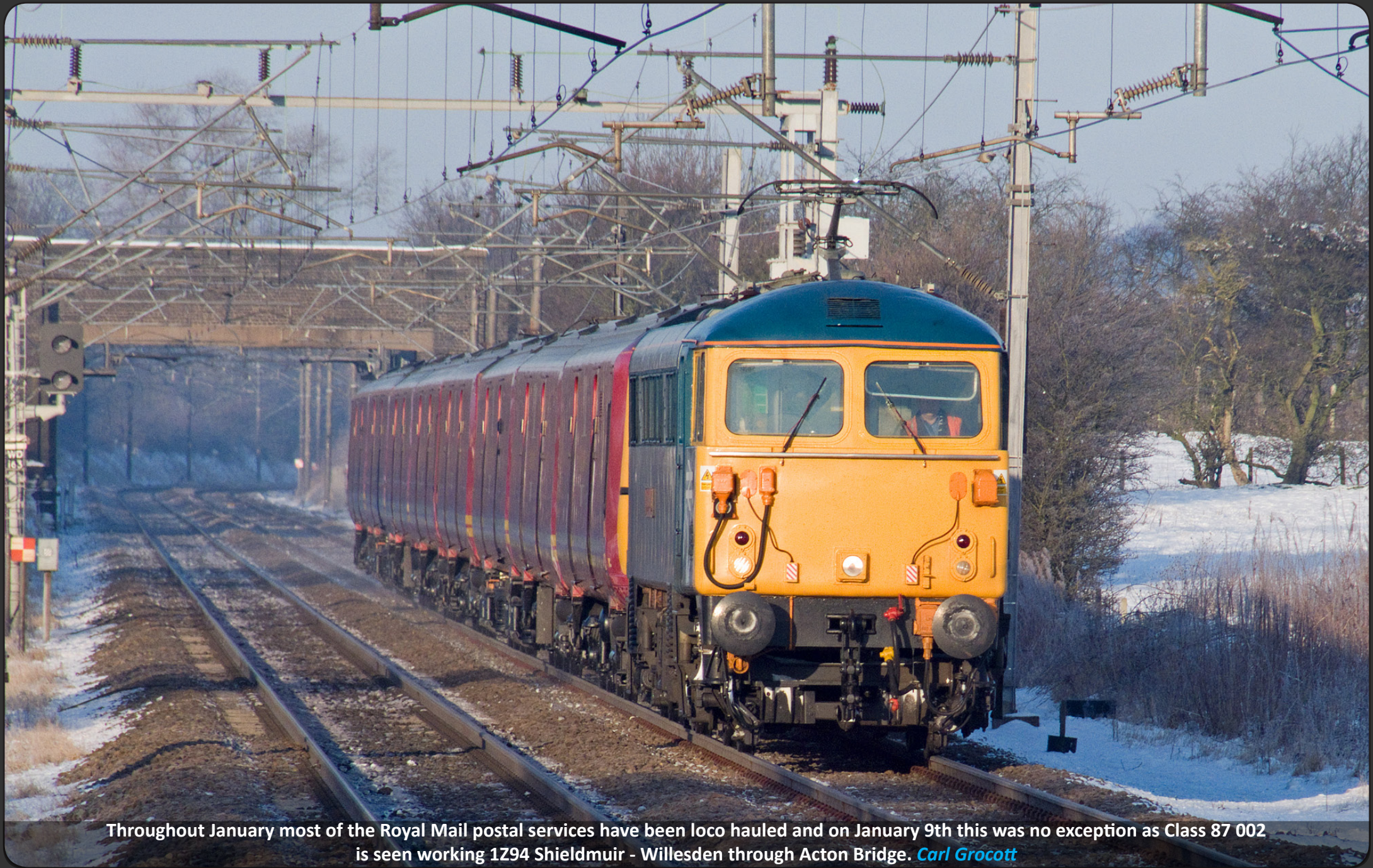
Throughout January most of the Royal Mail postal services have been loco hauled and on January 9th this was no exception as Class 87 002 is seen working 1Z94 Shieldmuir - Willesden through Acton Bridge. Carl Grocott