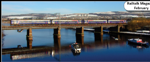
Railtalk Magazine February

www.railtalk.net | admin@railtalk.net | Railtalk 2010 Calendar © Railtalk Group