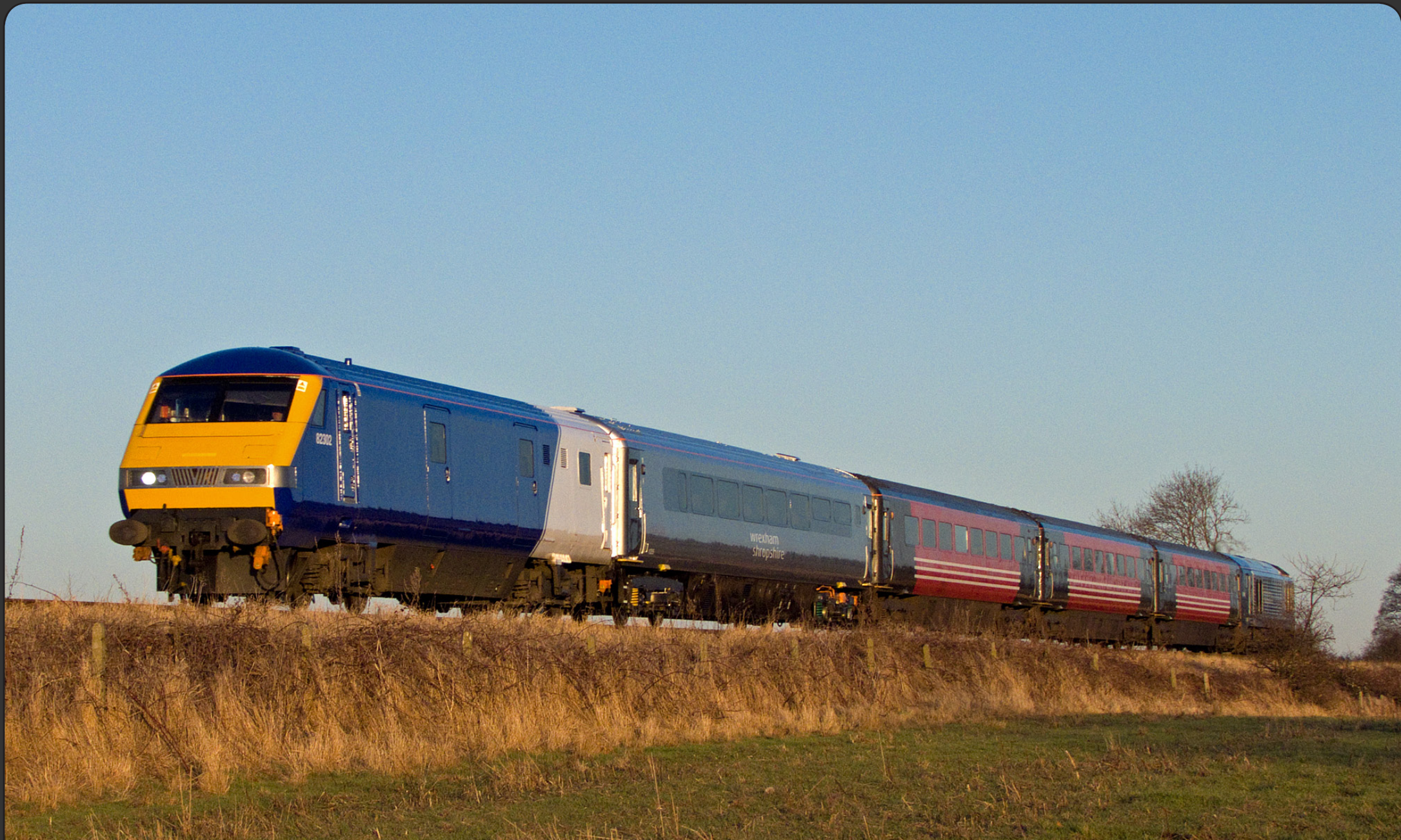
As the month ended one of the Wrexham and Shropshire sets included three ex Virgin liveried Mk3s. This combined with the Chiltern liveried DVT and one refurbished coach, makes a colourful sight seen passing Admaston on January 30th.