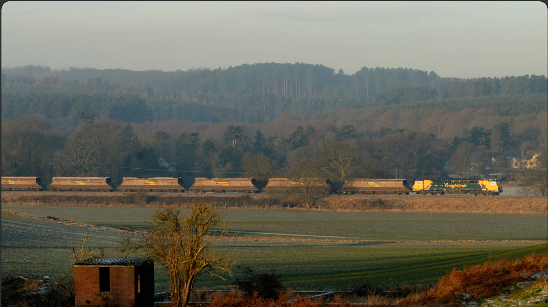
Freightliner's new GE-built locomotives were used on a new service via Kidderminster (instead of via The Welsh Marshes) from mid-December 2009. The 6Z70 was scheduled to run overnight to Rugeley but as the British weather changed to very cold in the second week of the train, each of the Class 70s developed a fault. On the morning of December 23rd, Class 70 002 passes Slitting Mill as it approaches Rugeley, Staffordshire, with the rather late 6Z70 Avonmouth - Rugeley Power Station laden coal hoppers train. This train should have arrived at Rugeley when it was still dark. Gary S. Smith