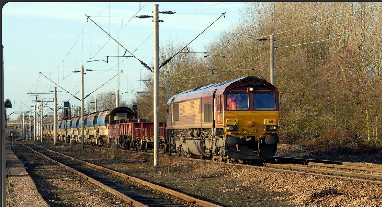
Top Left: Class 66 146 is seen arriving at Marks Tey with the self discharge train on January 17th. The ensemble will shortly move on to the engineering possession at Kelvedon.