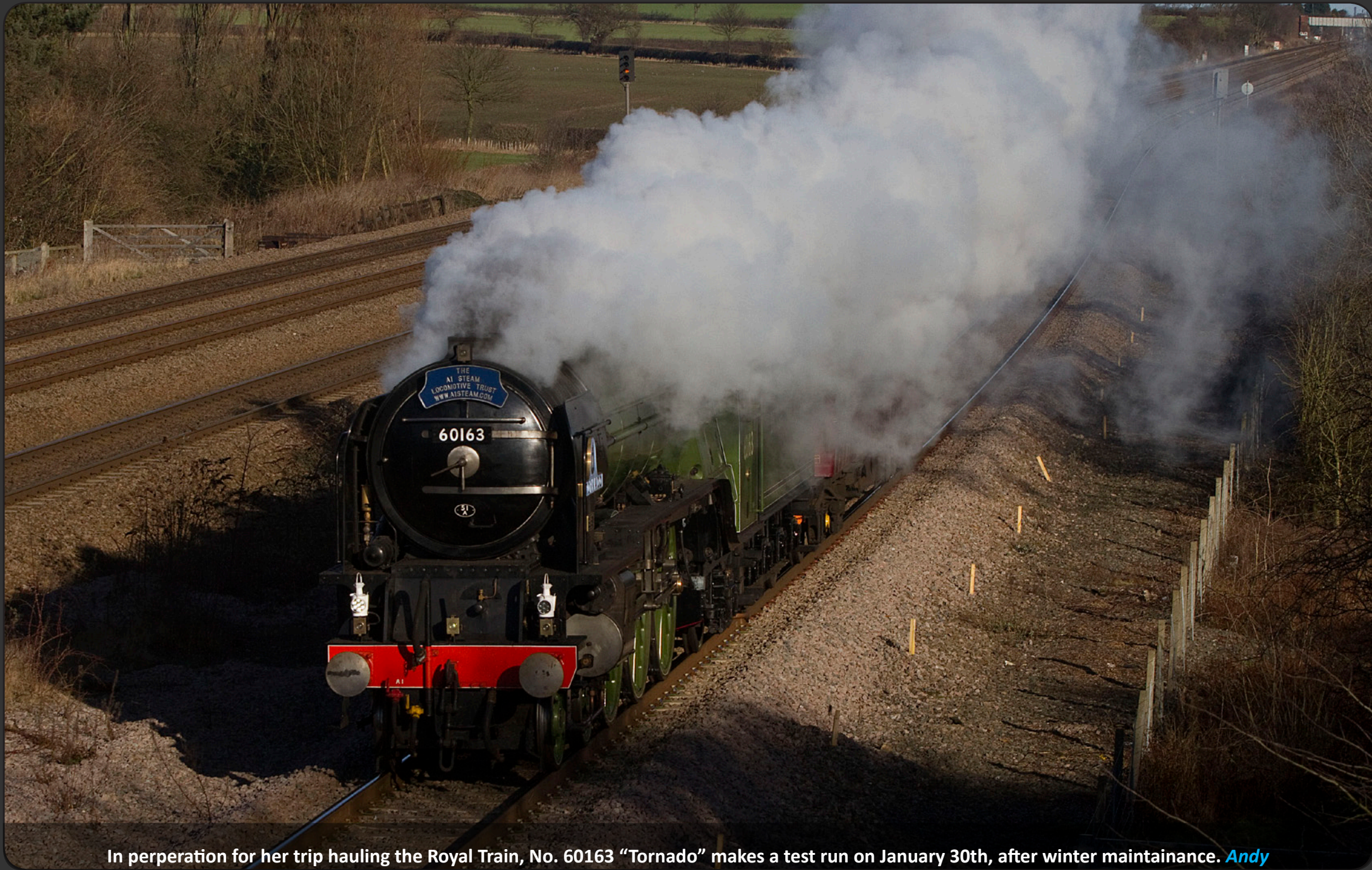
In preparation for her trip hauling the Royal Train, No. 60163 "Tornado" makes a test run on January 30th, after winter maintenance.