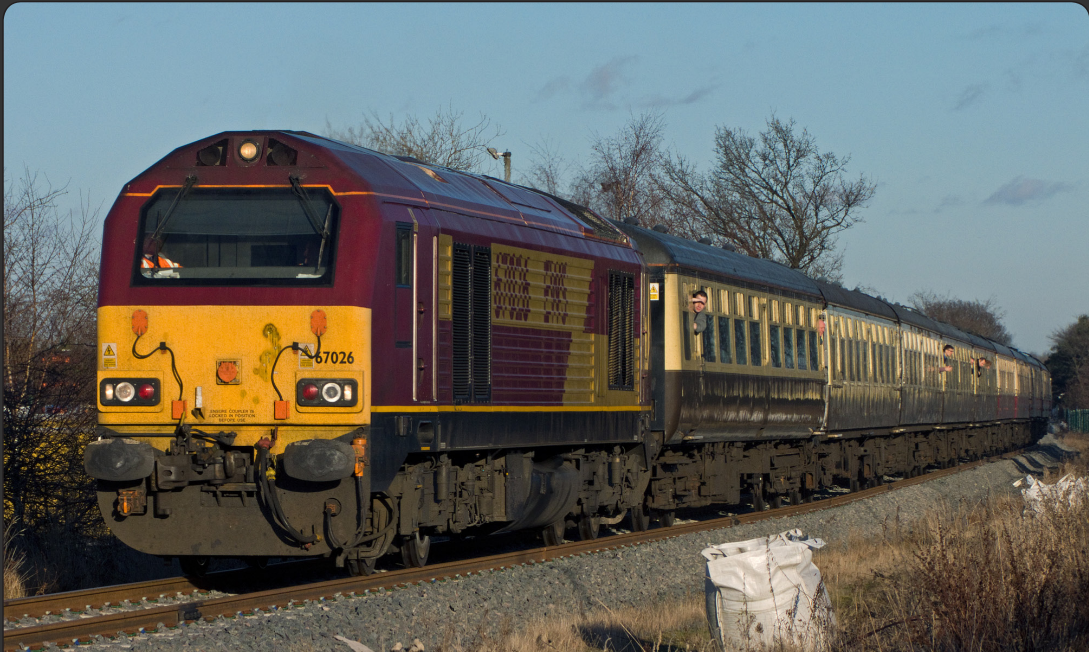
Another shot from UK Railtours "The Wellington Boot" from Woking to Donnington IRFT on January 30th. This is the return 1252 working with Class 67 026 leading as the train passes Hadley.