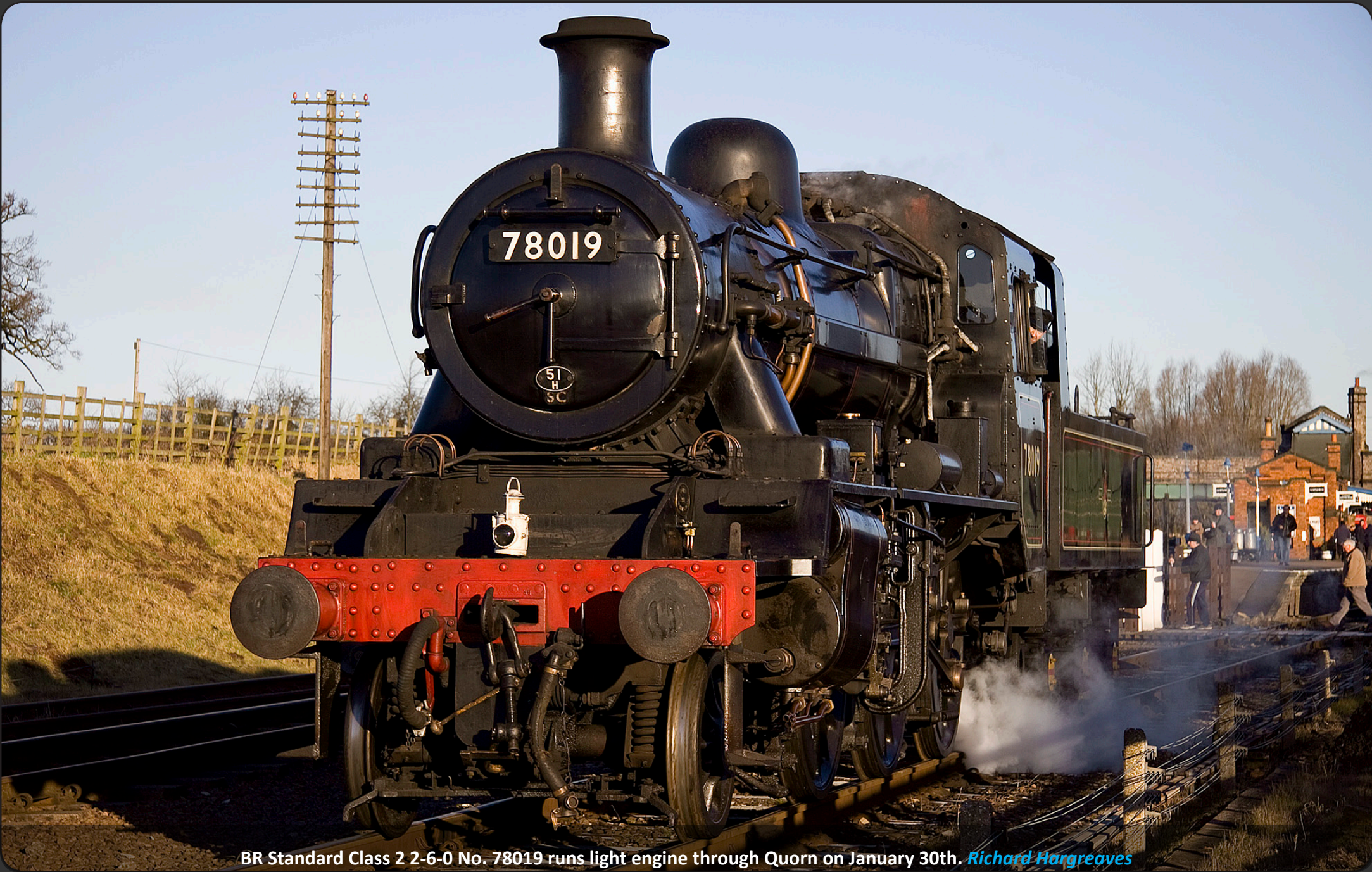
BR Standard Class 2 2-6-0 No. 78019 runs light engine through Quorn on January 30th. Richard Hargreaves