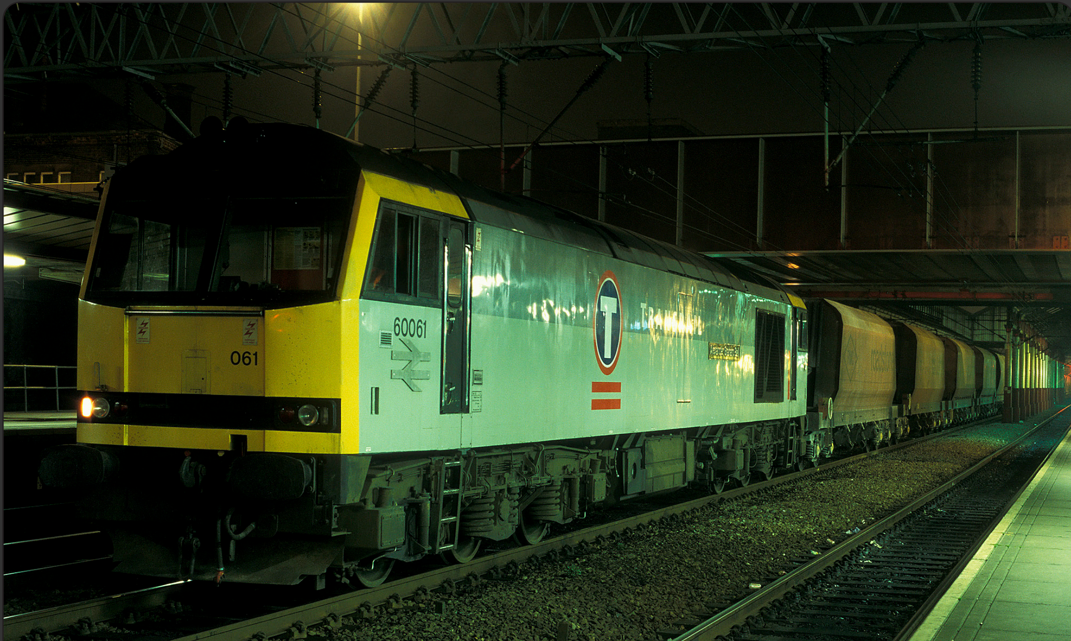
Crewe on December 9th 1995 and Transrail liveried Class 60 061 "Alexander Graham Bell" pauses in the station working the RMC Roadstone service to Buxton that was just one of many freight services that ran on a Saturday in this era.