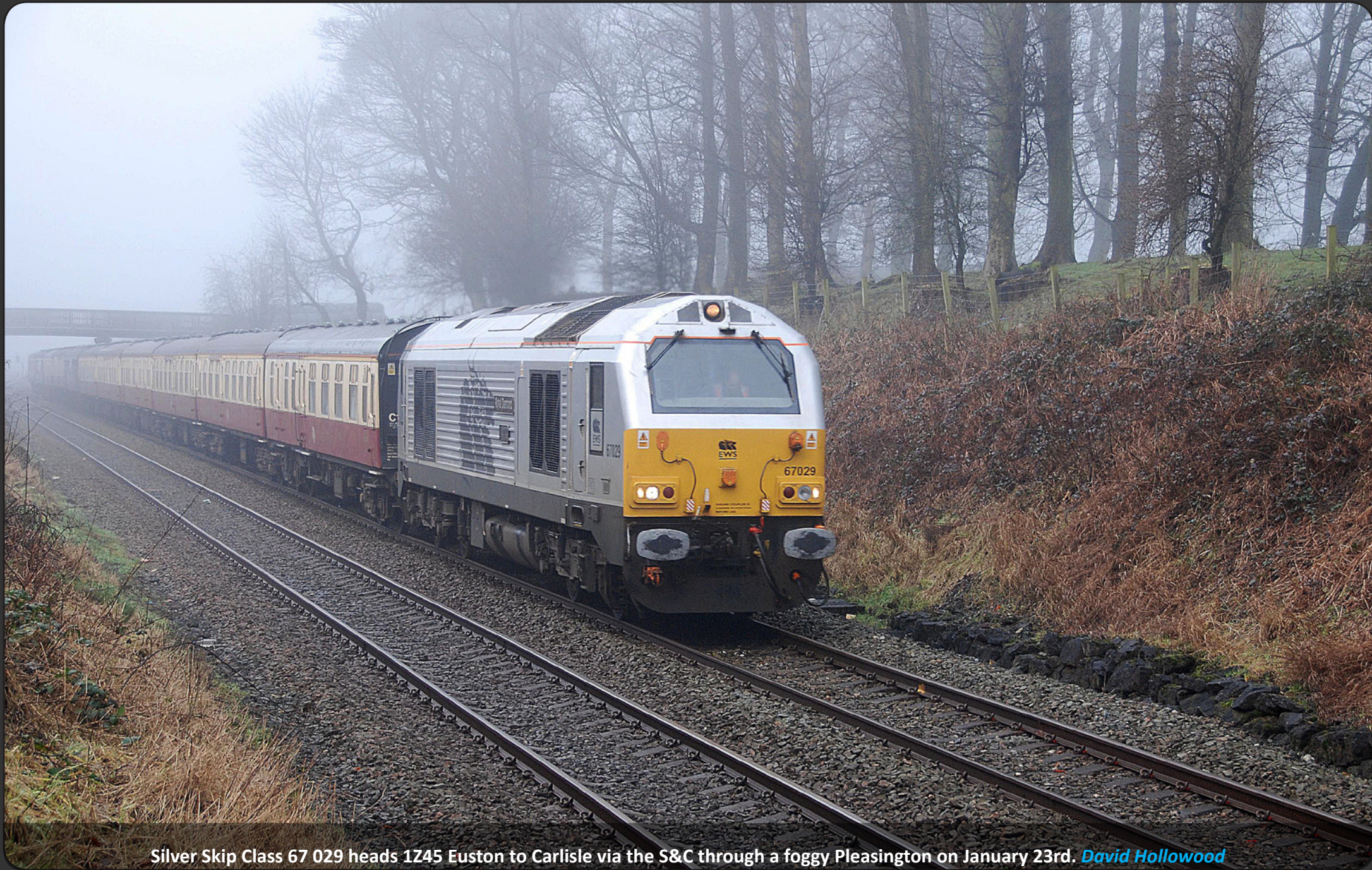
Silver Skip Class 67 029 heads 1245 Euston to Carlisle via the S&C through a foggy Pleasington on January 23rd. David Hollowood