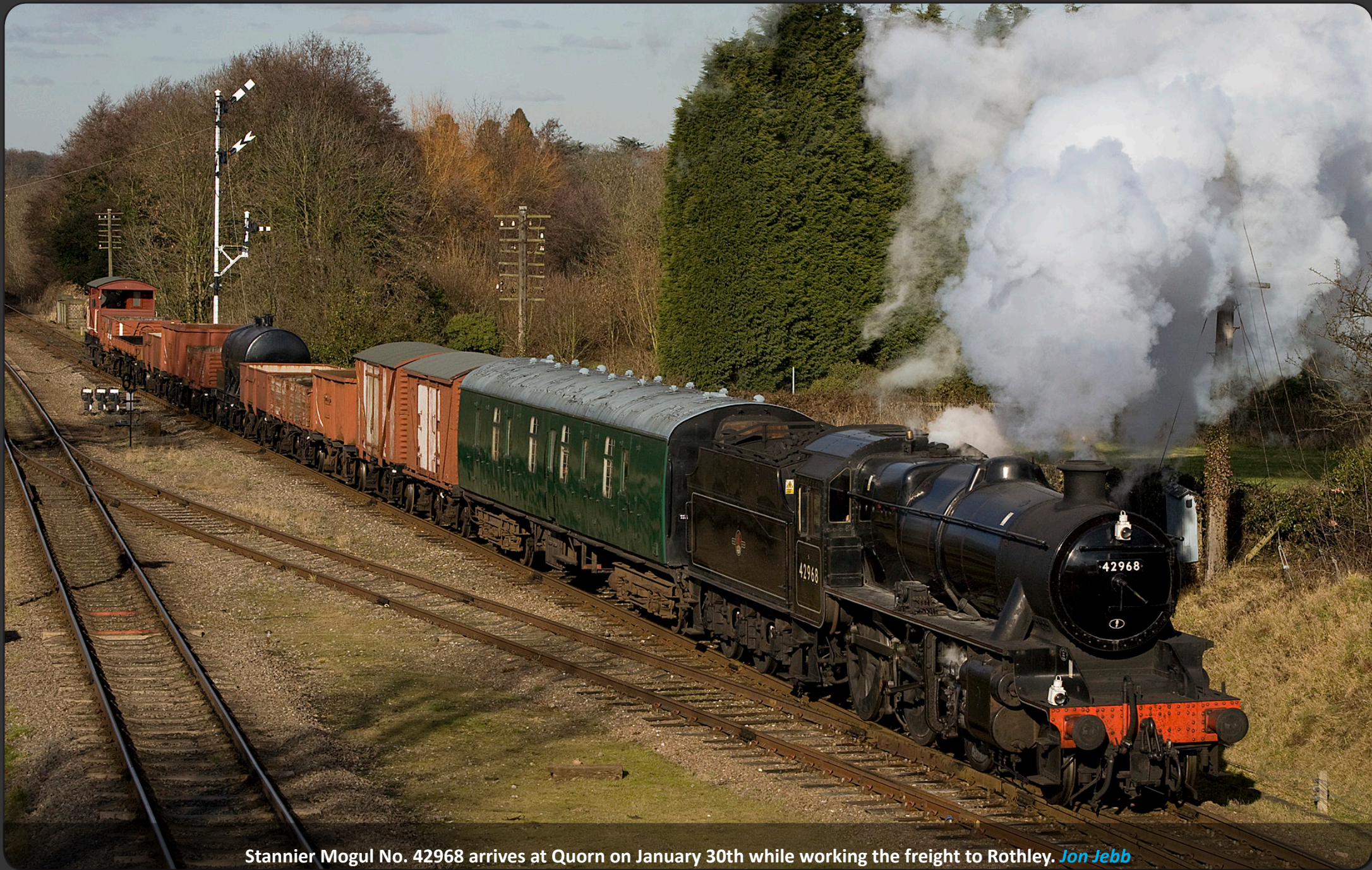
Stannier Mogul No. 42968 arrives at Quorn on January 30th while working the freight to Rothley.