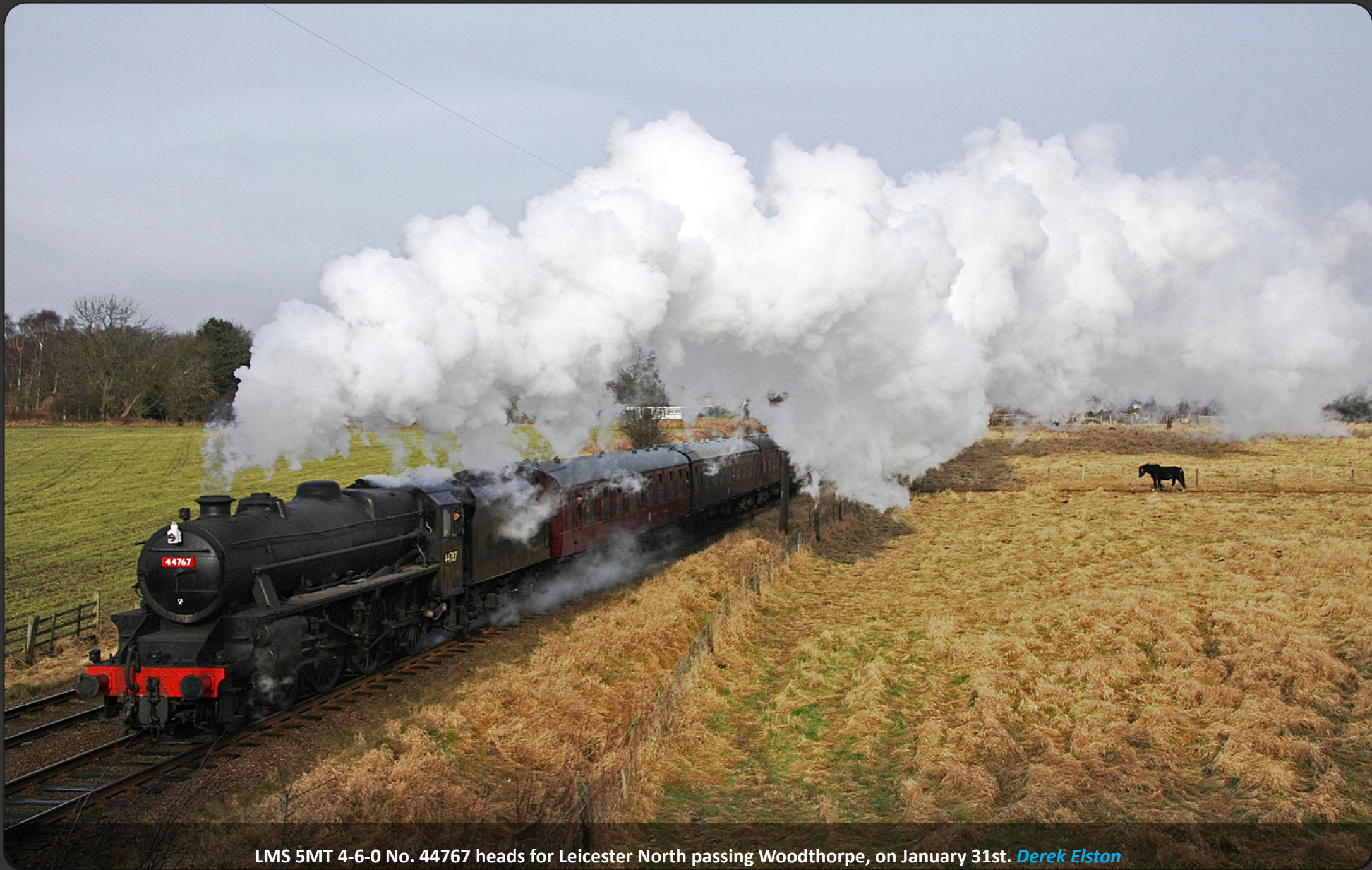
LMS 5MT 4-6-0 No. 44767 heads for Leicester North passing Woodthorpe, on January 31st. Derek Elston