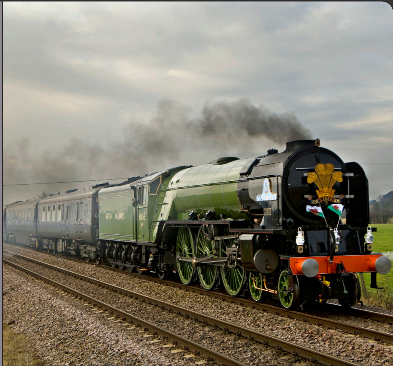
Photo: Tornado, the first new main line steam locomotive to be built in Britain for almost 50 years, first pulled the Royal Train on February 19th 2009, seen here passing Church Fenton.

Prince visits the amazing collection assembled by MOSI. This honour is recognition of the shared vision and determination of all of those who worked so hard over 19 years to bring Tornado into being and are now doing the same to keep her operating on the main line."