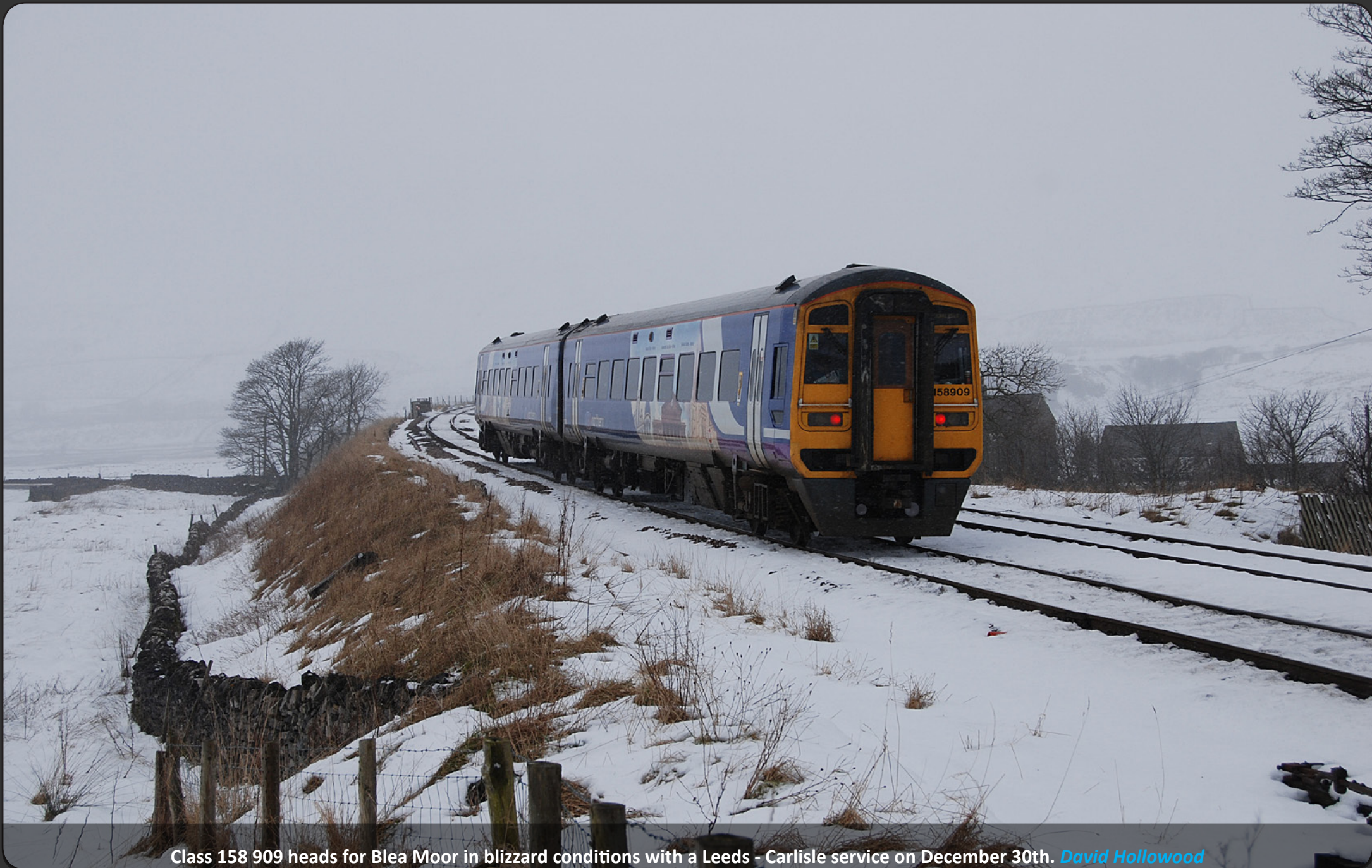
Class 158 909 heads for Blea Moor in blizzard conditions with a Leeds - Carlisle service on December 30th. David Hollowood