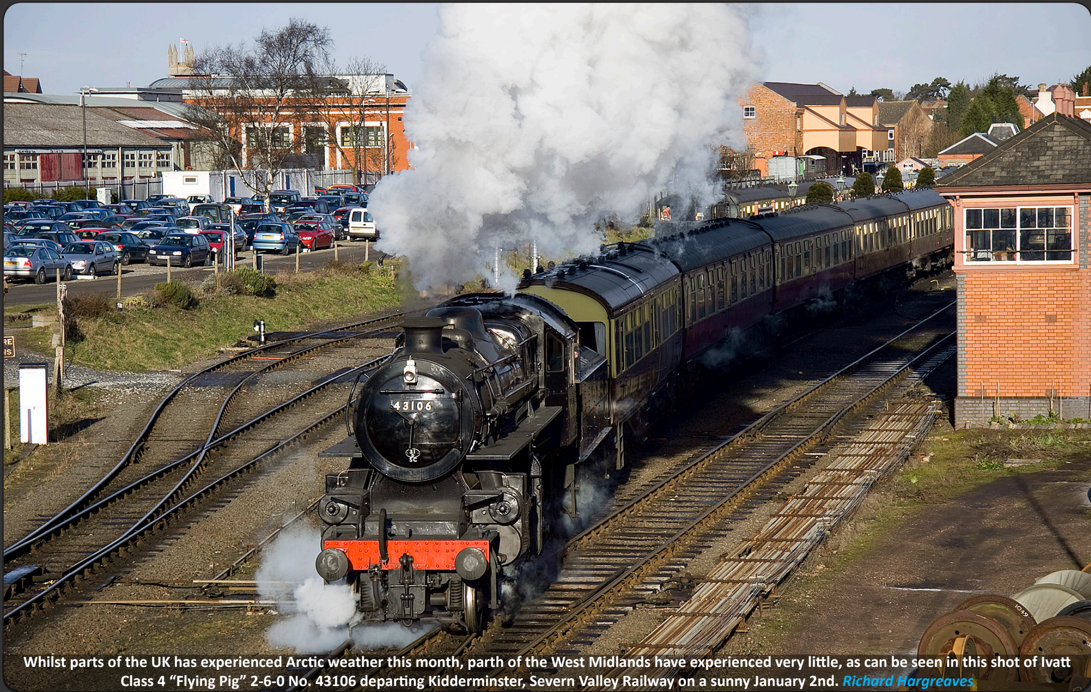
Whilst parts of the UK has experienced Arctic weather this month, part of the West Midlands have experienced very little, as can be seen in this shot of Ivatt Class 4 "Flying Pig" 2-6-0 No. 43106 departing Kidderminster, Severn Valley Railway on a sunny January 2nd.