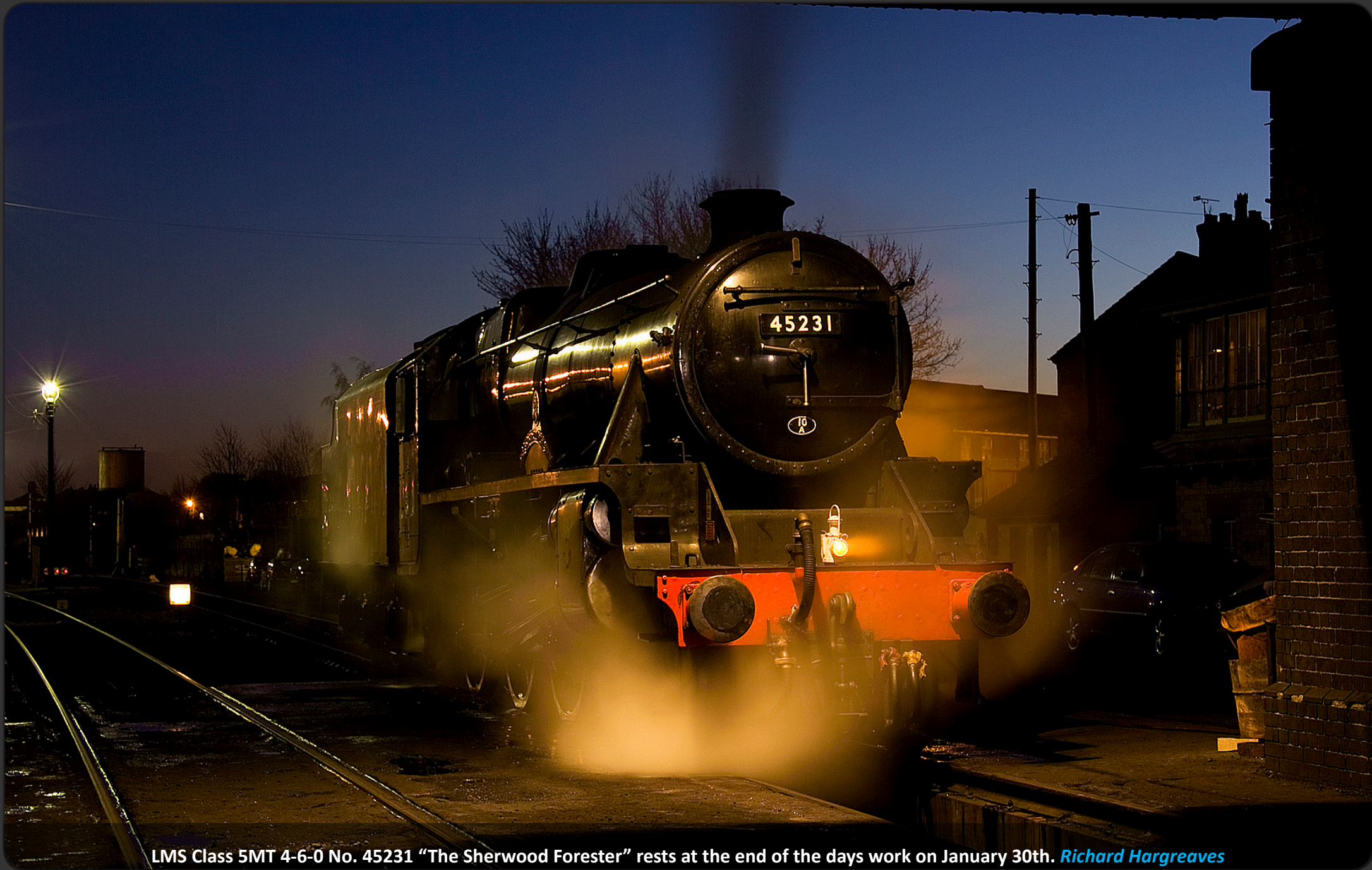
LMS Class 5MT 4-6-0 No. 45231 "The Sherwood Forester" rests at the end of the days work on January 30th.