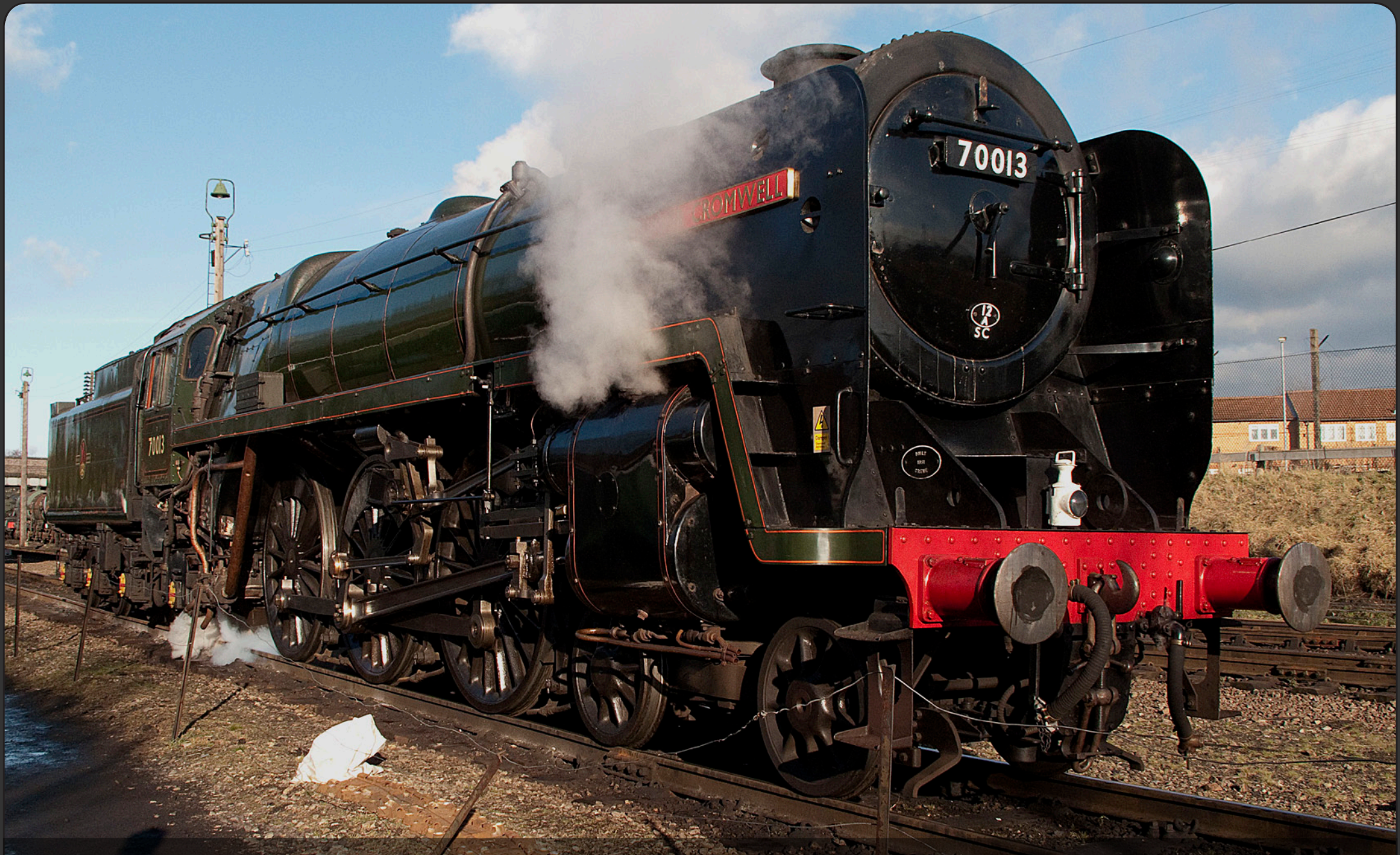
BR Class 7MT 4-6-2 No. 70013 "Oliver Cromwell" stands in the yard at Loughborough during the "Lostock and a few Smoking Barrels" event. Class47