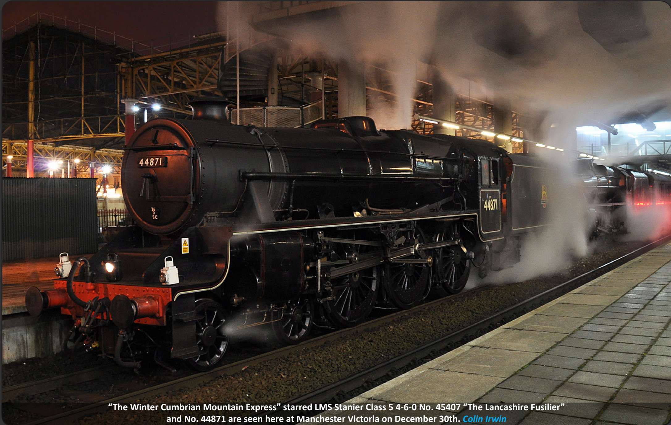
“The Winter Cumbrian Mountain Express” starred LMS Stanier Class 5 4-6-0 No. 45407 “The Lancashire Fusilier” and No. 44871 are seen here at Manchester Victoria on December 30th. Colin Irwin