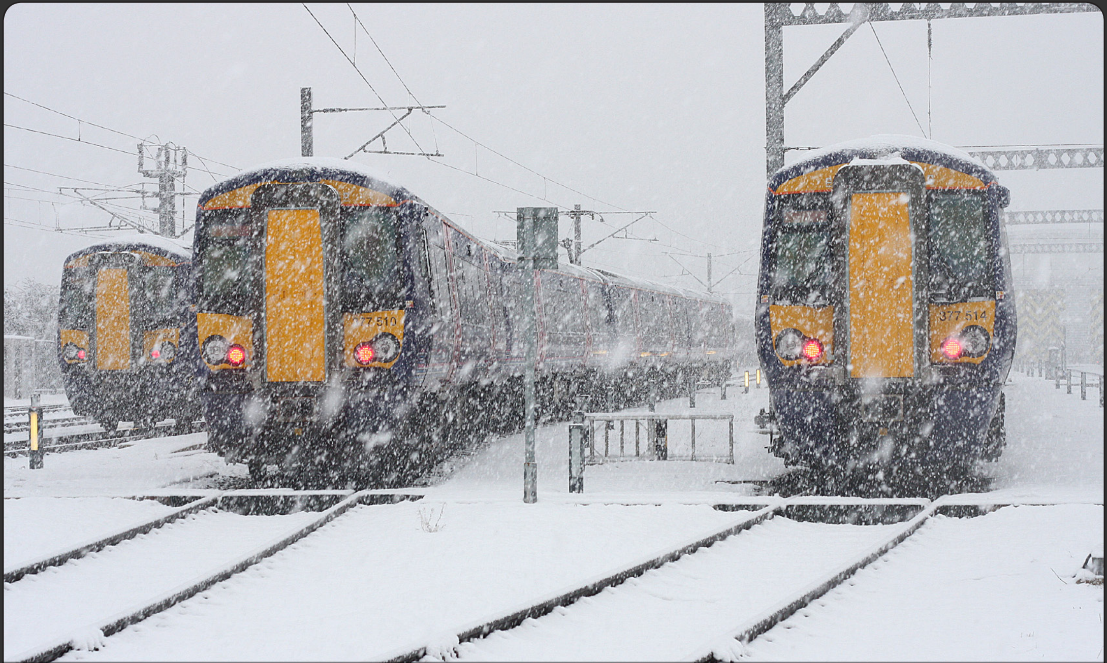
Two Class 377s, 519 and 514 are seen stabled at Cauldwell Depot during a heavy snow shower on January 6th. Class25