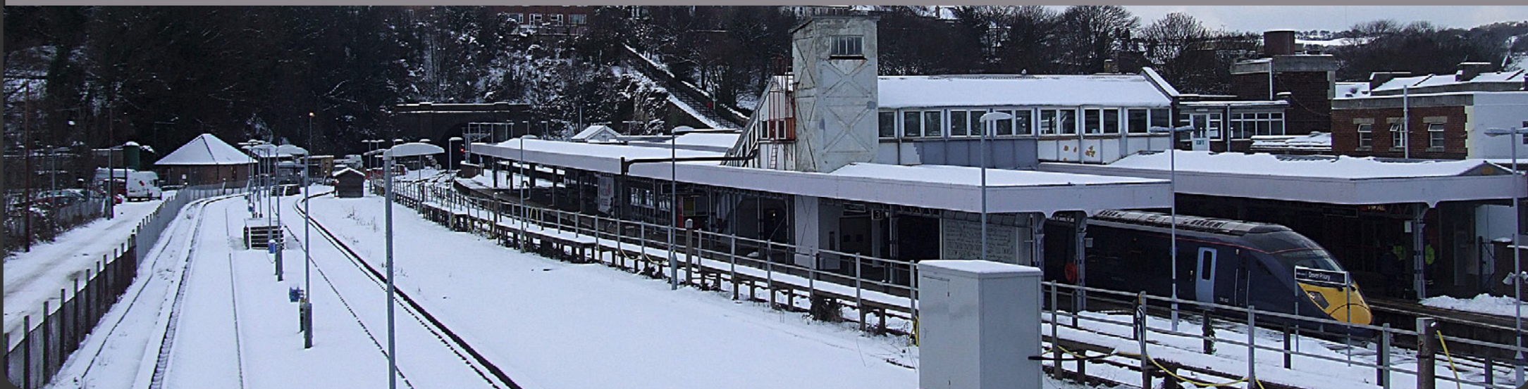
Photo: A Southeastern Train Class 395 waits at Dover in the snow on January 8th. Josh Watkins

Never pay over the odds again, and ask us if you need help! See you there.