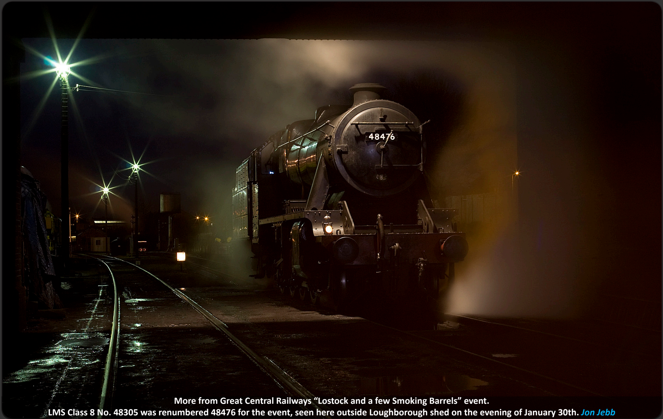
More from Great Central Railways "Lostock and a few Smoking Barrels" event.