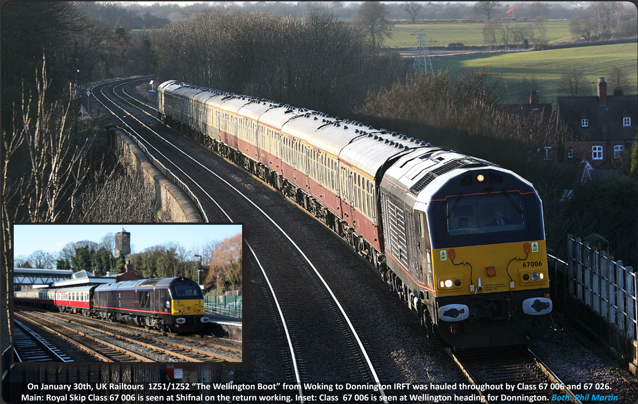
On January 30th, UK Railtours 1251/1252 "The Wellington Boot" from Woking to Donnington IRFT was hauled throughout by Class 67 006 and 67 026. Main: Royal Skip Class 67 006 is seen at Shifnal on the return working. Inset: Class 67 006 is seen at Wellington heading for Donnington.