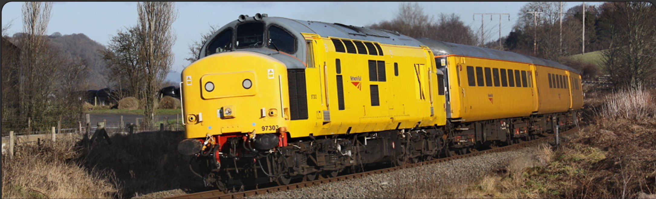
Above: On January 23rd, Class 97 303 heads around Penarth curve, just to the west of Abermule, with 1Z12 11:57 Sutton Bridge Junction to Machynlleth Serco radio survey train. 97 304 "John Tiley" was pushing on the back.