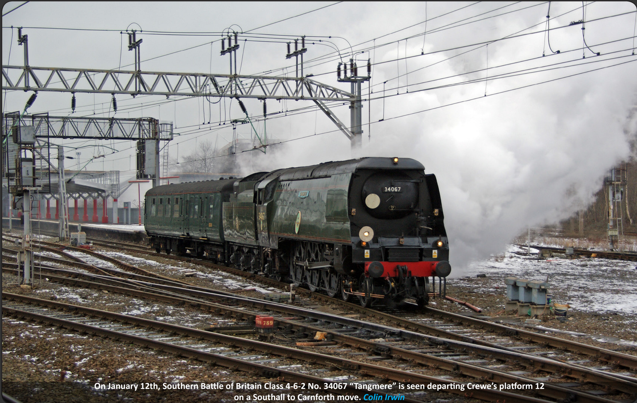
On January 12th, Southern Battle of Britain Class 4-6-2 No. 34067 "Tangmere" is seen departing Crewe's platform 12 on a Southall to Carnforth move. Colin Irwin