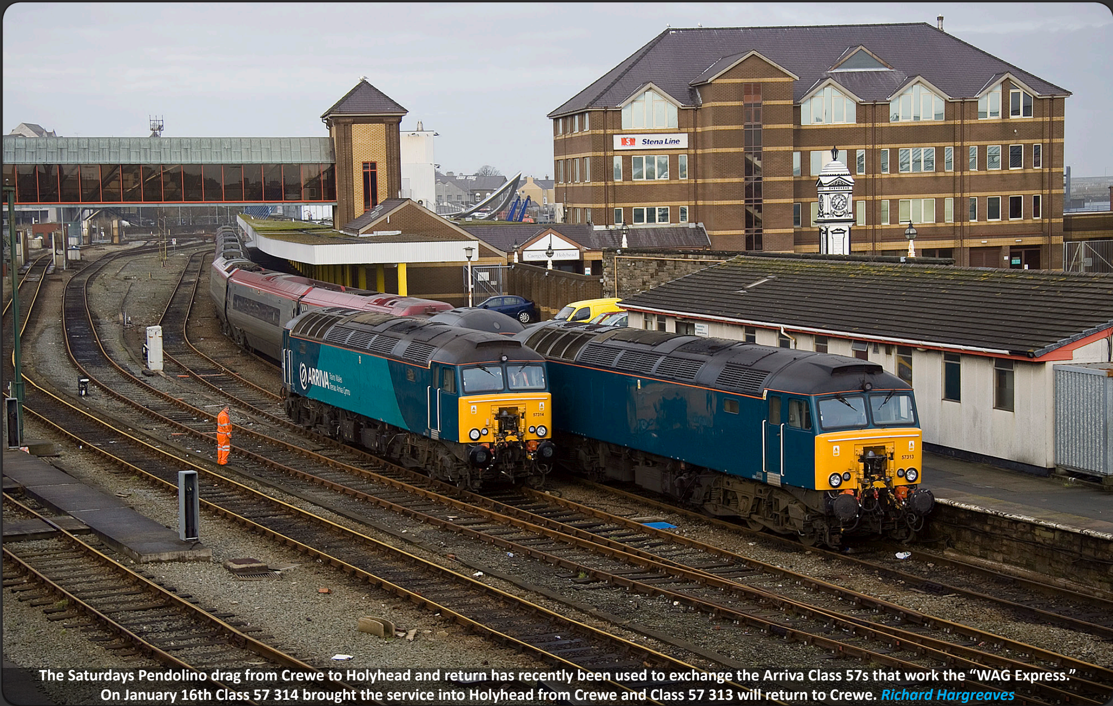
The Saturdays Pendolino drag from Crewe to Holyhead and return has recently been used to exchange the Arriva Class 57s that work the "WAG Express." On January 16th Class 57 314 brought the service into Holyhead from Crewe and Class 57 313 will return to Crewe.