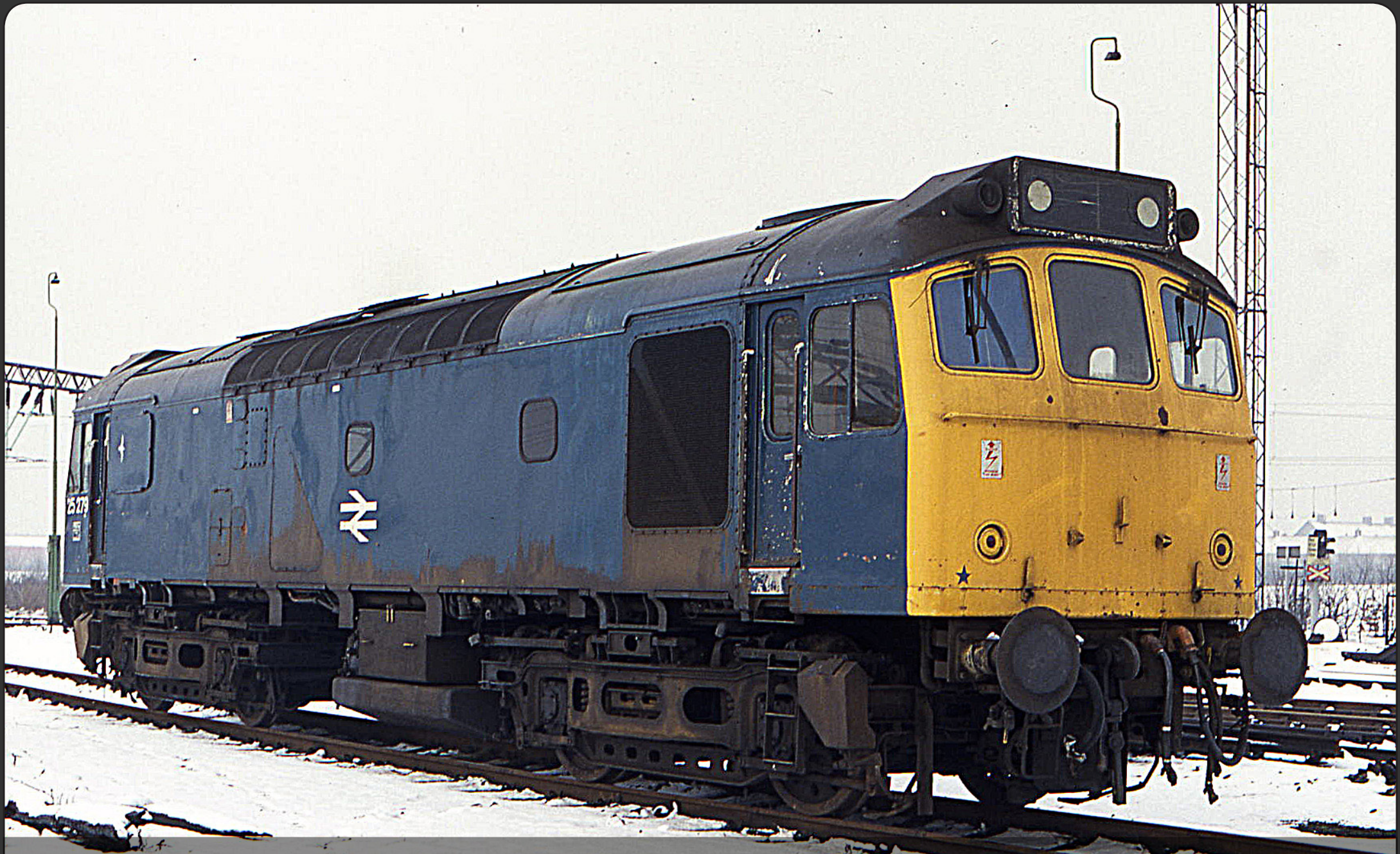
Inspired by the present snowy weather, Class 25 279 is pictured stabled in Speke Yard, Liverpool during a visit to the area on 8th March 1987. Derek Hopkins