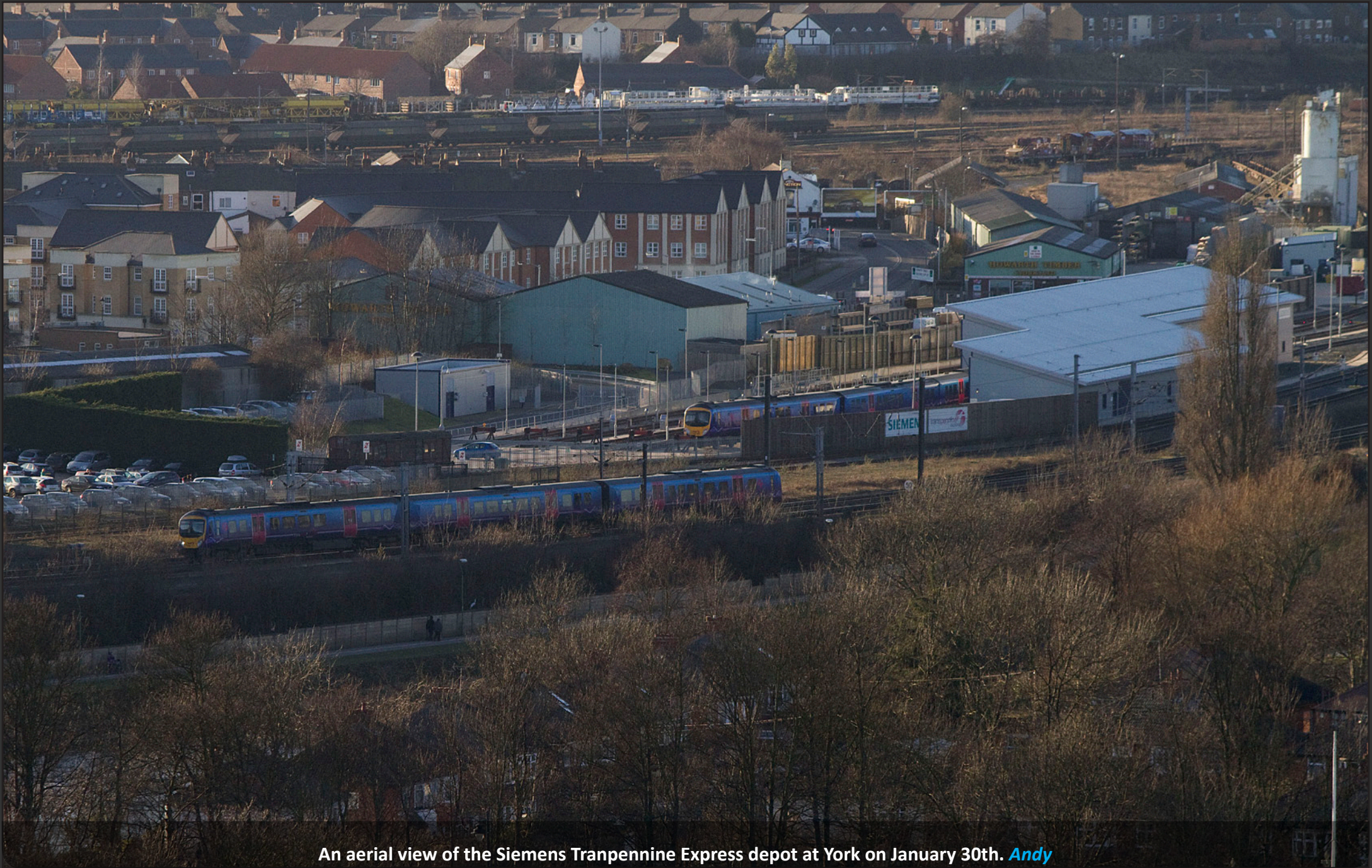
An aerial view of the Siemens Transpennine Express depot at York on January 30th. Andy