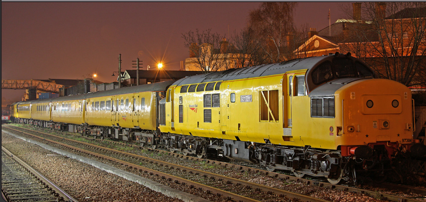
Left: Network Rail Class 97 303 and 97 304 are seen at Shrewsbury on the evening of January 25th with the Radio Test Train. Phil Martin