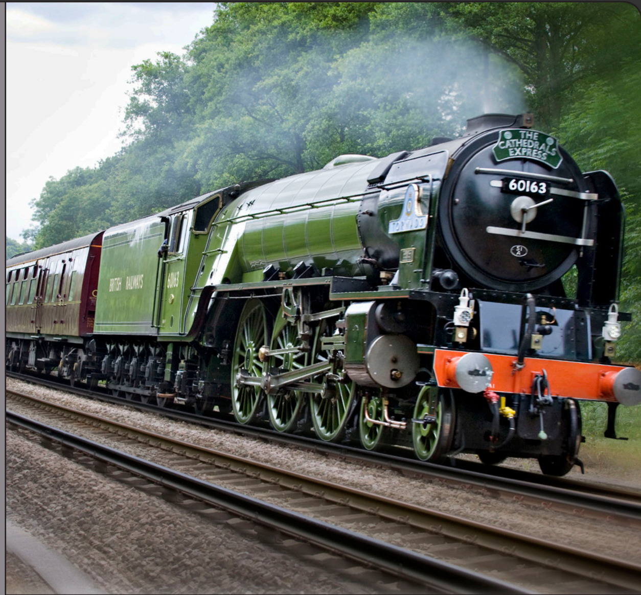
Photo: Tornado is captured at speed hauling a previous "Cathedrals Express" service during 2009.

A variety of gifts featuring Tornado, ranging from models of the locomotive to DVDs and books about her construction are available from the Trust's on-line shop at www.a1steam.com .