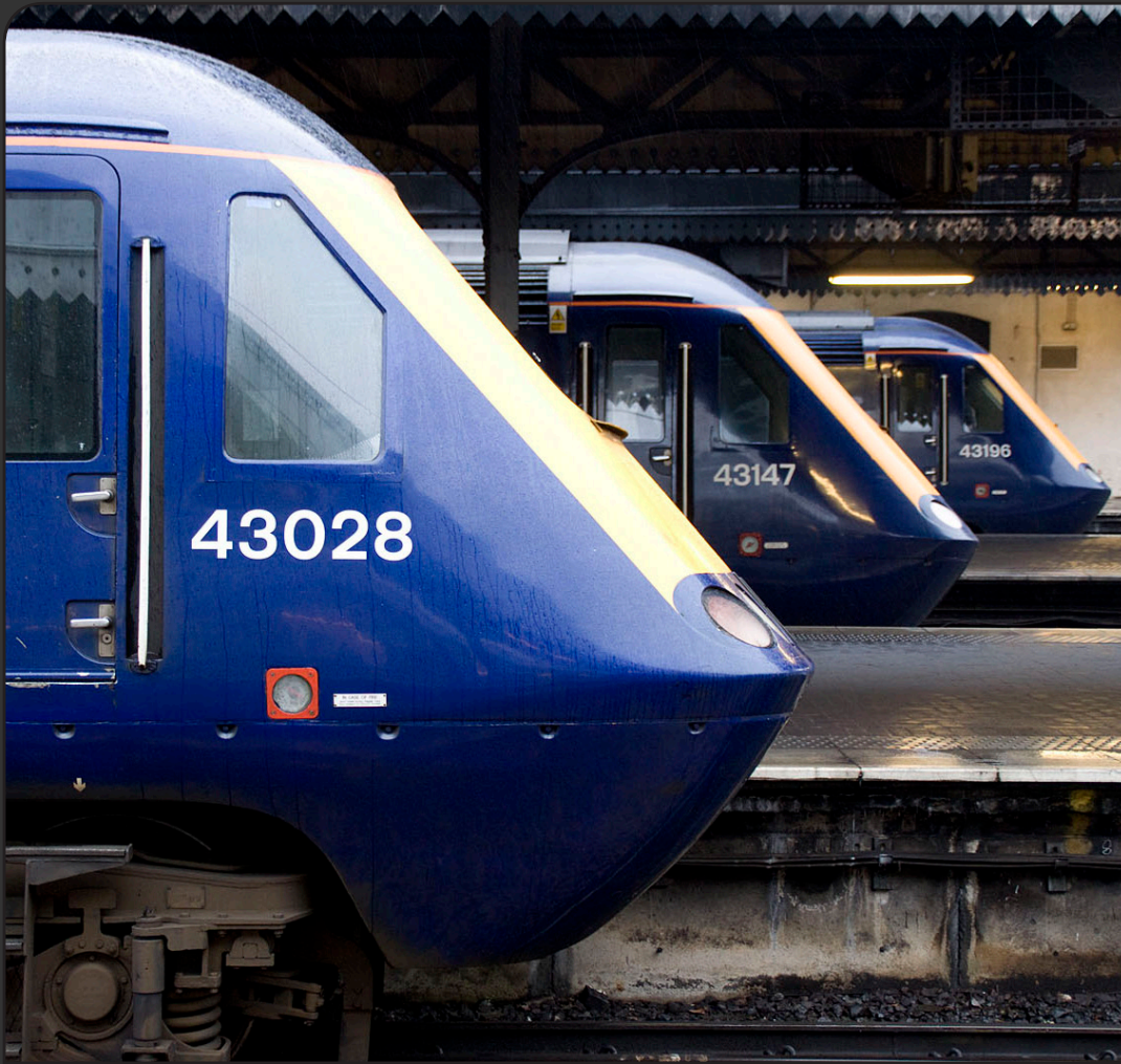
Above: FGW's 43028, 43147 and 43196 line up at Paddington on December 30th.