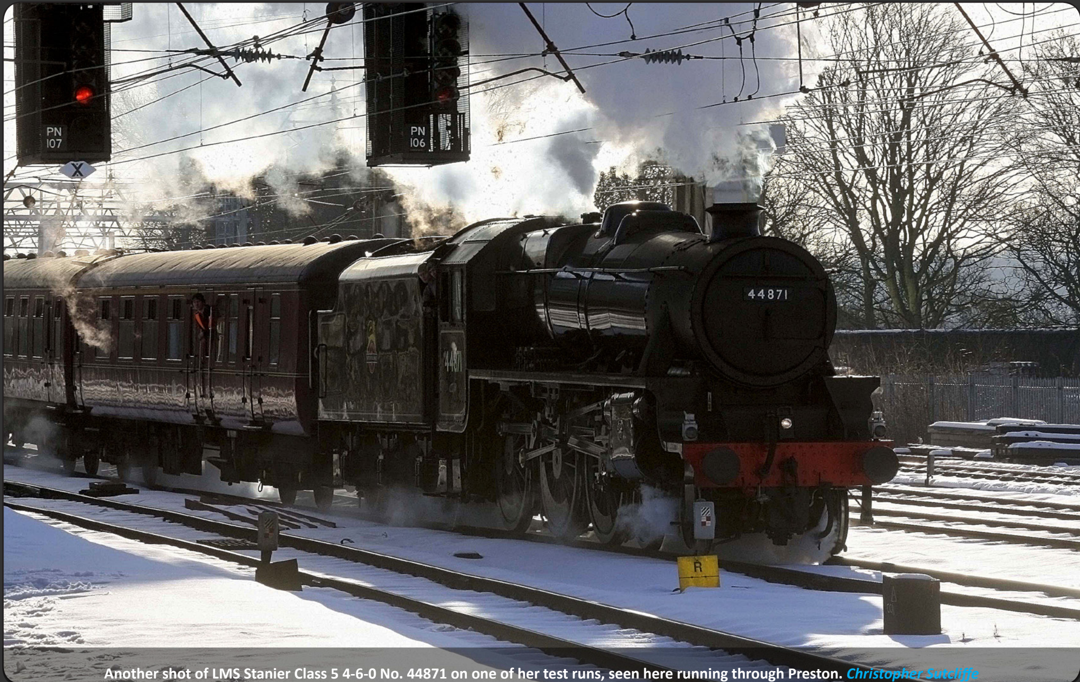
Another shot of LMS Stanier Class 5 4-6-0 No. 44871 on one of her test runs, seen here running through Preston. Christopher Sutcliffe