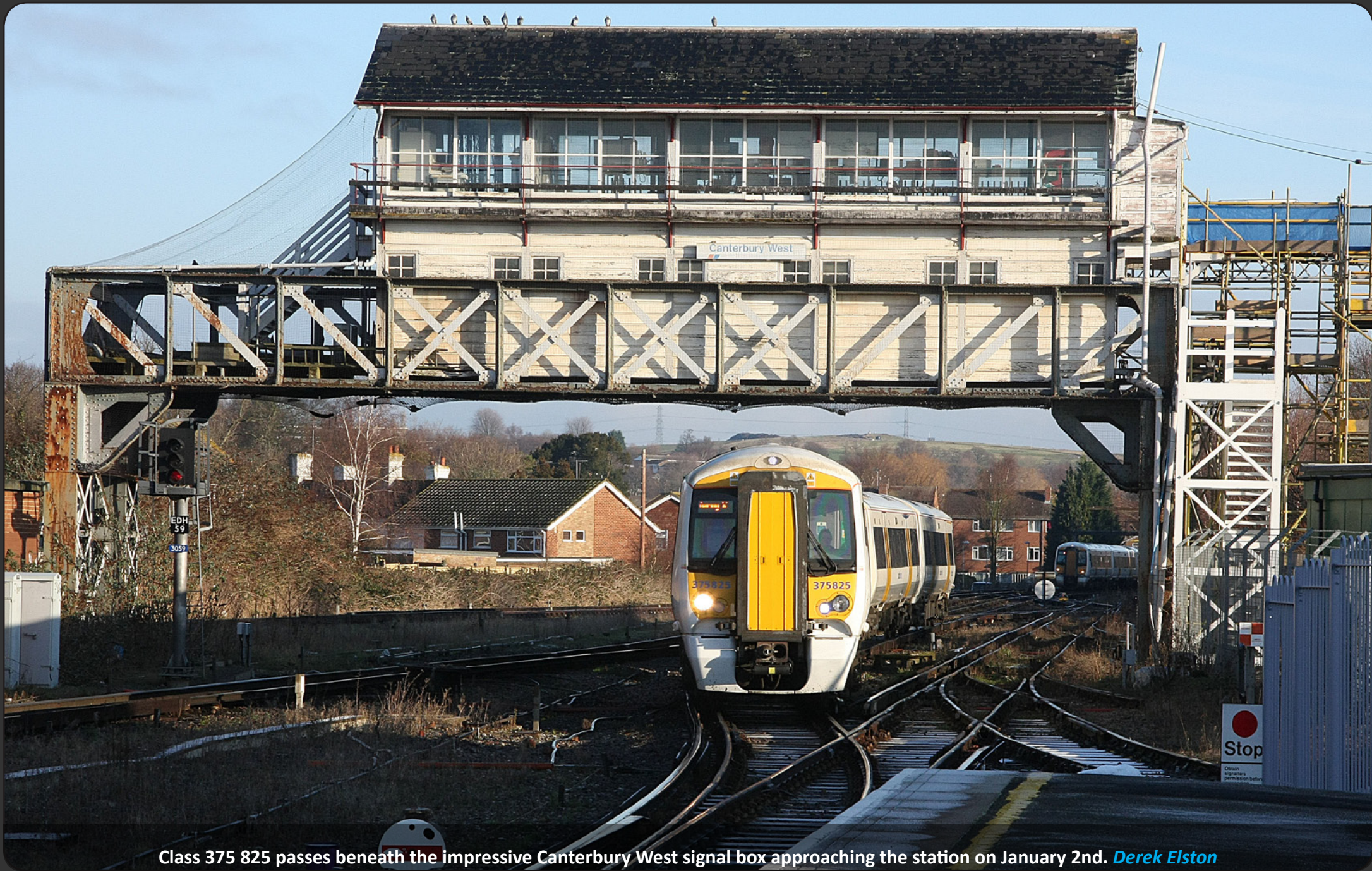
Class 375 825 passes beneath the impressive Canterbury West signal box approaching the station on January 2nd. Derek Elston