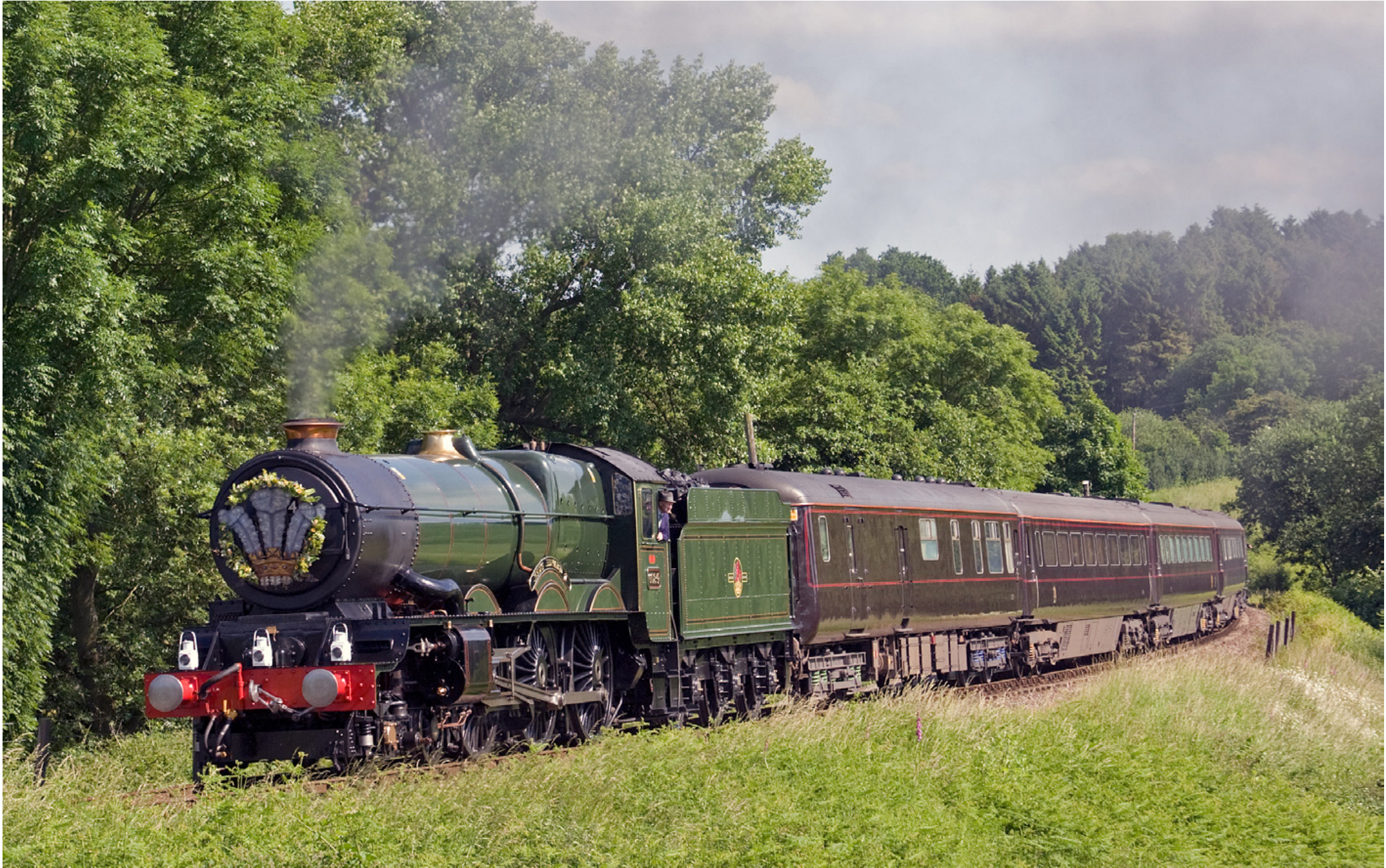
On the occasion of HRH Prince Charles visiting the Severn Valley Railway on the 10th June, 6024 hauled the Royal Train from Kidderminster - Bridgnorth and is seen passing Hay Bridge. Carl Grocott