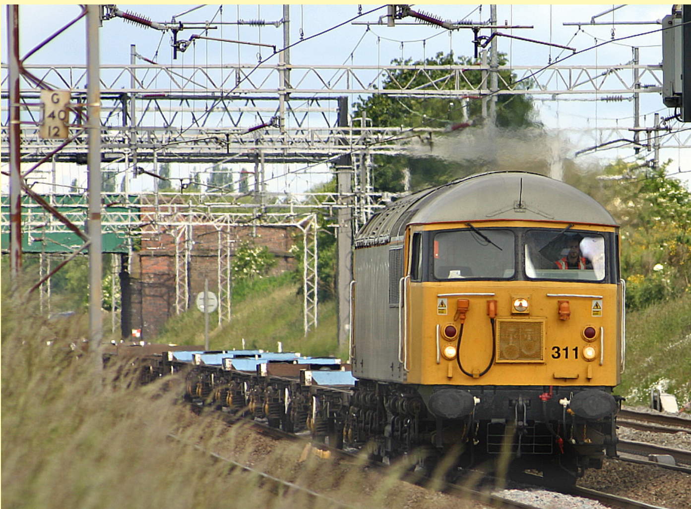
Left: Recently returned to traffic and working for Fastline Freight, Class 56 311 thunders past Heamies Farm on the 20th June.