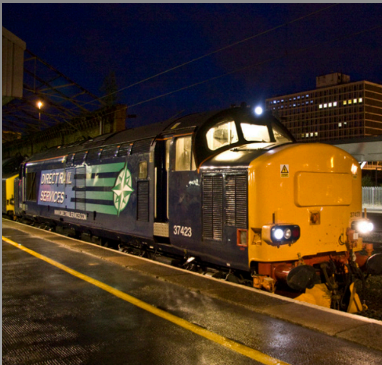
Above: DRS Class 37s 37 606 & 37 423 on the outward Spitfire Railtours 'Paignton Pudden' special from Crewe to Paignton on the 21st June.