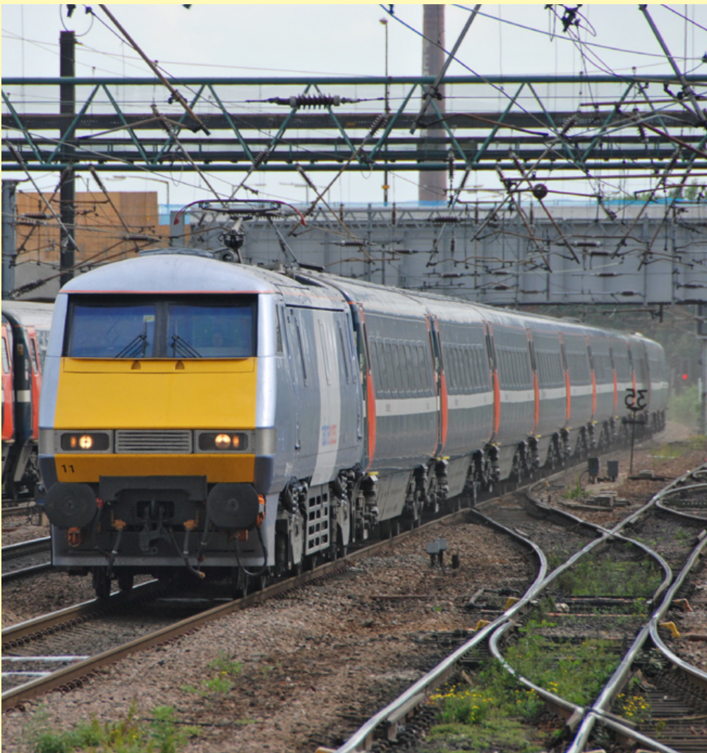
Above: Recently outshopped in the new National Express livery, Class 91 111 approaches Doncaster on the 24th June. Ian Furness