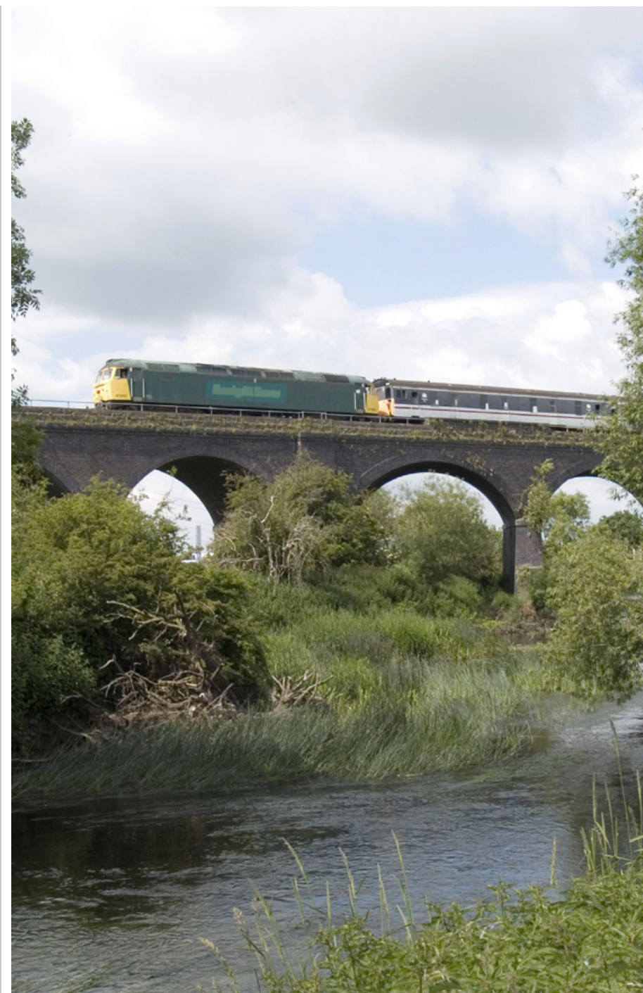
Class 47 292 at the Great Central (North) Diesel Gala