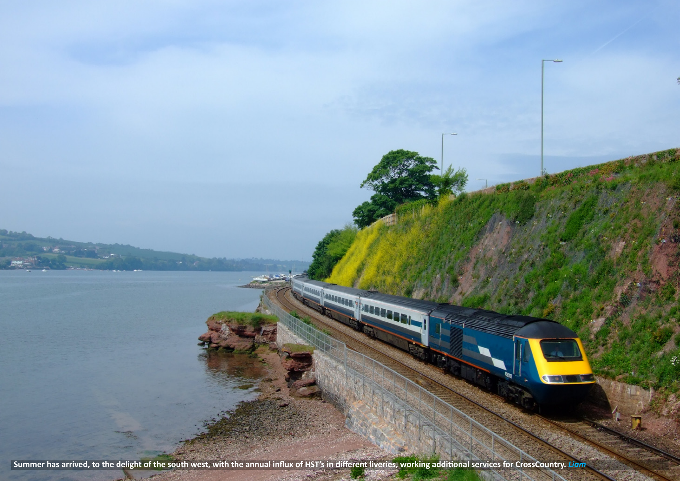
Summer has arrived, to the delight of the south west, with the annual influx of HST's in different liveries, working additional services for CrossCountry. Liam