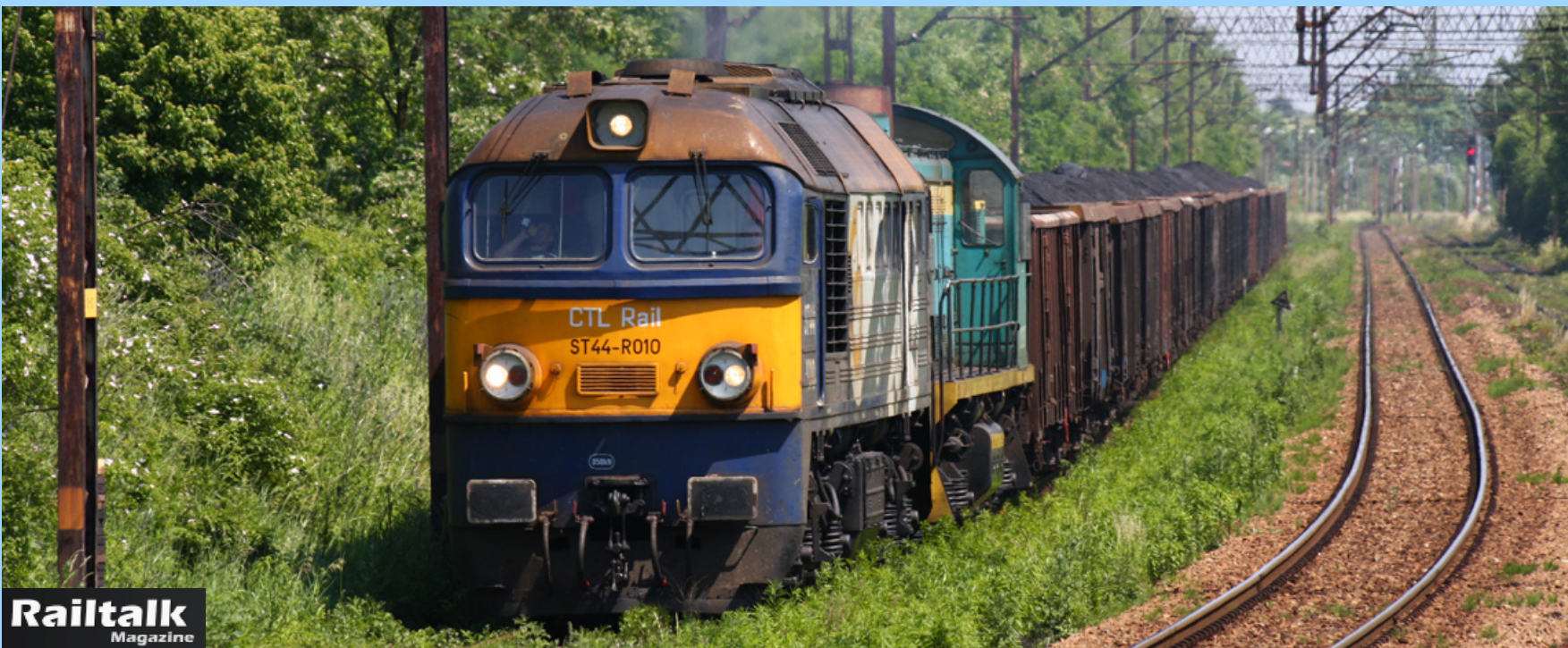
Left: ST 44 - R010 and Tem 2 - 017 passes Naklo with a loaded coal train from Pikary Slaskie Yard on the 10th June. Tem 2 - 017 was seen earlier in the day with flames coming from the engine's bonnet.