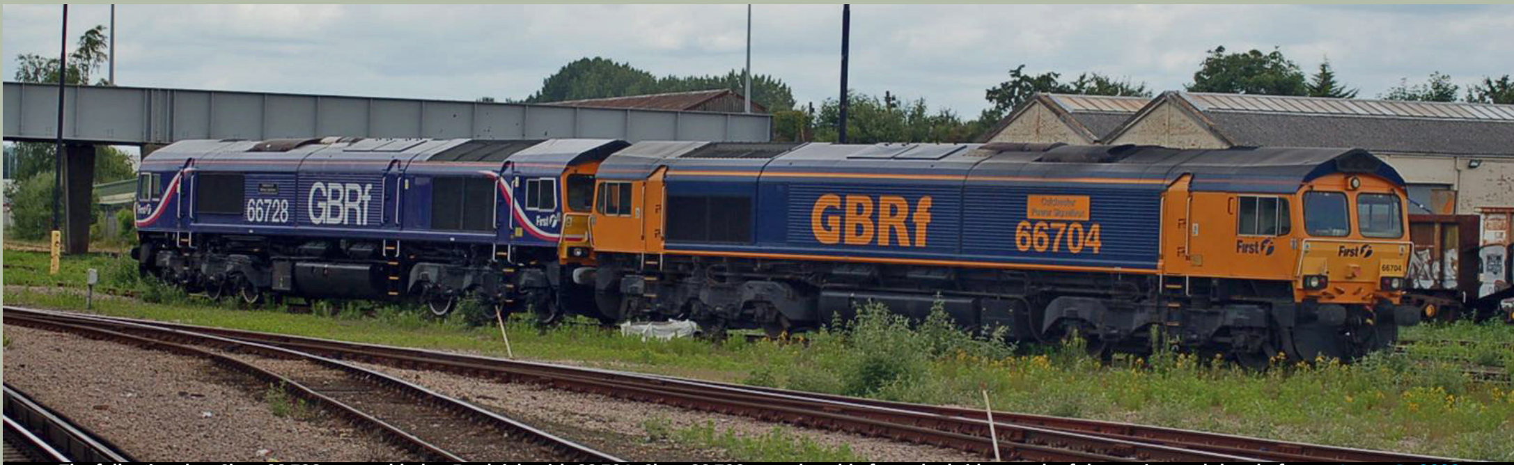
The following day, Class 66 728 was stabled at Eastleigh with 66 704. Class 66 728 was photable from the bridge north of the station and the platforms. James P. 2008