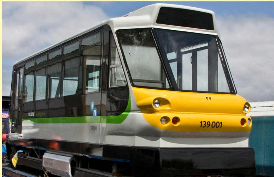
Top Left: This is the future, we are told. London Midland take delivery of their first Class 139 001, for use on the Stourbridge Jct line. Class47