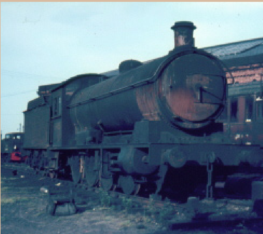
Above: Raven 0-8-0 Q6 63455 is seen at Tyne Dock Shed on the 25th July 1967.