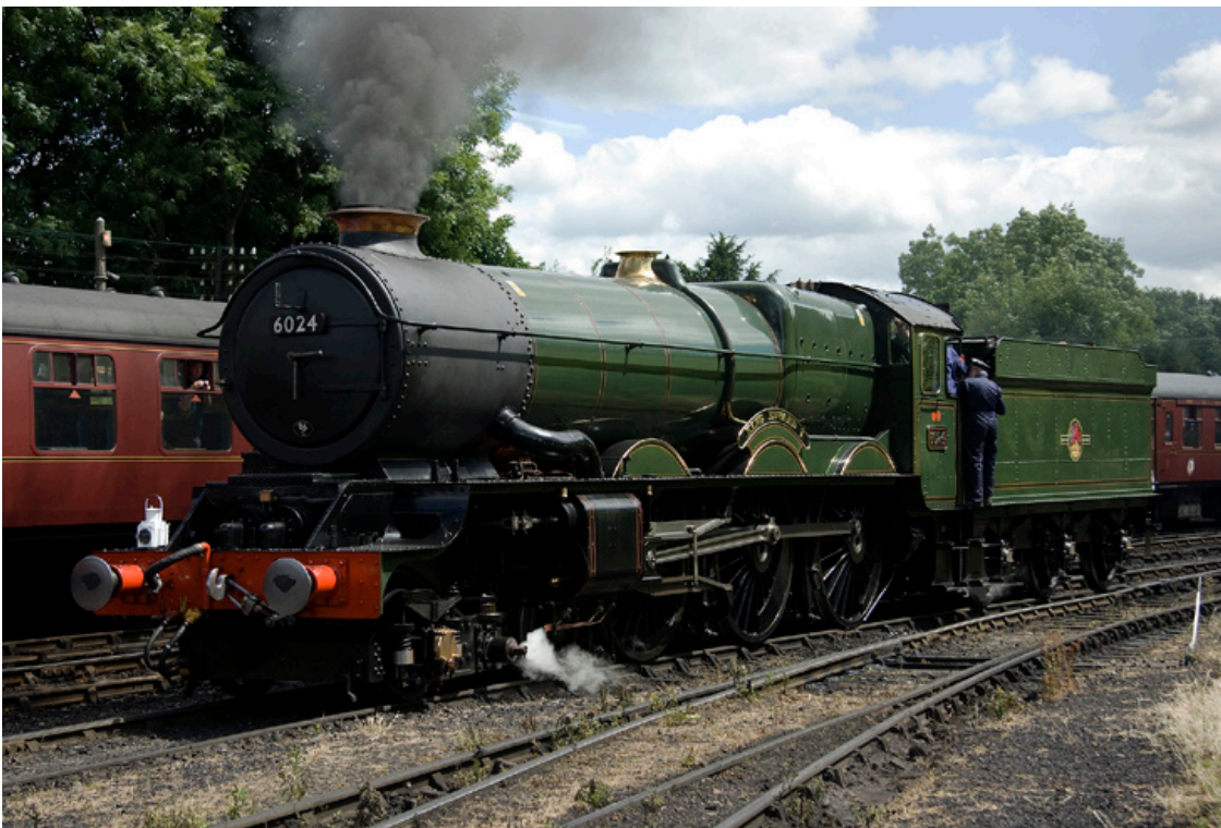
Top Left: Great Western “King” 6024 runs round its train at Bridgenorth, Severn Valley Railway on the 15th June.