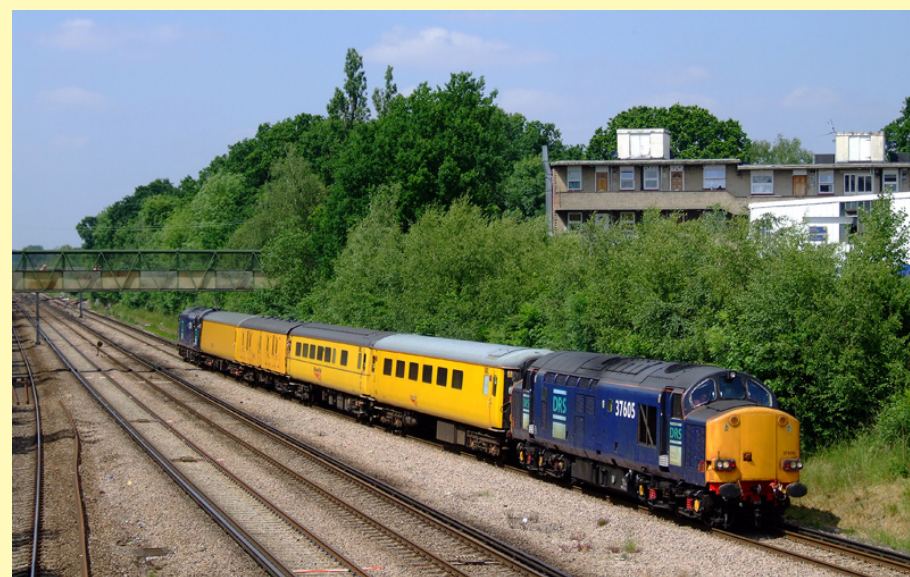
Below: Class 37 605 heads towards Orpington on one of the last trips of the day seen here at Petts Wood, 10th June. Tom Loader