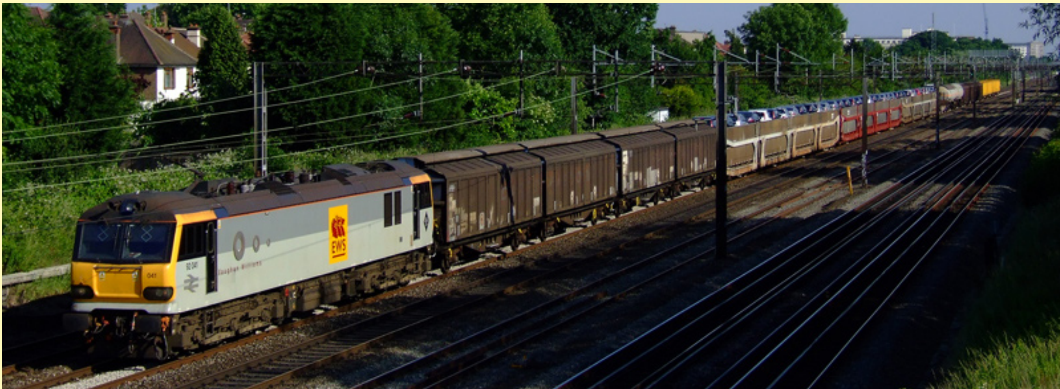
Above: EWS branded Class 92 041 leads various wagons up the West Coast Main Line in the sun on the 4th July.