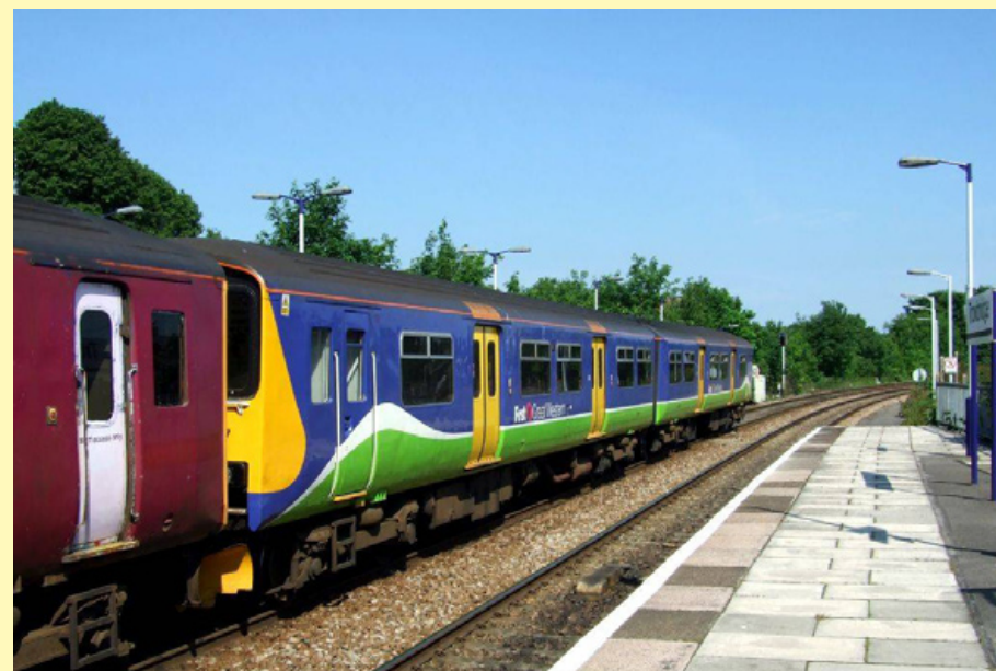
Left: Class 334 002 is seen approaching Bowling station working the 11.40 2F75 Motherwell - Balloch on the 15th June. Above: On the 8th June Class 150 127 and 150 233 work the 09.35 Frome - Bristol TM.