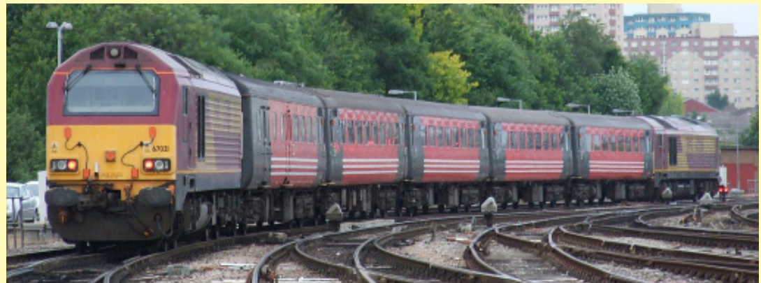
Below: Class 67 021 and 67 026 depart Bristol having worked the 1655 Weymouth-Bristol, pictured here heading to the depot. Liam