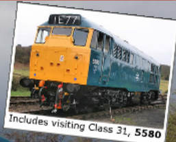
Includes visiting Class 31, 5580

Featuring D8137, 24081, 37215, 37324, 47105, 73129 and VISITING Class 31, 5580!