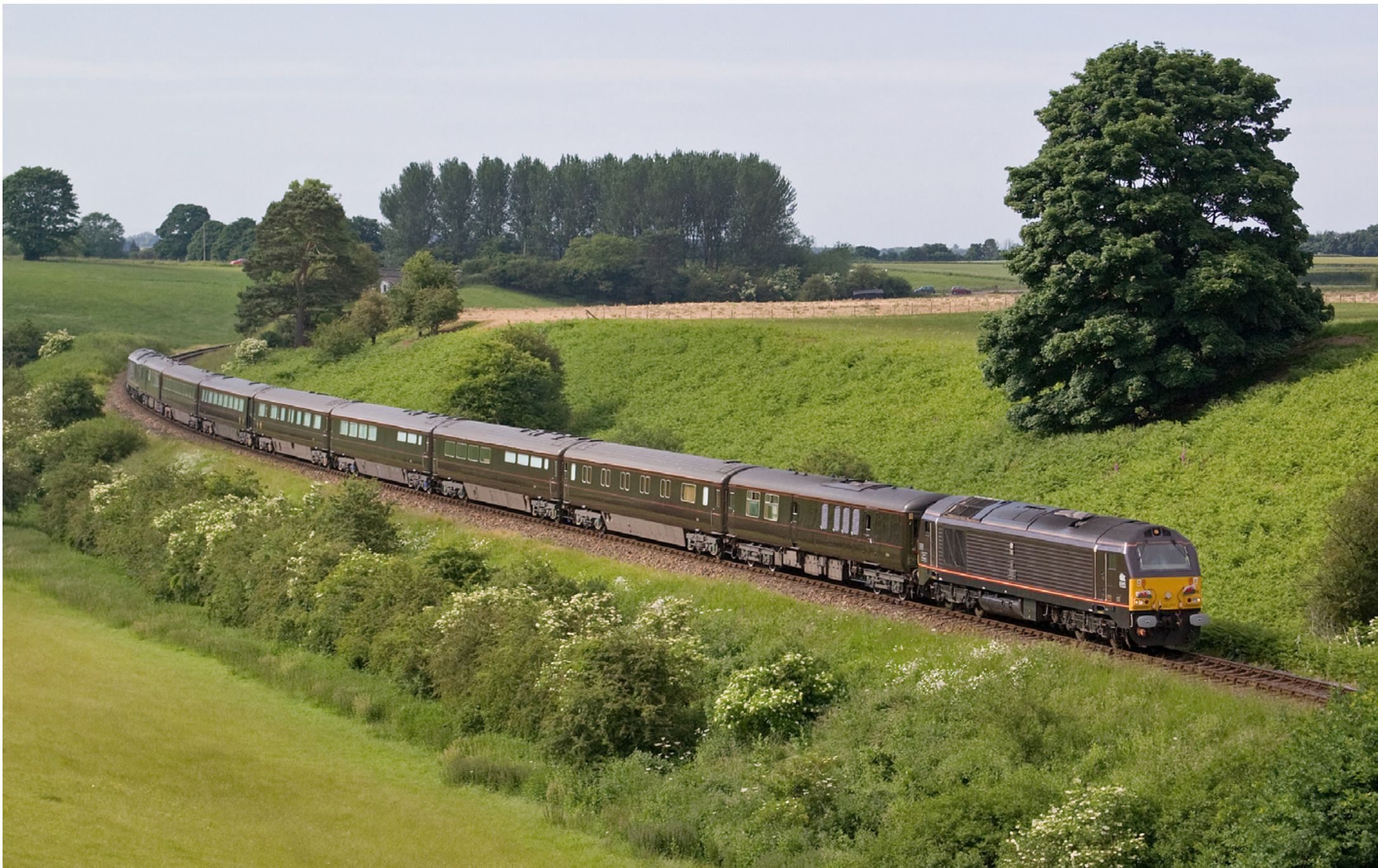
Another shot of the Royal Train on the 10th June, this time it's Class 67 005 and 67 006 working Bridgnorth - London seen passed Eardington. Carl Grocott