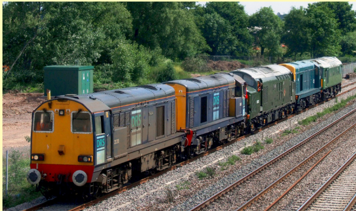
Bottom Right: DRS Class 20s 20 313 & 20 310 hauling SDR based locos D6737, 20 110 & D7612 onto the WSR at Norton Fitzwarren for the WSR's mixed traffic gala, on the 10th June.