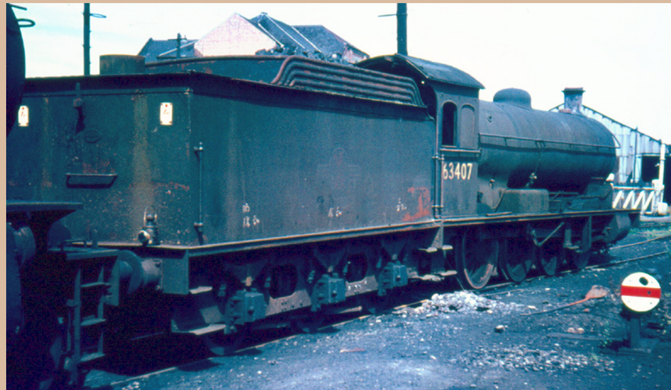
Top Right: Another Raven Q6, this time it is 63407 seen at West Hartlepool also on the 25th July 1967.