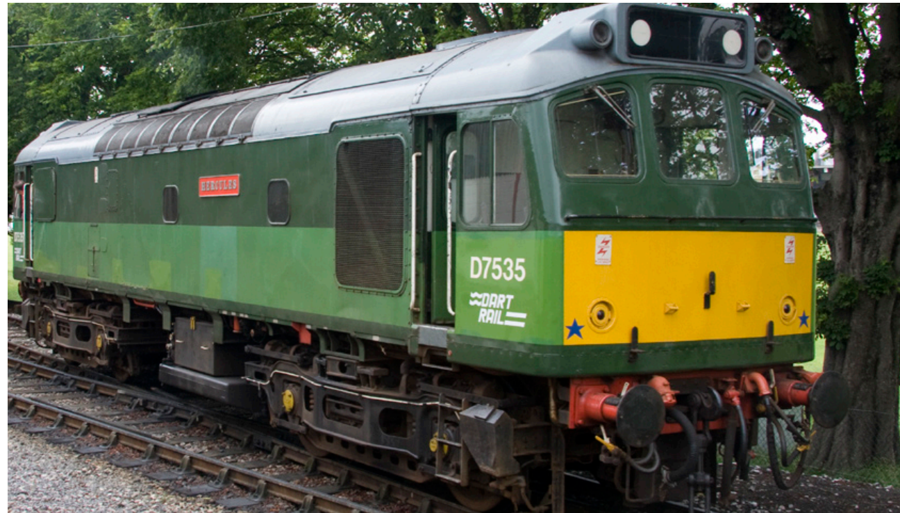
Above: The Paignton and Dartmouth's Class 25 D7535 is pictured shunting the stock for a private charter at Paignton on the 21st June.