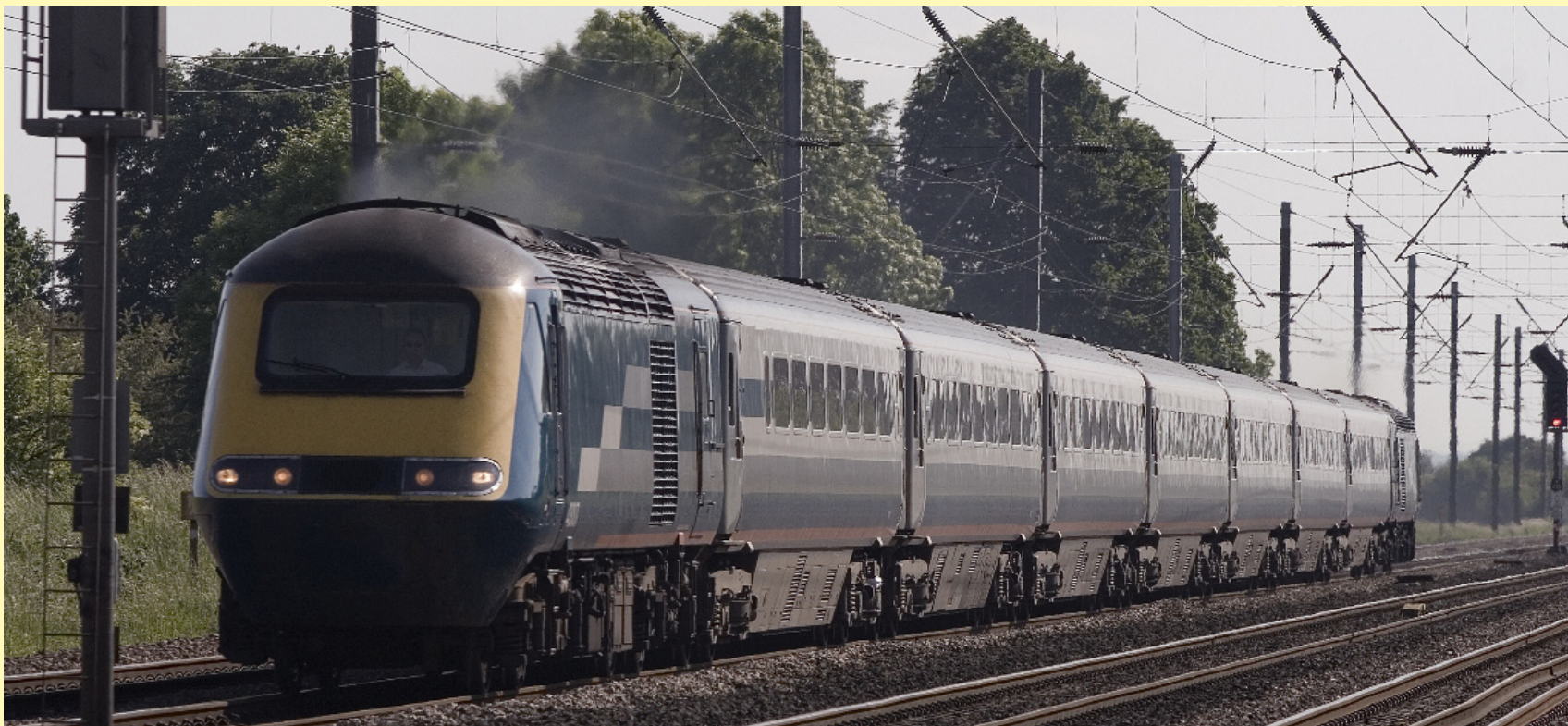
Left: CrossCountry HST with 43 007 leading nears York on the 10th June.