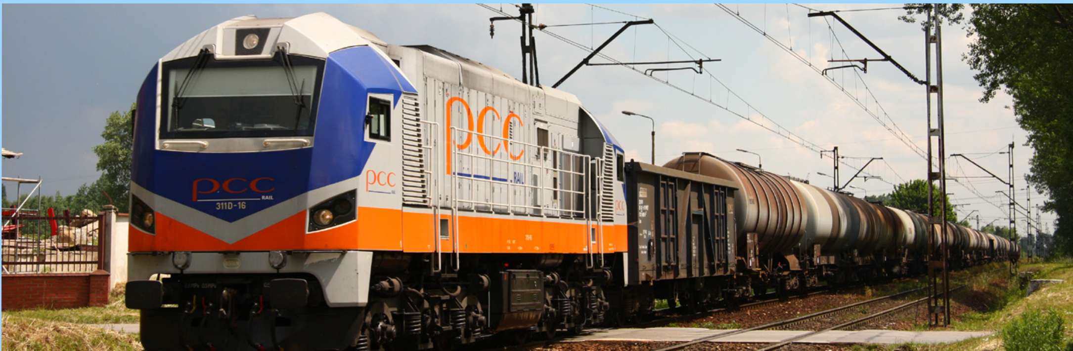
Above: 311D - 16 Approaching Trzebinia with empty fuel tanks on the 9th June.