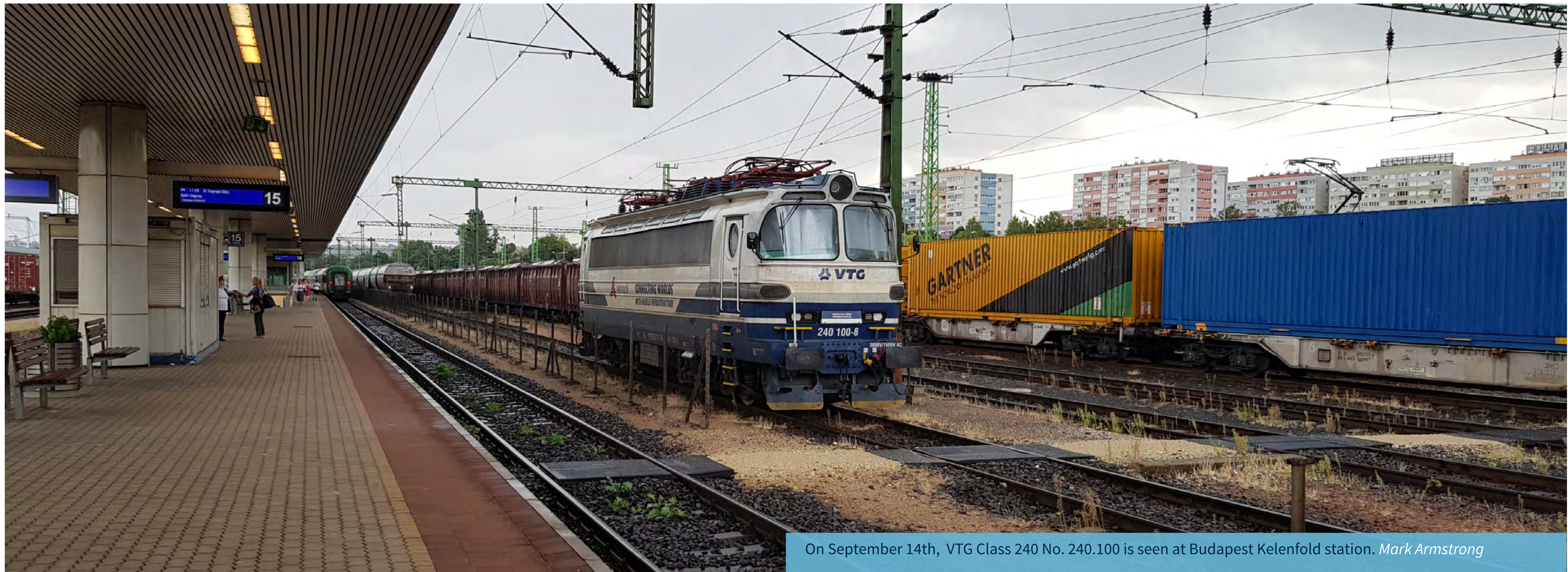
On September 14th, VTG Class 240 No. 240.100 is seen at Budapest Kelenfold station. Mark Armstrong