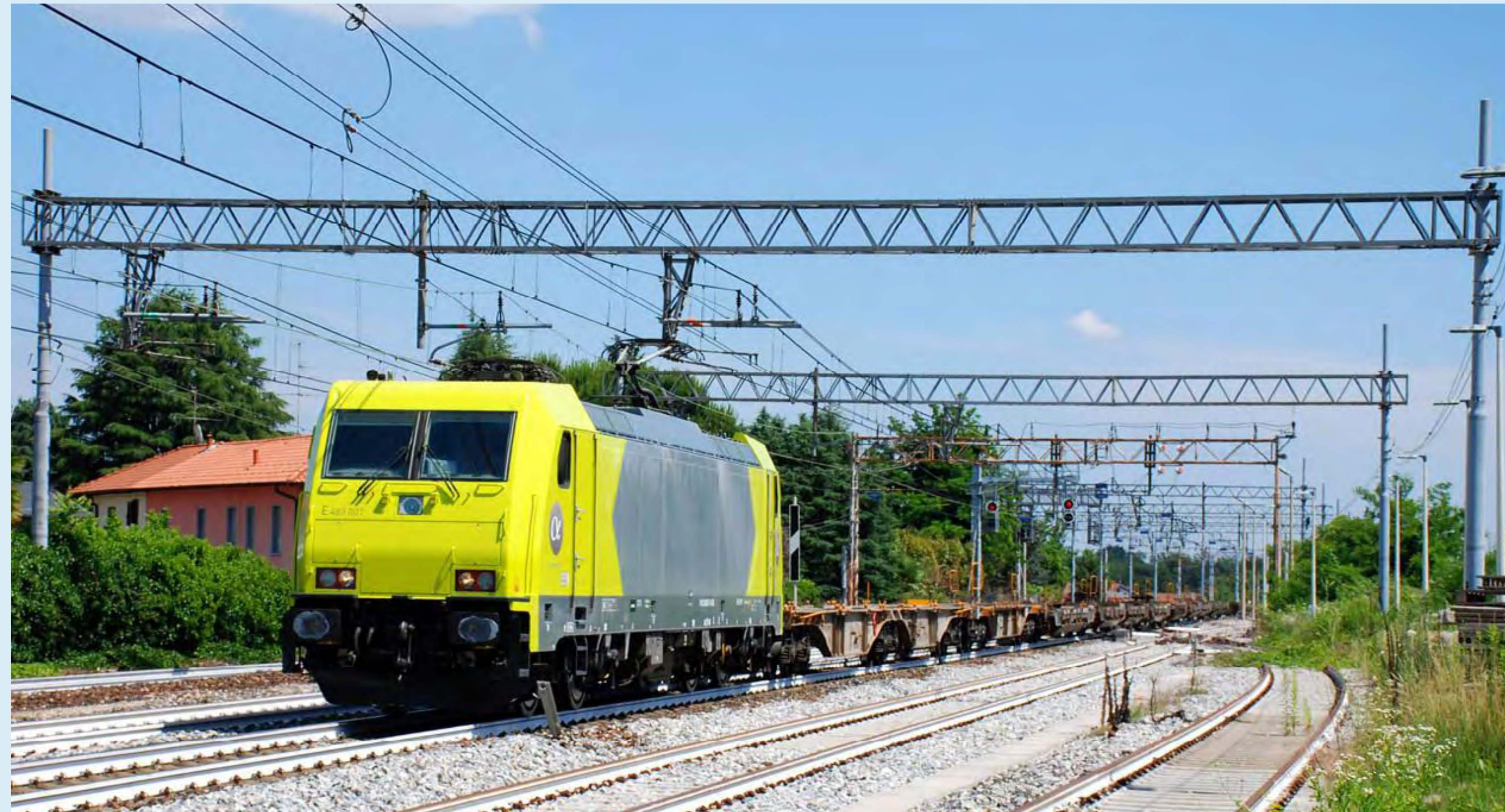
Photo: Alpha Trains and Alstom sign Service Agreement.

This strategic collaboration between Alpha Trains and Alstom underscores their commitment to sustainable and efficient transportation solutions throughout Europe.