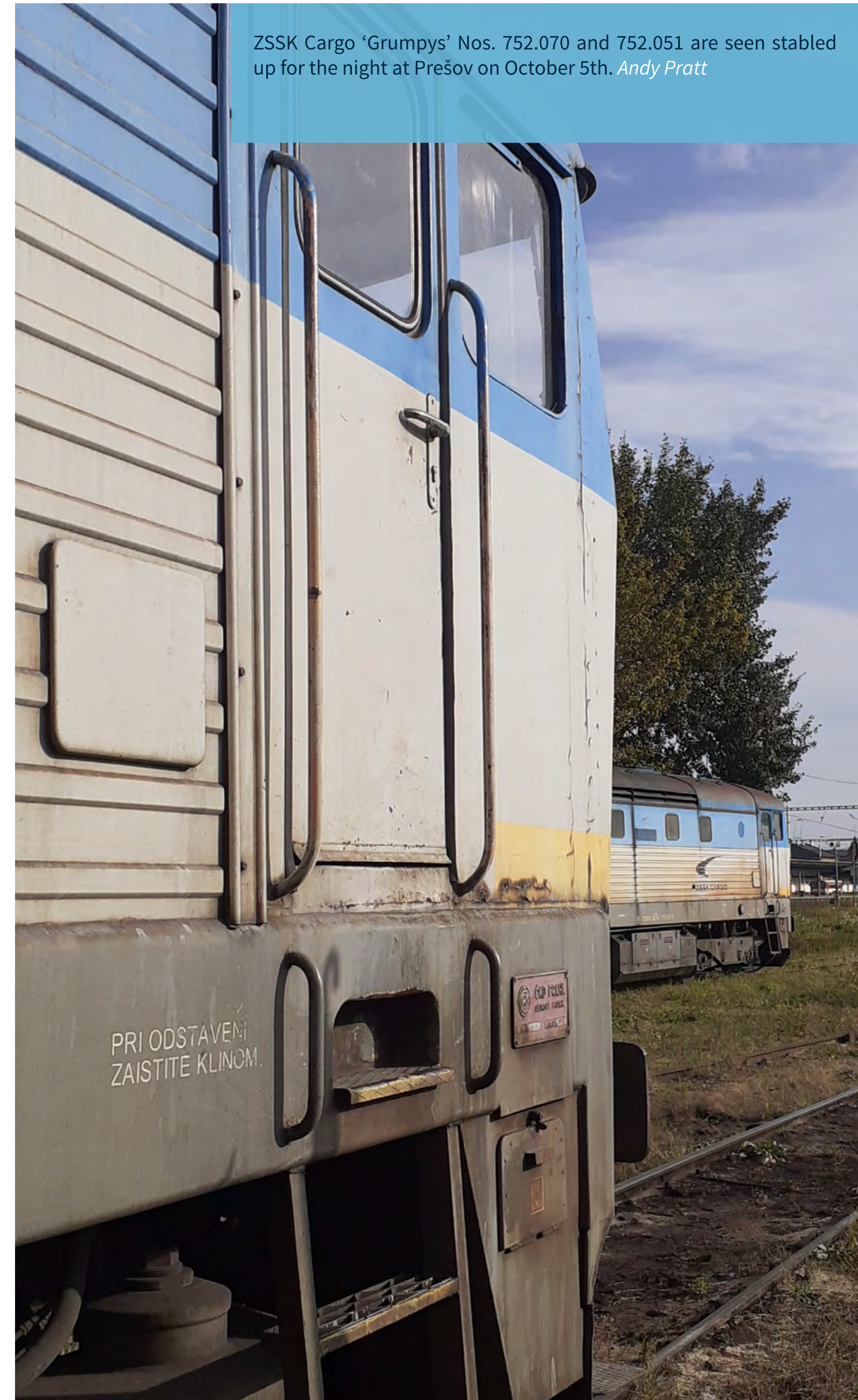
ZSSK Cargo 'Grumpys' Nos. 752.070 and 752.051 are seen stabled up for the night at Prešov on October 5th. Andy Pratt

Alstom promotes mobility through all rail transport product lines, delivered to the main passenger operators in Brazil, such as São Paulo (SP), Rio de Janeiro (RJ), Porto Alegre (RS), Fortaleza (CE), Recife (PE) and Brasília (DF). The production of rolling stock and the control and signalling systems, responsible for the safe movement of trains, are also present in the development of mobility projects for other countries in Latin America and around the world, such as Argentina, Colombia, Chile, Ecuador, United States, Mexico, Panama, Peru, Dominican Republic, Romania and Taiwan.