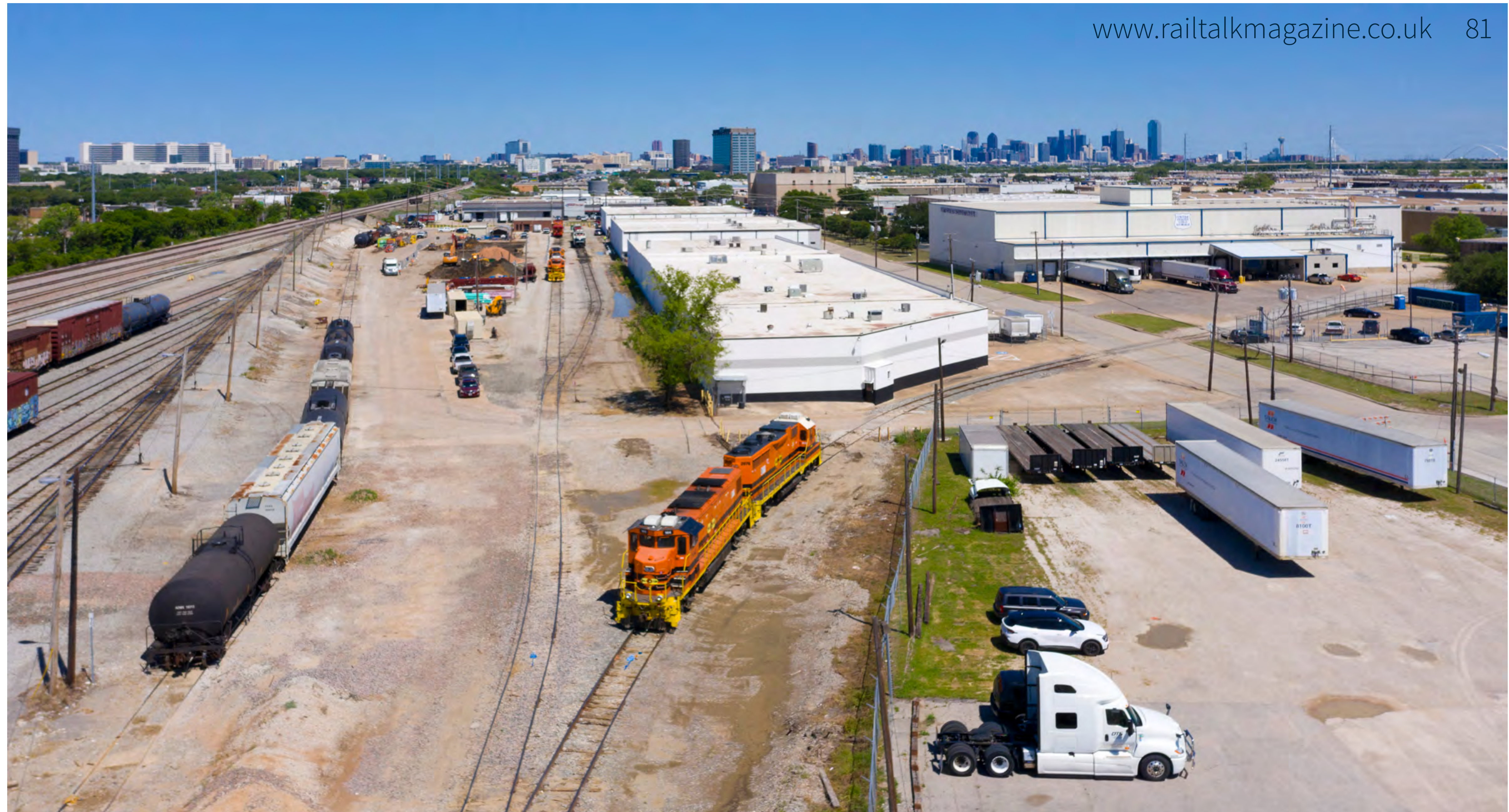
▶ Dallas Garland & Northeastern Nos. 3417 and 3418 approach Dallas whilst making their way back from the Union Pacific Miller Yard to the DGNO Mockingbird Yard.