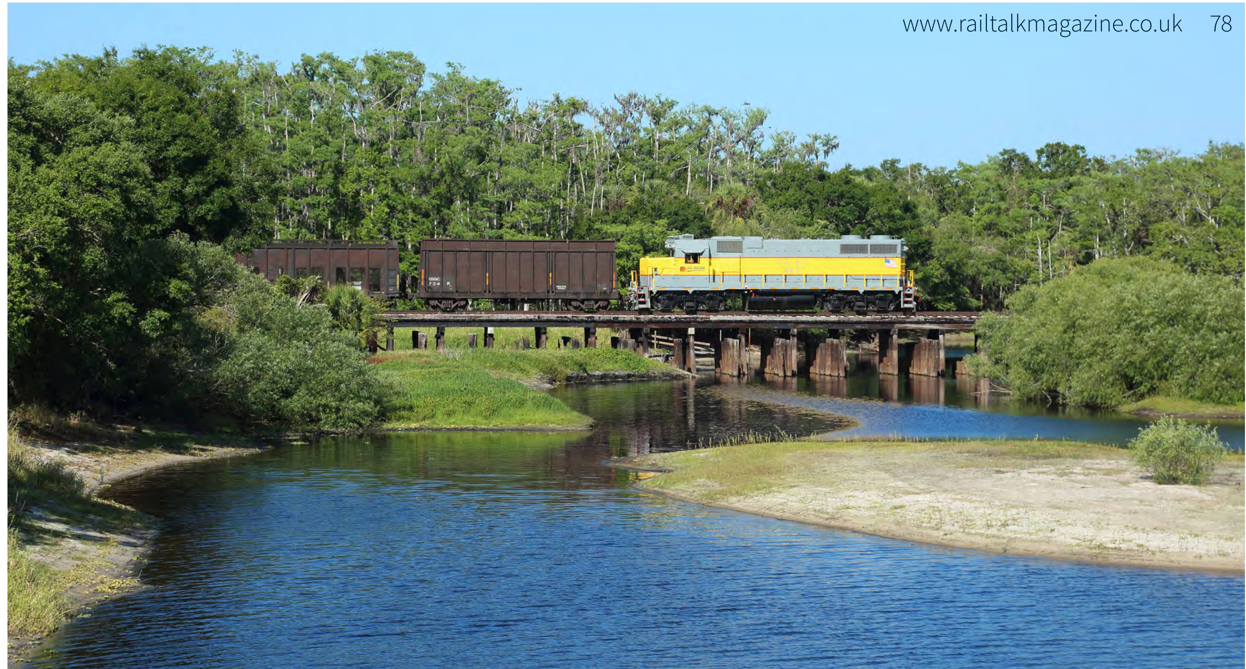
▶ USSC No. 503 passes Port St Lucie whilst hauling the 'Fort Pierce Turn' from Clewiston. Laurence Sly