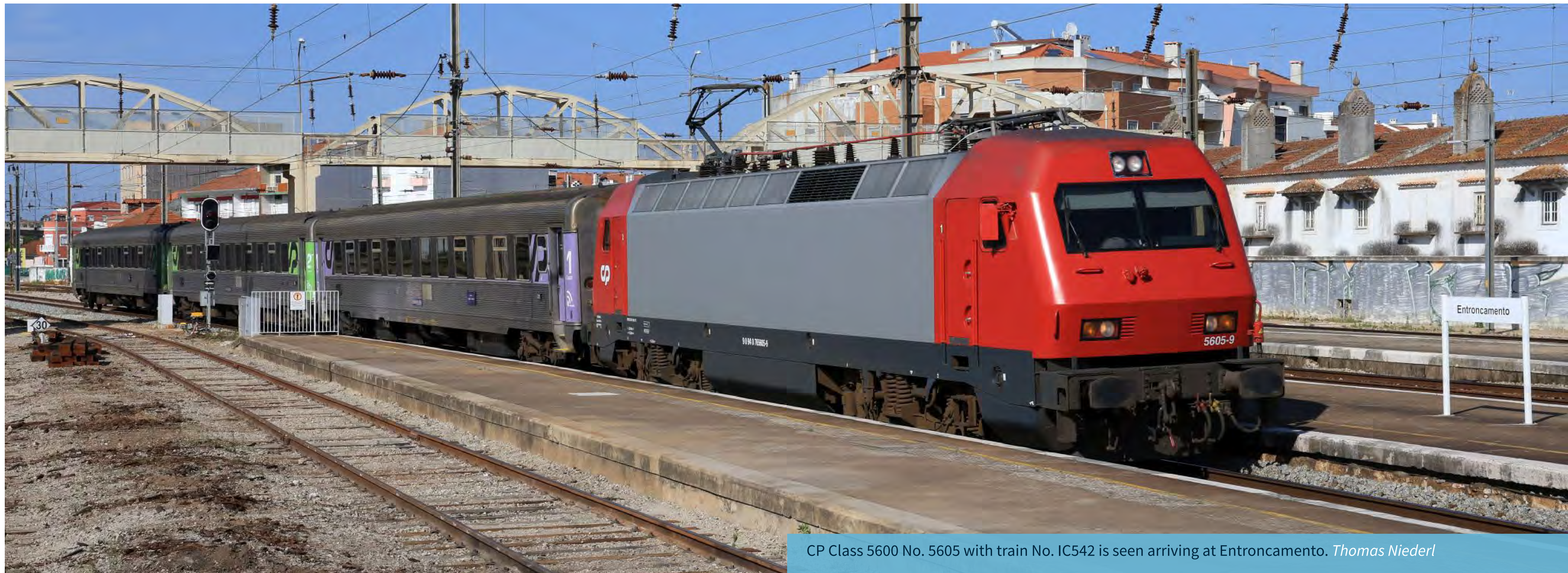
CP Class 5600 No. 5605 with train No. IC542 is seen arriving at Entroncamento. Thomas Niederl