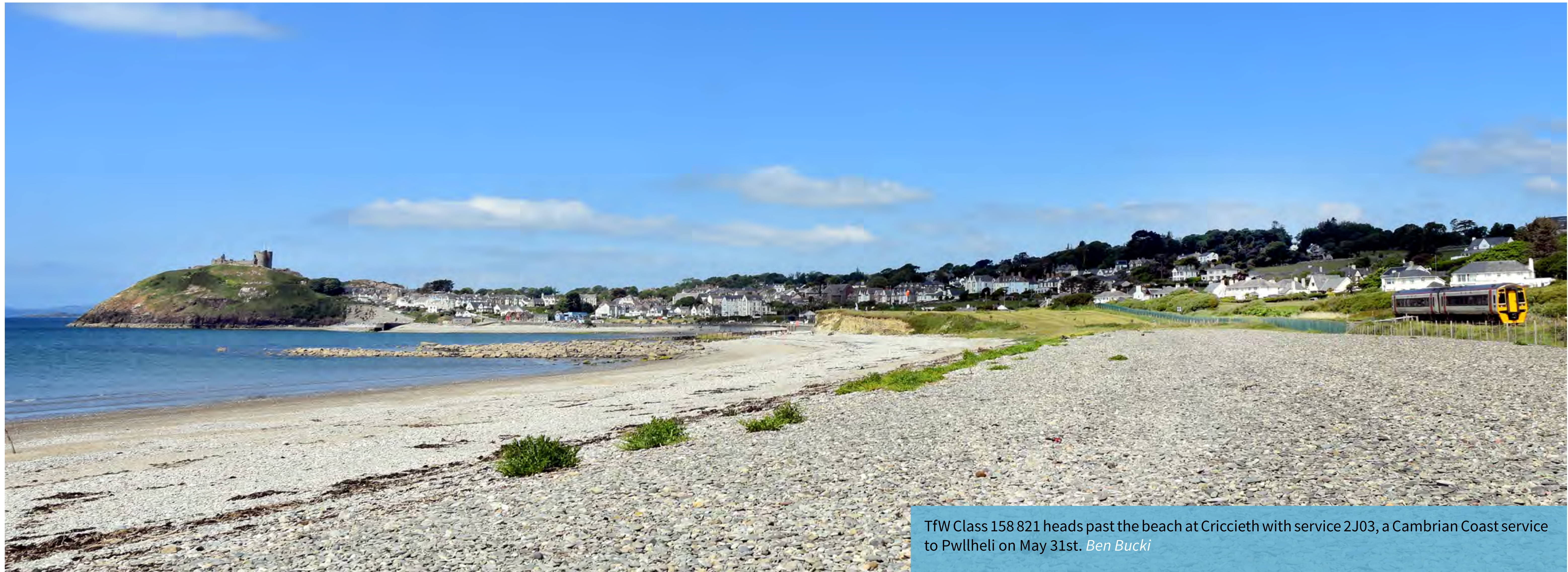
TfW Class 158 821 heads past the beach at Criccieth with service 2J03, a Cambrian Coast service to Pwllheli on May 31st.