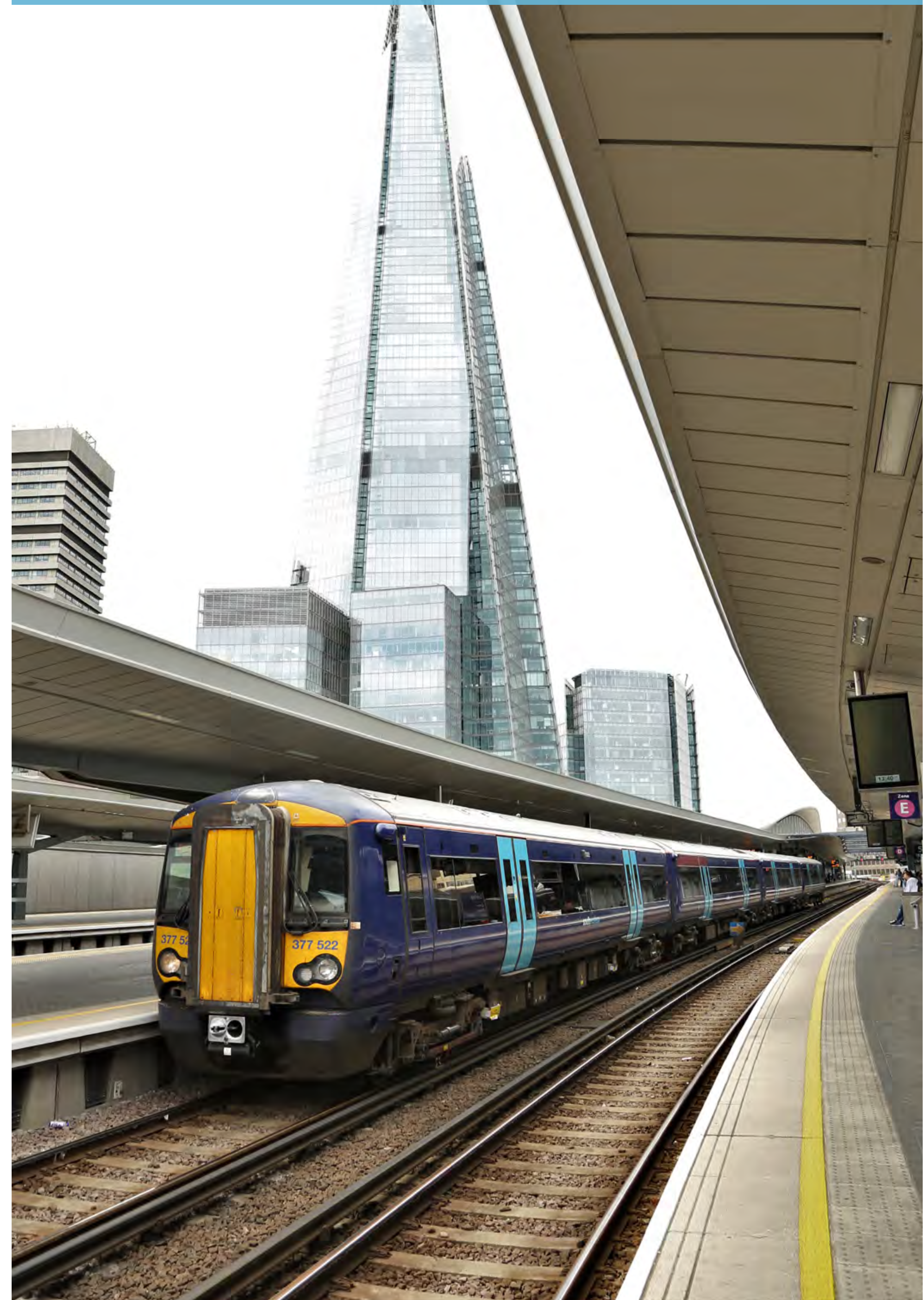
South Eastern's Class 377 522 is dwarfed by the Shard as it passes an unusually deserted London Bridge with an unknown ECS working.