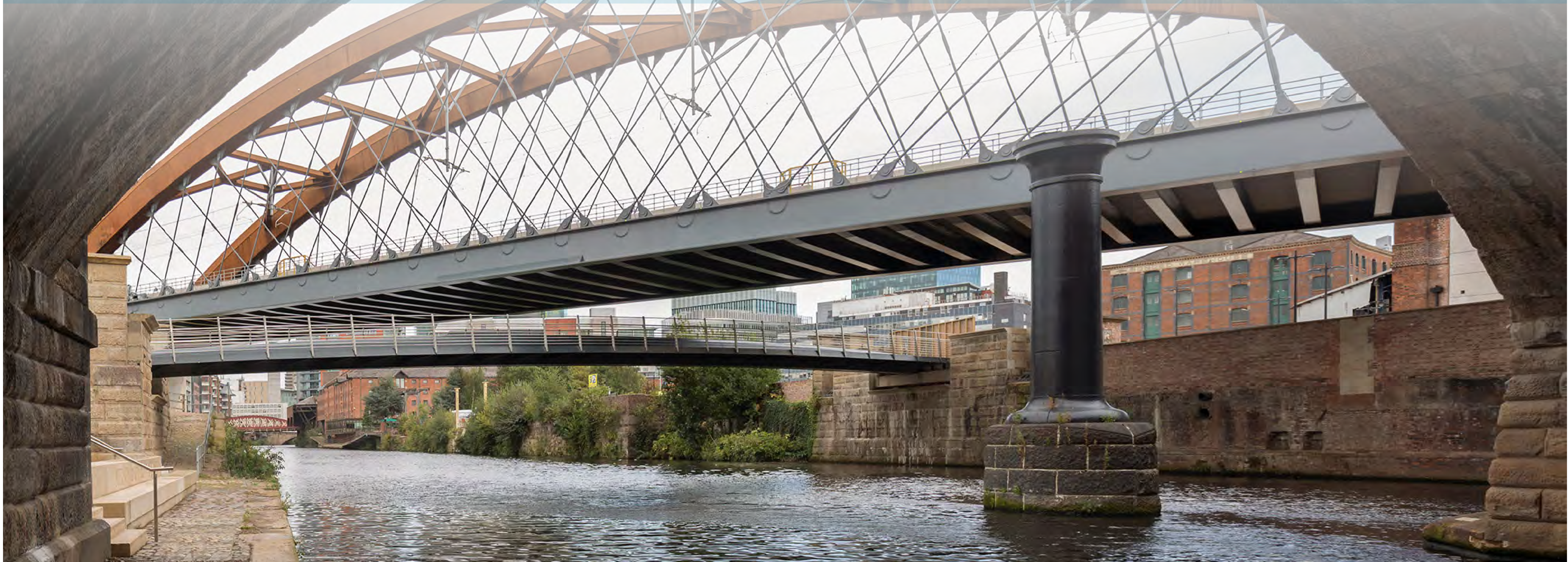
Image: View from underneath Stephenson bridge of new footbridge under Ordsall chord when completed in 2017.

Network Rail has worked closely with the two councils on its joint work to landscape the areas around both sides of the bridge as part of its wider sustainable travel plans for pedestrians and cyclists through Salford and Manchester. Additional improvements on the Salford side also includes interpretation panels, to tell the story of behind perhaps the Irwell's most famous crossing, the Stephenson Bridge. Stephenson Bridge, a Grade I listed structure, was built by George Stephenson in 1830 and formed part of the world's first passenger railway line, carrying passengers between Liverpool and Manchester.