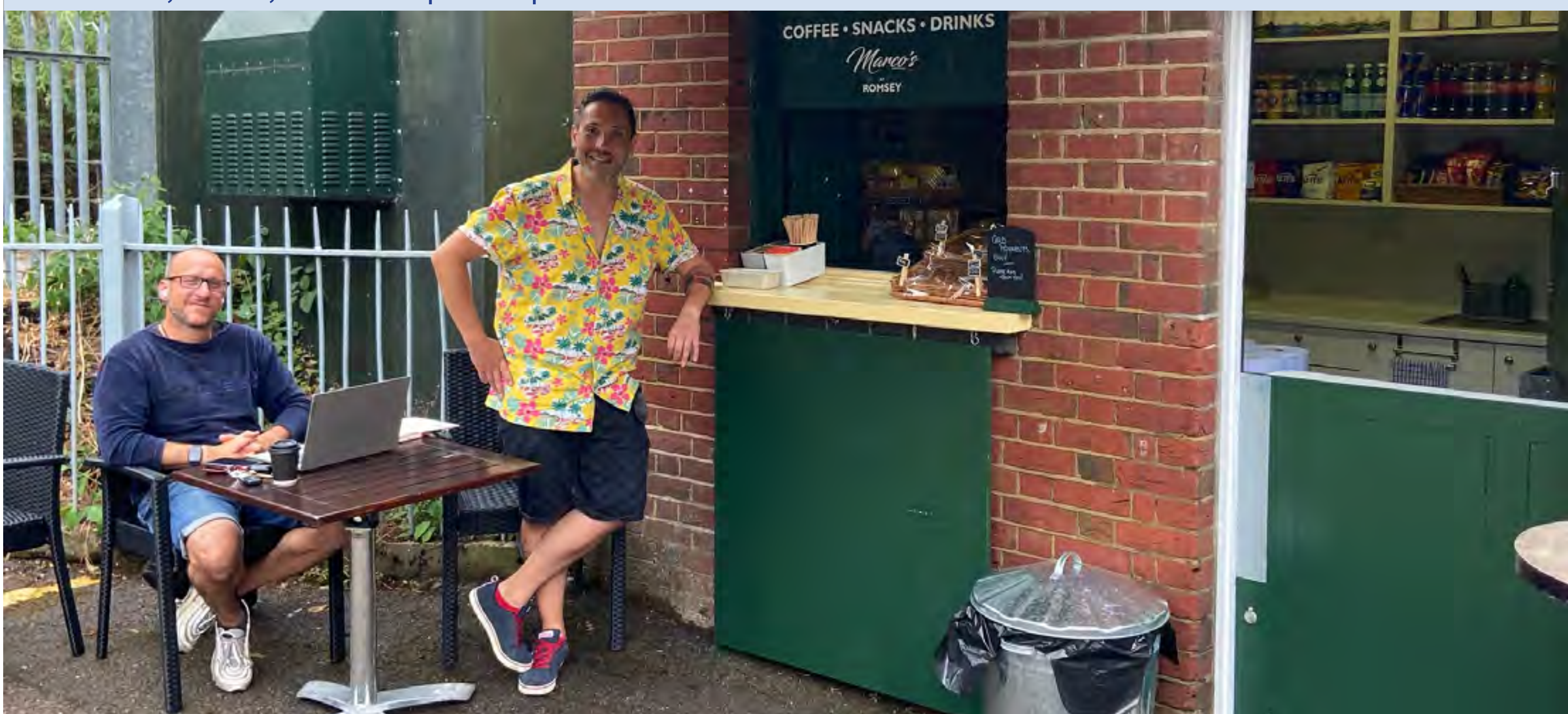
Romsey station cafe on platform 2 is an original LSWR dwelling and is open from 06:30 till 14:30 on Mondays to Fridays.