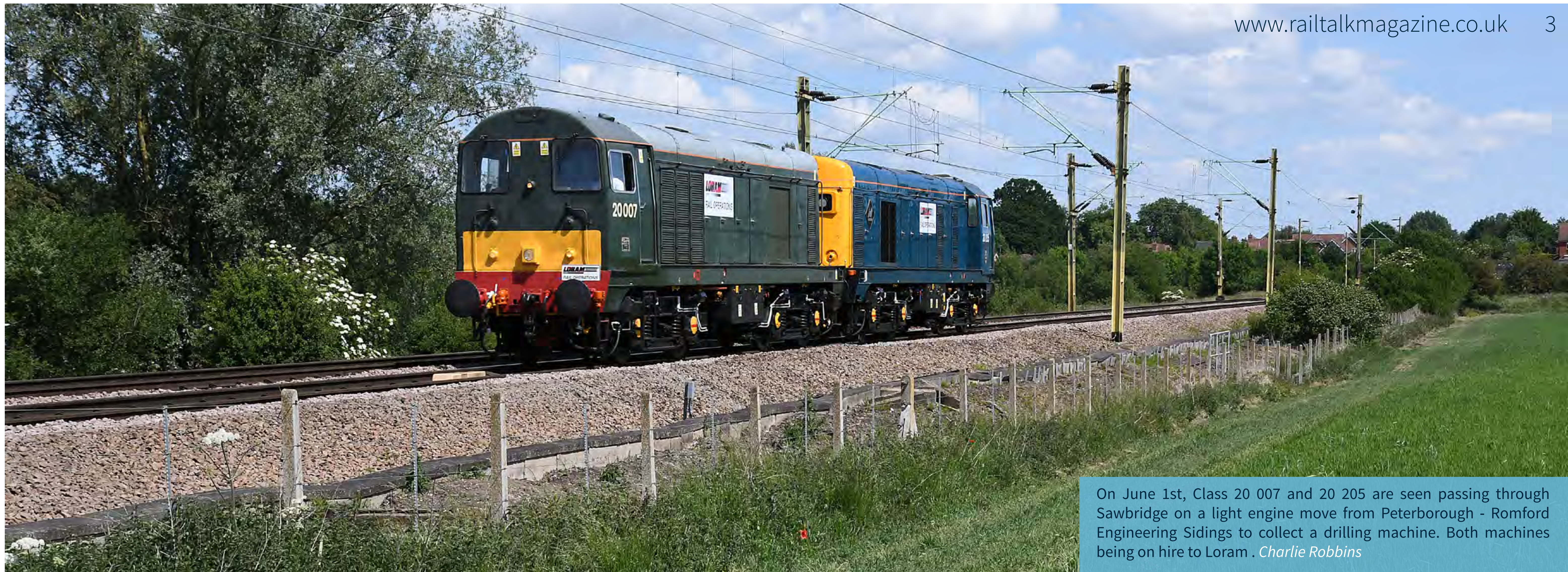
On June 1st, Class 20 007 and 20 205 are seen passing through Sawbridge on a light engine move from Peterborough - Romford Engineering Sidings to collect a drilling machine. Both machines being on hire to Loram . Charlie Robbins