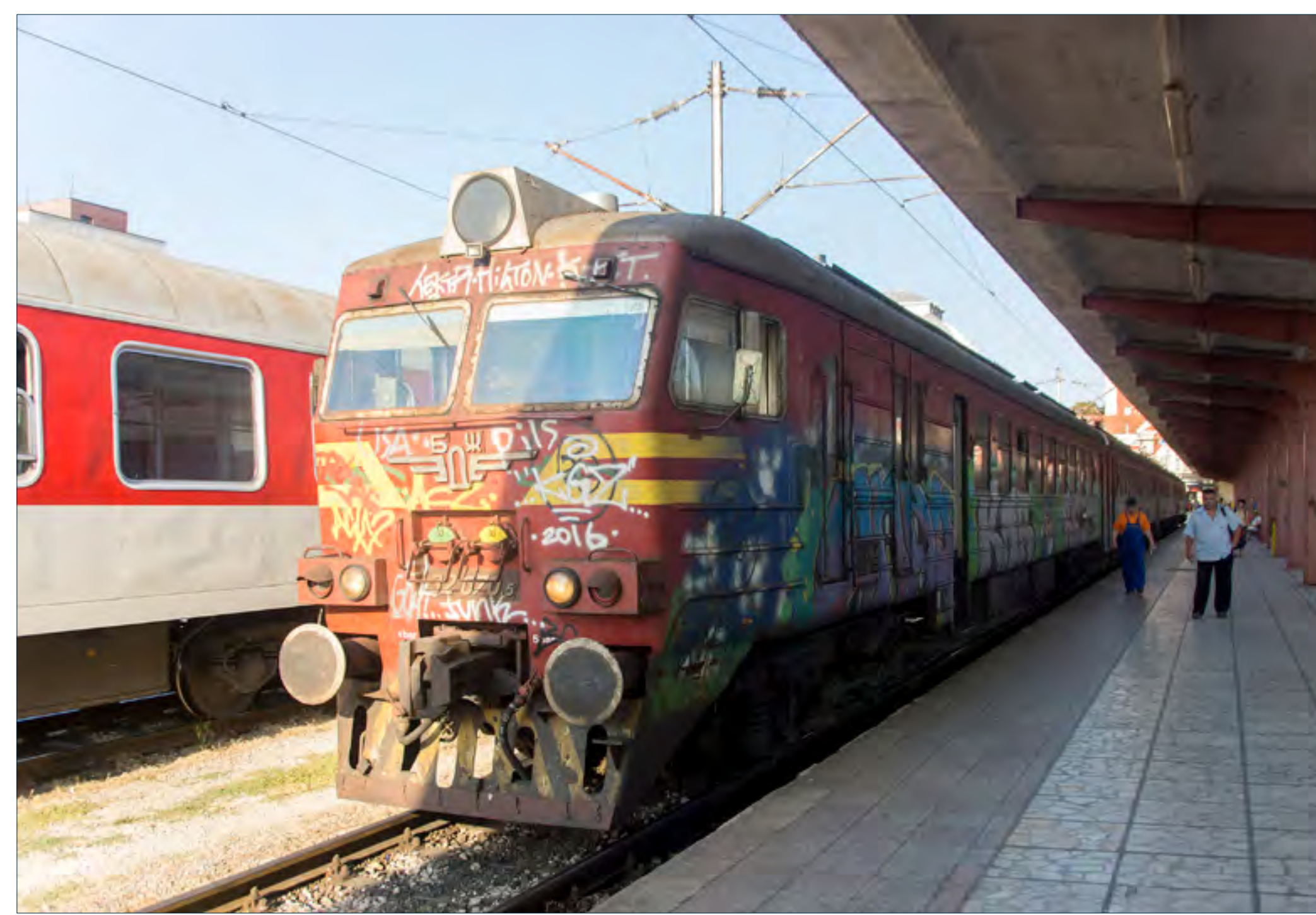
▶ Completing the set of RVR Class 32 photos, is No. 32.071 in the yard at Varna. These units are in such a state that it would be hard to tell which ones are operational and which aren't.