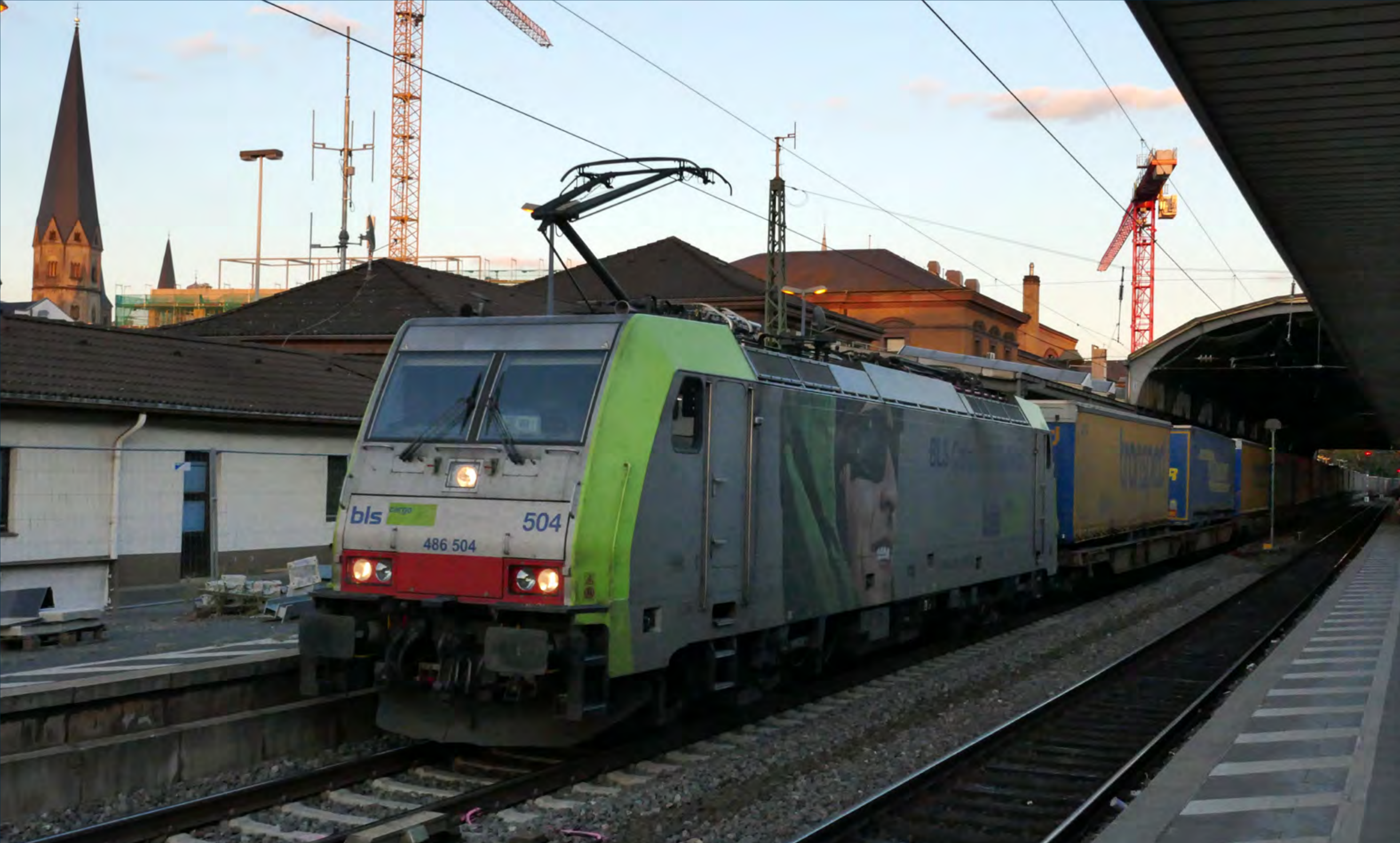
BLS Class 486.504 passes through Bonn Hbf with a northbound container train. Stearnsounds