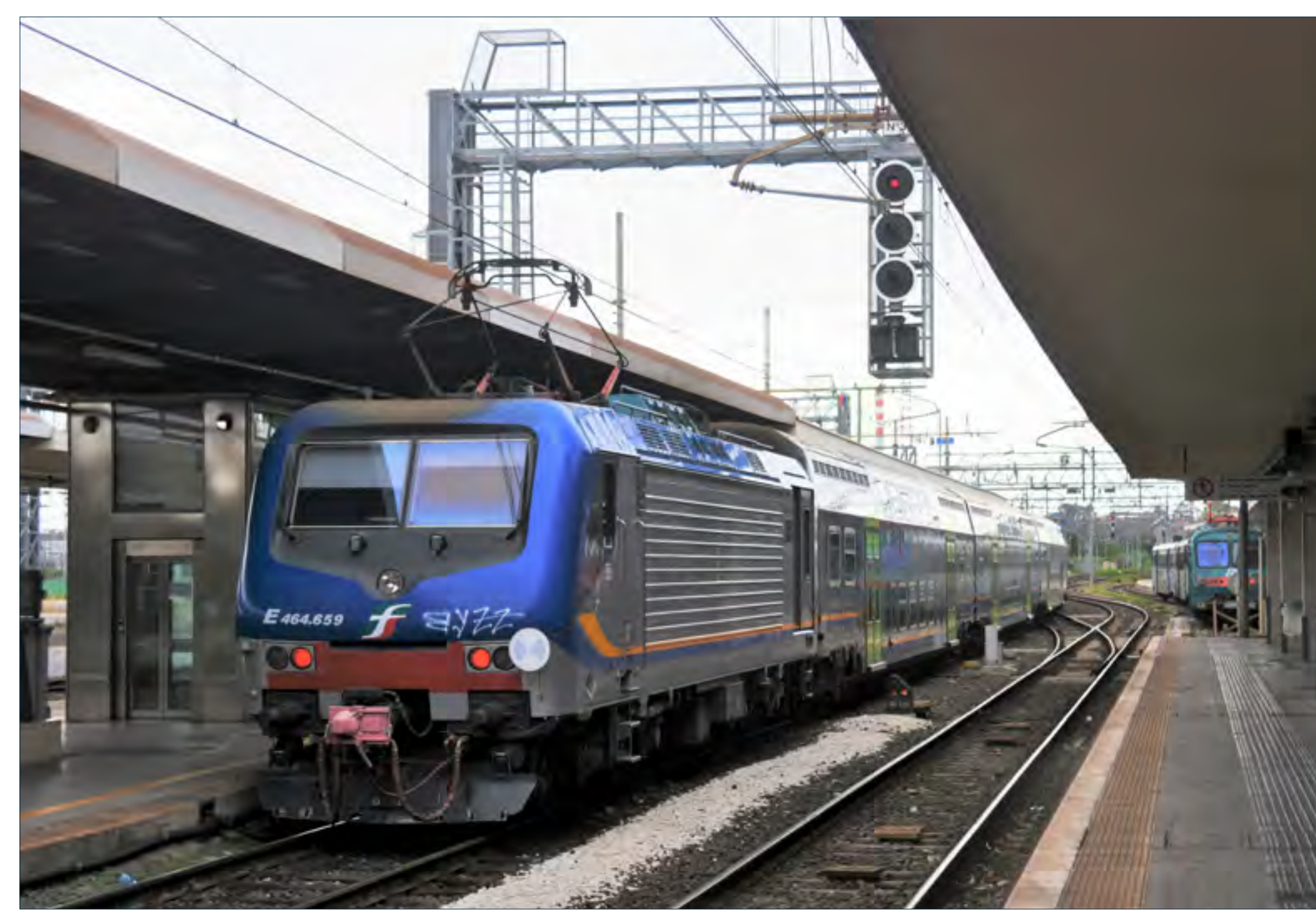
▶ FS Class E464.659 departs Pisa with a service to La Spezia.