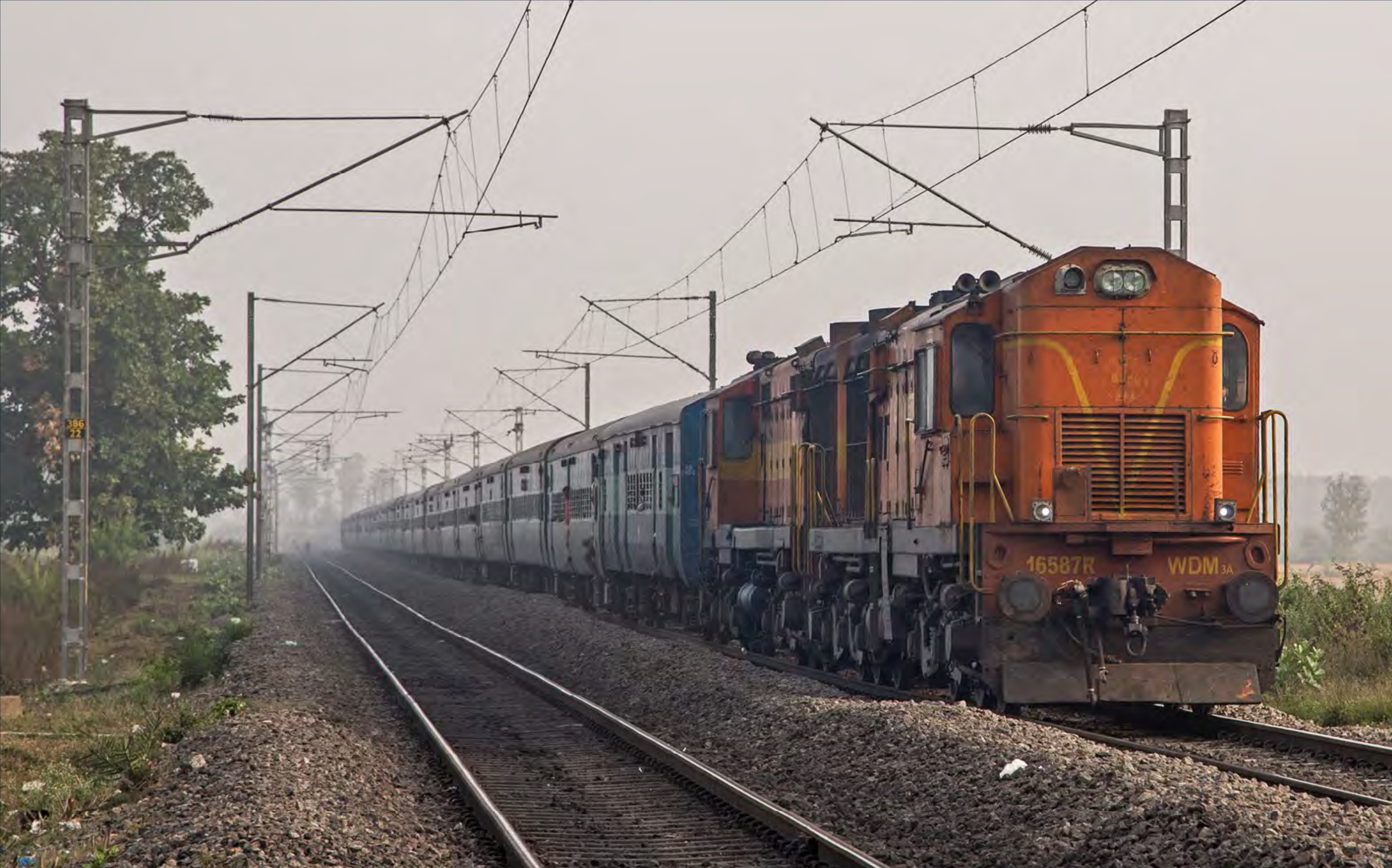
▶ A pair of locos from the predominantly freight only depot of Bokaro Steel City (the clue is in the name!) charge through Parvathipuram with an express to Bangalore. Mark Torkington