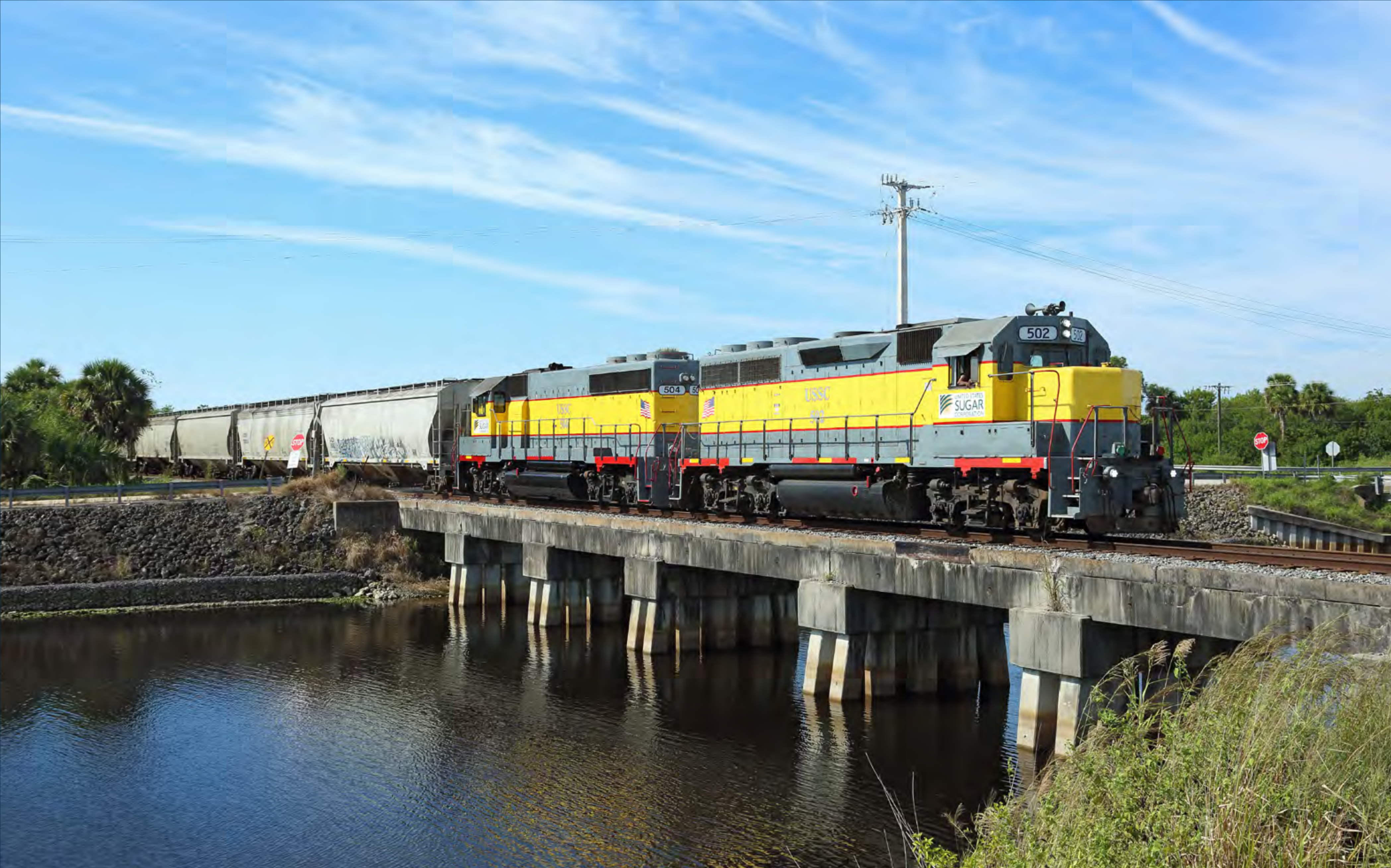
▶ USSC GP40-2 Nos. 502 and 504 pass Port St. Lucie whilst working the Fort Pierce turn from Clewiston. At Fort Pierce the USSC interchanges with the Florida East Coast Railway. Laurence Sly