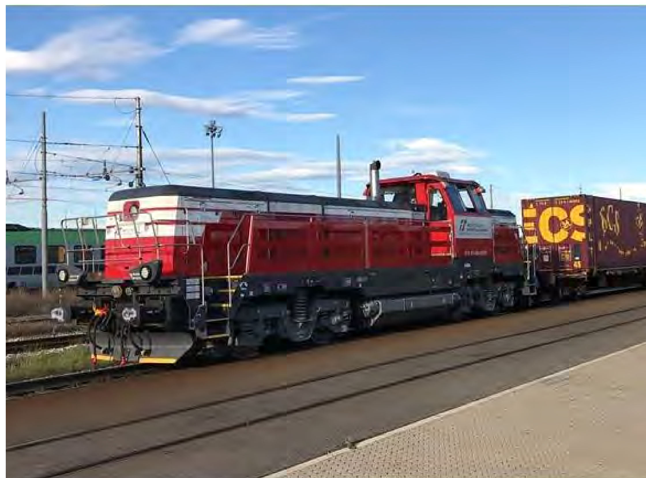
Photo: EffiShunter 1000 of the Italian company Mercitalia Shunting & Terminal on a shunting service at the logistics center in Novaire, Italy.

For CZ LOKO, the conquest of the Slovenian and Italian markets is a great success, confirming that the term "Czech Product" is again associated with the quality and satisfaction of the client. After the latest successes in Finland, the Baltic, Italy, Turkey and Slovenia, CZ LOKO intends to continue expanding to other countries where Czech locomotives have traditionally never been operated.