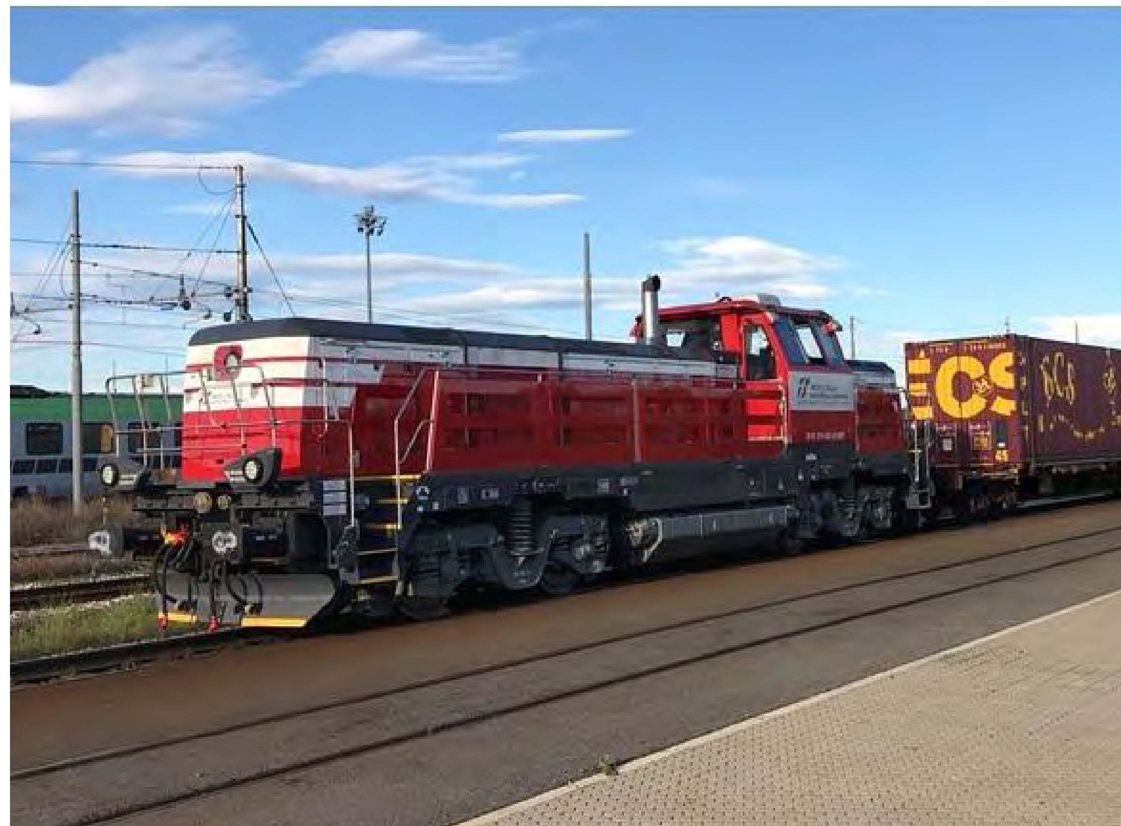
Photo: EffiShunter 1000 of the Italian company Mercitalia Shunting & Terminal on a shunting service at the logistics center in Novaire, Italy.

For CZ LOKO, the conquest of the Slovenian and Italian markets is a great success, confirming that the term "Czech Product" is again associated with the quality and satisfaction of the client. After the latest successes in Finland, the Baltic, Italy, Turkey and Slovenia, CZ LOKO intends to continue expanding to other countries where Czech locomotives have traditionally never been operated.