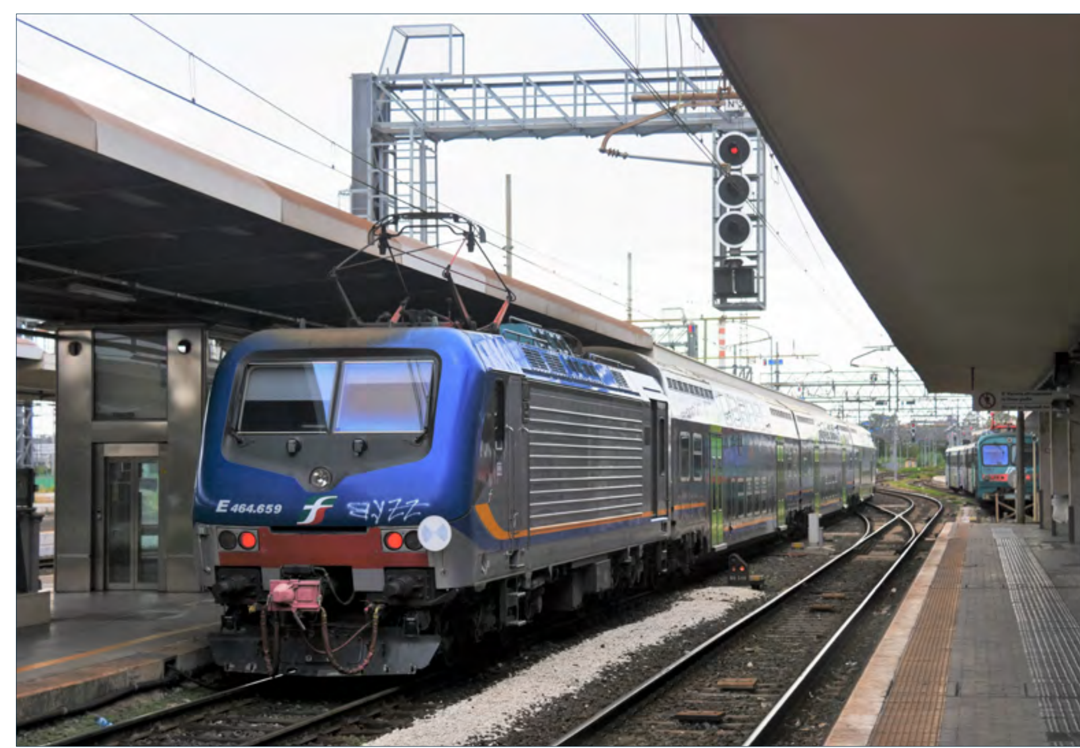
▶ FS Class E464.659 departs Pisa with a service to La Spezia.