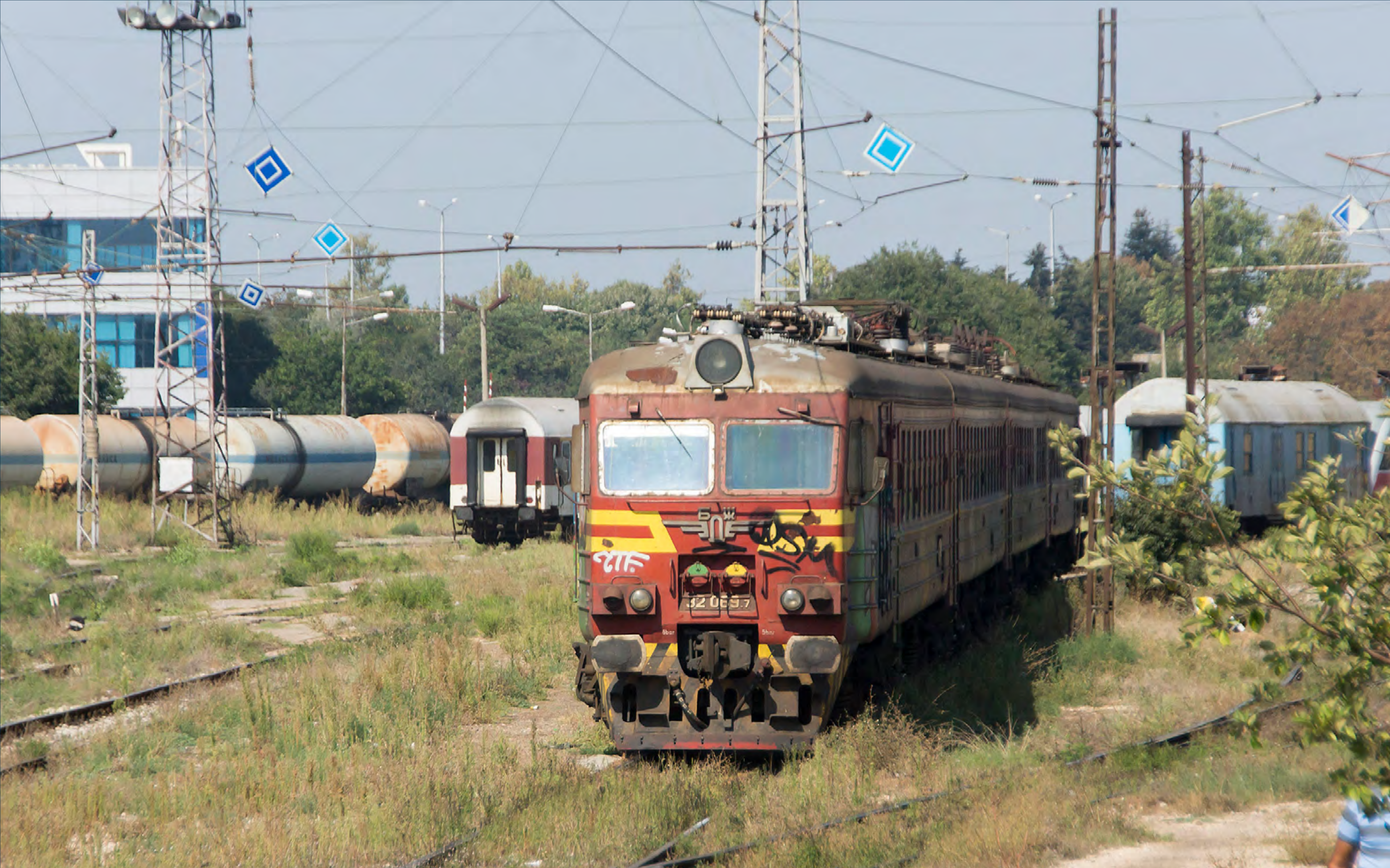
▶ Built by RVR Riga, this Soviet built 4 car EMU No. 32.069 is seen in the yard at Varna. Brian Battersby