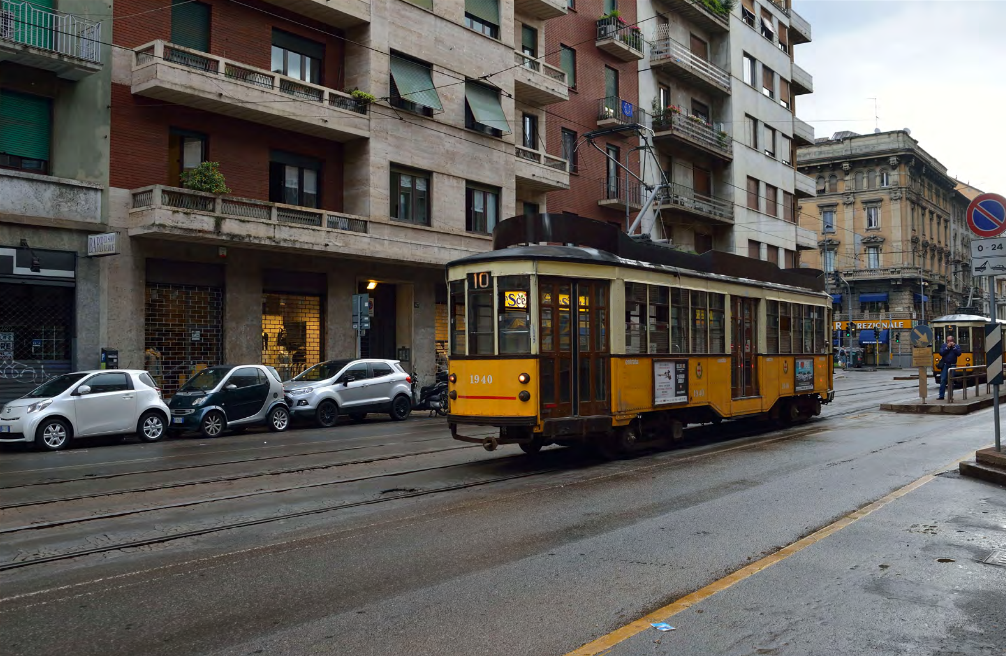
Milano tram No. 1940 heads through the streets with a line 10 service. Class47