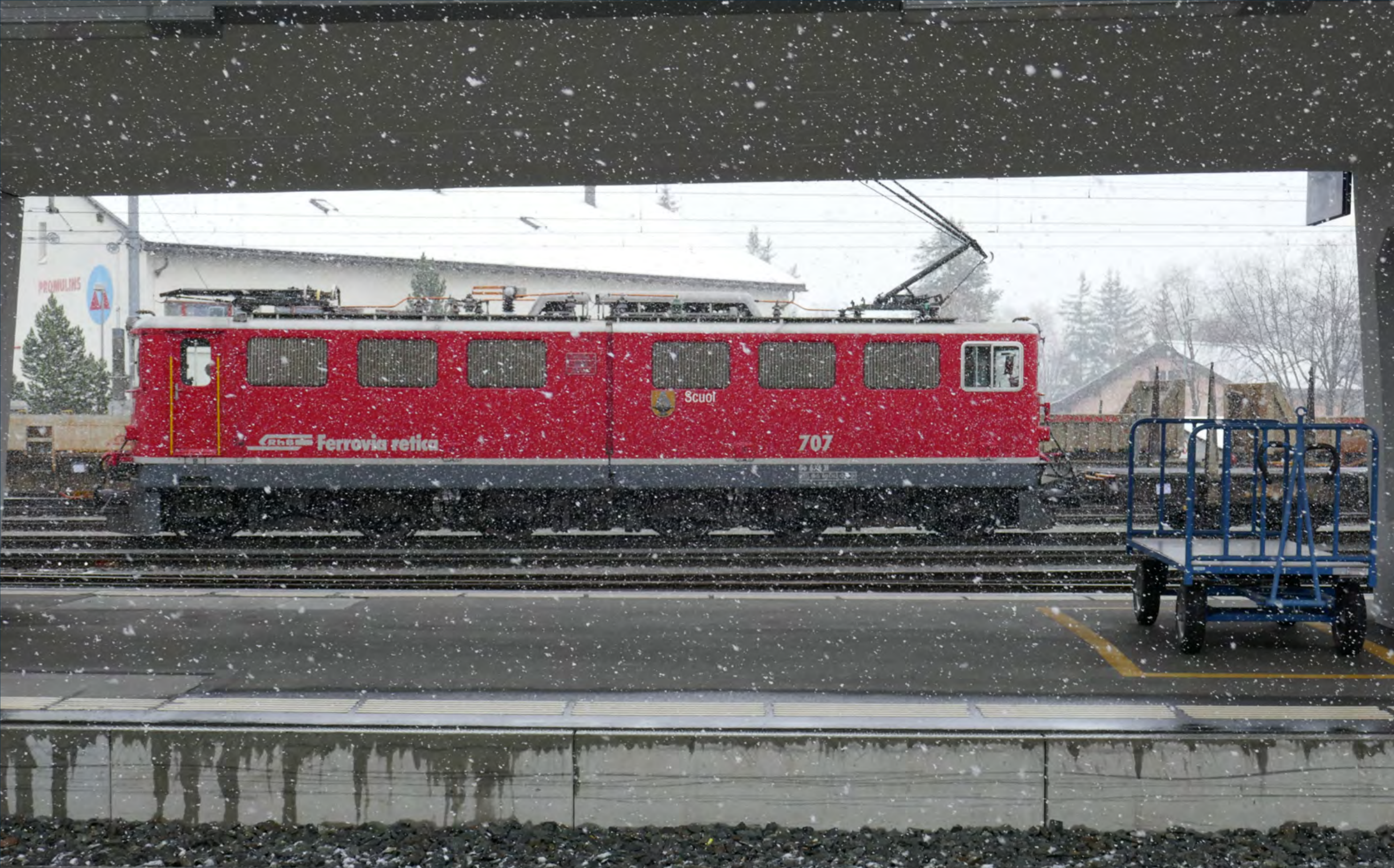
▶ RhB Ge 6/6 II No. 707 stands at Samedan with a freight. Stearnsounds