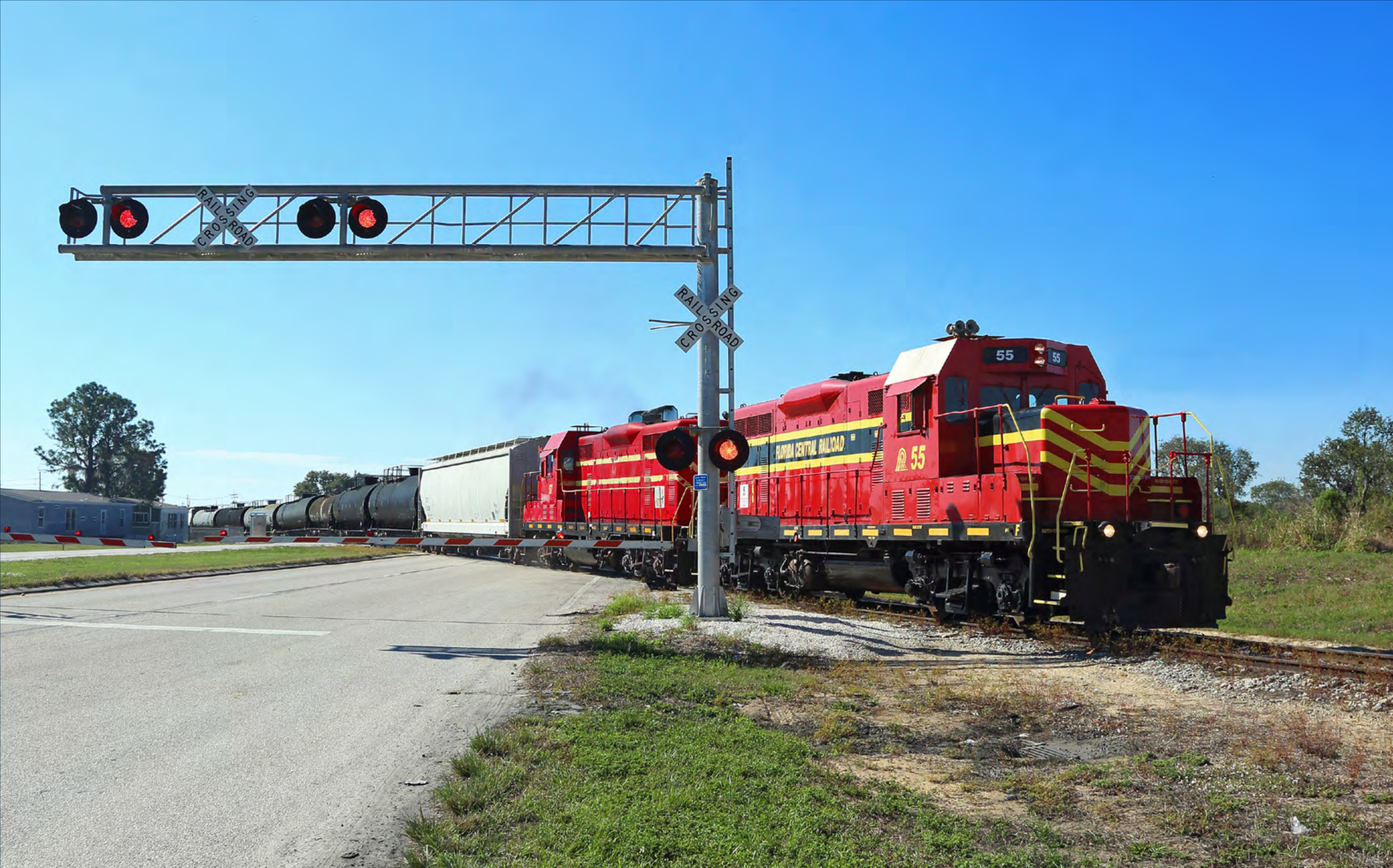
Florida Central Railroad GP7 Nos. 55 and 57 propel a rake of wagons in to the Bartow Airport industrial complex. Laurence Sly