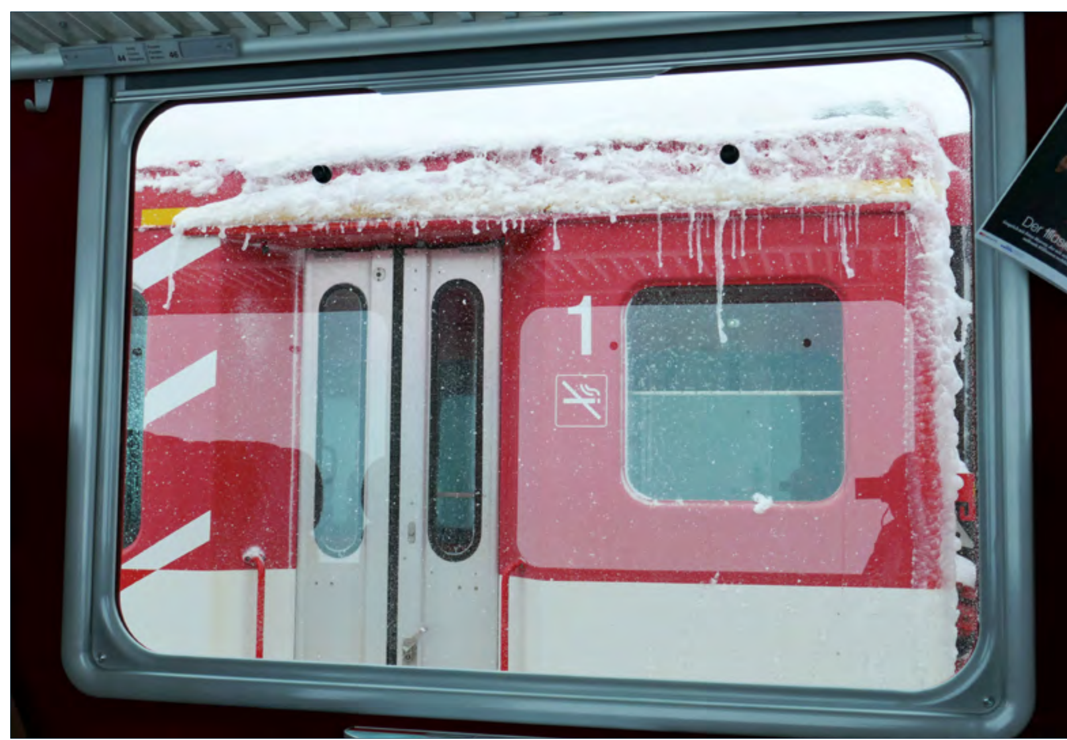
▶ View from a nice warm MGB train at Oberalp pass. Stearnsounds