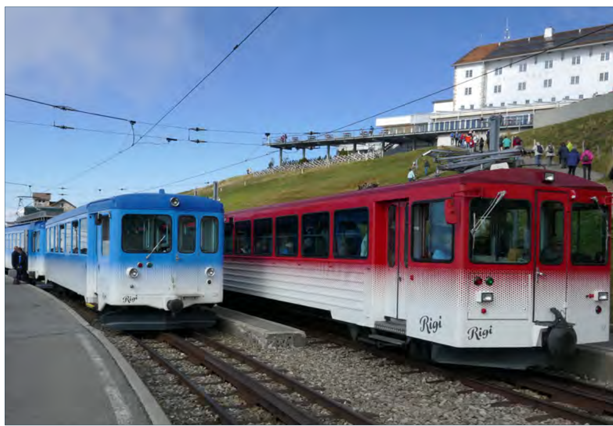
▶ Rigi Bahn trains from Arth-Goldau and Vitznau stand at Rigi-Kulm. Steamsounds