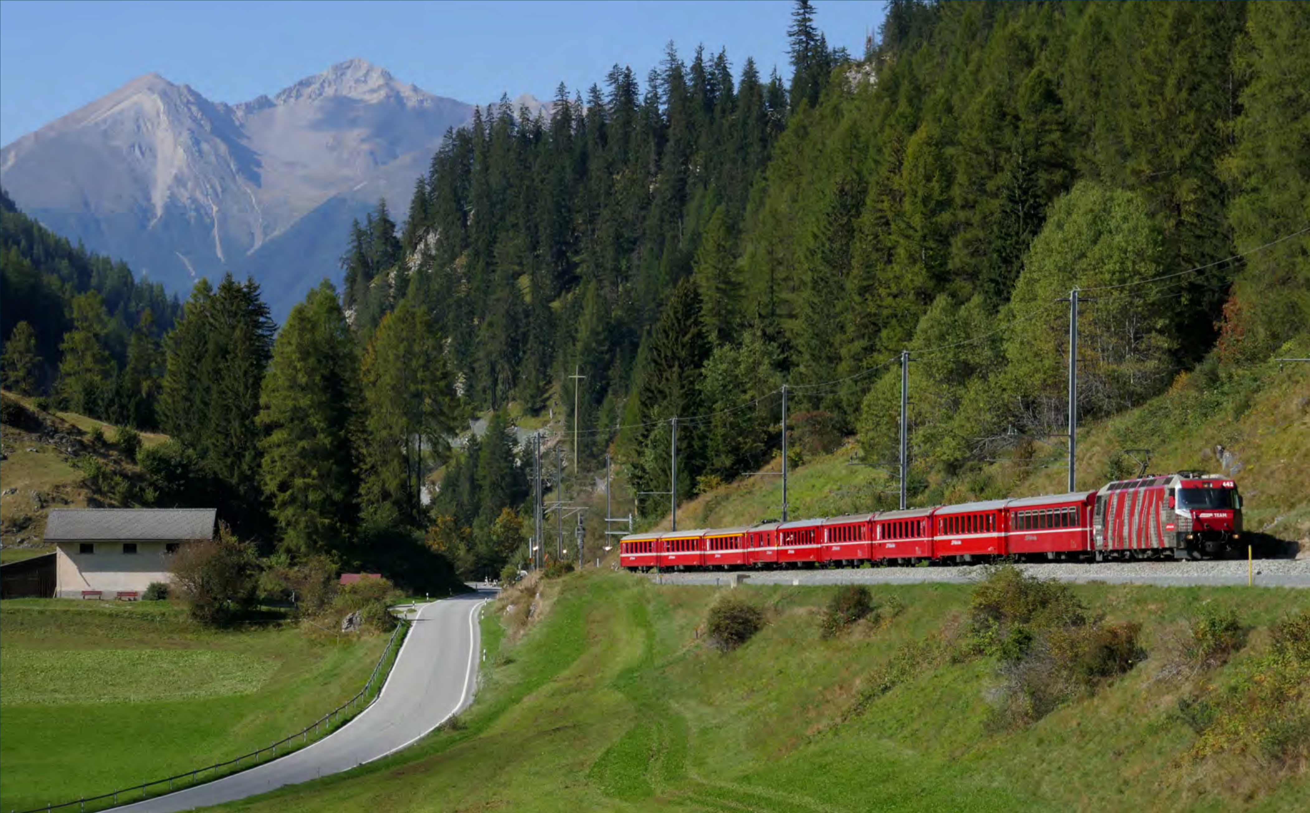
▶ RhB Ge 4/4 III No. 642 approaches Bergün with train No. RE1141 from Chur to St. Moritz. Steamsounds