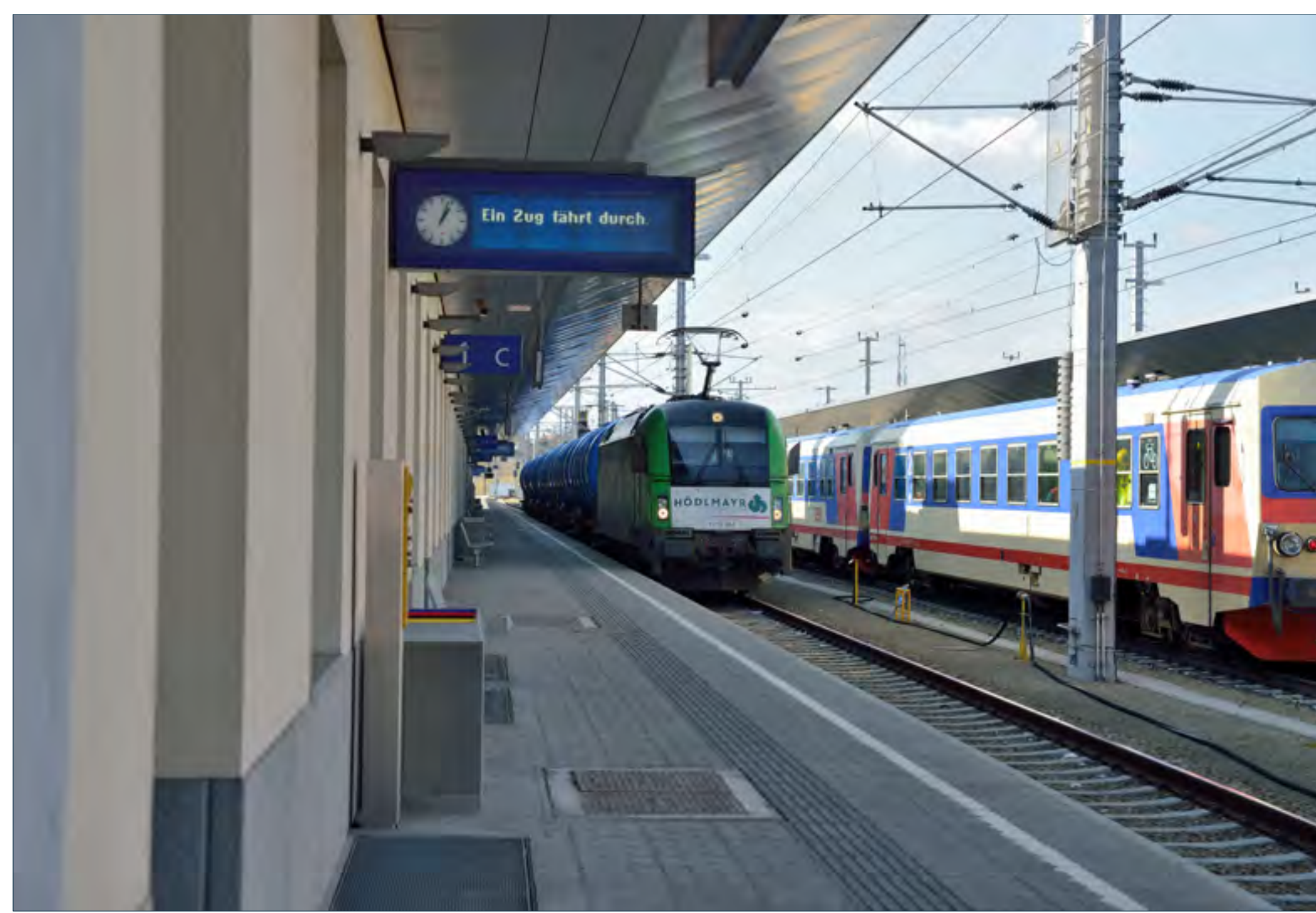
▶ Hodlmayr liveried Class 1216.954 passes through St. Polten on February 25th with a rake of tanks. Class47