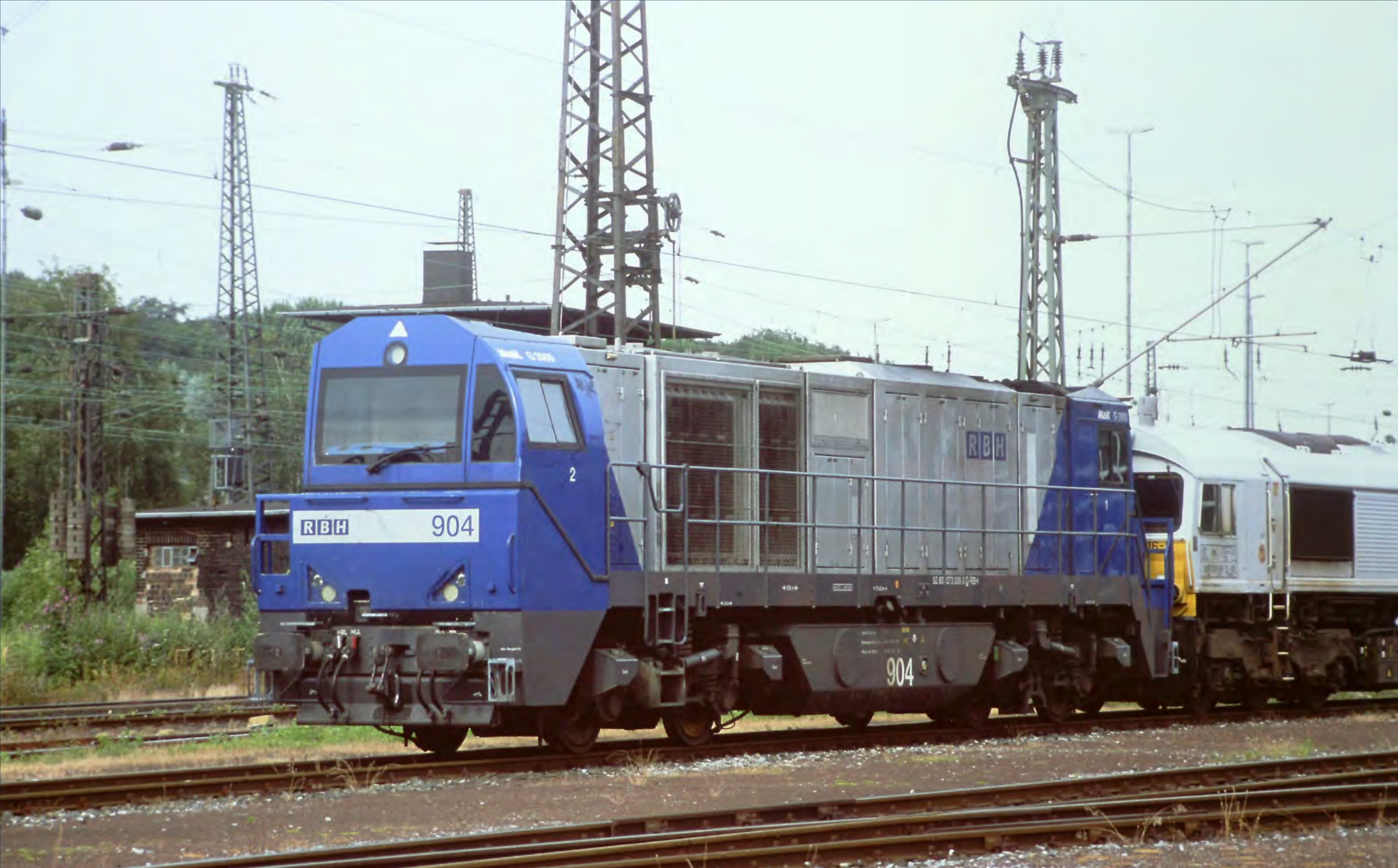
▶ RBH No. 904 (Class 273.008) stands at Osterfeld Sud shed. John Sloane