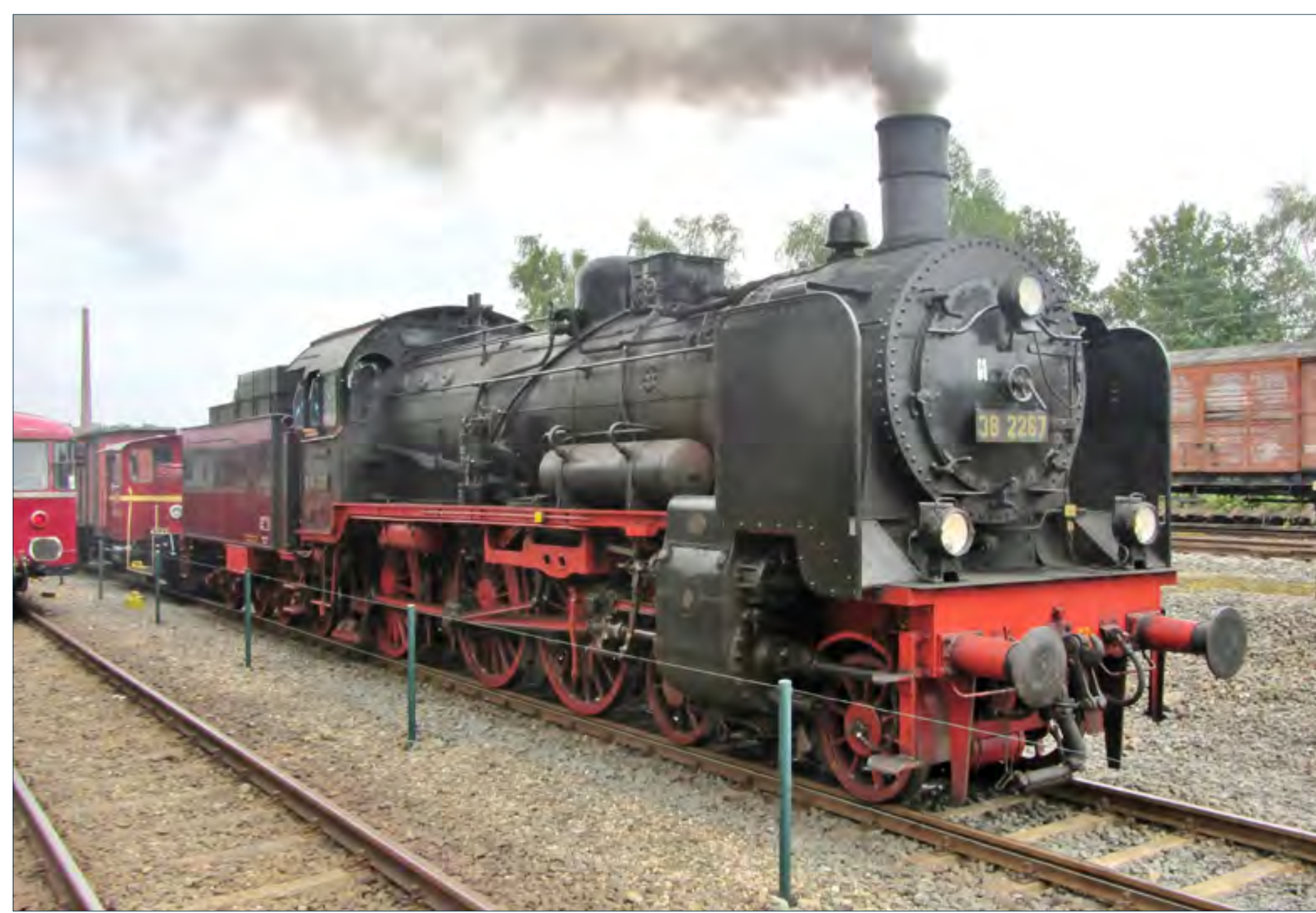
▶ DB(KPEV) No. 38.2267 4-6-0 steams in Bochum Dahlhausen yard.