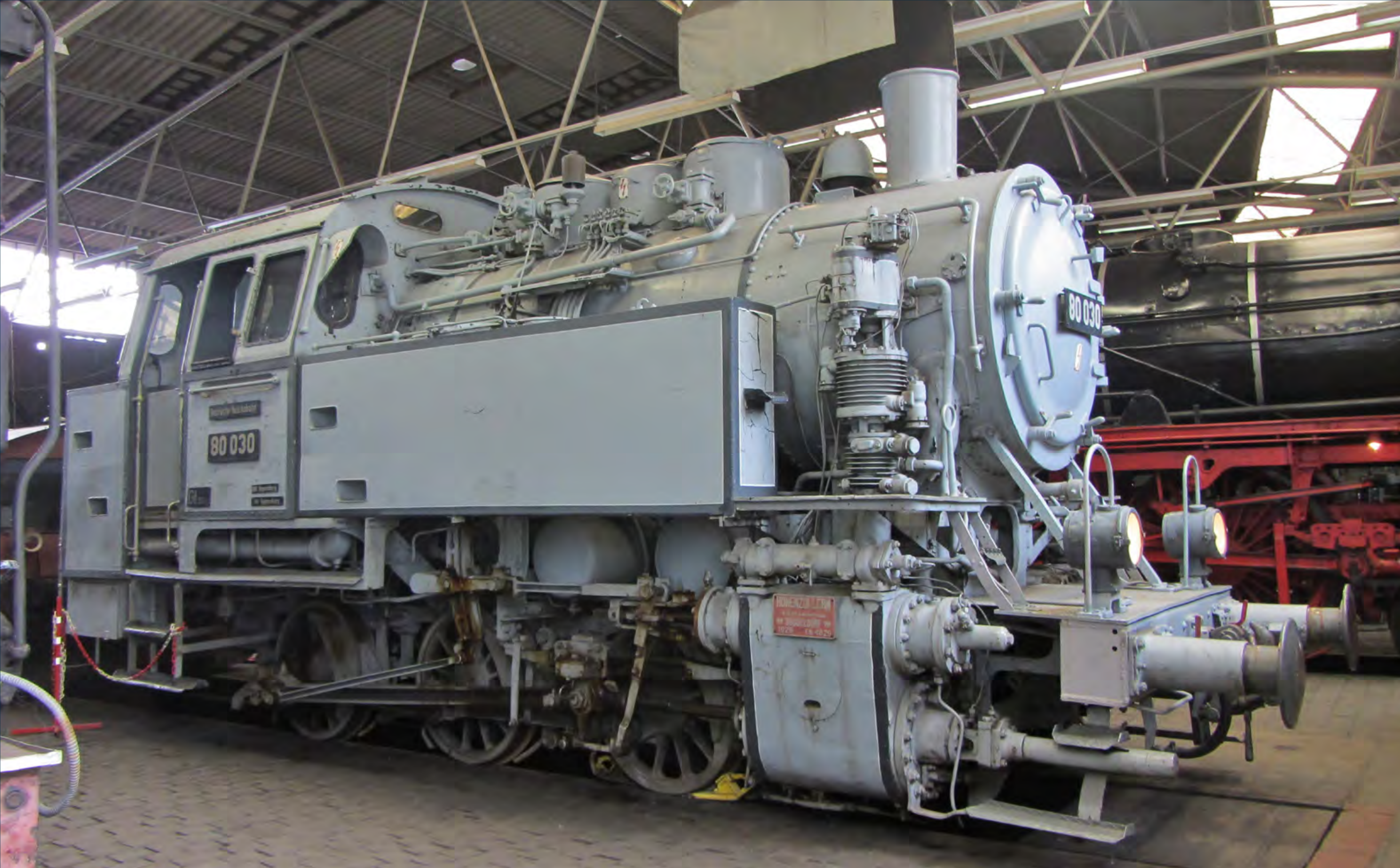
▶ Dampflok BR 0-6-0T No. 80.030 is pictured inside Bochum Dahlhausen shed.