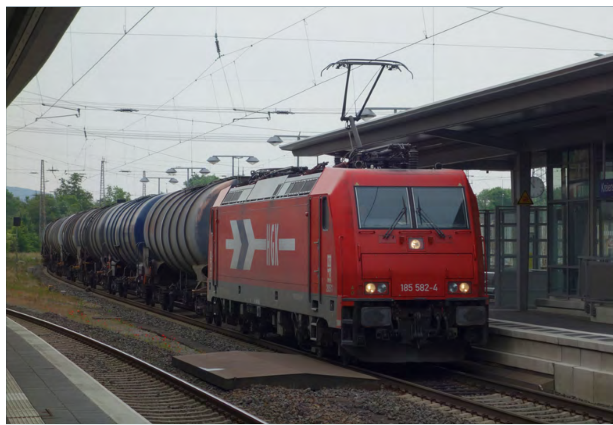
HGK operated Class 185.582 passes through Kreiensen with a rake of tanks. Stearmsounds