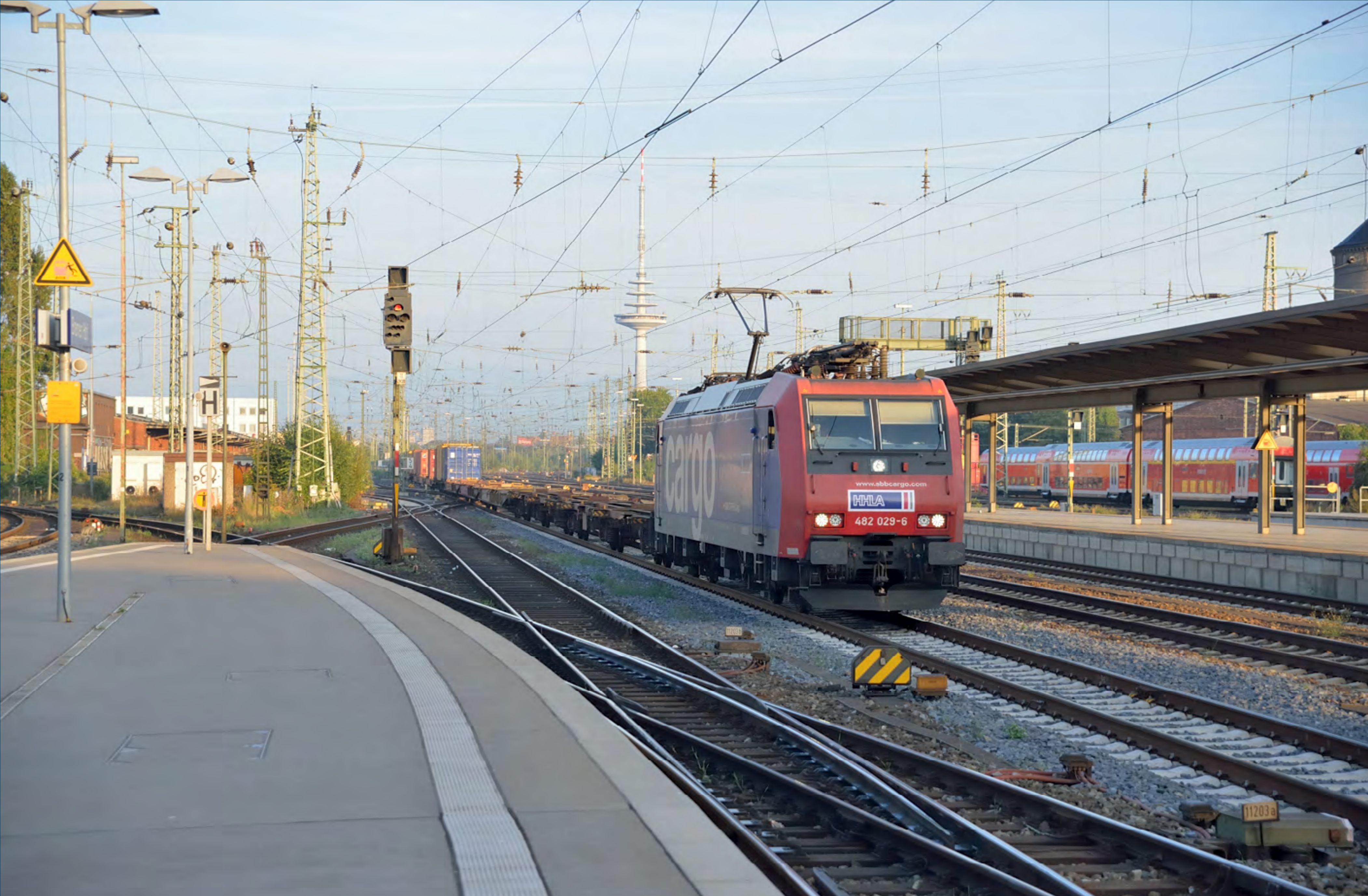
▶ HHLA/SBB Cargo Class 482.029 hauls a container train through Bremen Hbf. Class47