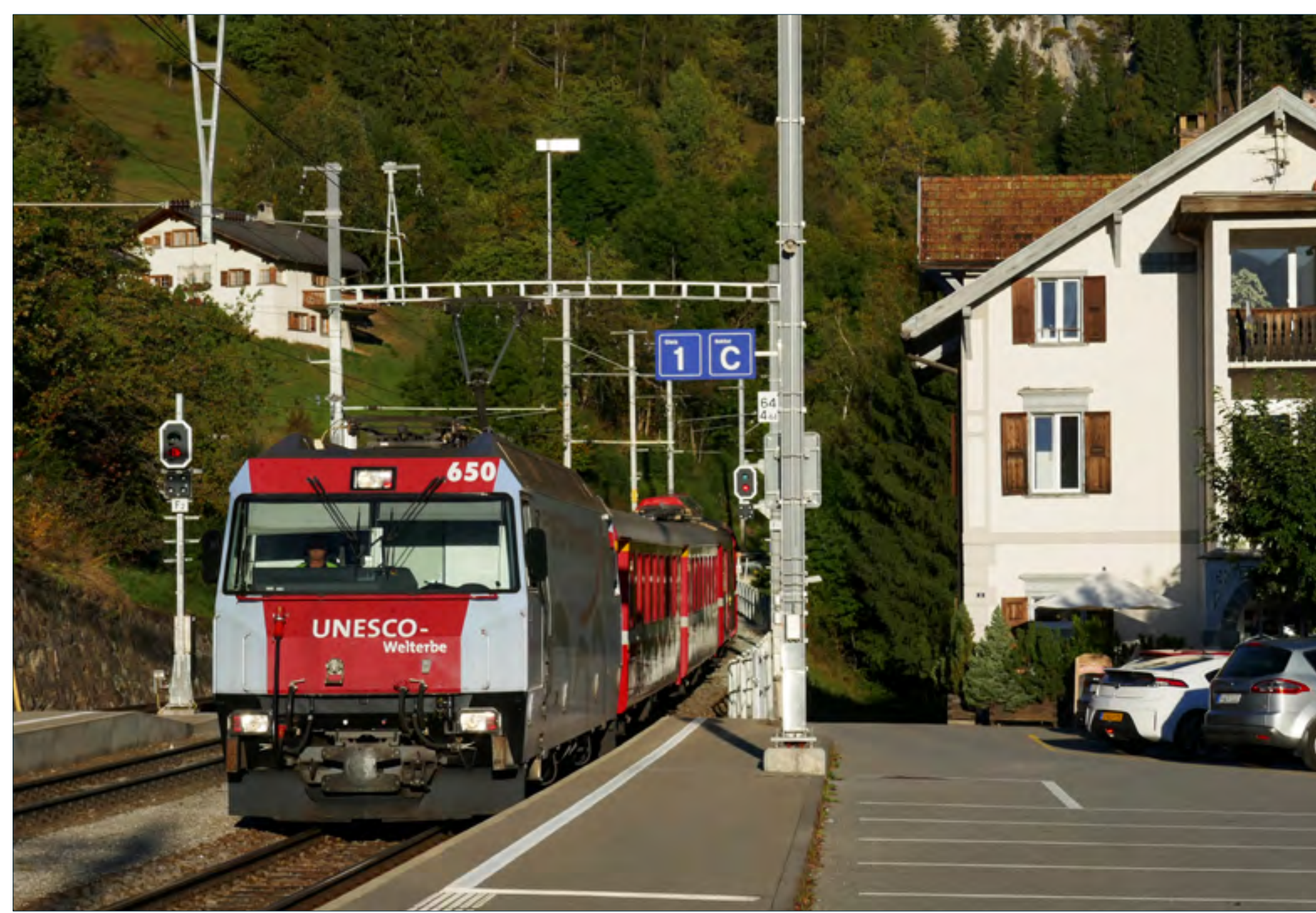
▶ RhB Ge 4/4III No. 650 arrives at Filisur with train No. RE1160 from St. Moritz to Chur. Stearnsounds