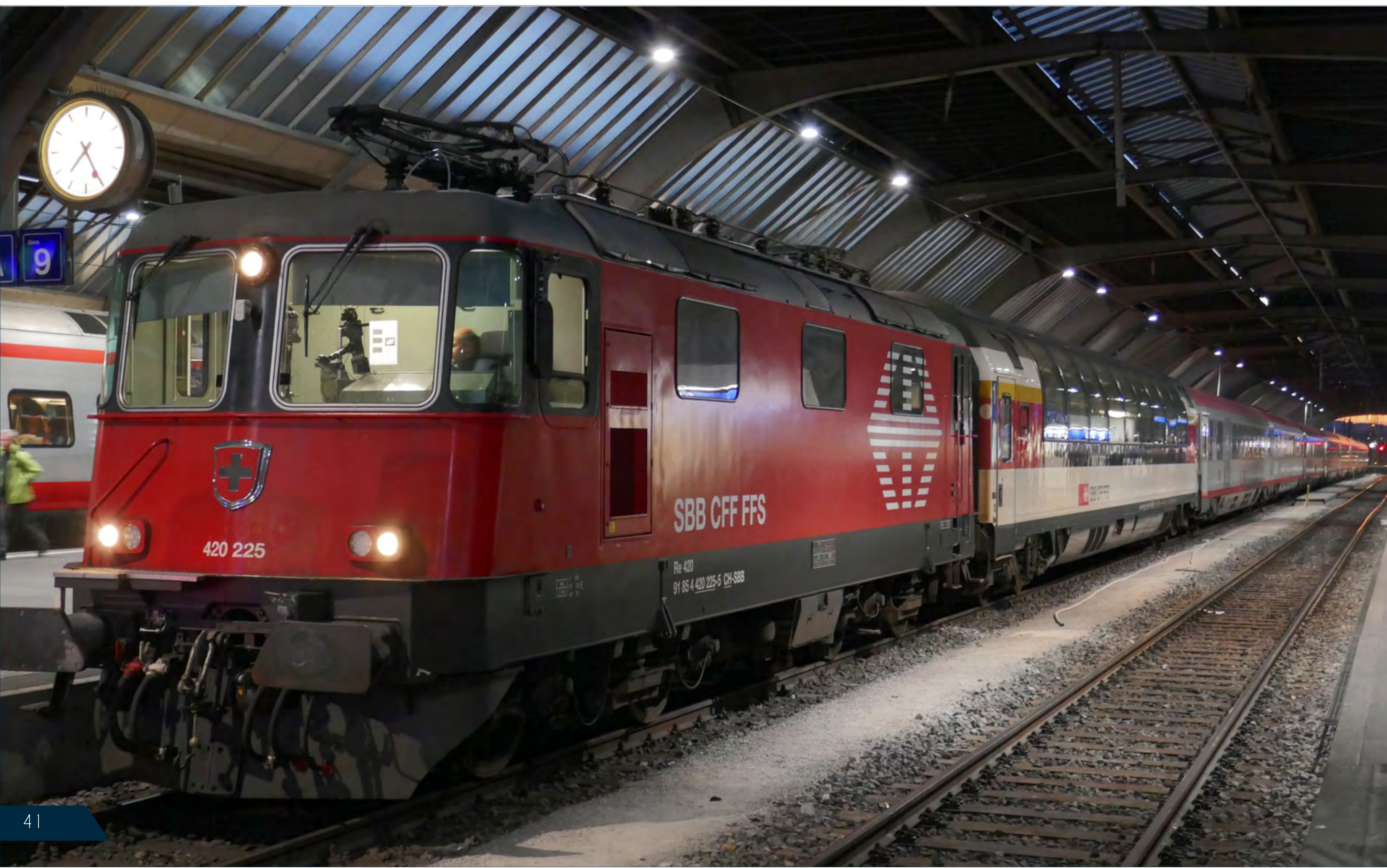
▶ SBB RABe No. 514.024 calls at Pfäffikon SZ with an S-Bahn service to Weinfelden. Steamsounds