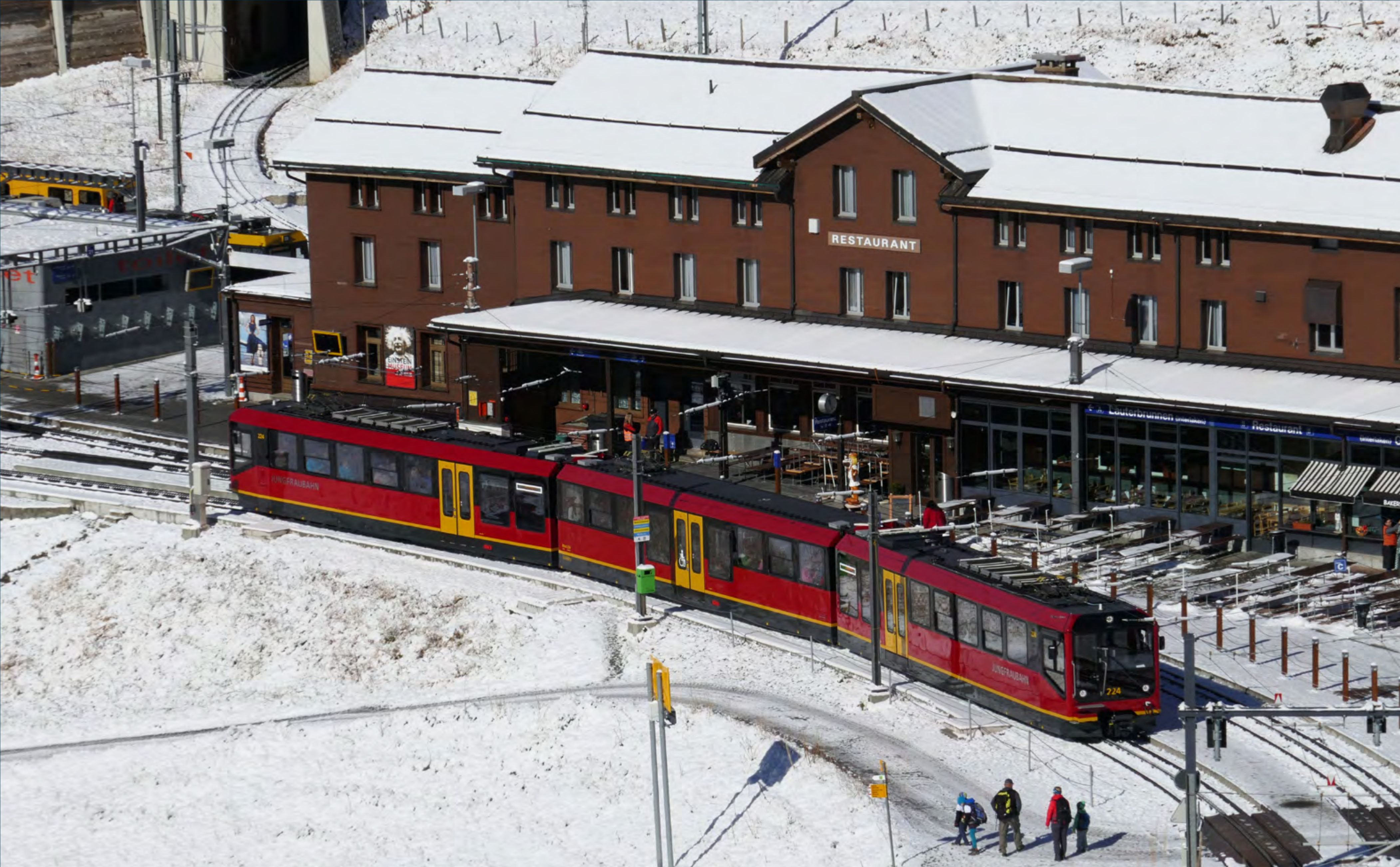
▶ JungfrauBahn Bhe 4/8 No. 224 stands at Kleine Scheidegg. Stearnsounds