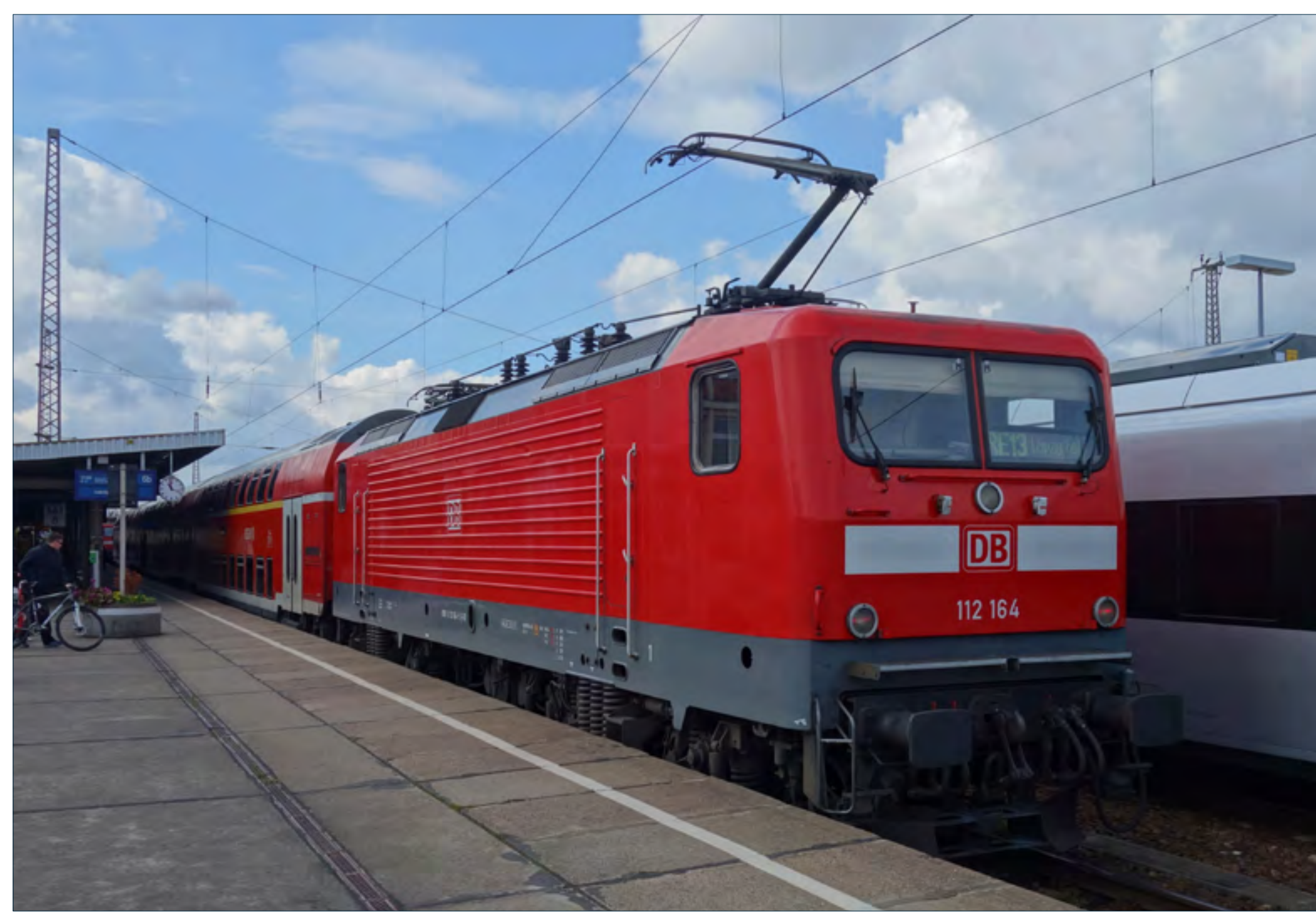
▶ DB Class 112.164 stands at Magdeburg Hbf with an RE13 service to Leipzig Hbf. Stearnsounds