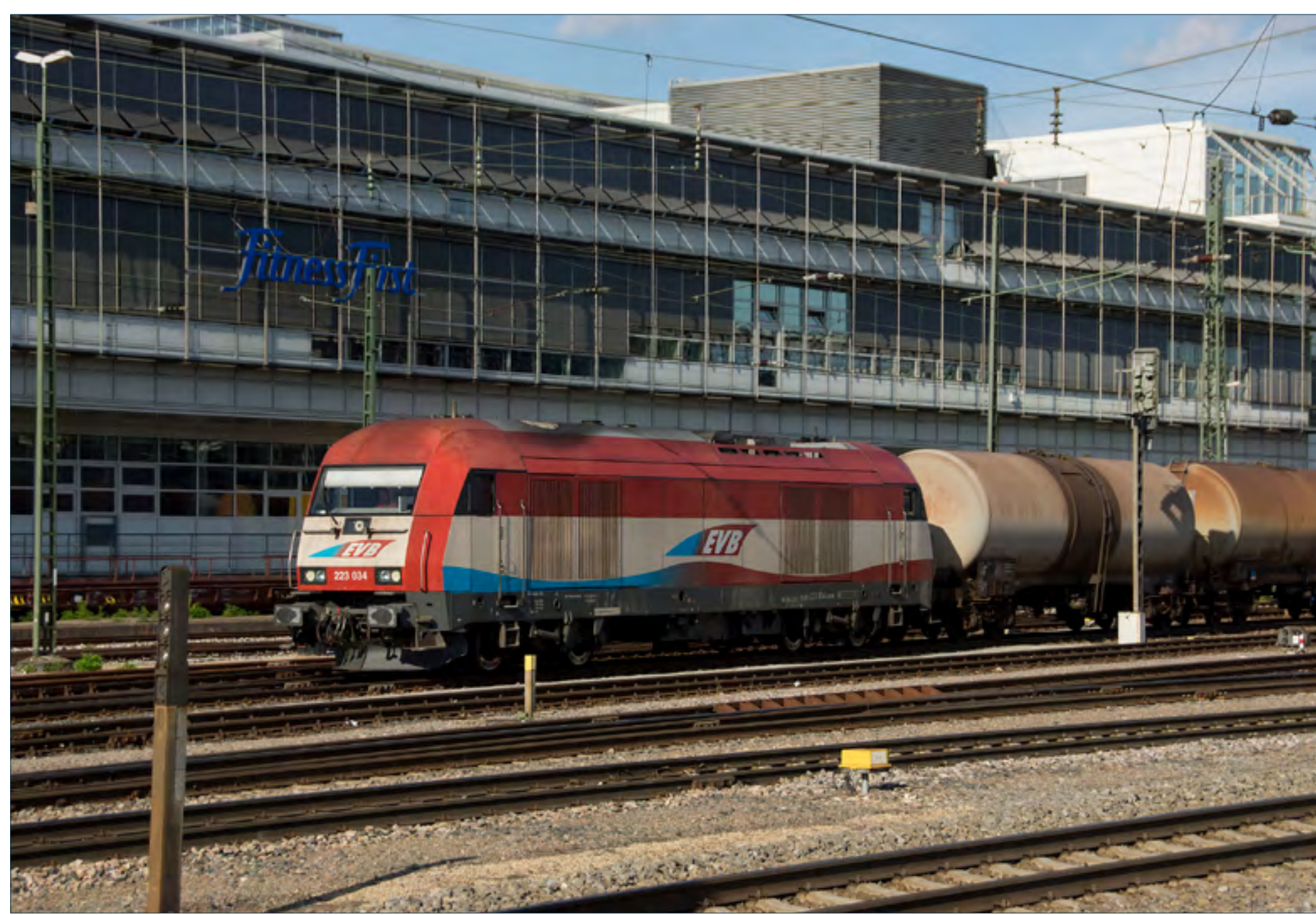
EVB's Class 223.034 hauls a rake of tanks through Regensburg Hbf.