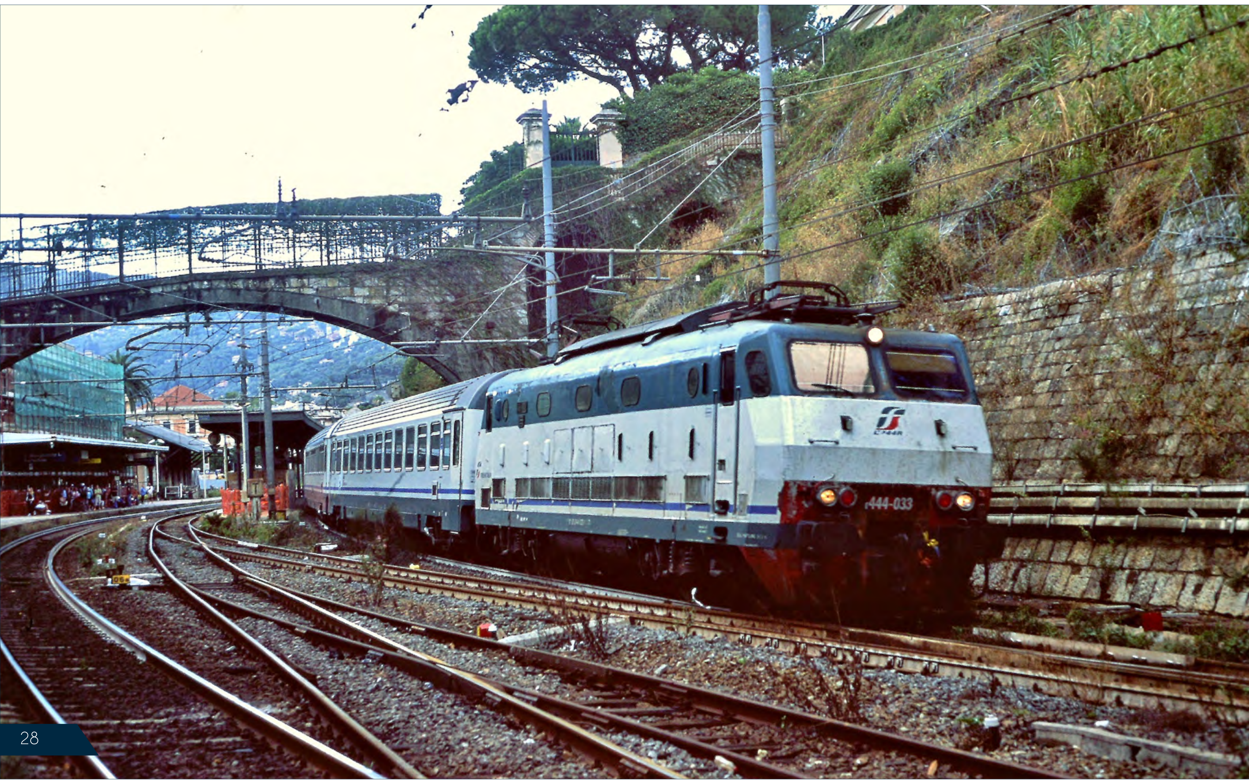
▶ TFT Class 626.006 is seen stabled at Bibbiena station. John Sloane