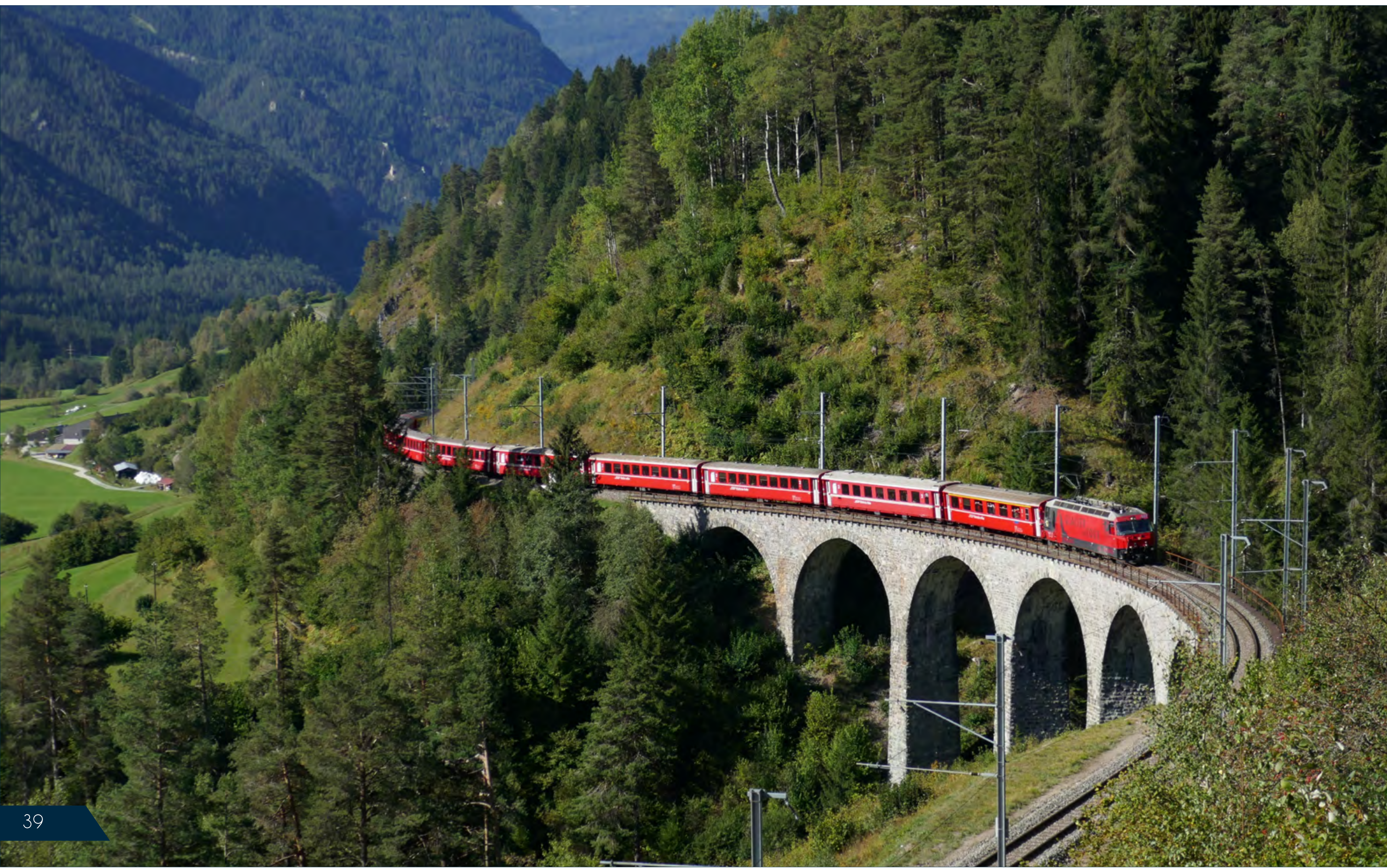
▶ Preserved RhB Ge 6/6I 'Krokodil' No. 407 stands outside the Bahn Museum at Bergün station. Steamsounds