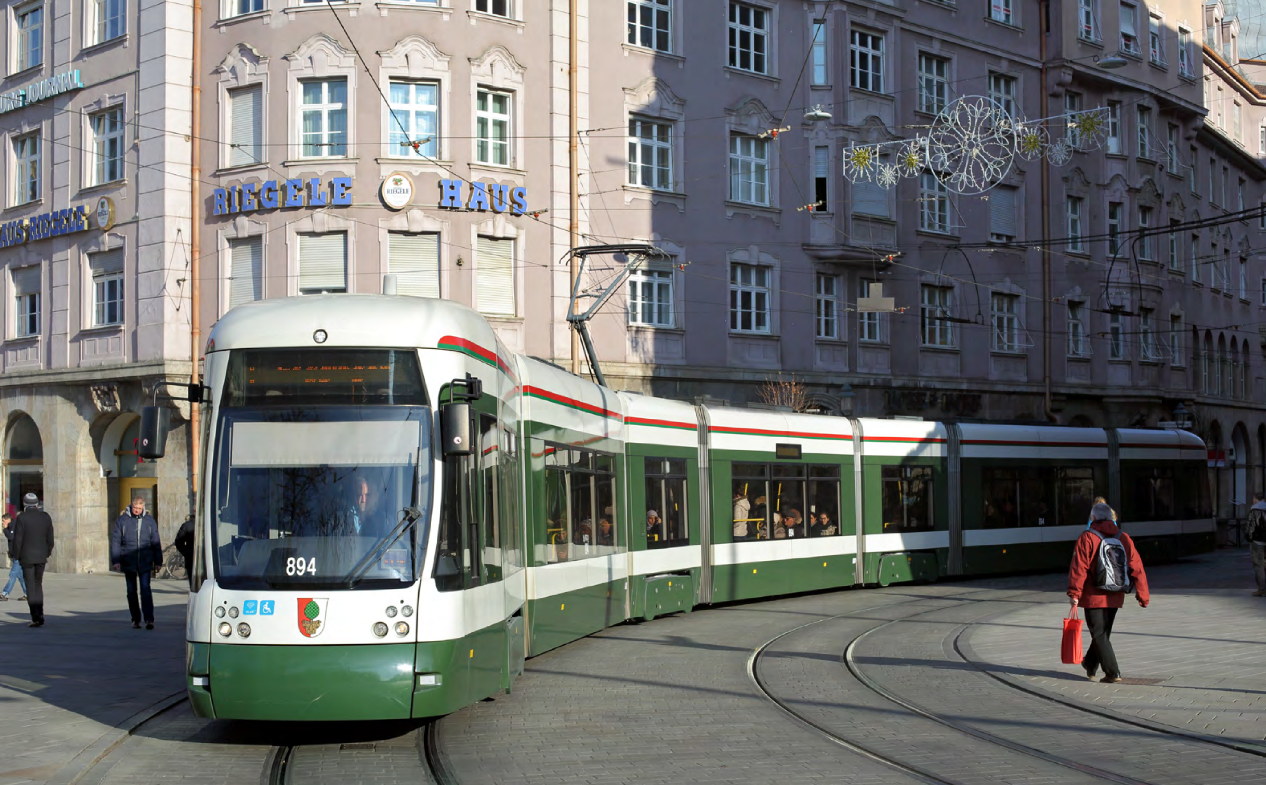
▶ Bombardier Flexity Outlook AVG Augsburg tram No. 894 is pictured in the centre of Augsburg at Konigsplatz on November 30th. Mark Bearton