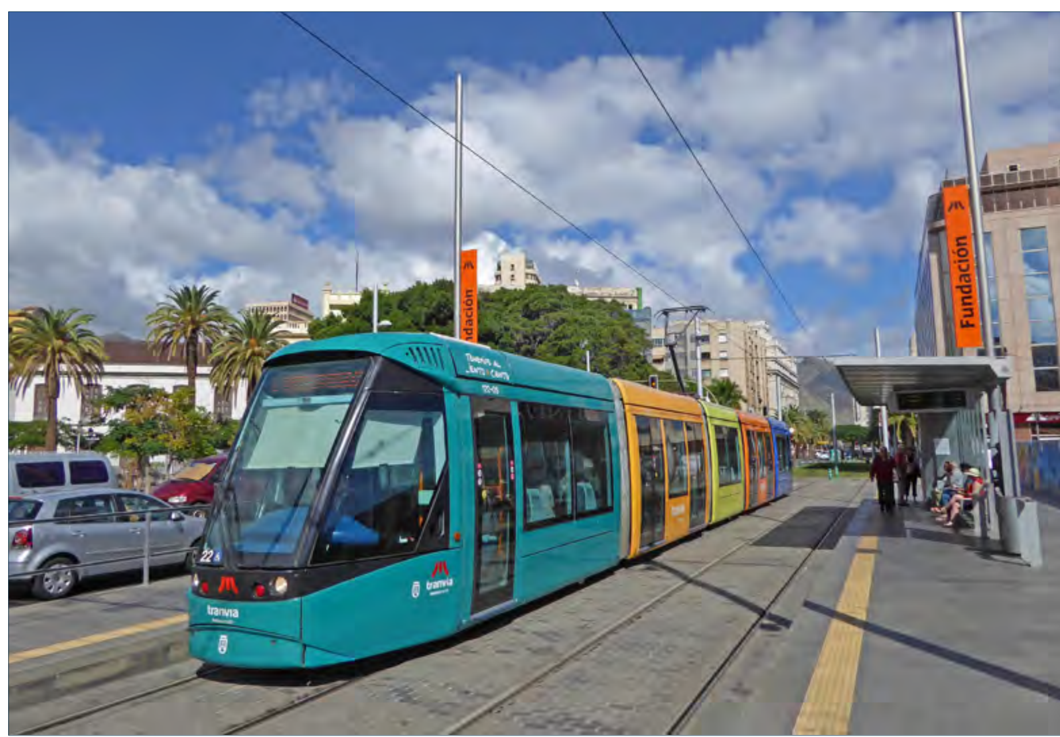
At Santa Cruz on November 13th, Tranvia Alstom Citadis tram No. 09 departs Fundación on route No. 1, heading for La Trinidad.