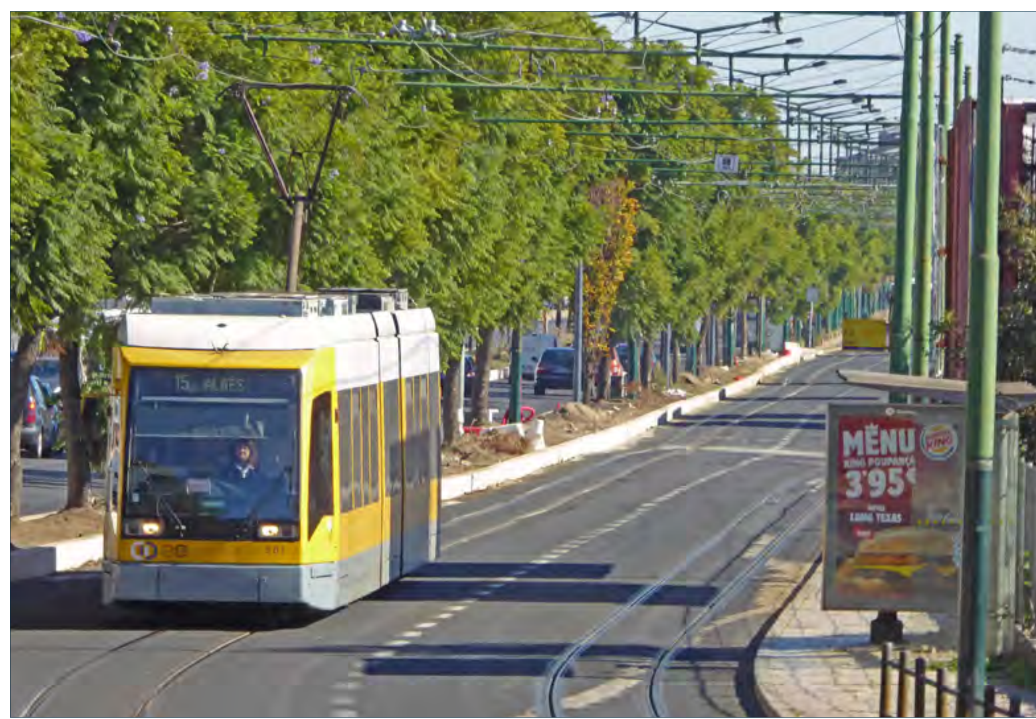
Siemens built tram No. 501, working route 15 to Alges, is photographed on November 15th. Michael Lynam