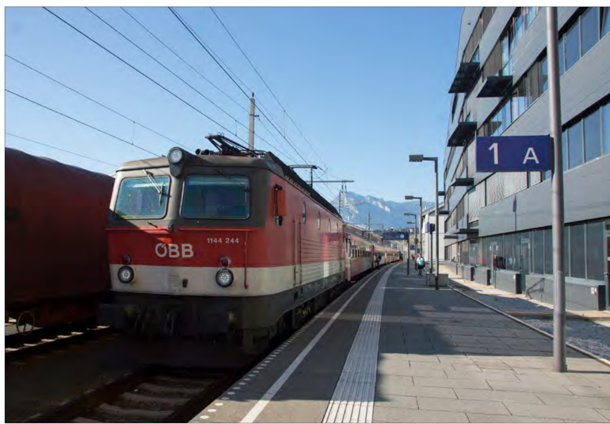
▶ Working a REX service to Worgl, ÖBB Class 1144 No. 1144.244 stands at Salzburg Hbf. Brian Battersby