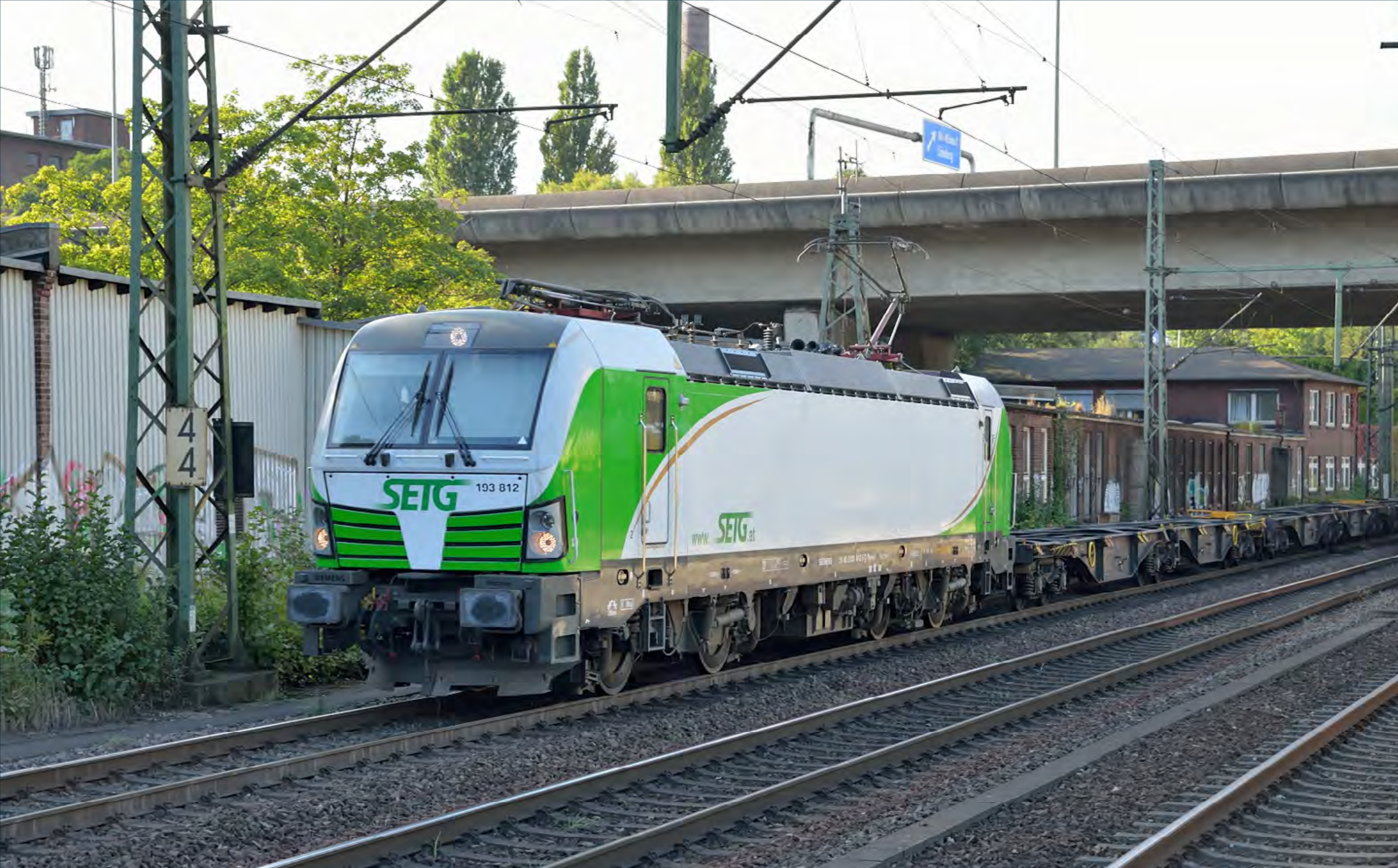
STEG operated Siemens Vectron Class 193.812 passes through Hamburg-Harburg on September 21st with a rake of empty container flats. Class47