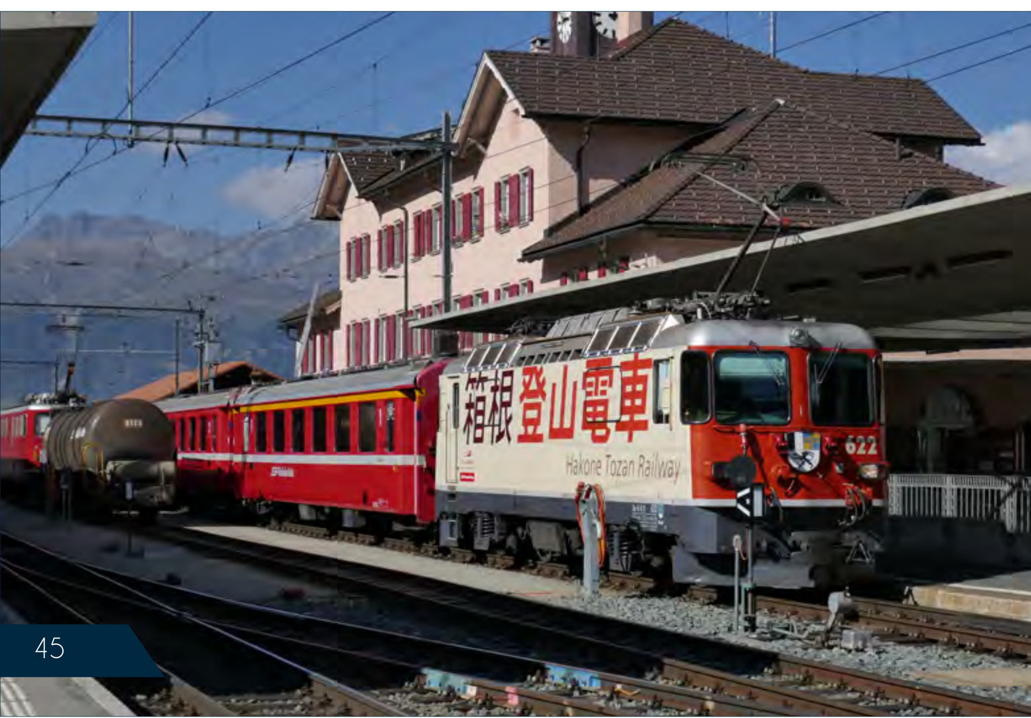
▶ On September 30th, RhB Ge 4/4II No. 622 stands at Pontresina with a service from Scuol Tarasp. Steamsounds