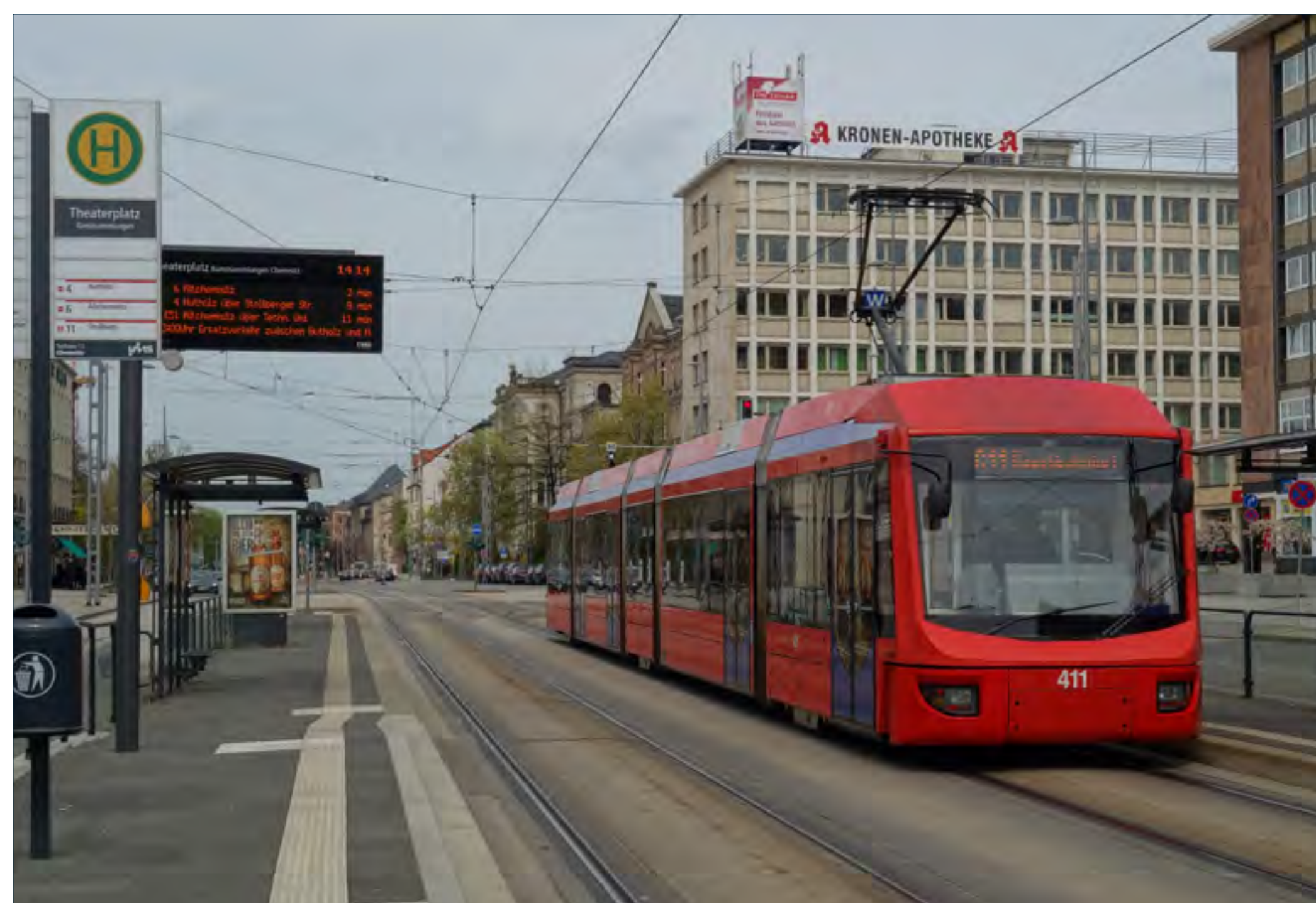
Chemnitz Bombardier 6NGT-LDZ tram No. 411 arrives at the Theaterplatz stop. Stearnsounds