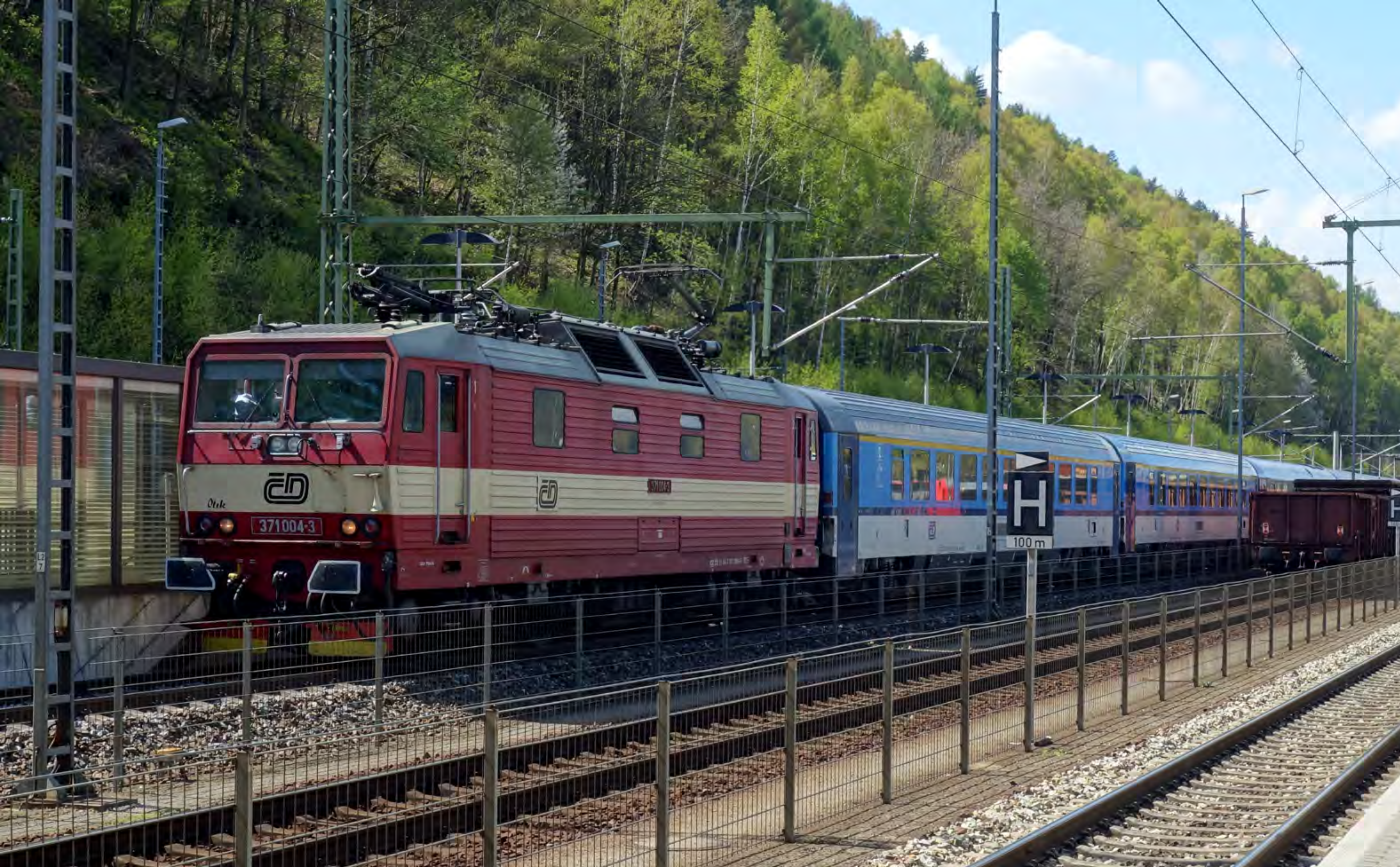
▶ Ceske Drahy's Class 371.004 calls at Bad Schandau working train No. EC379 to Praha hl.n. Steamsounds