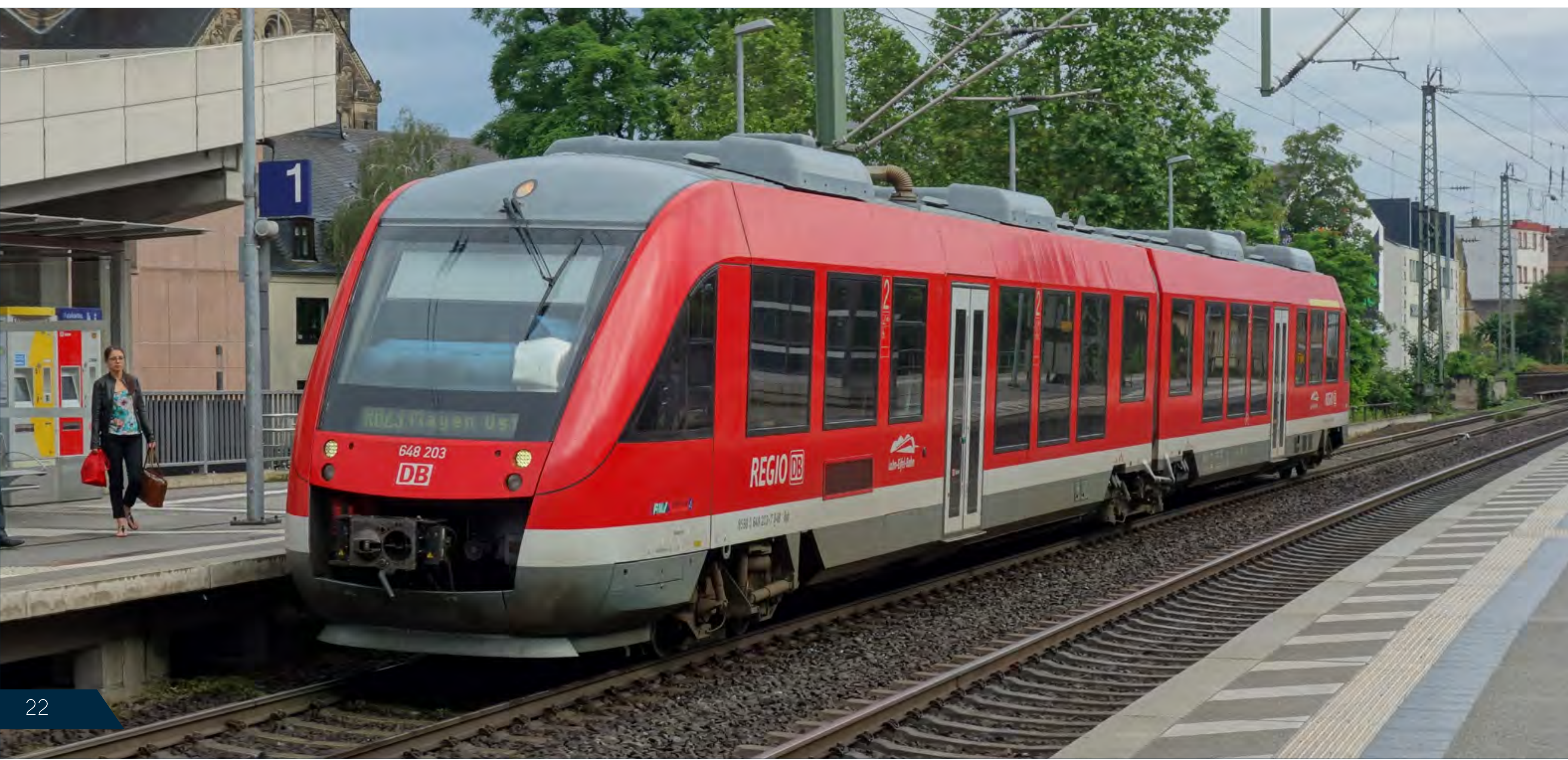
▶ National Express' Class 442.861 stands at Köln Hbf. Stearnsounds