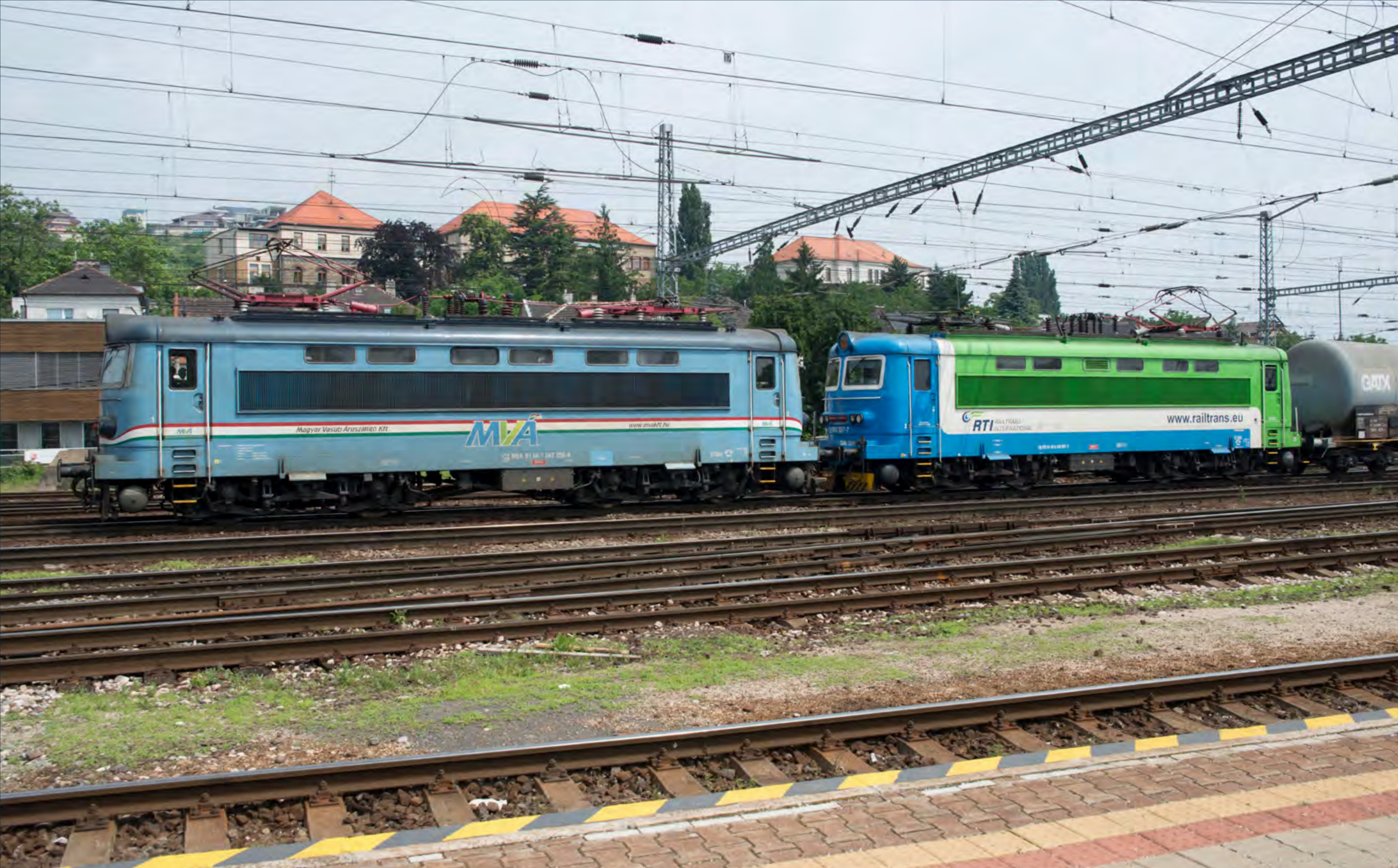
MVA Class 242.246 and Railtrans International Class 242.557 head a rake of GATX tanks through Bratislava Hlavna Stanica. Class47