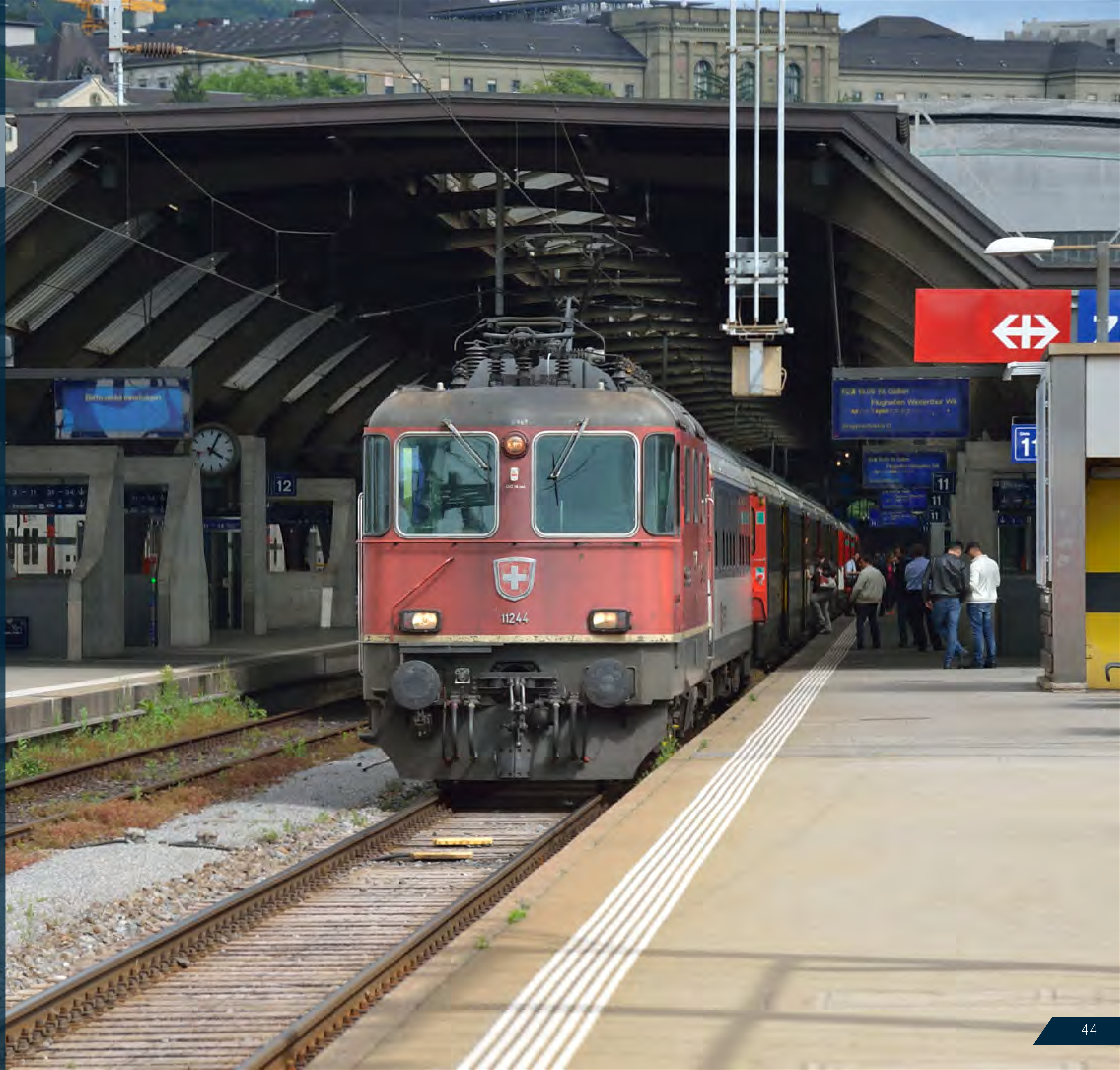
SBB Re 4/III No. 11244 waits departure time at Zurich working an IR service to St. Gallen. Class47