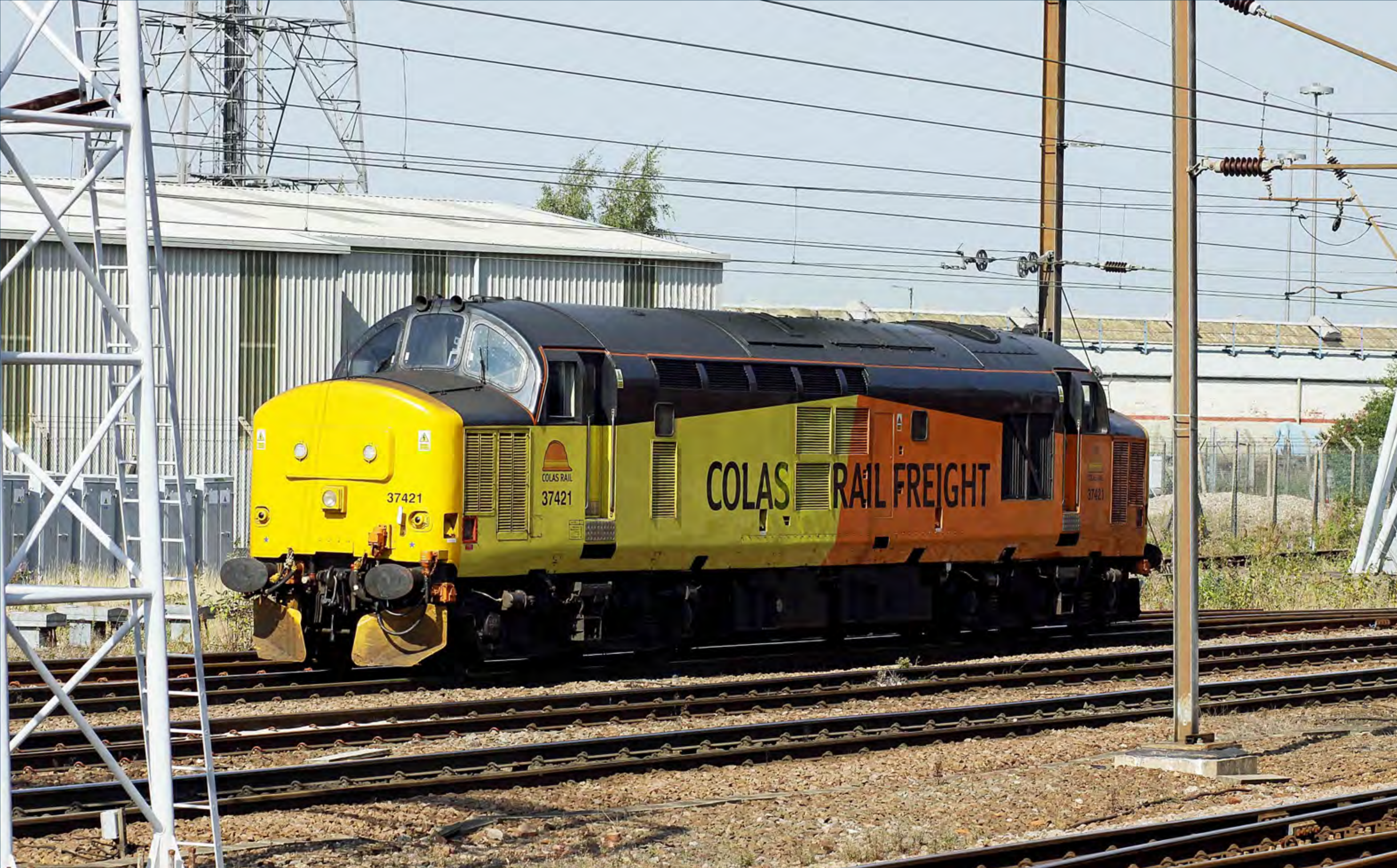
Class 37 421 arrives light engine into Doncaster on September 13th. Nick Clemson