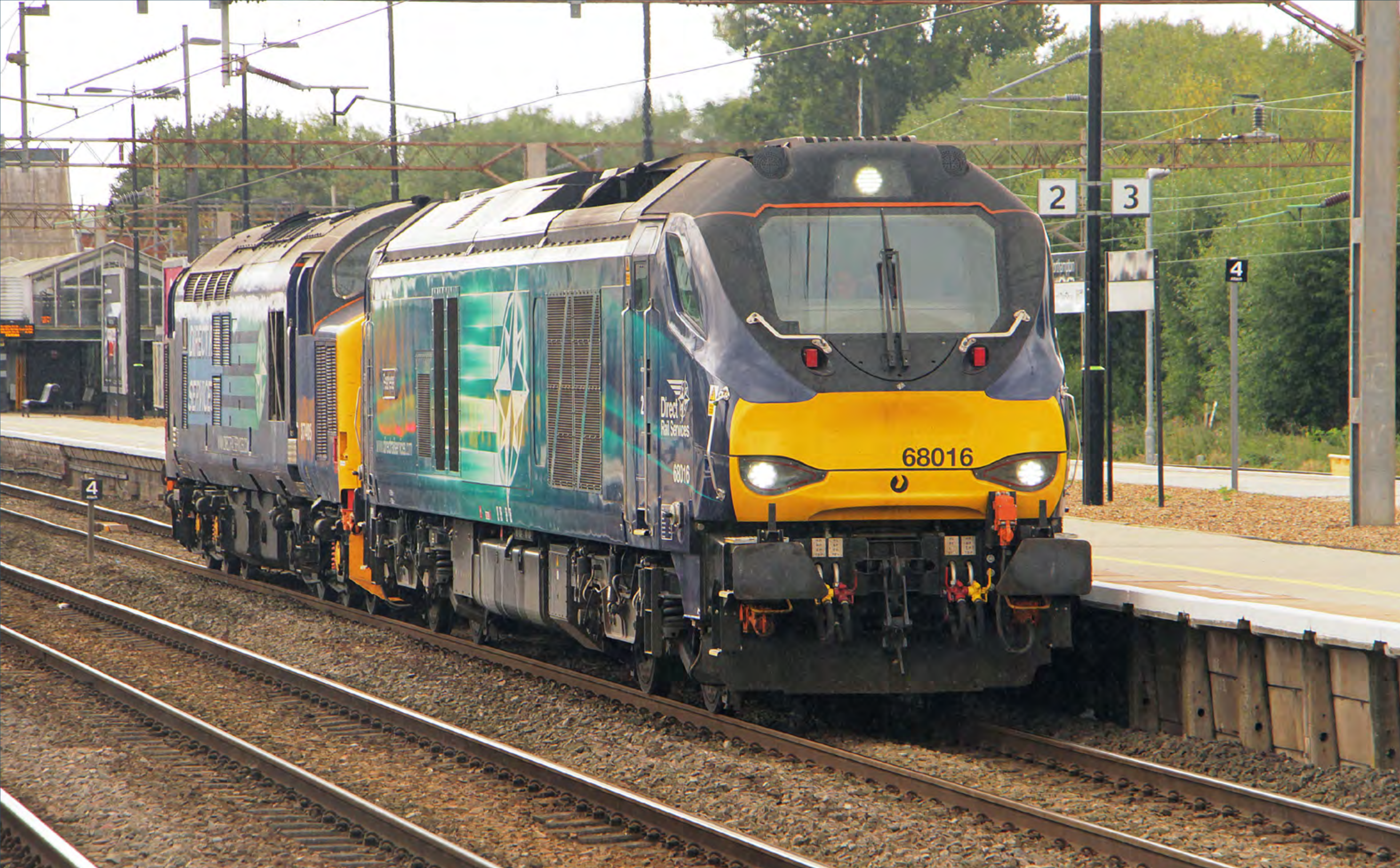
Class 68 016 'Fearless' tows 37 405 through Northampton on September 9th working the 09:05 Norwich Crown Point T.&R.S.M.D to Crewe Gresty Bridge (DRS). Derek Elston