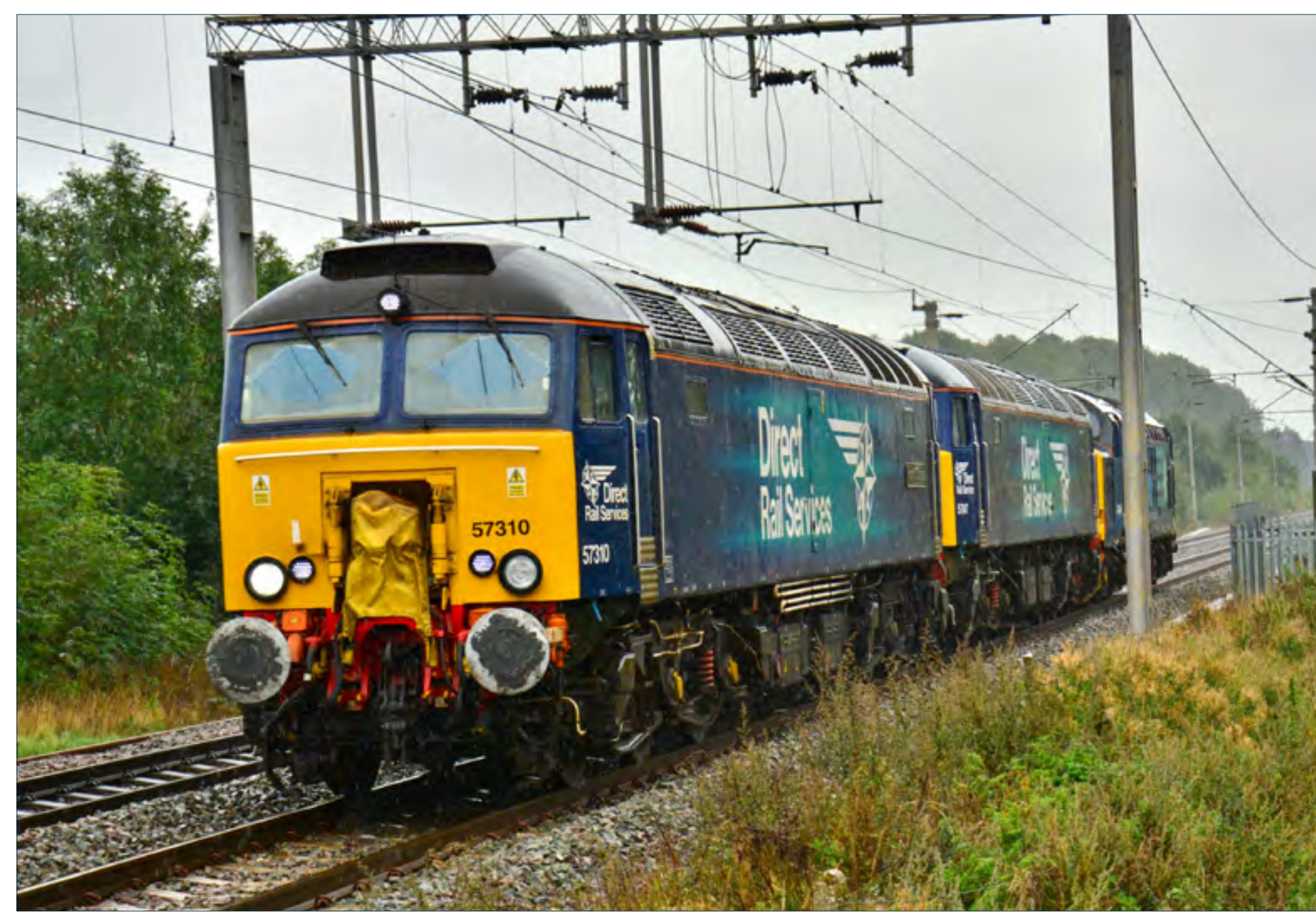
Class 57 310 pilots 57 007 and 37 419 through a wet Church Brampton on a wet September 19th on their way from Norwich Crown Point to Crewe. Geoff Barton