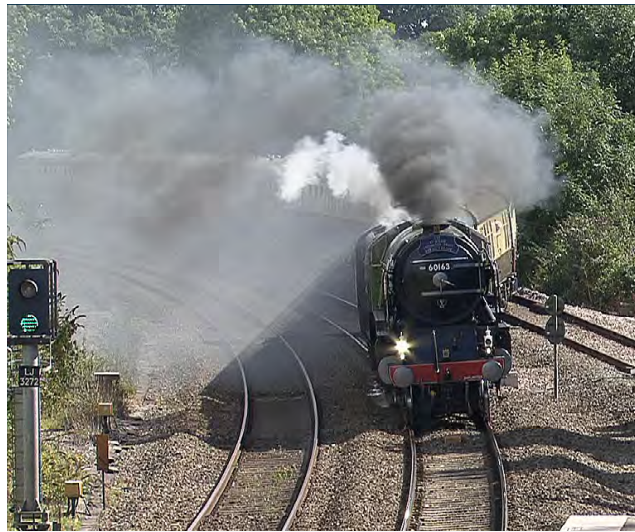
▶ LNER A1 No. 60163 'Tornado' is seen working a London Victoria to Bridgnorth charter on September 8th.