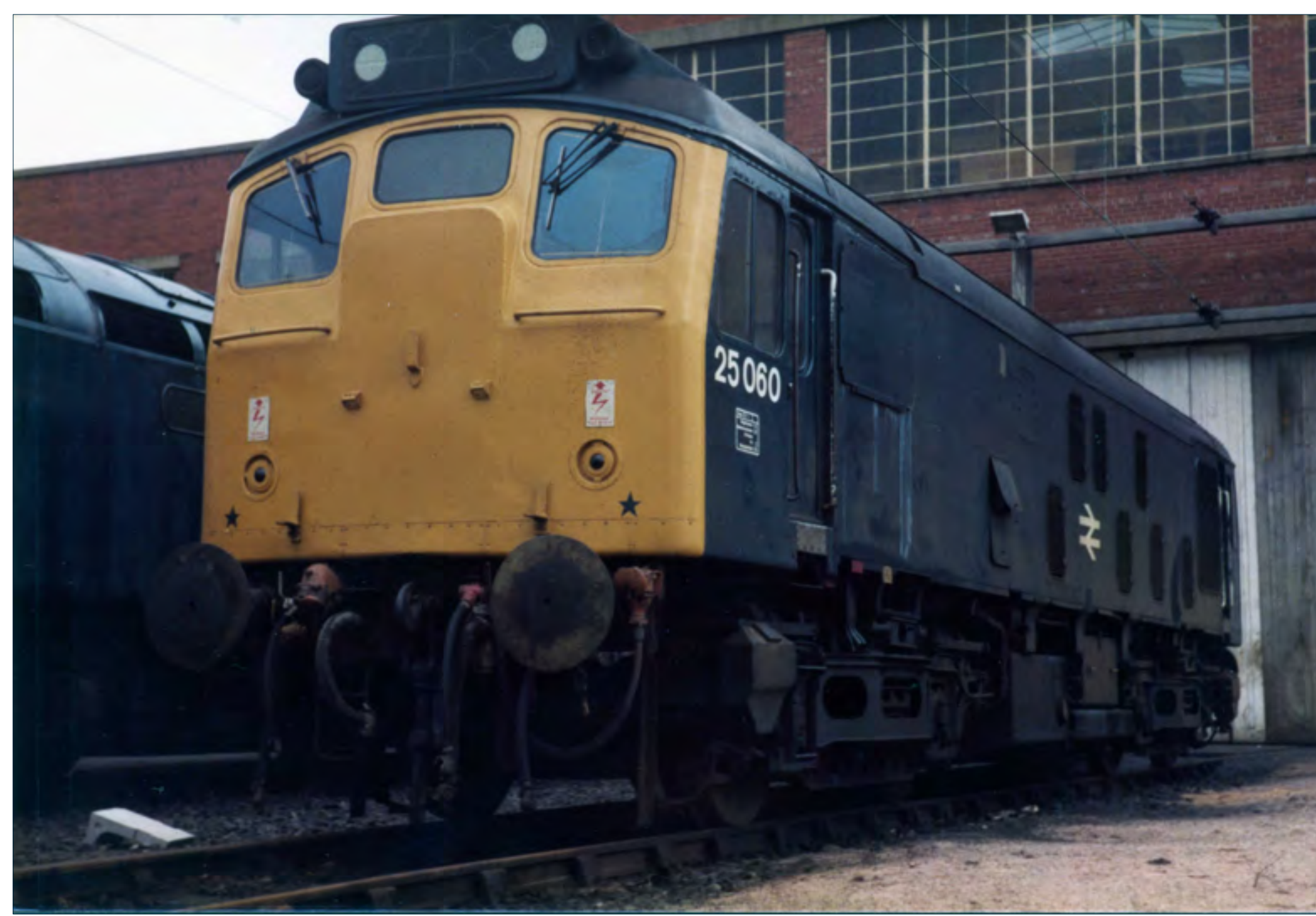
▶ On January 25th 1981, Class 25 060 is seen stabled at Reddish TMD. Steve Stepney