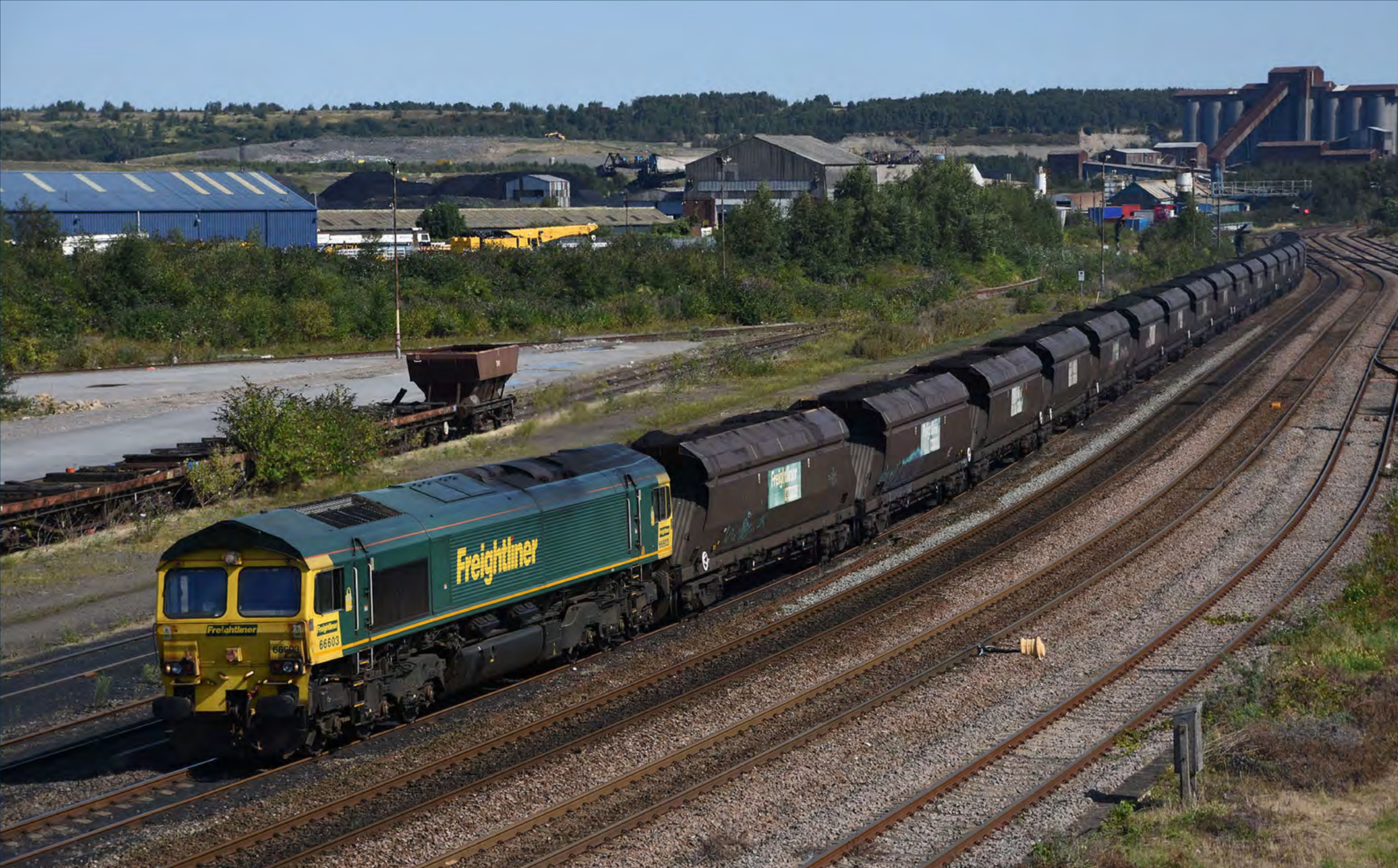
On August 30th, Class 66 603 arrives on the Up Goods at Scunthorpe prior to running round on 6C75 Immingham Bulk Terminal - CHP.