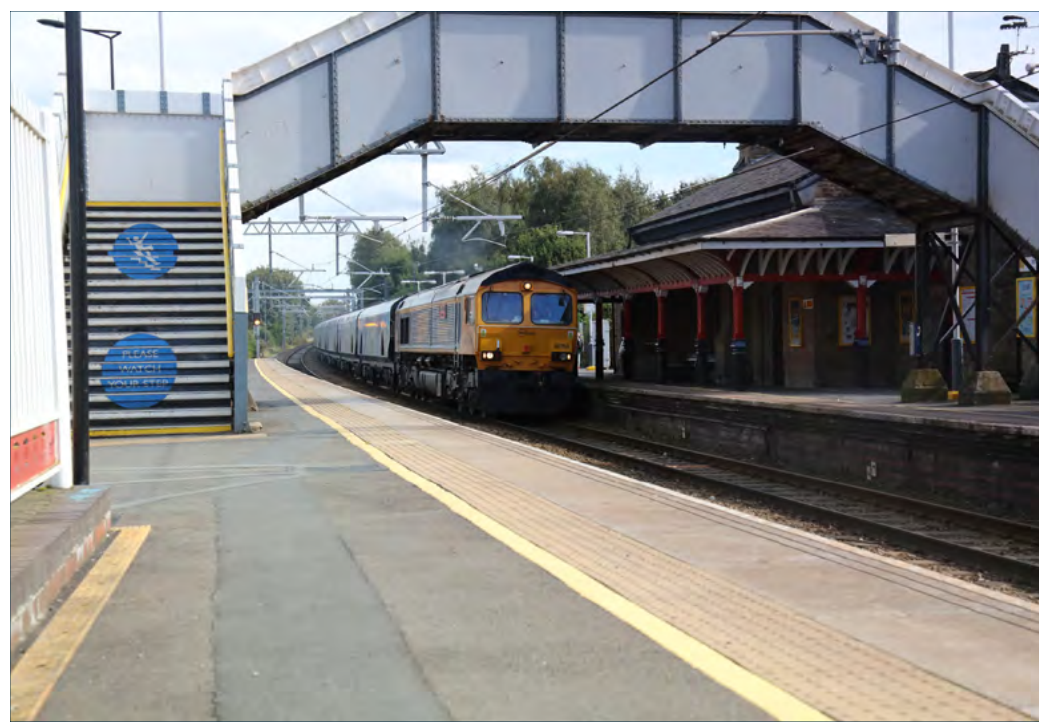
Most lunchtimes two GBRf Biomass workings pass through the historic Earlestown station. Here is the first one of the day on September 23rd as Class 66 703 heads the 4M37 09:54 empty working from Drax to Liverpool Biomass Terminal. Jeff Nicholls