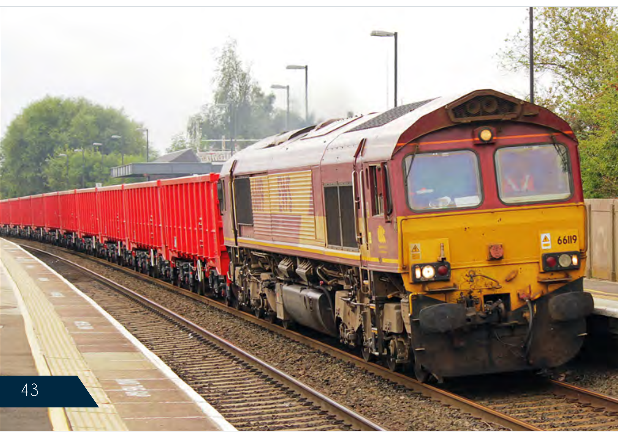
Class 66 004 and 66 119 are seen passing Wichnor Jct. on September 14th with the 6X45 Toton North Yard - Bescot Up Engineers Sidings. Keith Davies