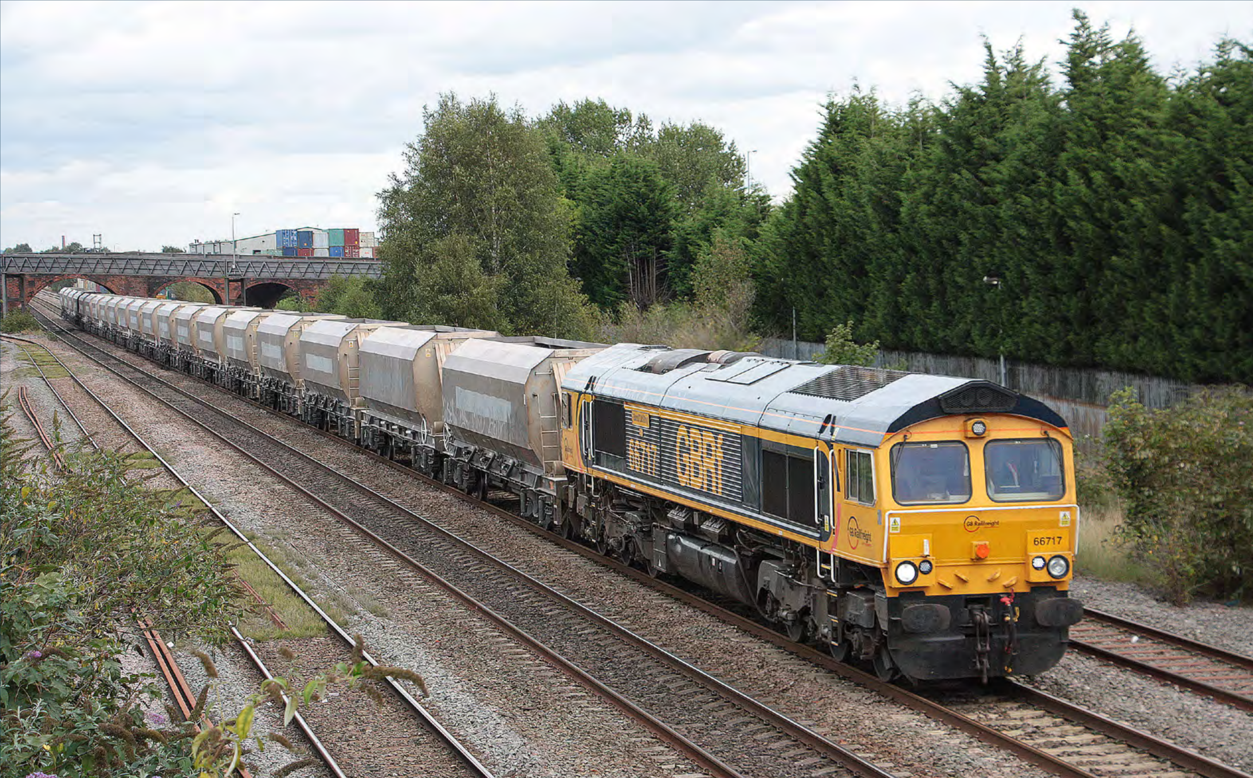
▶ Class 66 717 'Good Old Boy' working the 6V09 Tinsley - Coton Hill with empty hopper wagons, heads through Burton on September 23rd. Stuart Hillis