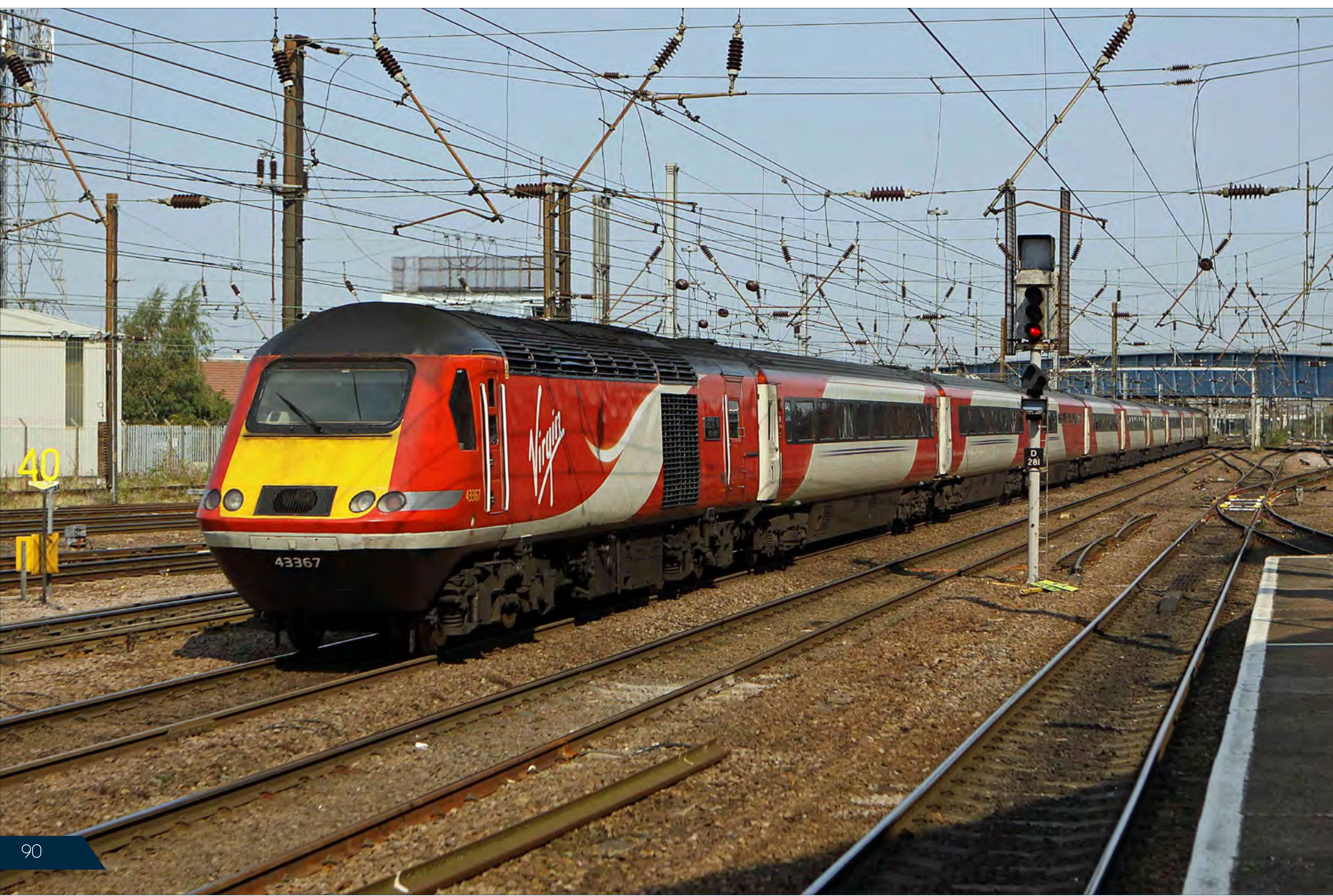
Power car No. 43367 heads north through Doncaster on the rear of the 10:00 London Kings Cross - Aberdeen service, September 13th. Nick Clemson