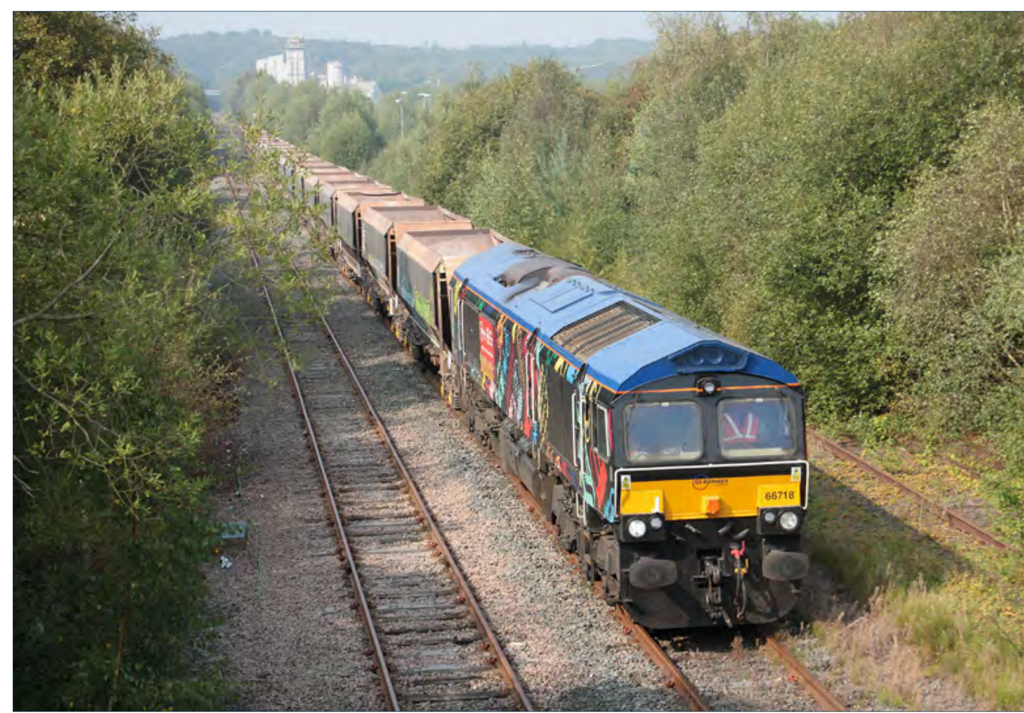
▶ Black tube map liveried Class 66 718 works the 6M83 Tinsley - Bardon Hill Quarry empty stone hoppers through Moira on September 15th. Stuart Hillis