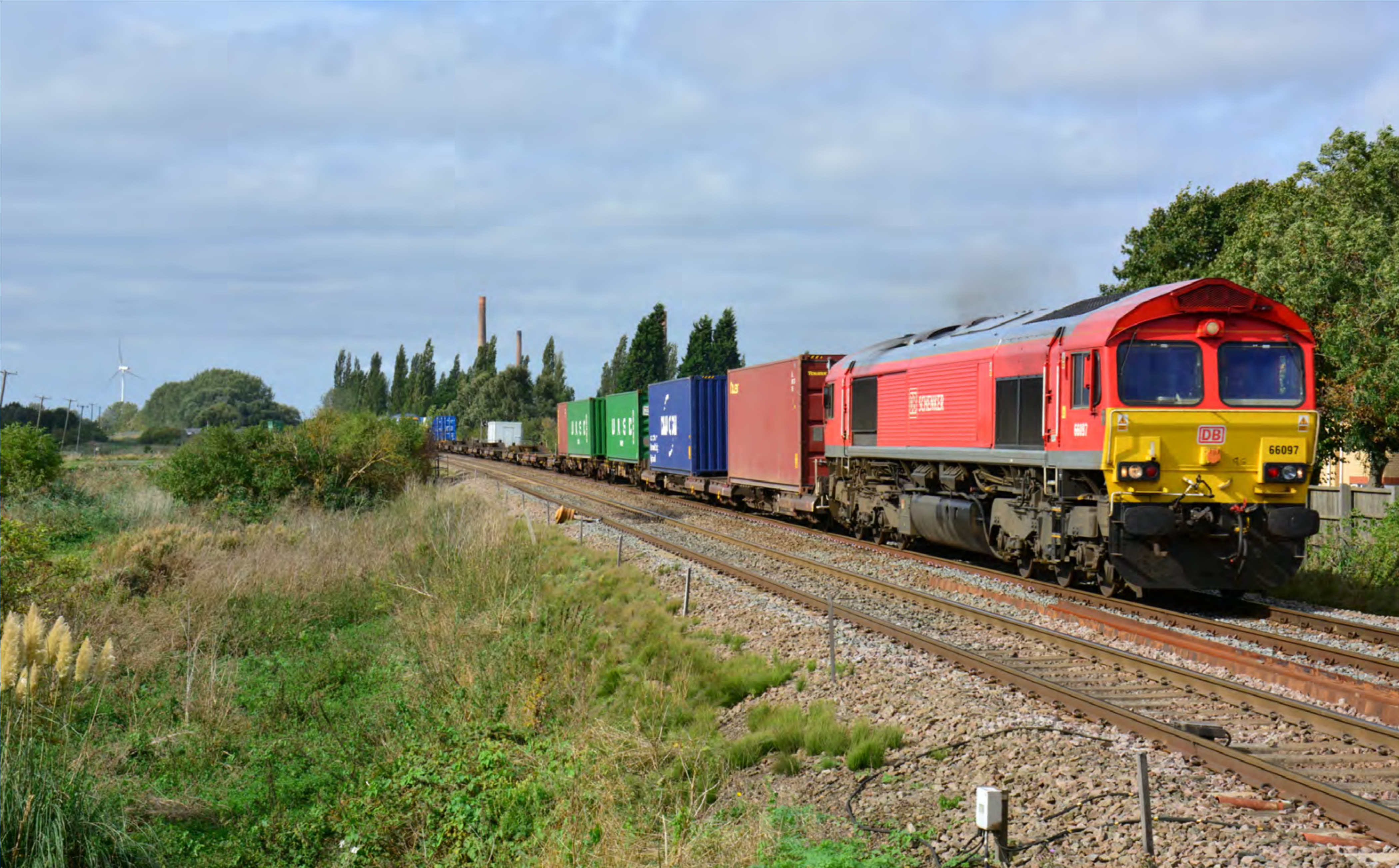
Seen heading through Whittlesey on September 28th, Class 66 097 hauls a liner from Wakefield Europort to Felixstowe South.