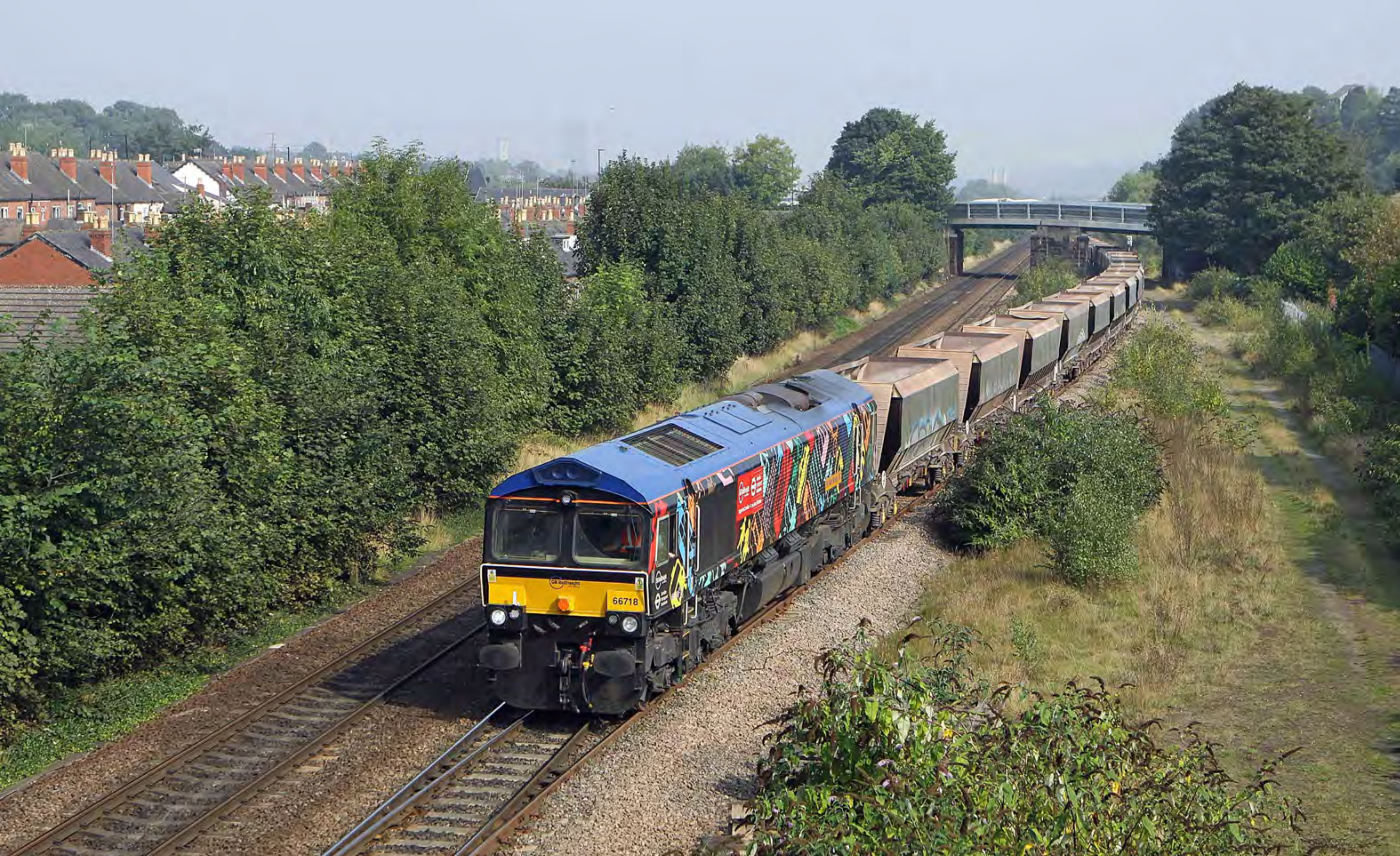
Class 66718 heads out of the loop at Woodhouses hauling the 6M83 10:51 Tinsley Yard - Bardon Hill on September 15th. Nick Clemson