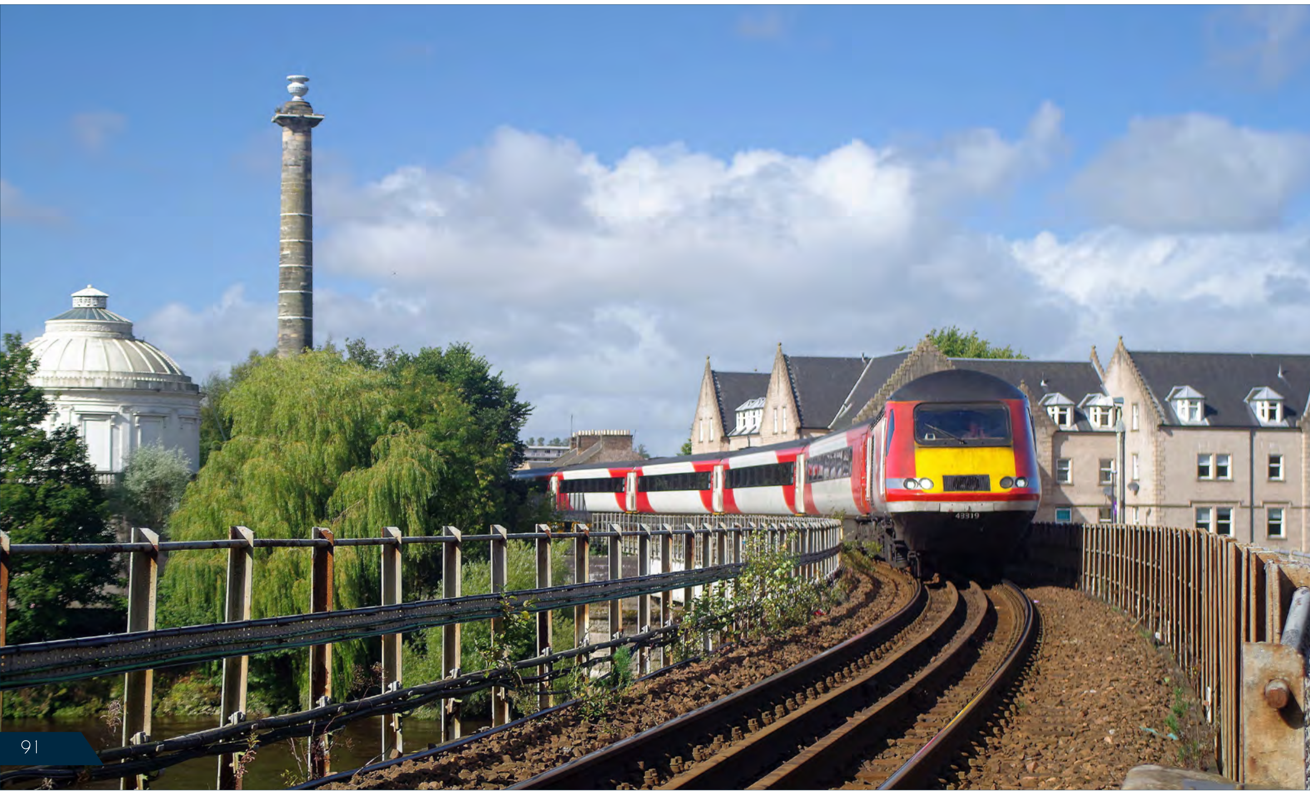
◀ Power car No. 43319 leads a diverted Leeds to Aberdeen service through Perth on September 10th. Richard Jones