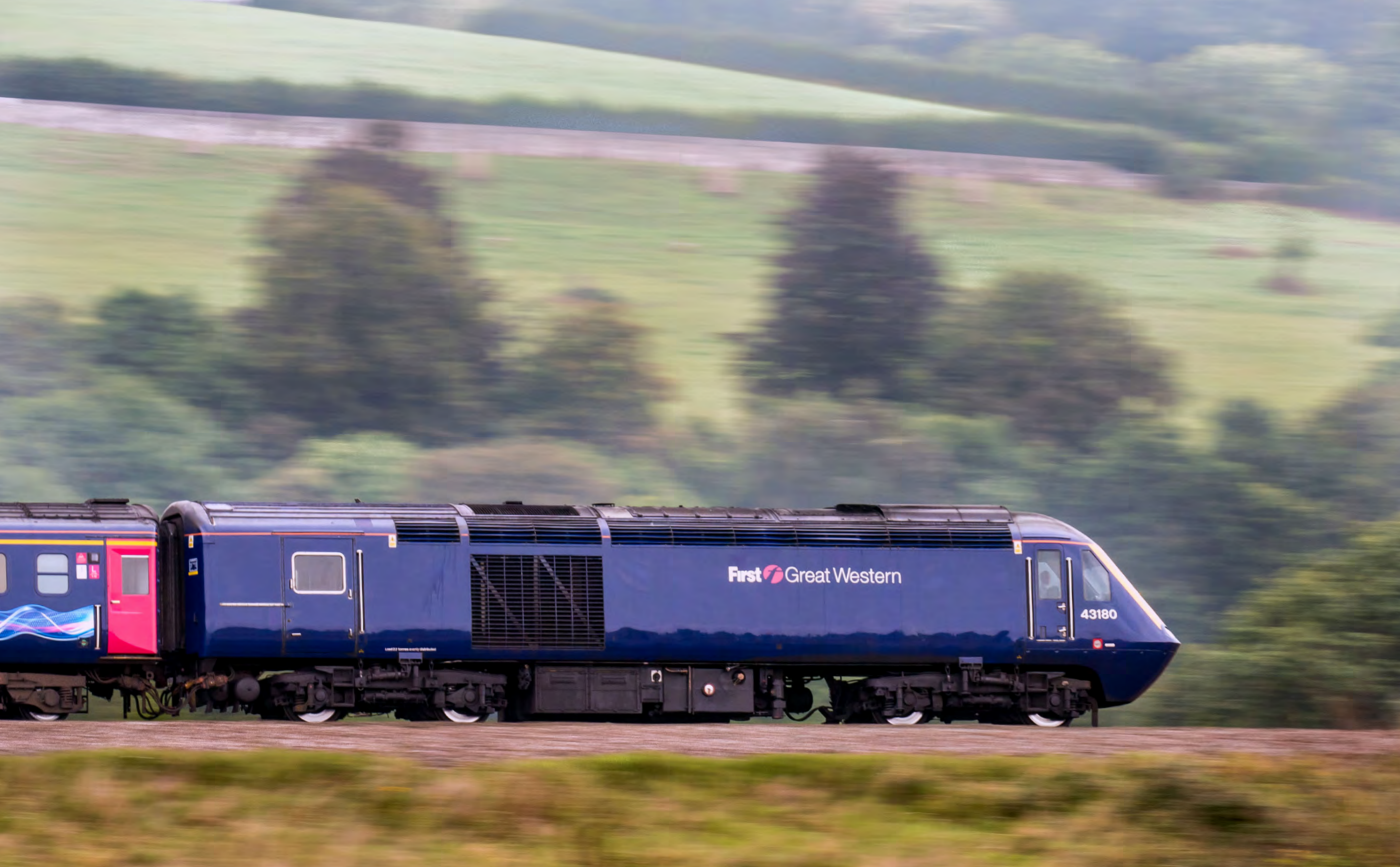
▶ 'HST at speed' as Great Western Railway's HST powercar No. 43180 working the 1A16 Penzance to London Paddington passes Newton St. Loe near Bath on September 17th. Brian Turner