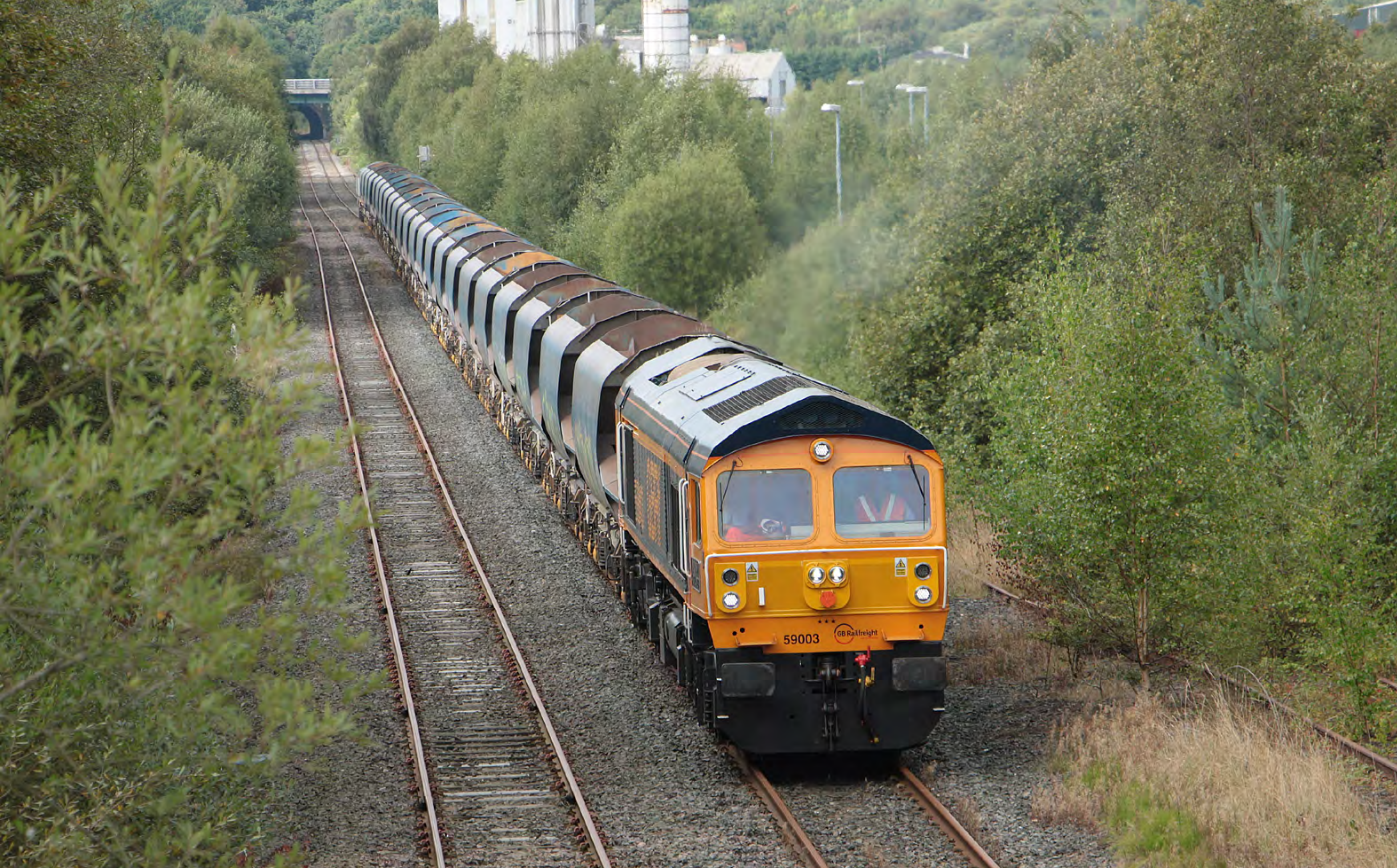
▶ Class 59 003 leads the 6M83 Tinsley - Bardon Hill Quarry (with 66 750 on the rear) seen passing Moira on September 12th. Stuart Hillis