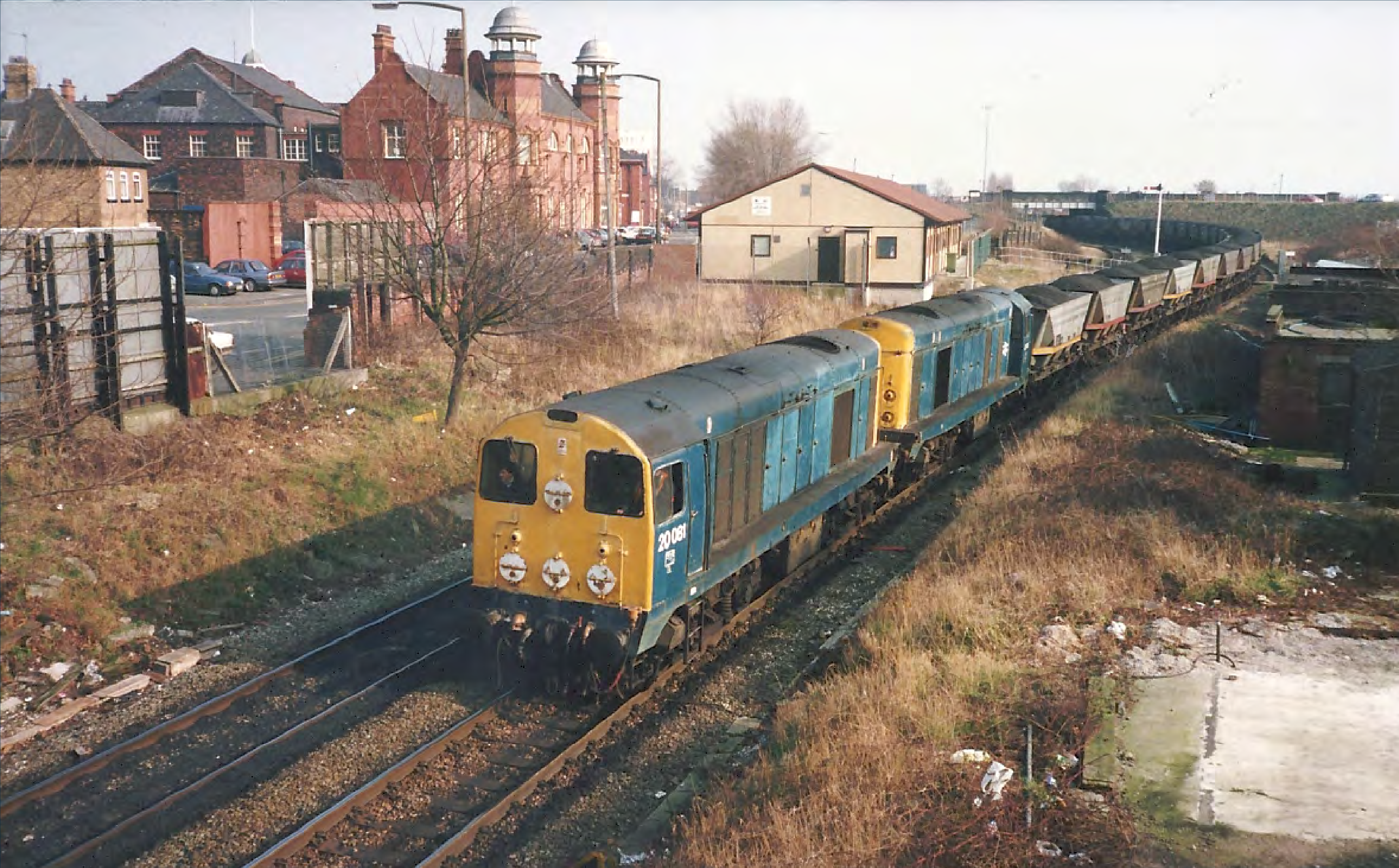
▶ Class 20 081 and 20 016 pass Warrington low level with a loaded coal train from Ayr Colliery - Fiddlers Ferry power station on February 25th 1992. Steve Stepney