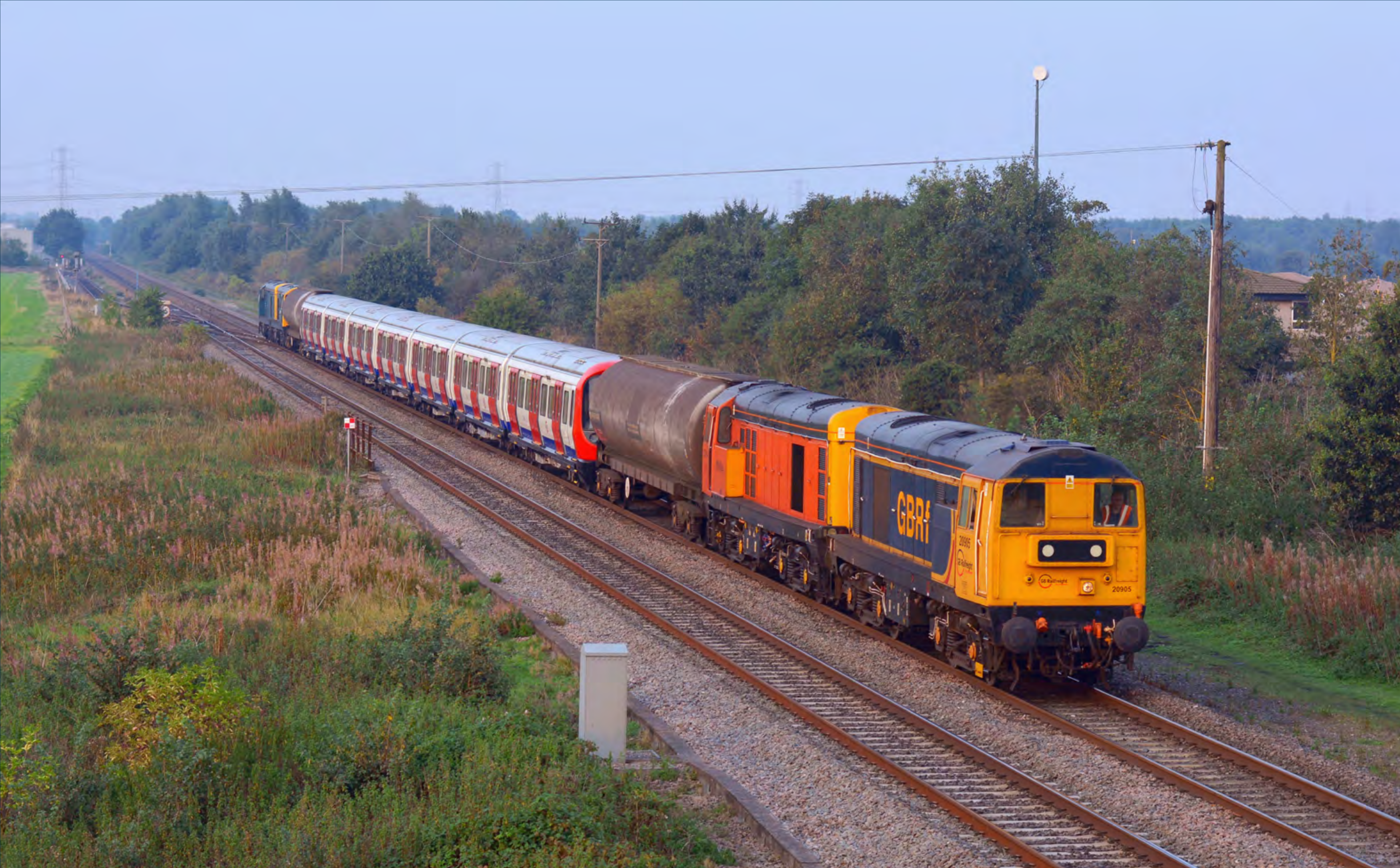
Class 20 905 and 20 314 (with 20 107 and 20 096 on the rear) pass Wichnor Jct. with the 7X09 11:32 Old Dalby - West Ruislip on September 14th. Keith Davies