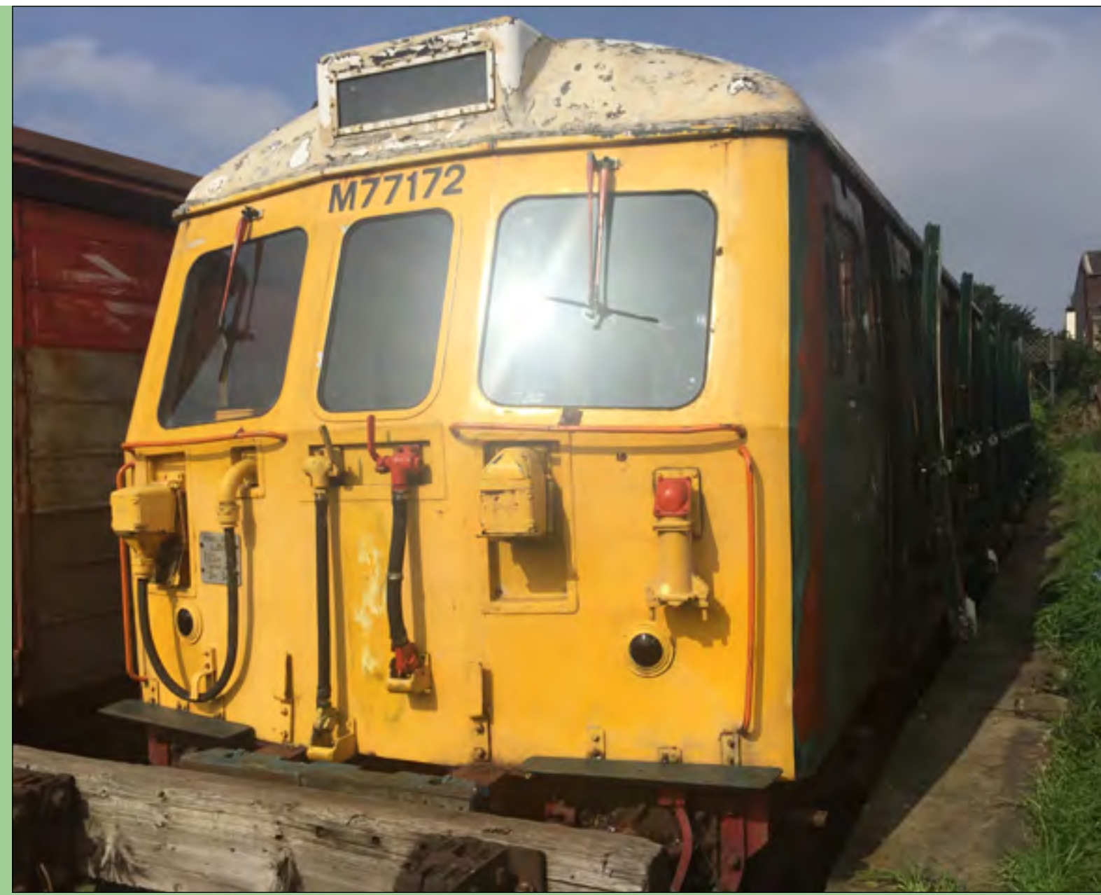
Photo: M77172 at Buckley Wells during the inspection on September 15th.

to both sides and more work can be carried out the complete the next stage of the restoration. The Society would like to thank all its members for their support since the creation of the Society and hope they will continue to support us in the future. More information can be found at www.class504preservationsociety.co.uk