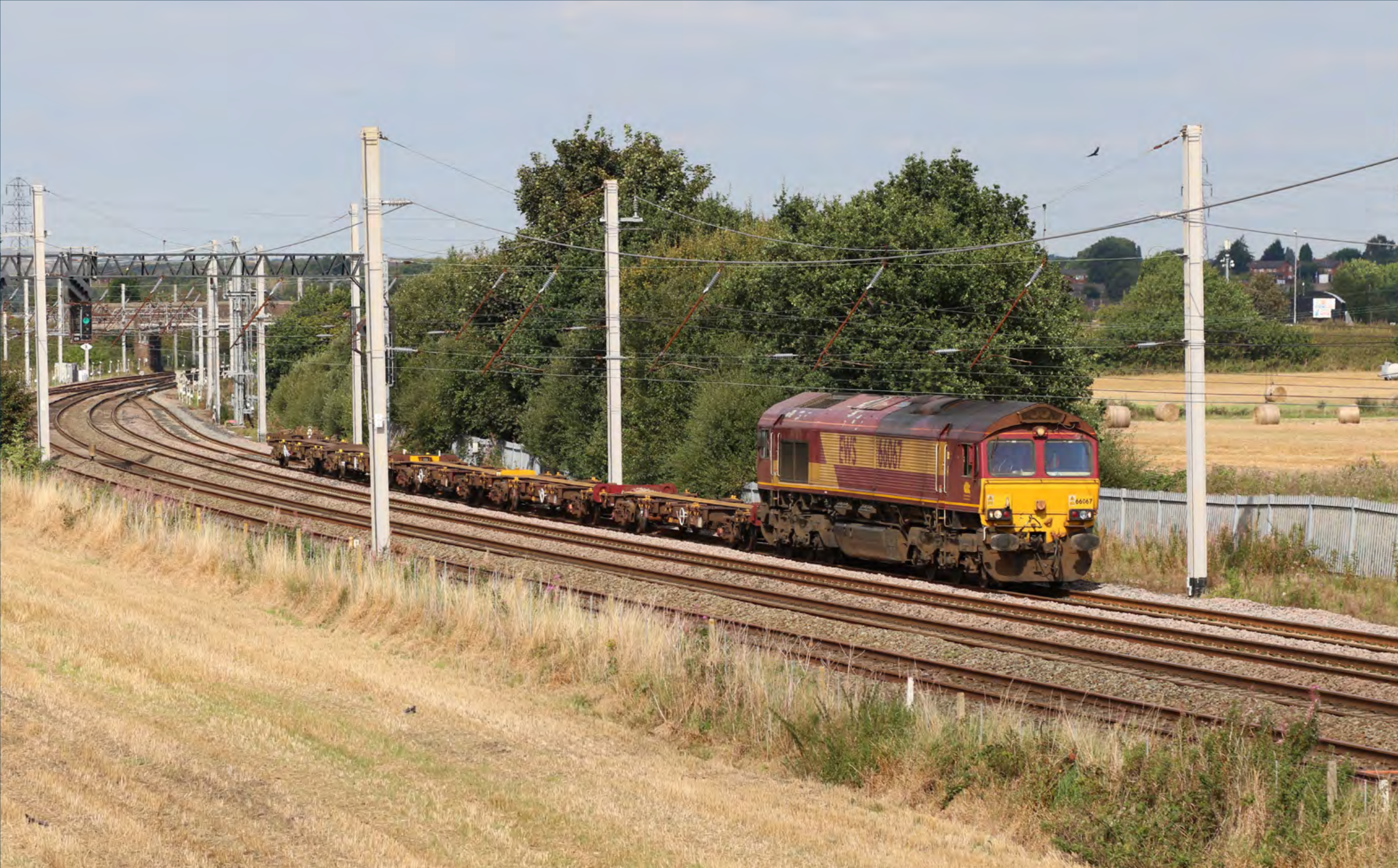
Class 66 067 passes Winwick on September 7th working the 4F47 Wigan WRD - Arpley Yard. Alan Rigby