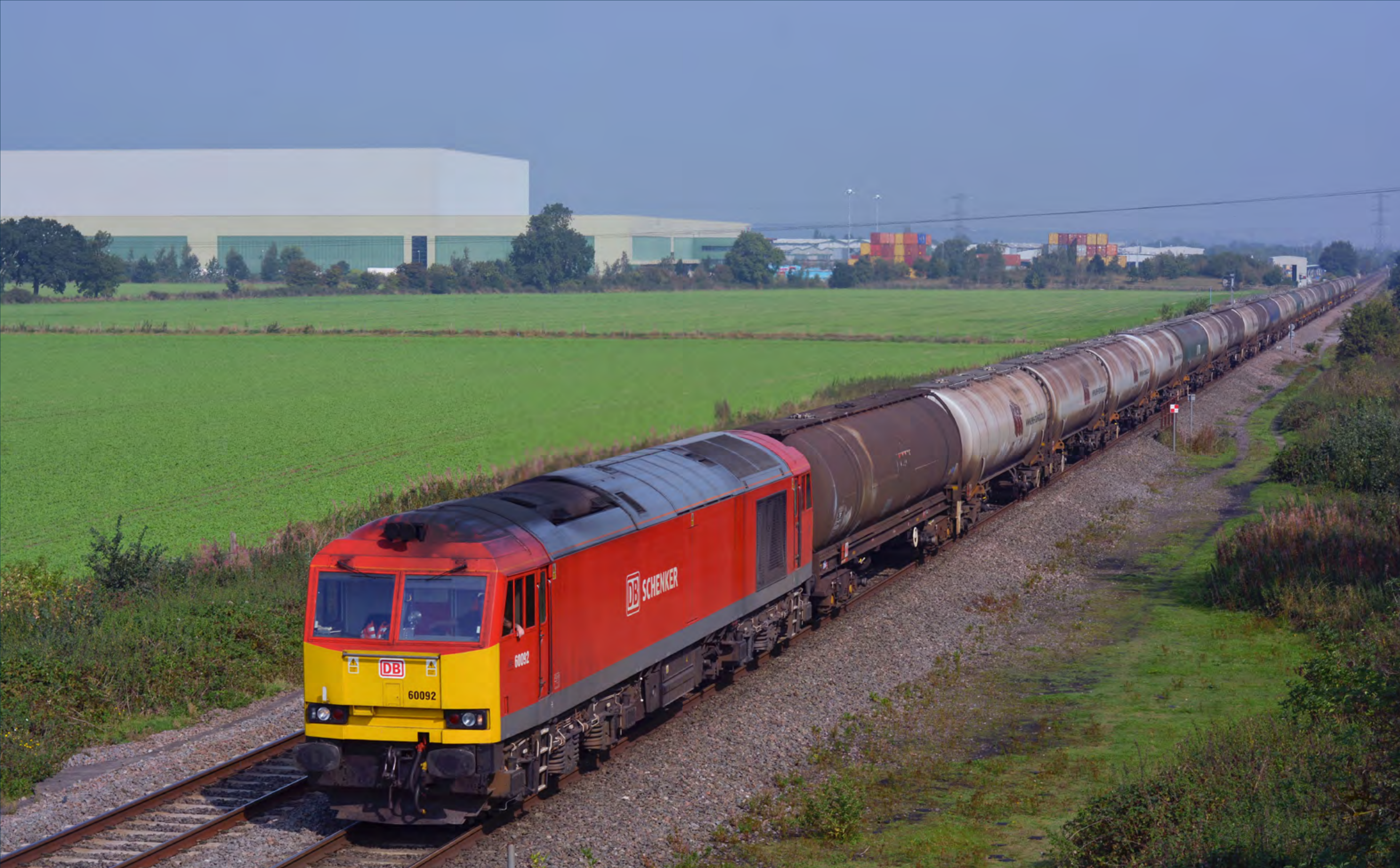
Class 60 092 passes Wichnor Jct. on September 14th working the 6M57 07:15 Lindsey oil refinery - Kingsbury. Keith Davies