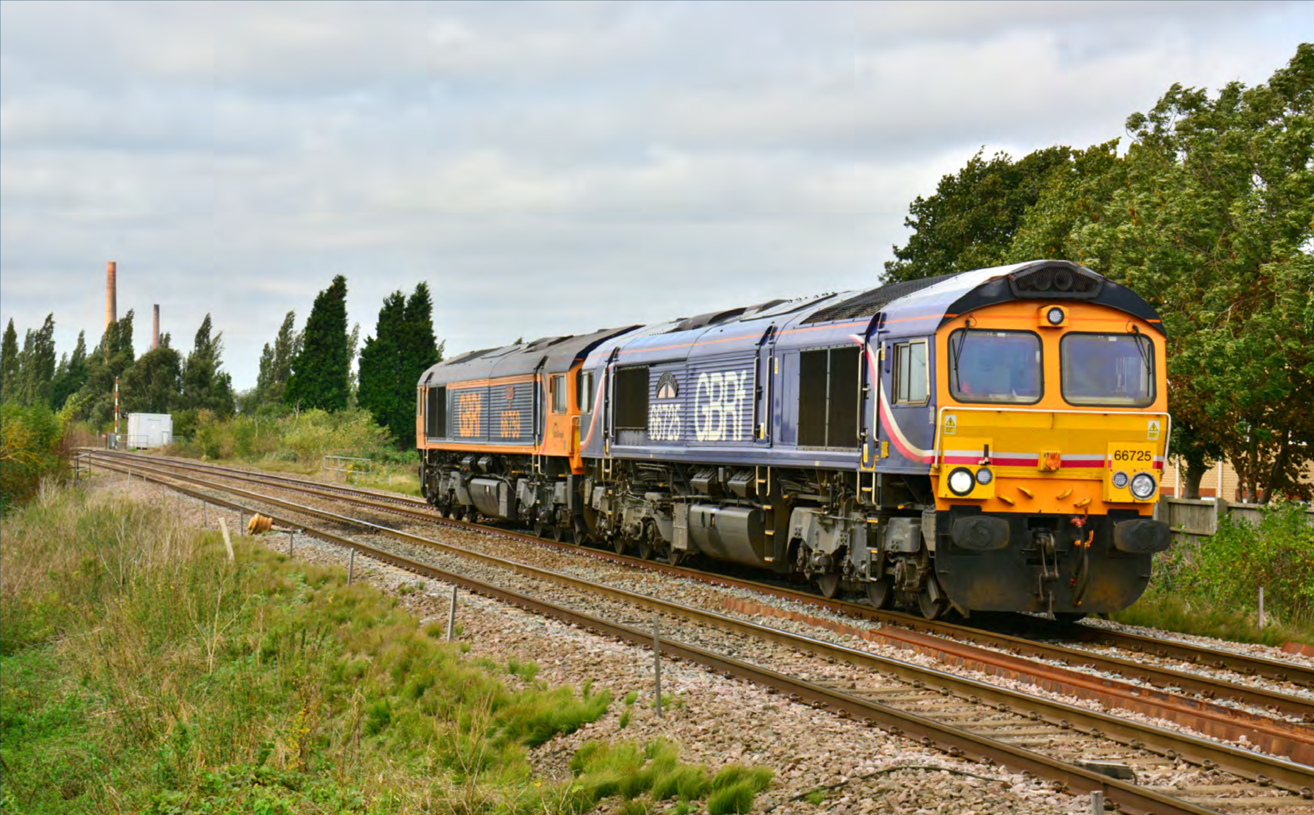
Class 66 725 pilots 66 759 through Whittlesey on September 28th working from Peterborough GBRf yard to Whitemoor yard. Geoff Barton