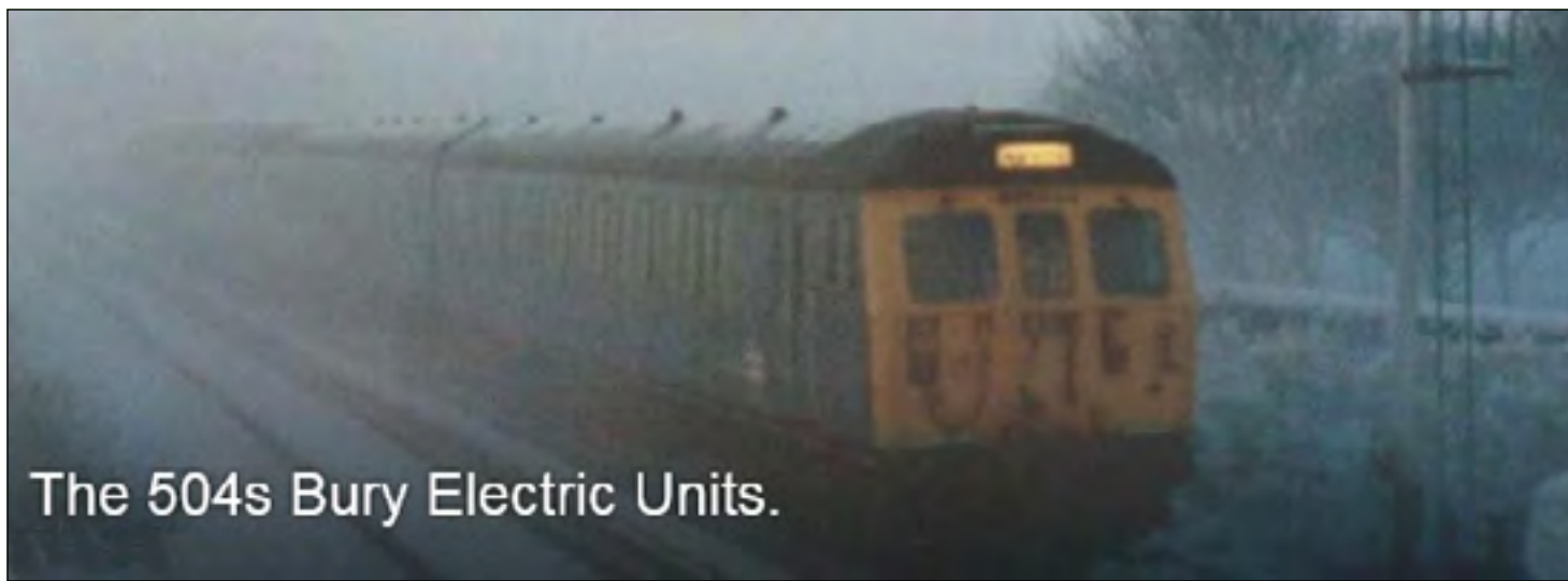
The 504s Bury Electric Units.

On Thursday 15th September 2016 members of the Class 504 Preservation Society Committee met the General Manager from the East Lancs Railway to inspect the work the Society has carried out on the Class 504 Bury Unit since last November. Satisfied with condition the unit is now in and with the efforts of the Society, the Class 504 Preservation Society has now been offered a restoration agreement from the ELR in which the Society has to formulate a restoration plan for both power car and trailer car, the Society also has a LMS 50ft Gangwayed Brake van which will also need to be considered within the restoration plan.