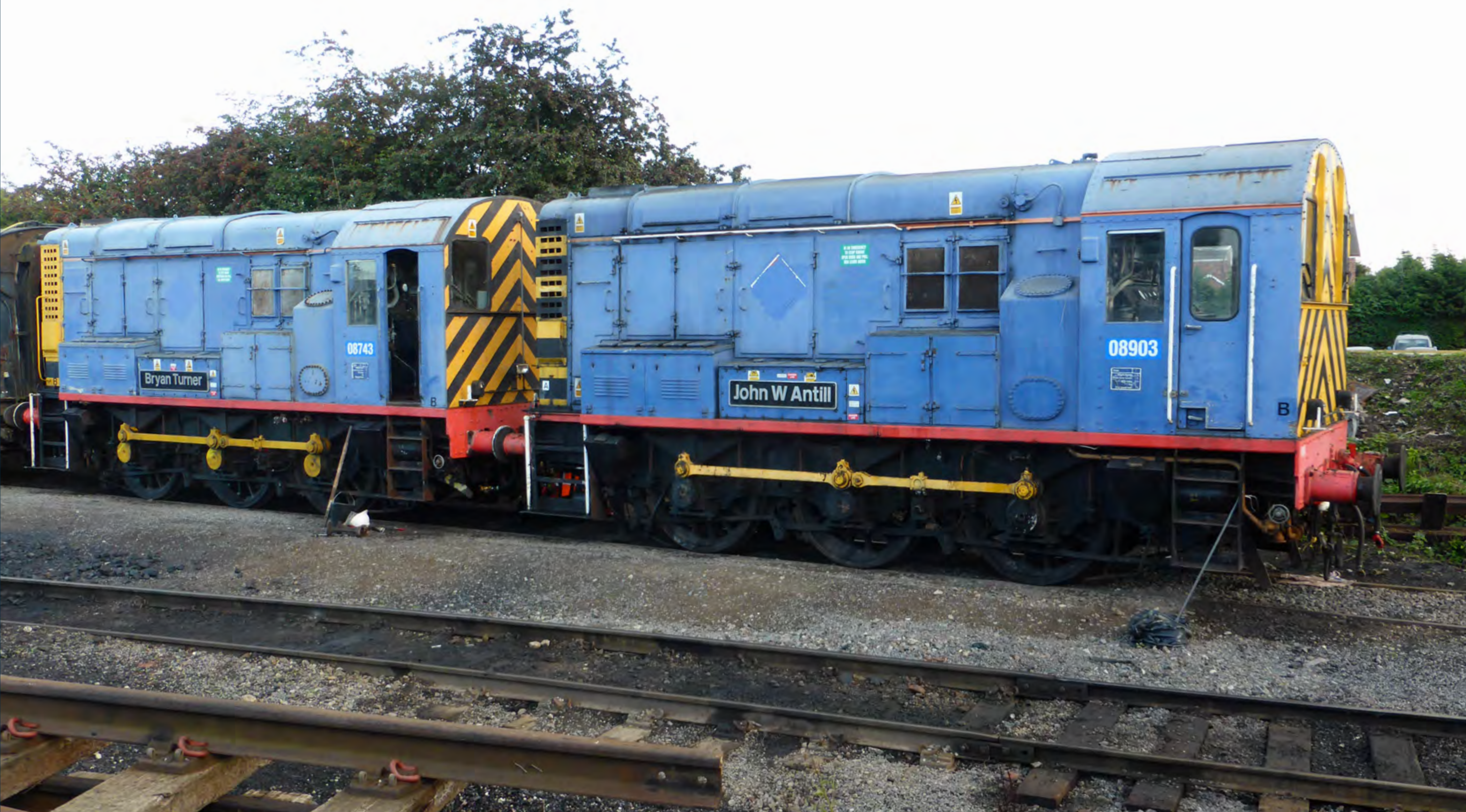
Class 08 743 and 08 903 are seen at Leeming Bar on September 25th. Andrew Wilson