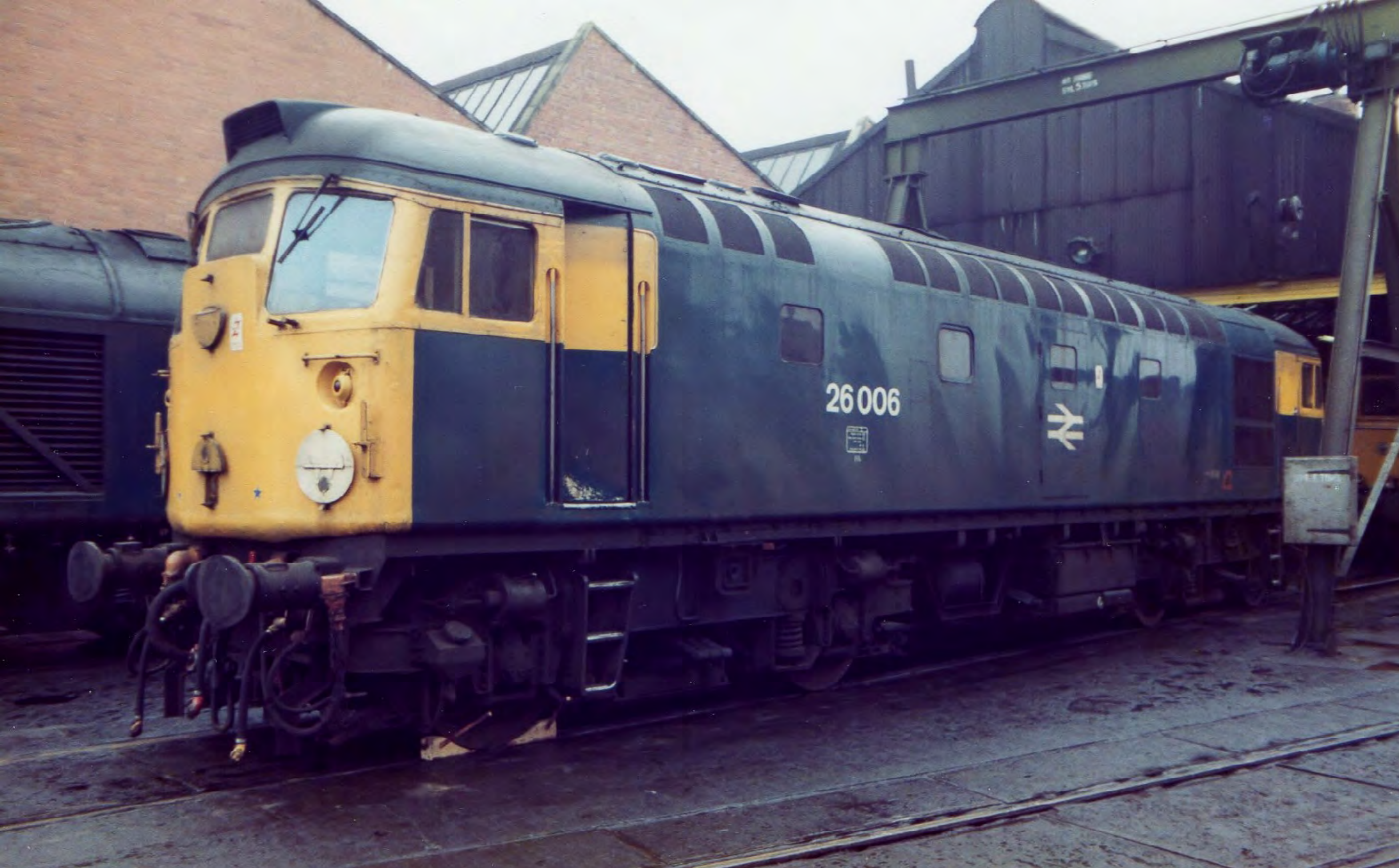
▶ Class 26 006 is pictured stabled at Haymarket depot on April 11th 1981. Brian Hewertson