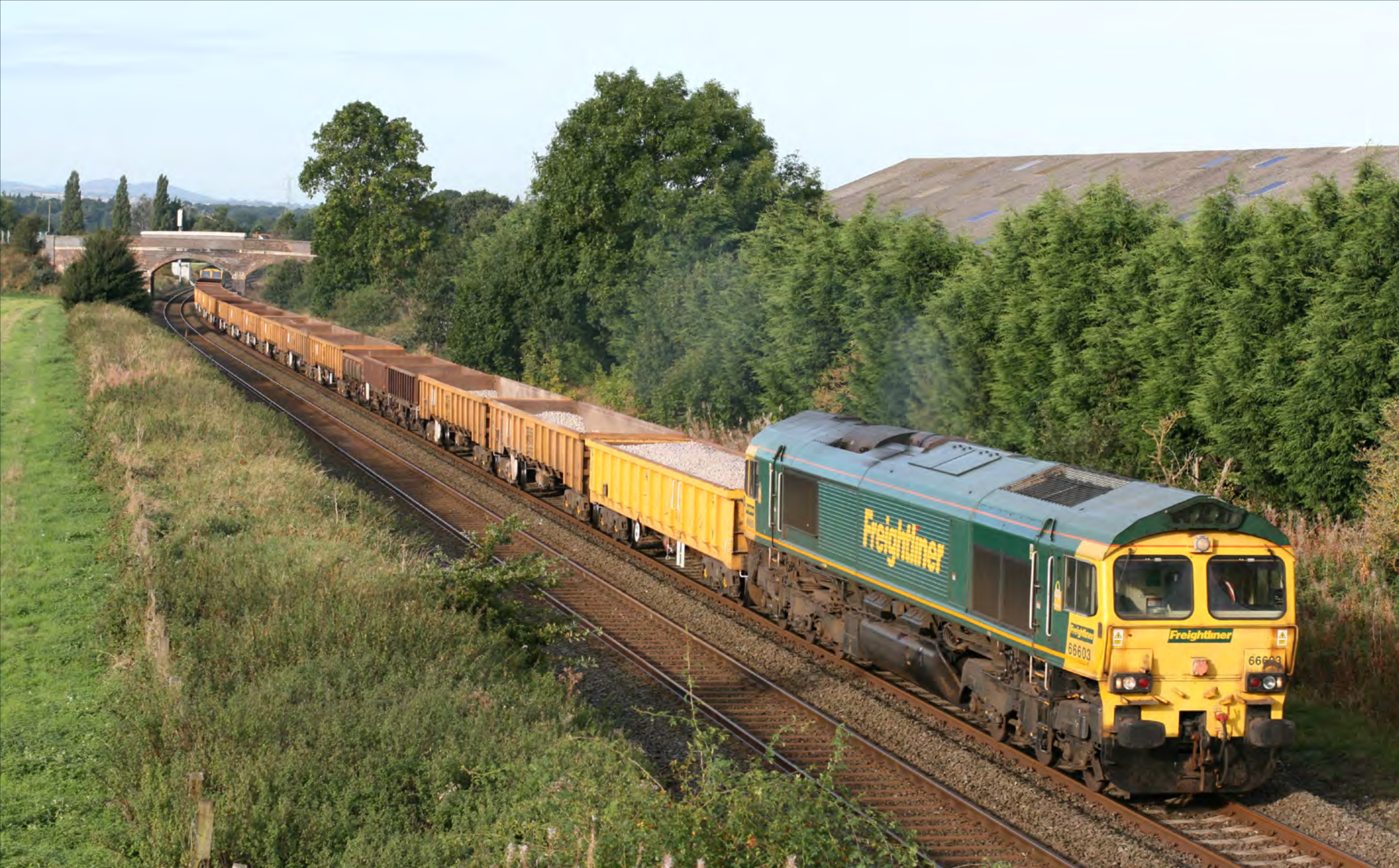
Class 66 603 and 66 544 head past Walcot on September 23rd working the 06:00 Severn Tunnel Jct. - Bescot ballast. Phil Martin