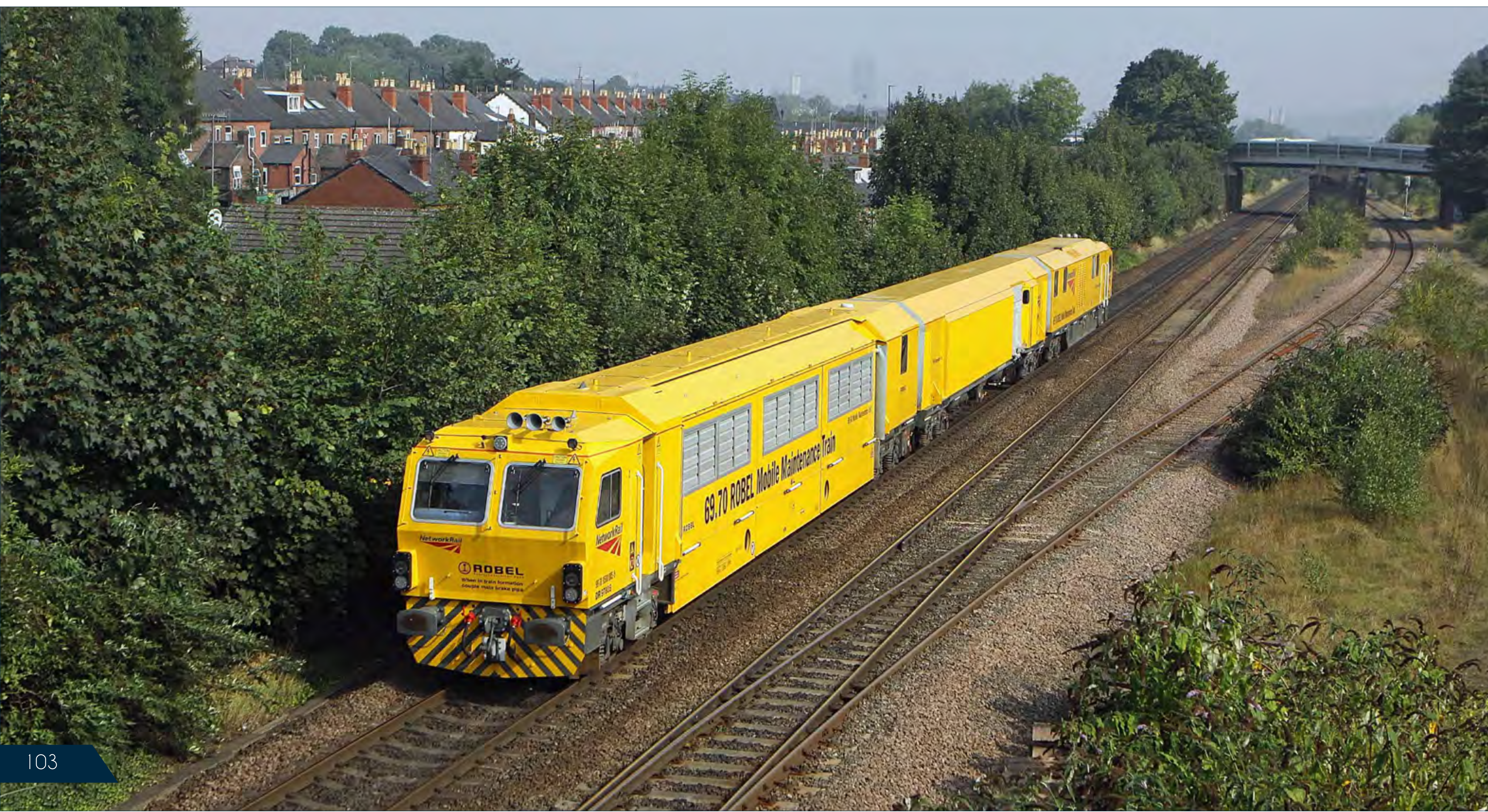
Network Rail's DR97805 Robel Type 69-70 Mobile Maintenance Train passes Woodhouses working a 09:50 Retford - Woodburn Jct. trip on September 15th. Nick Clemson